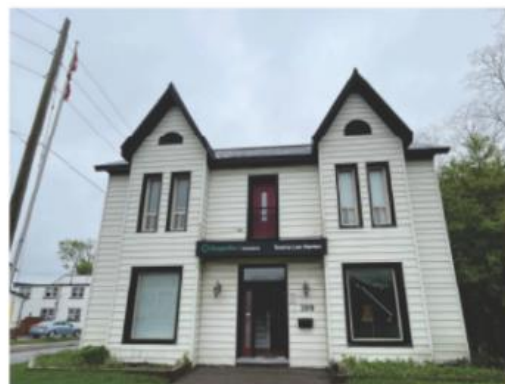
399 SIMCOE ST. SOUTH