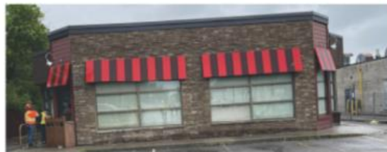
415 SIMCOE ST. SOUTH