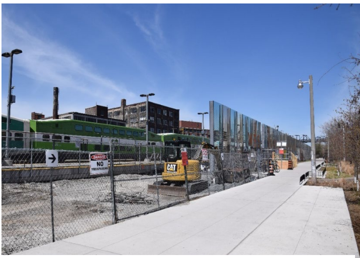
Figure 4: Noise wall installation site