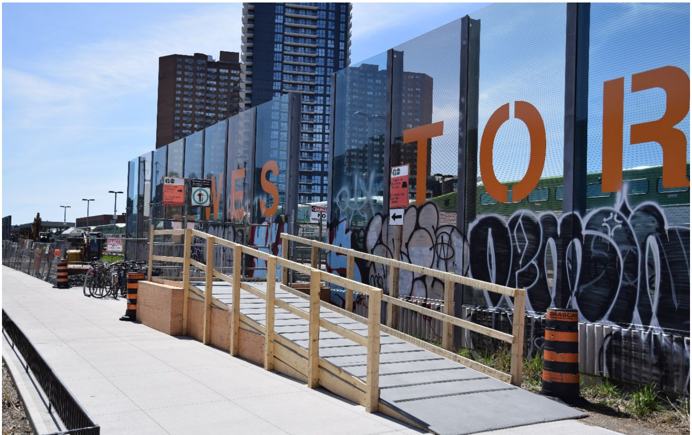
Figure 1: New temporary ramp located at Ernest Avenue Park

Relocated Pedestrian Access Ramp: Temporary ramp relocated to Ernest Avenue Park to complete adjacent track and noise wall installation work.