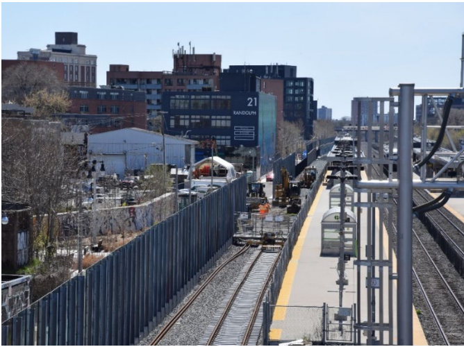
Figure 2: New track between Wallace and Ernest Avenues