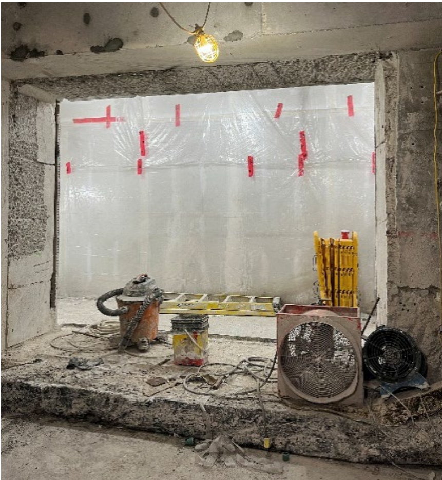
Figure 1: Eastbound Platform Opening

Eastbound Station Wall Removal: Coring, wire cutting and concrete removals of the station wall on the TTC platform level.