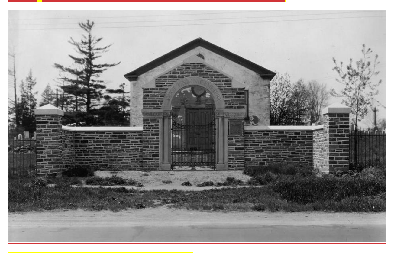
Plate 2: Dixie Union Chapel and Cemetery dated 1930s