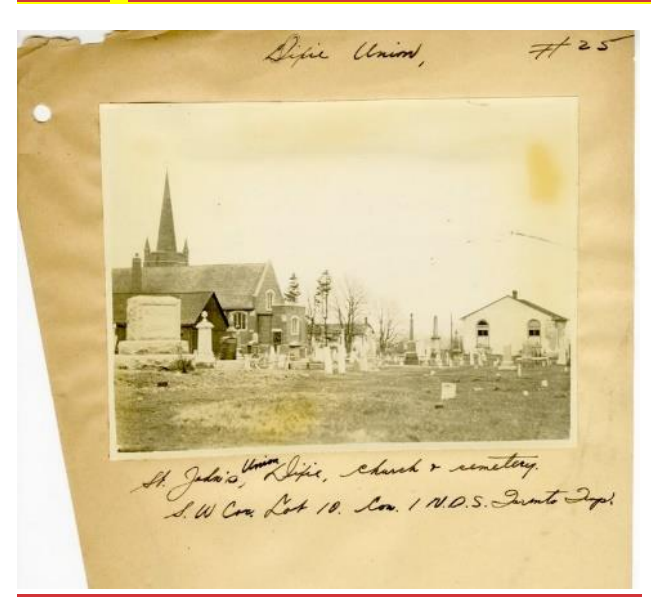
Plate 3: Dixie Union Chapel and Cemetery