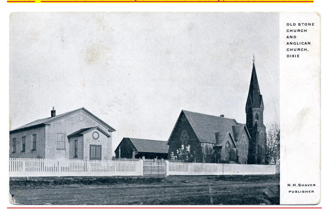
Plate 1: Dixie Union Chapel and Cemetery, 1930s and earlier