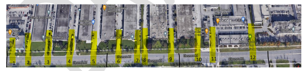
Exhibit 2: Driveway locations on Ellesmere Road between Bellamy Road and Markham Road

More than 80% of the trucks observed used the signalized intersection at Dolly Varden Boulevard (location 11 in the graphic below).