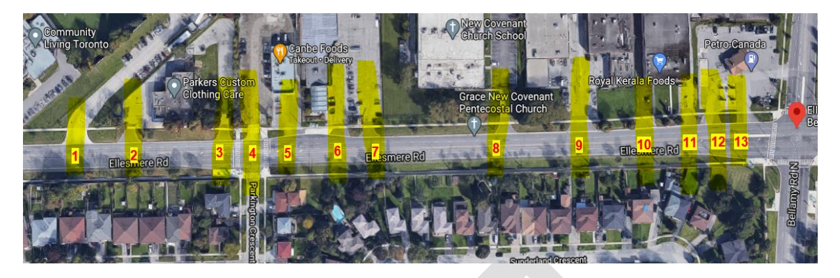
Exhibit 1: Driveway locations on Ellesmere Road between Grangeway Avenue and Bellamy Road