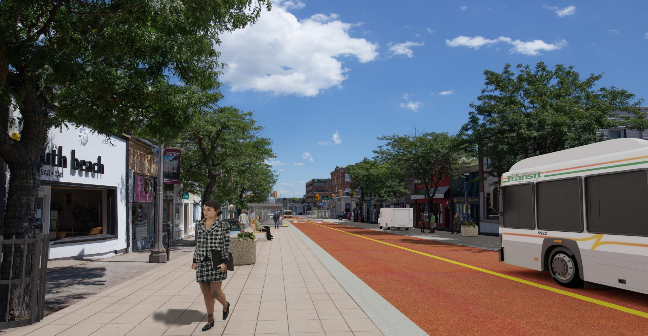
Dundas Street east of Byron Street, looking east