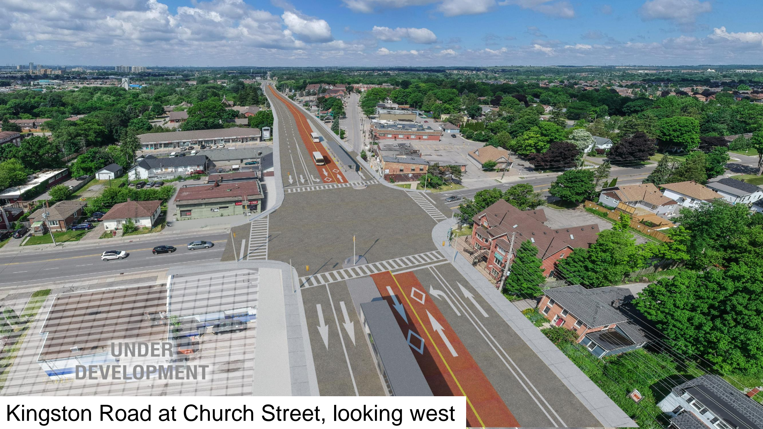
Kingston Road at Church Street, looking west