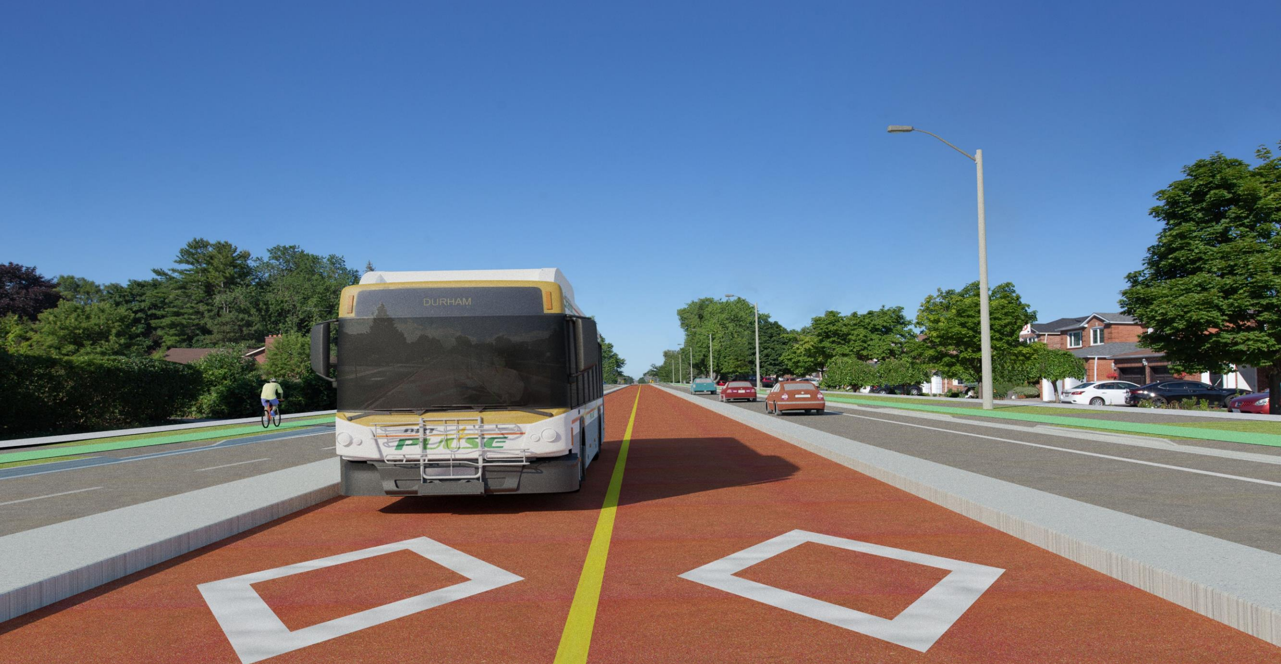
Ellesmere Road west of Muirbank Boulevard, looking west