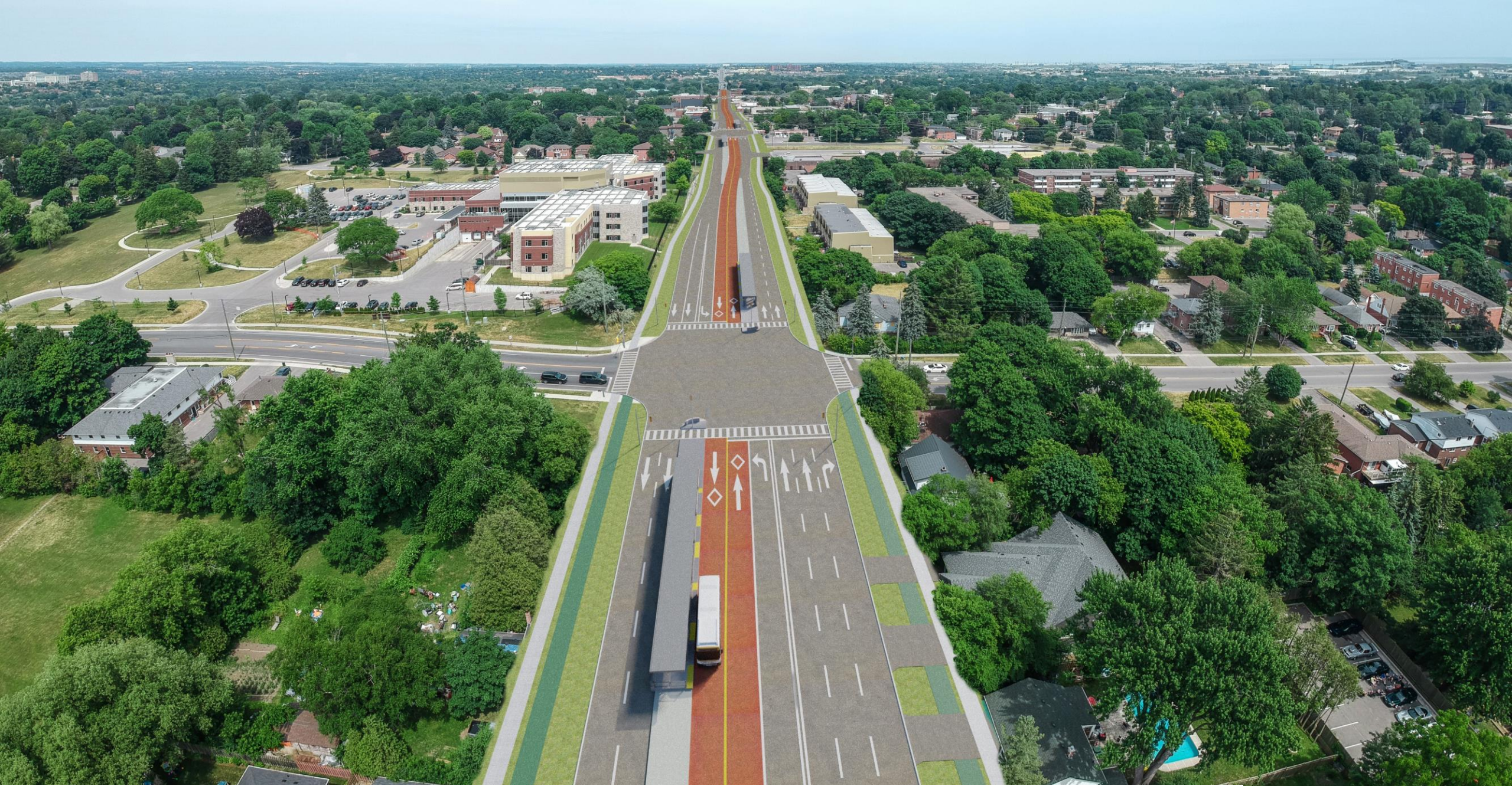
Dundas Street at Annes Street / Cochrane Street, looking east