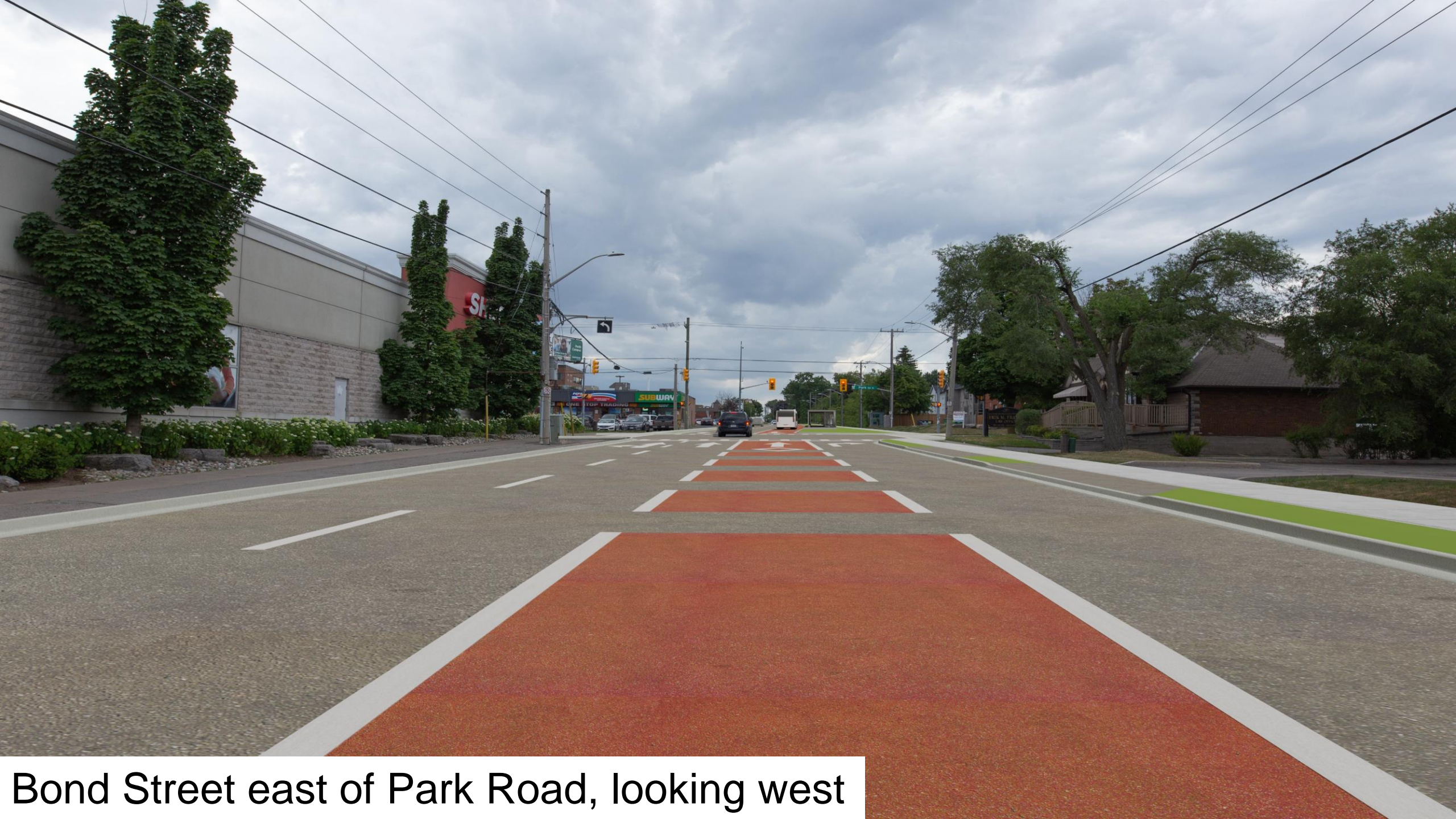
Bond Street east of Park Road, looking west