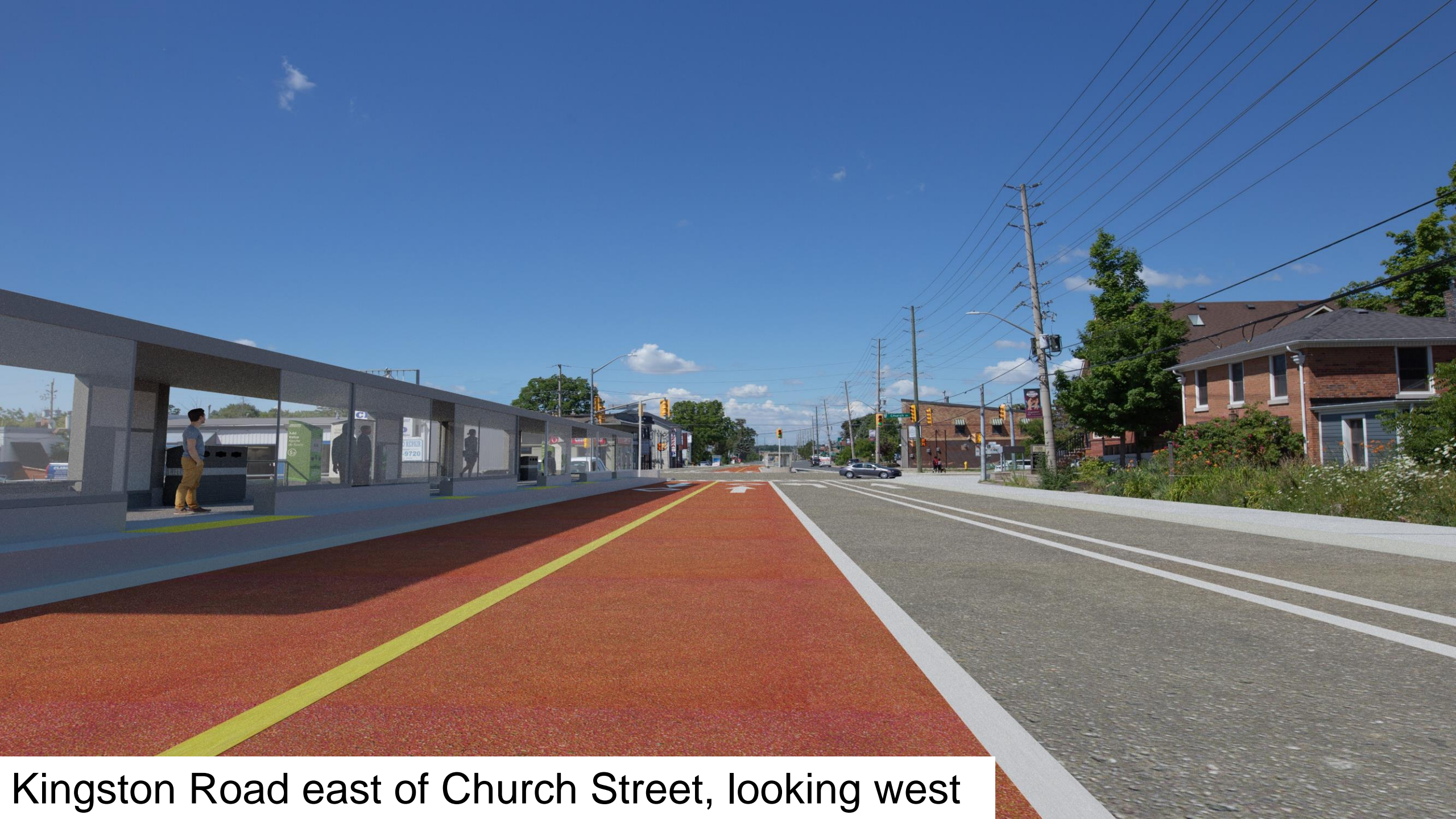
Kingston Road east of Church Street, looking west