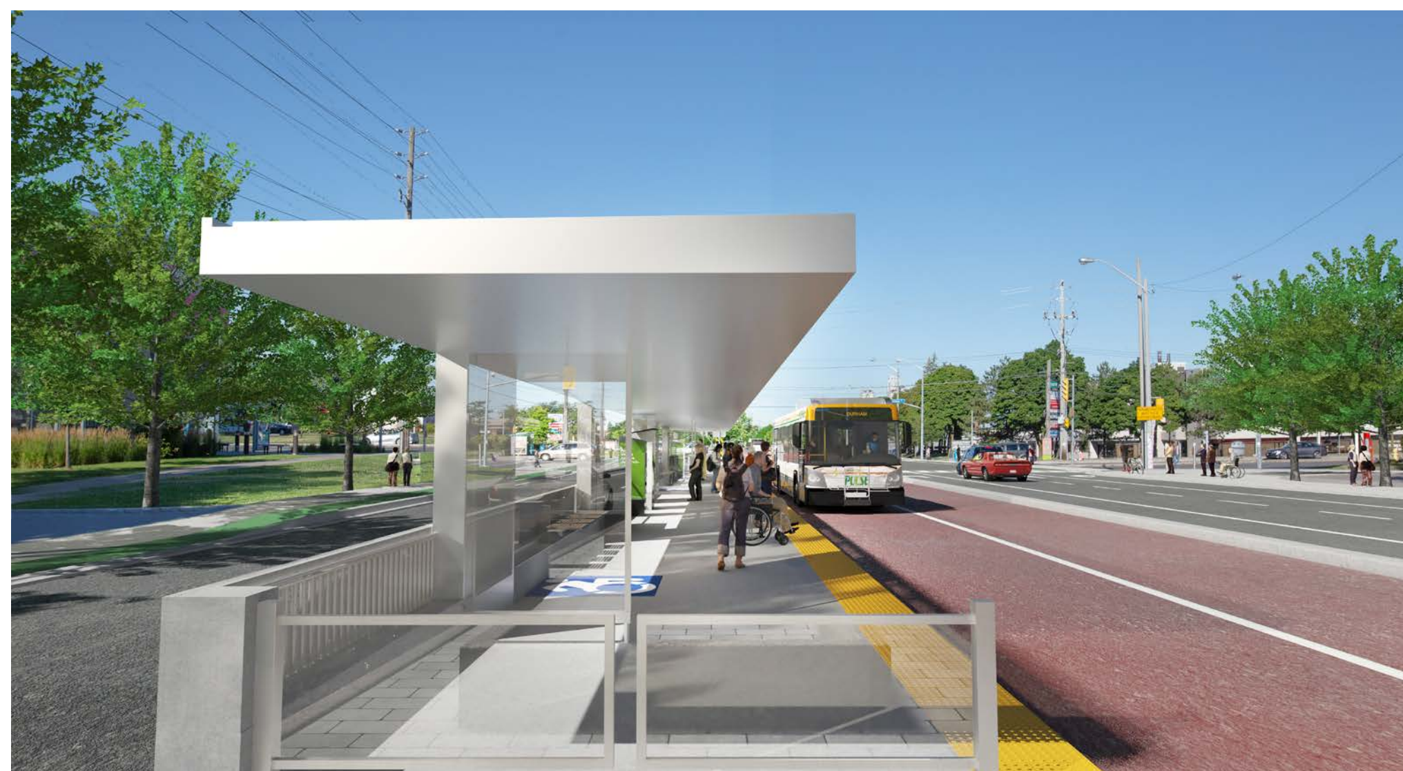
Rendering of Markham Road stop in Toronto

Certain parts of a shelter can be customized, including: