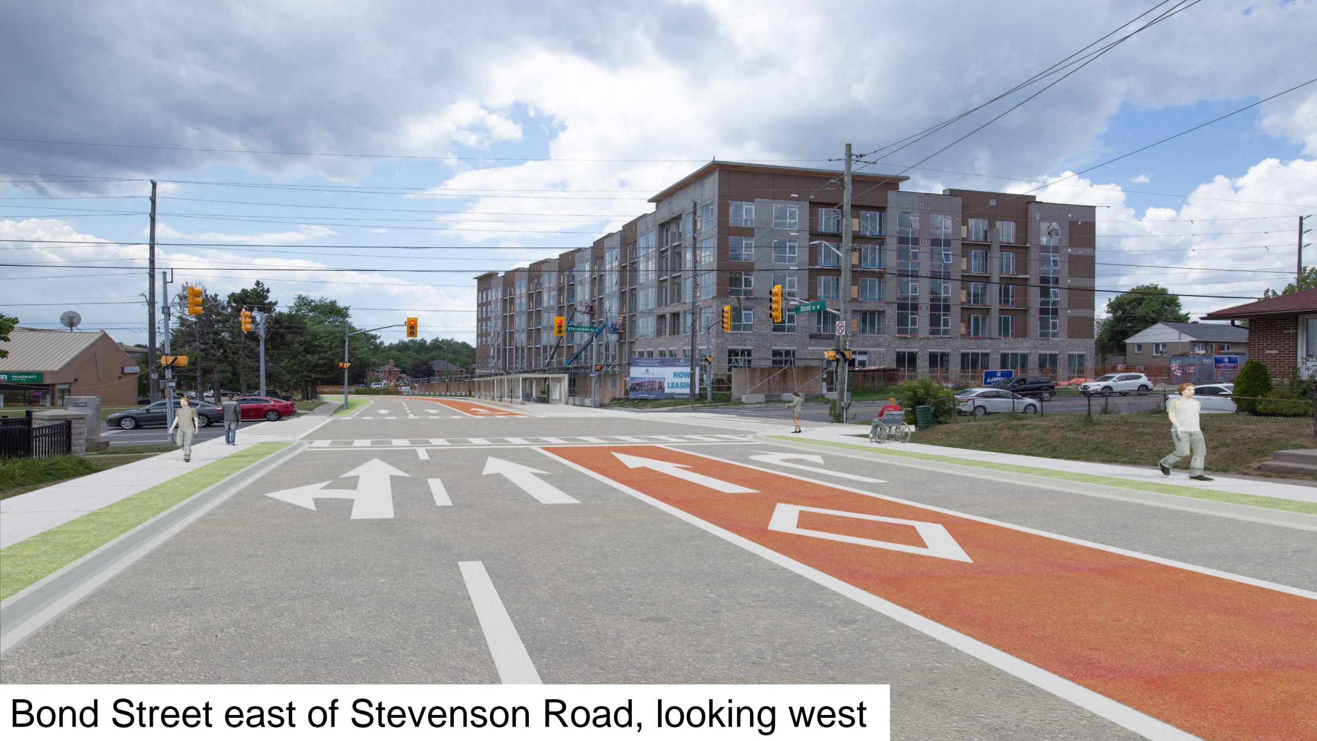
Bond Street east of Stevenson Road, looking west