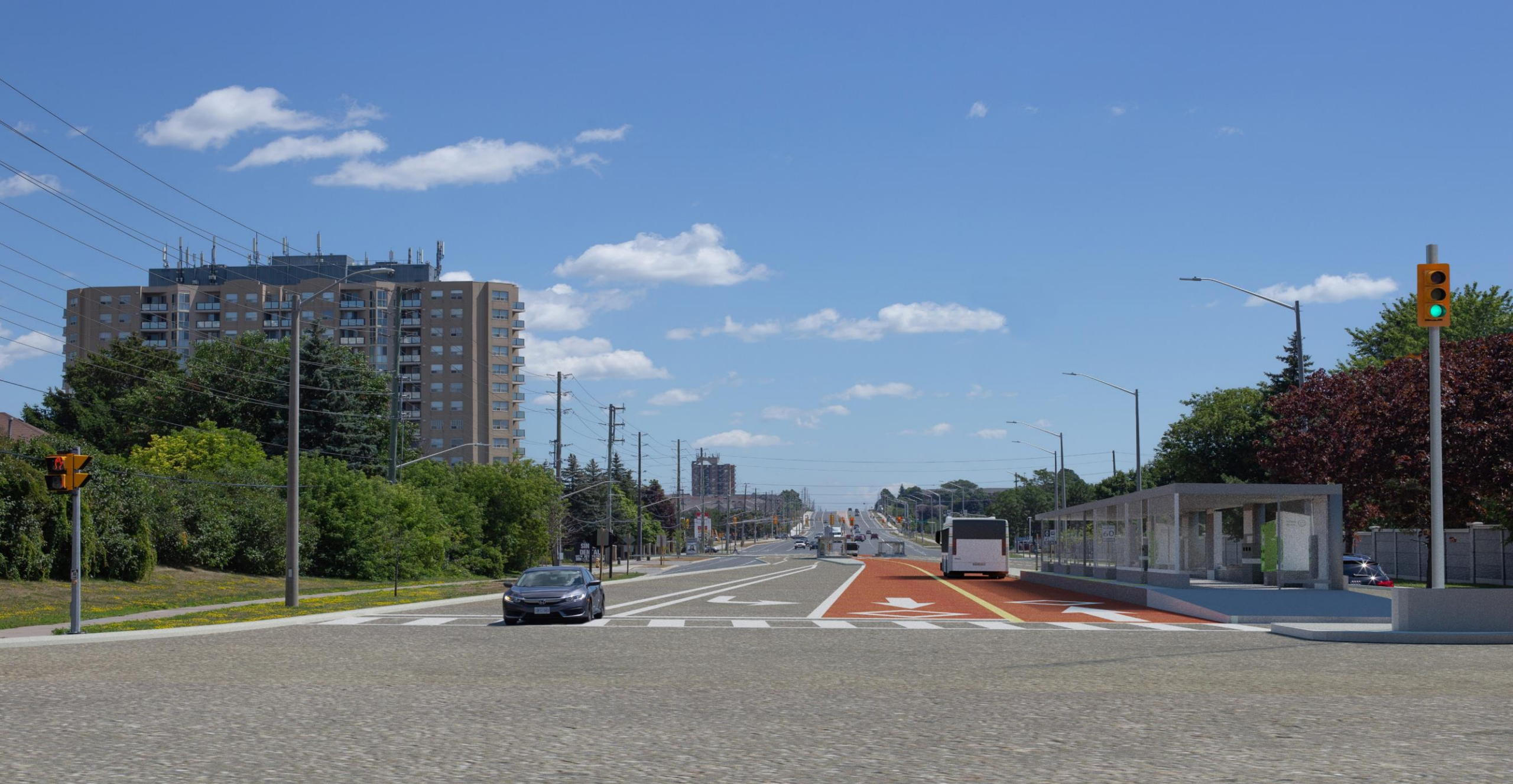
Kingston Road at Rotherglen Road, looking east