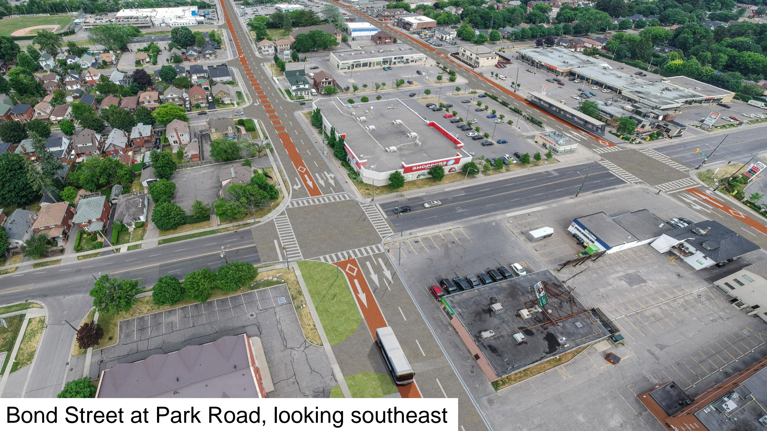
Bond Street at Park Road, looking southeast