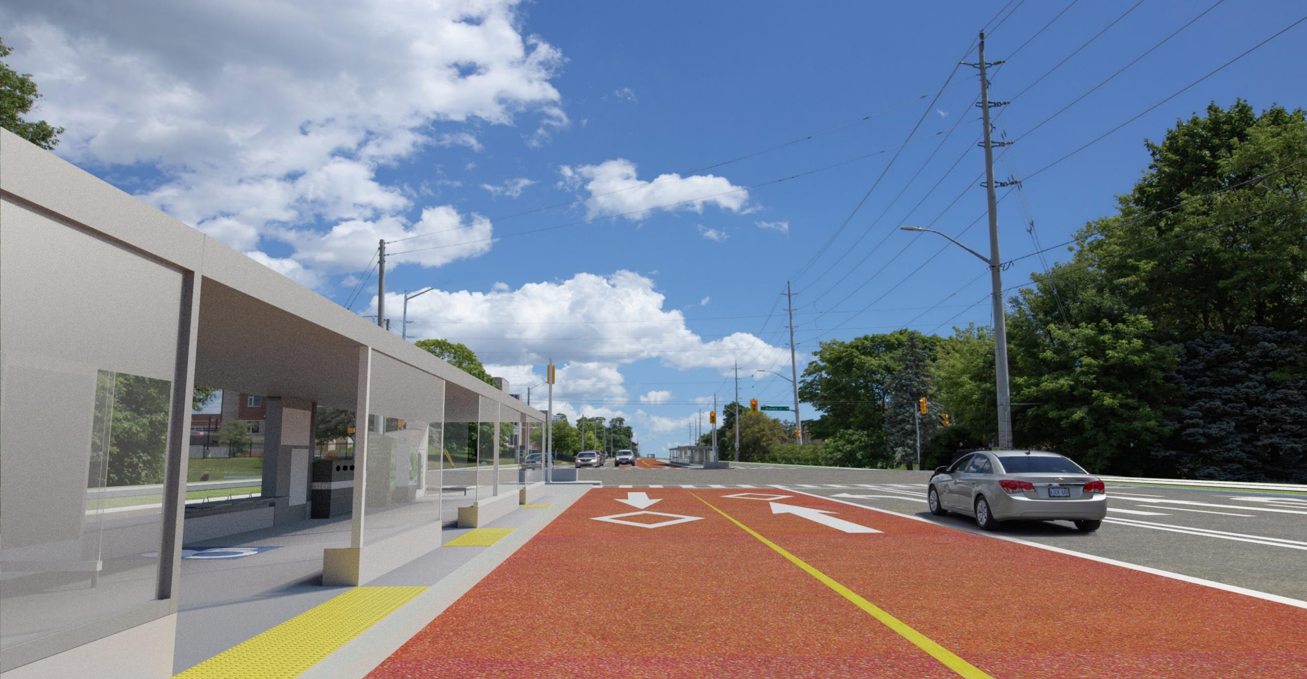
Dundas Street west of Annes Street / Cochrane Street, looking east