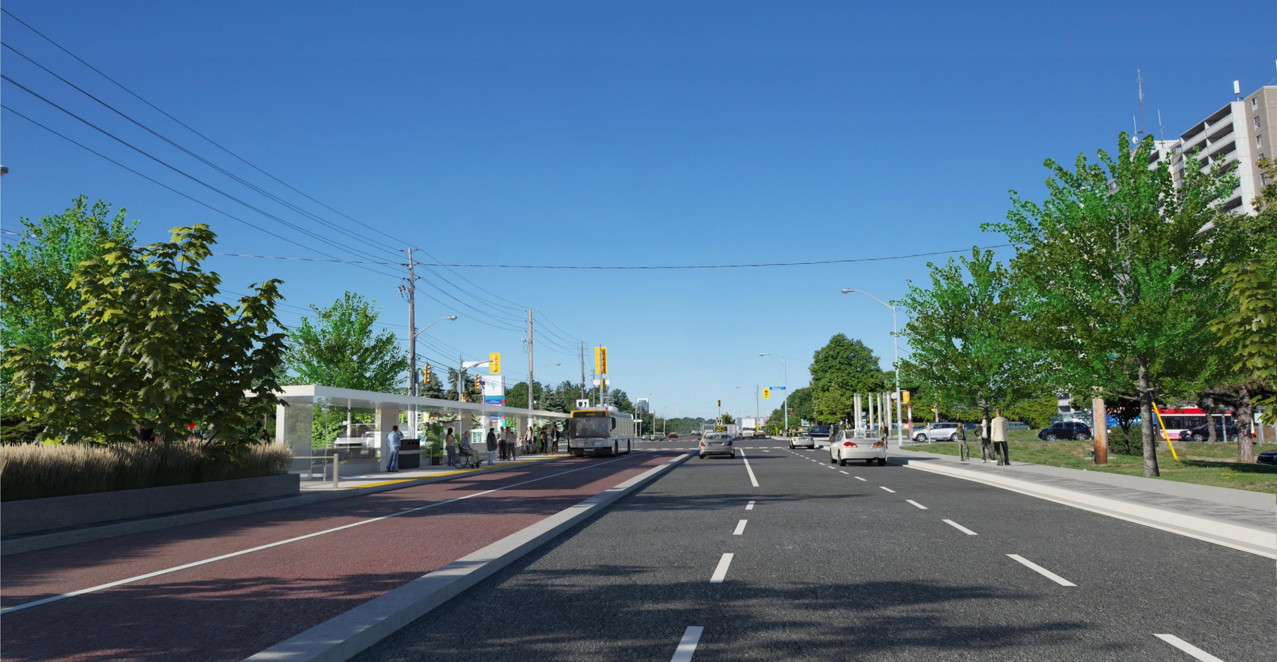
Ellesmere Road east of Neilson Road, looking west