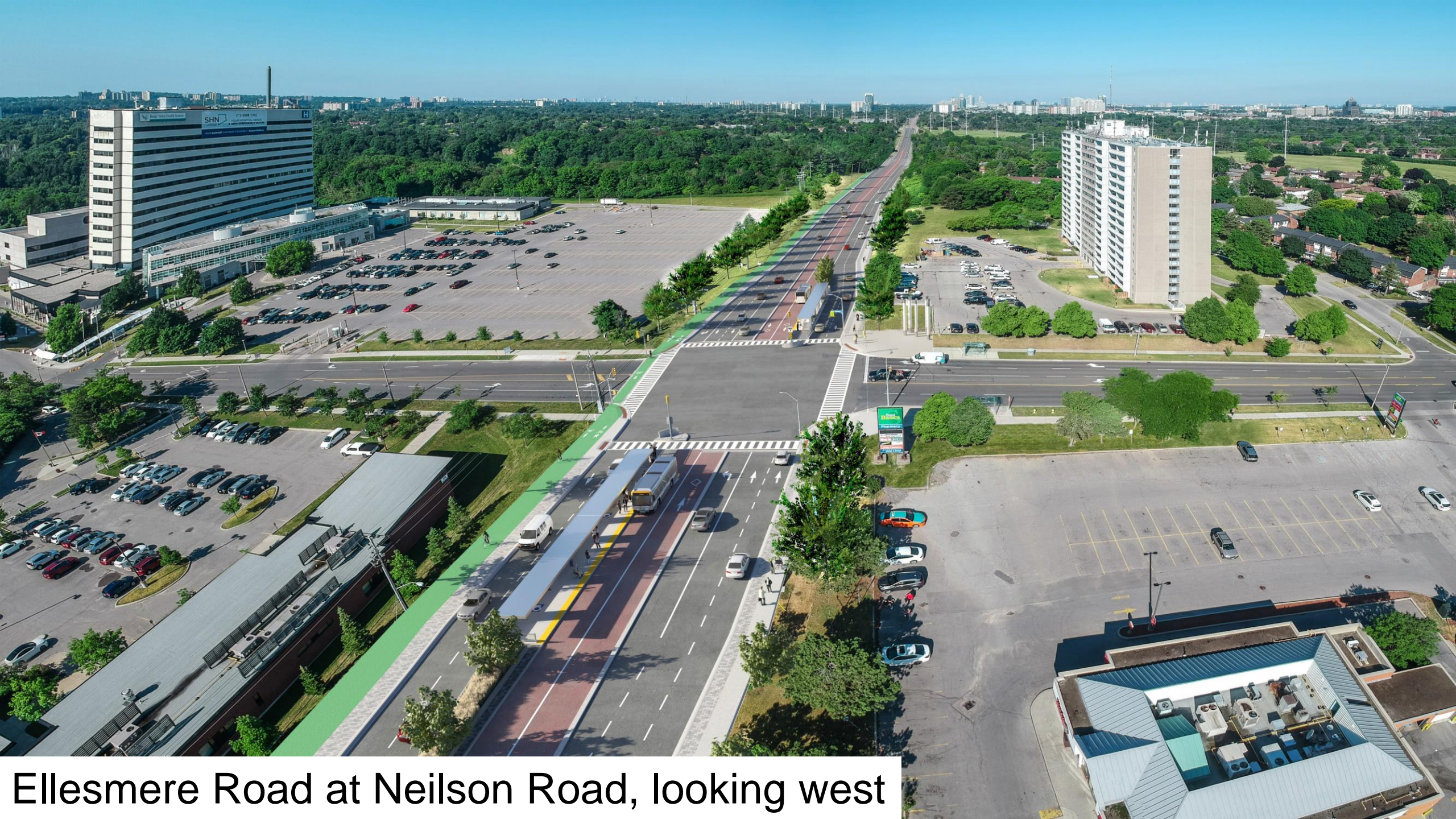
Ellesmere Road at Neilson Road, looking west