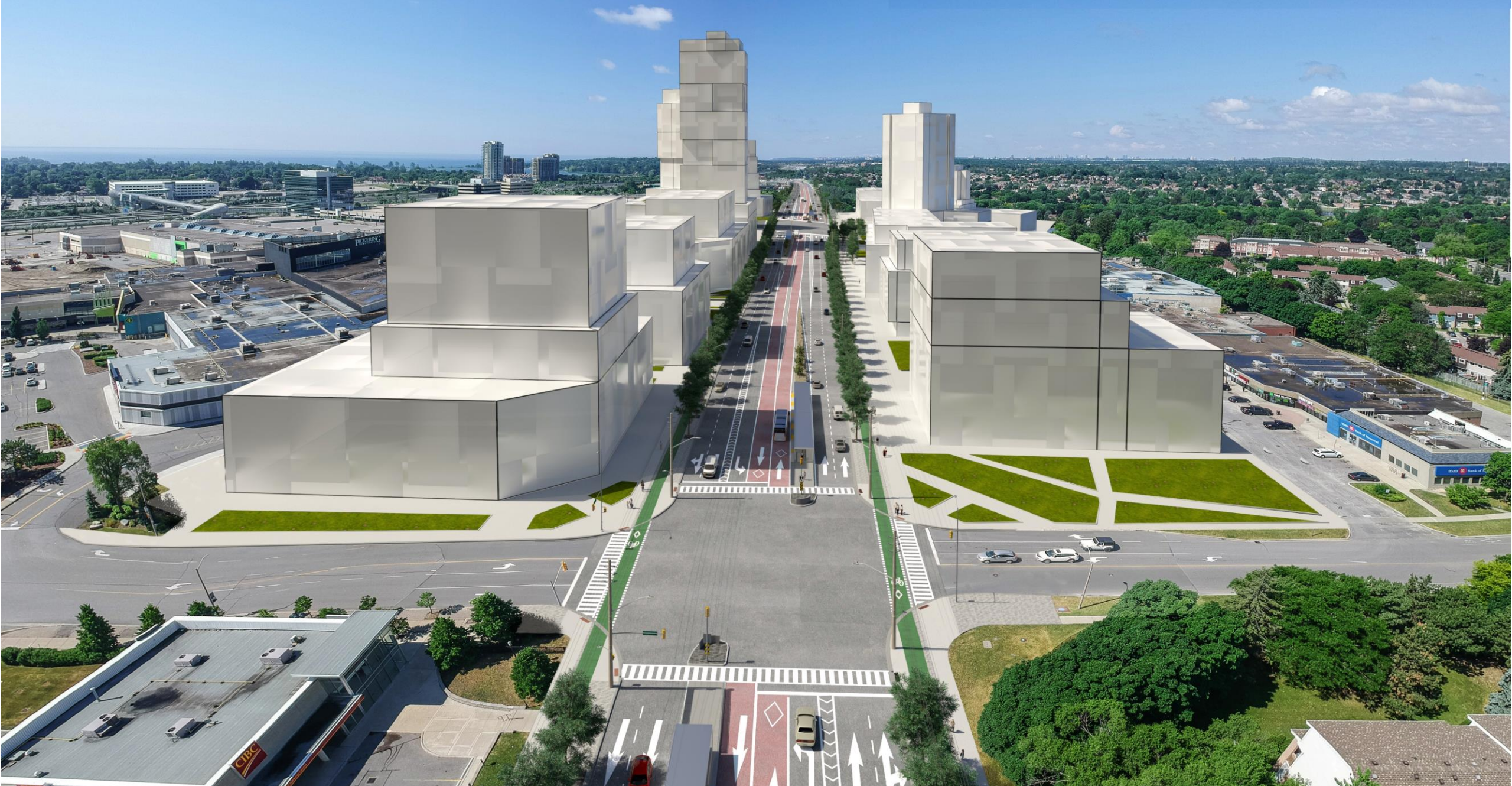
Kingston Road at Glenanna Road, looking southwest