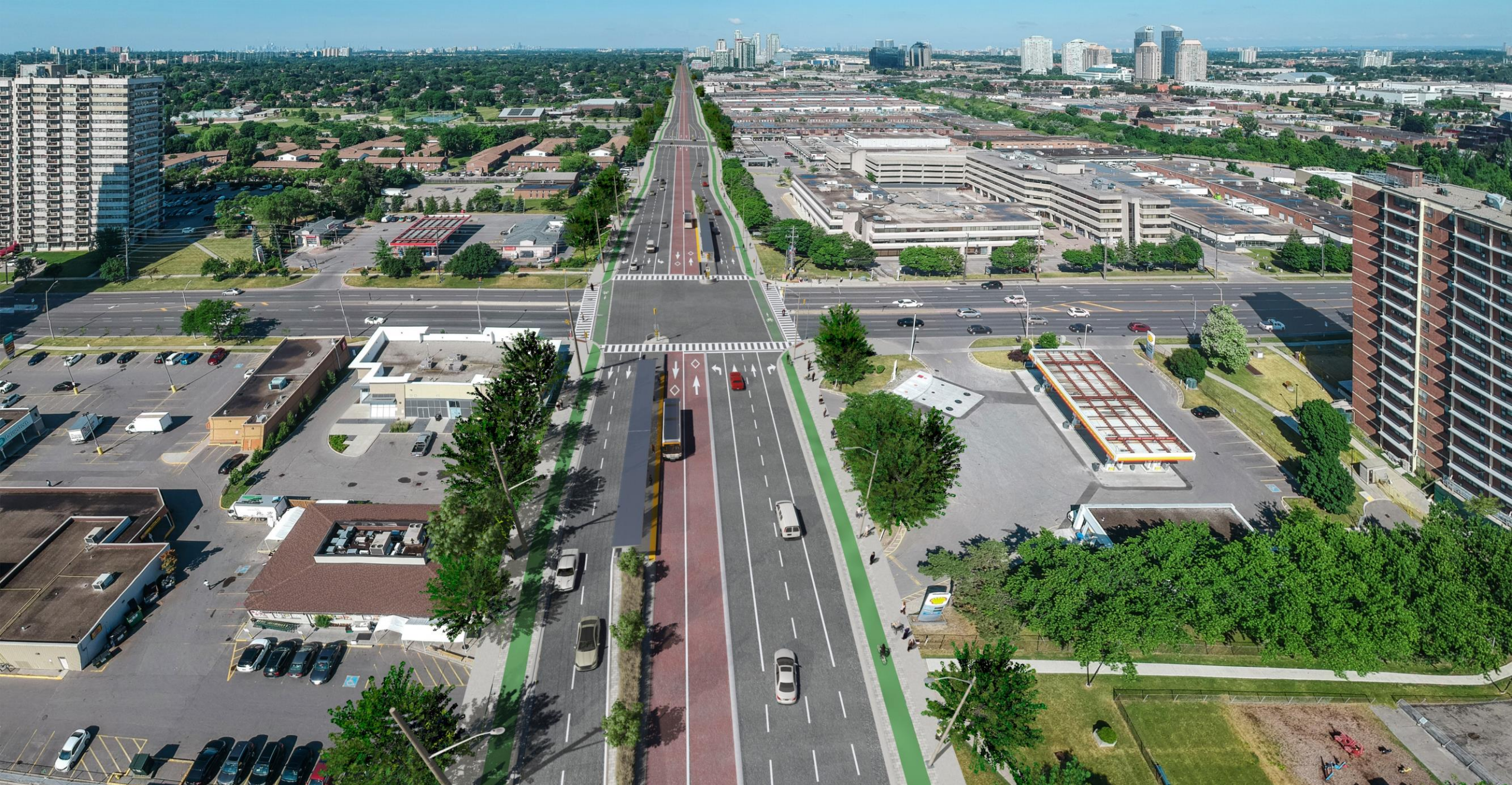
Ellesmere Road at Markham Road, looking west