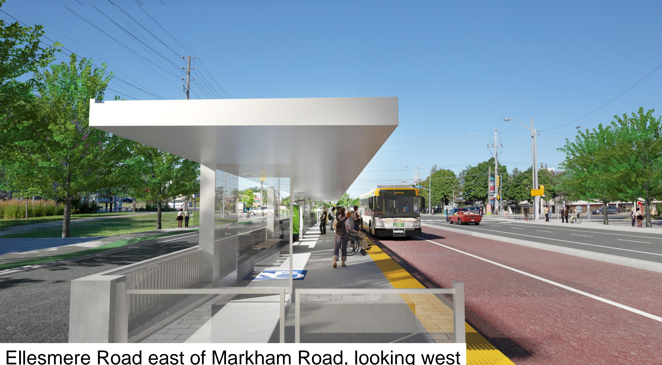
Ellesmere Road east of Markham Road, looking west