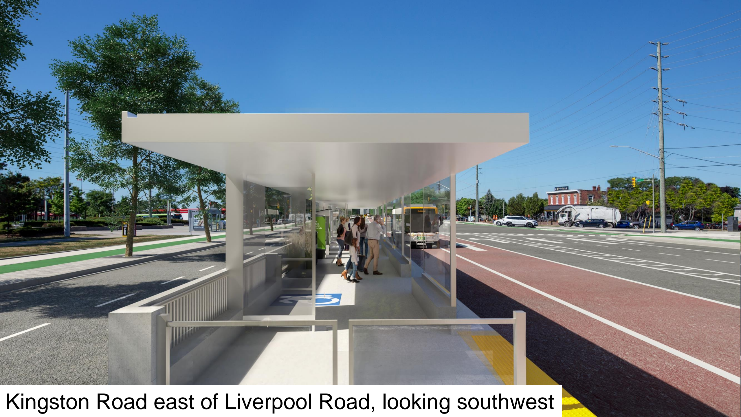
Kingston Road east of Liverpool Road, looking southwest