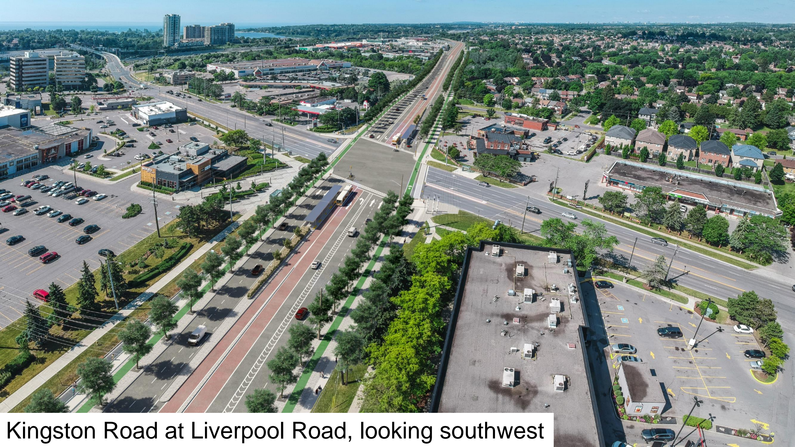
Kingston Road at Liverpool Road, looking southwest