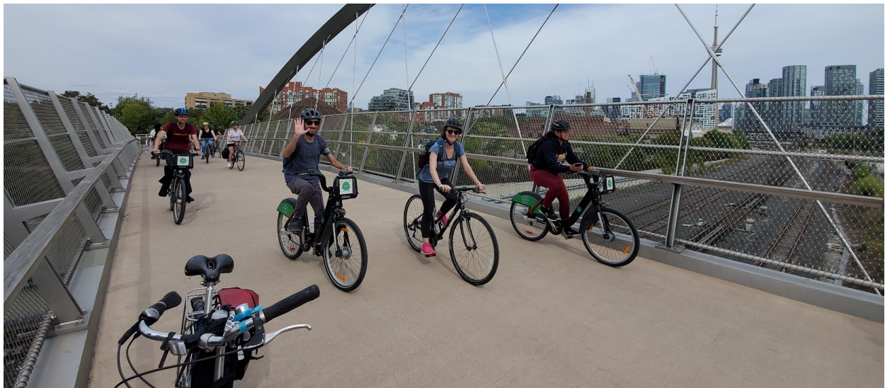
September 25 th 2nd annual bike tour crossing the new Garrison Common bridge over the GO Transit Lakeshore West line and near the future Ontario Line.