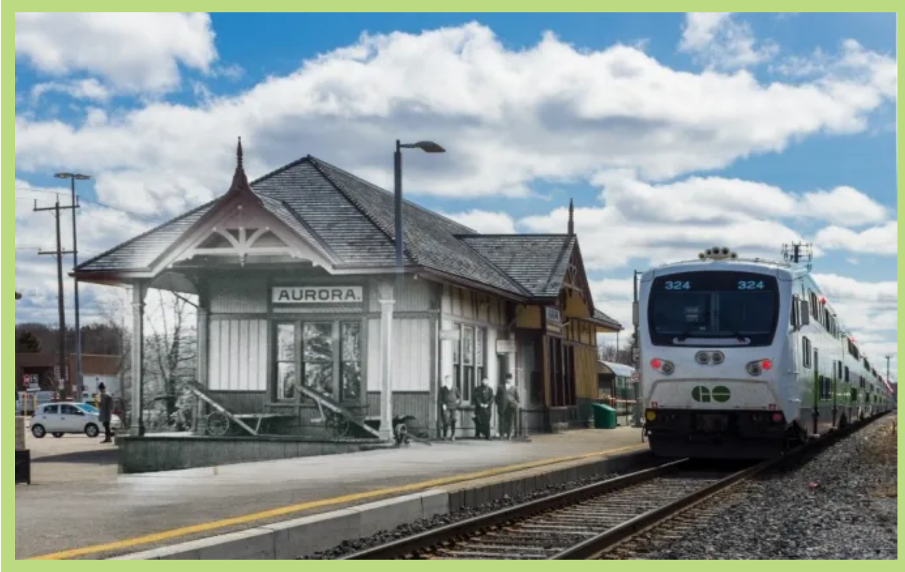
GO Transit has been part of the Aurora community since 1982, when the first GO Train rolled into this heritage station.