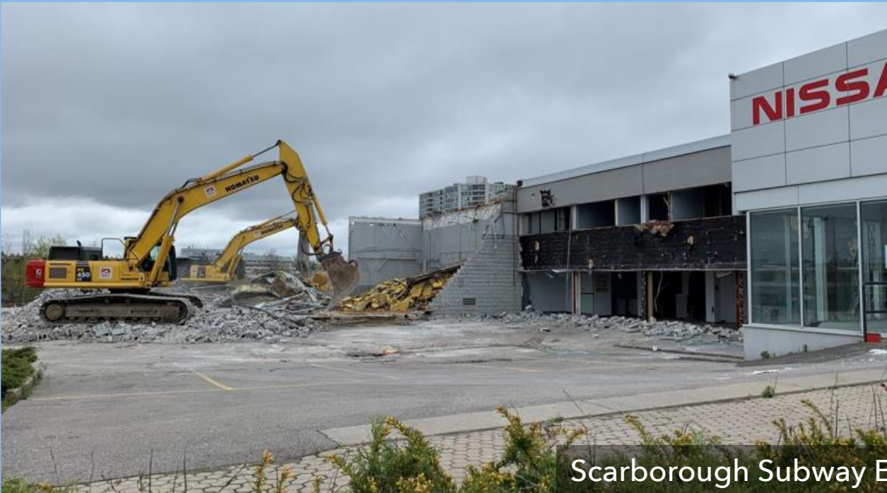
Scarborough Subway Extension – Tunnel Launch Site