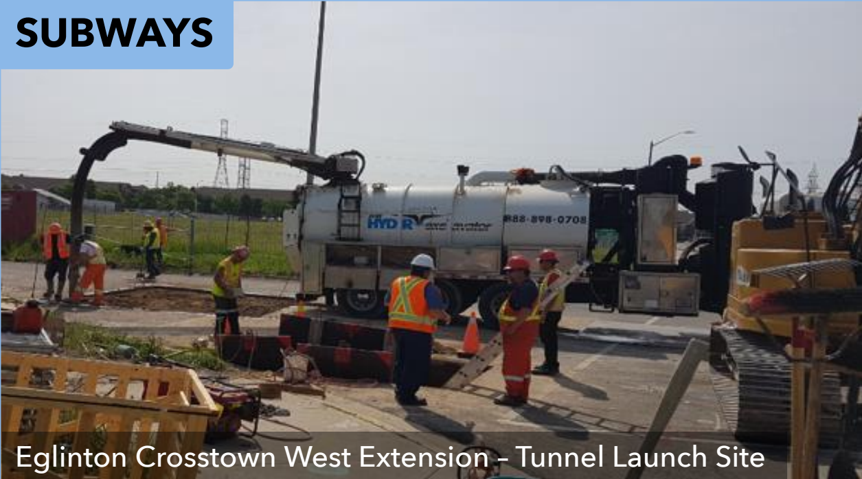
Eglinton Crosstown West Extension – Tunnel Launch Site