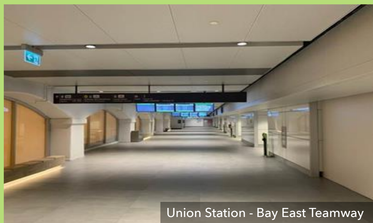
Union Station - Bay East Teamway