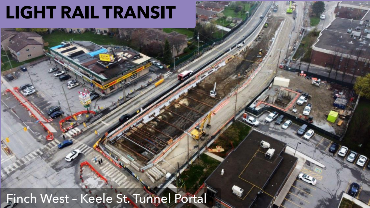
Finch West - Keele St. Tunnel Portal