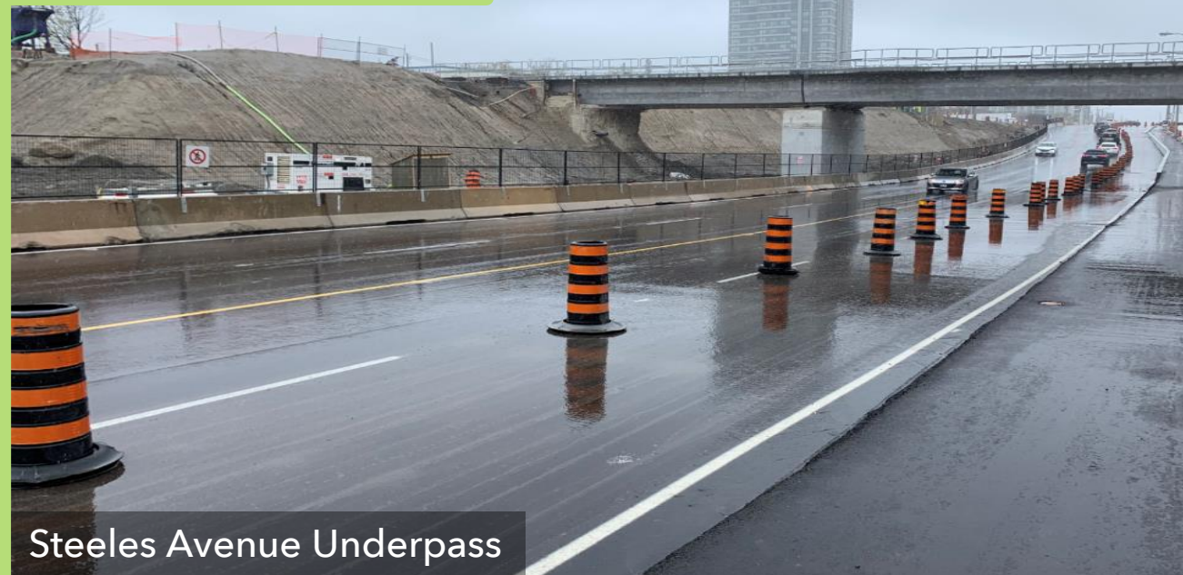
Steeles Avenue Underpass