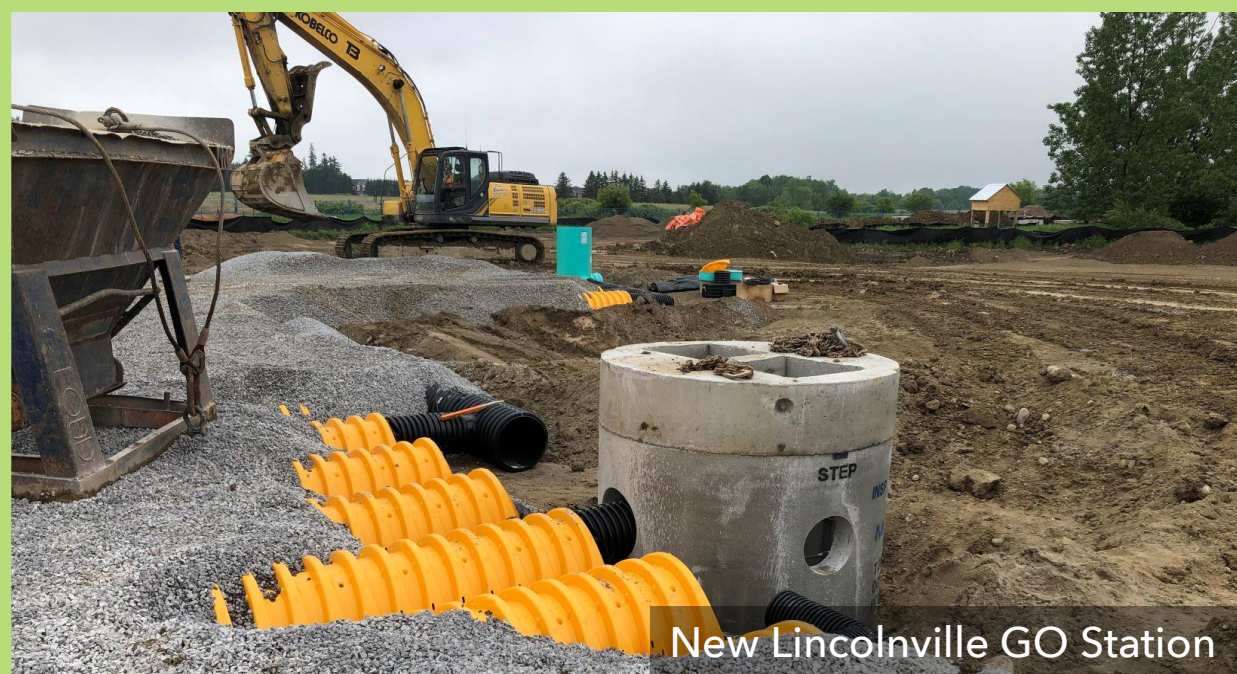
New Lincolnville GO Station