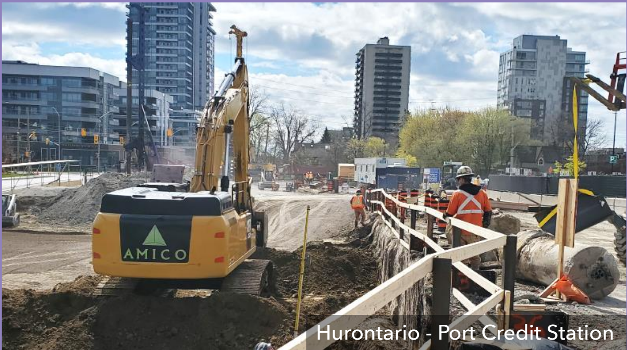
Hurontario - Port Credit Station