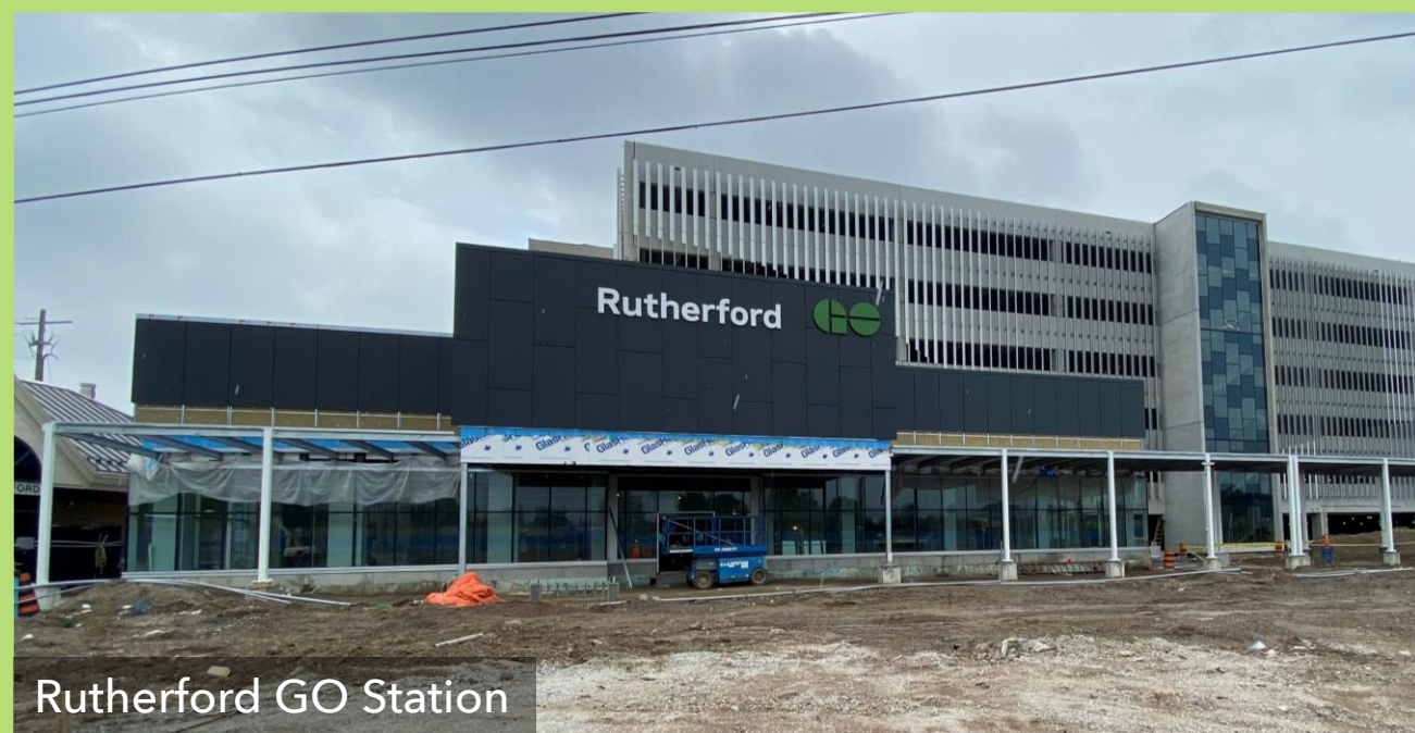
Rutherford GO Station