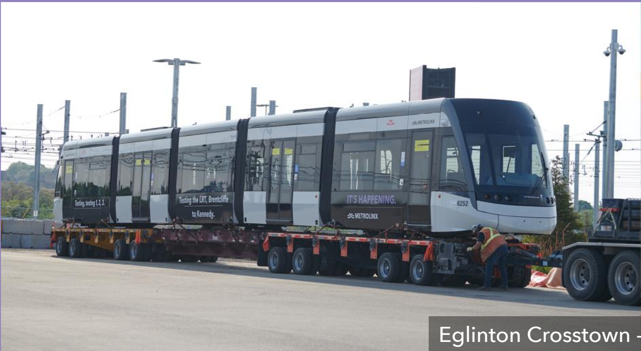
Eglinton Crosstown - East Segment Testing