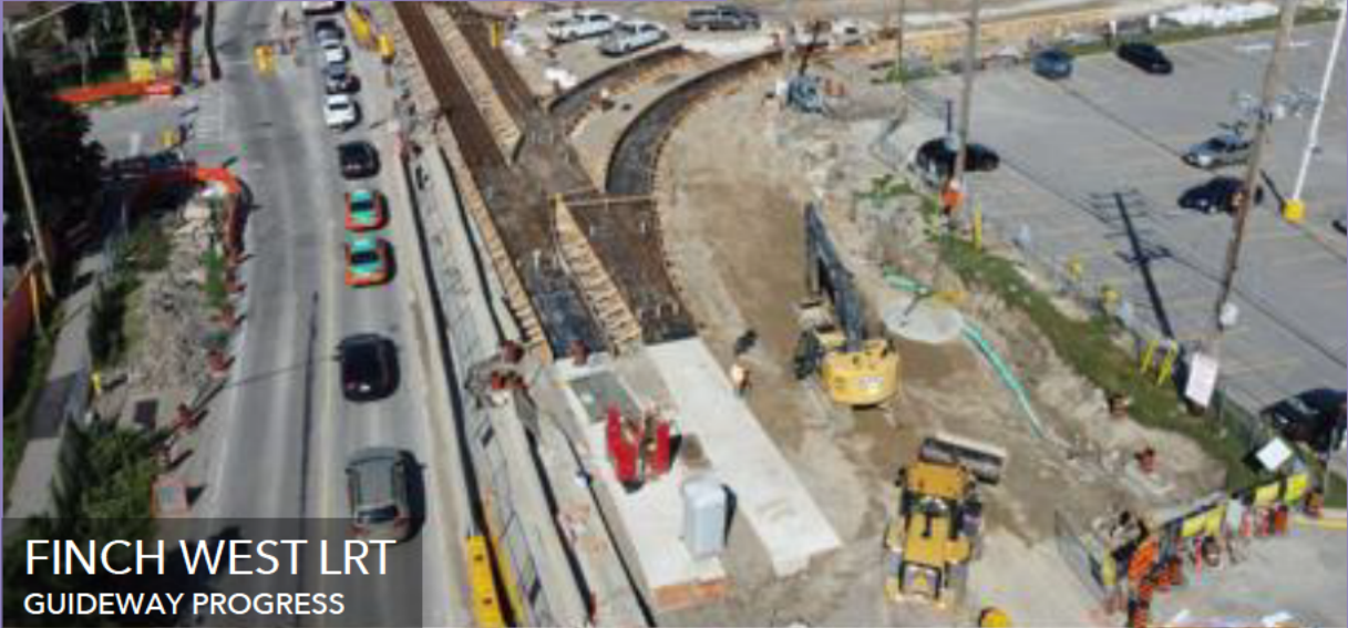
FINCH WEST LRT GUIDEWAY PROGRESS