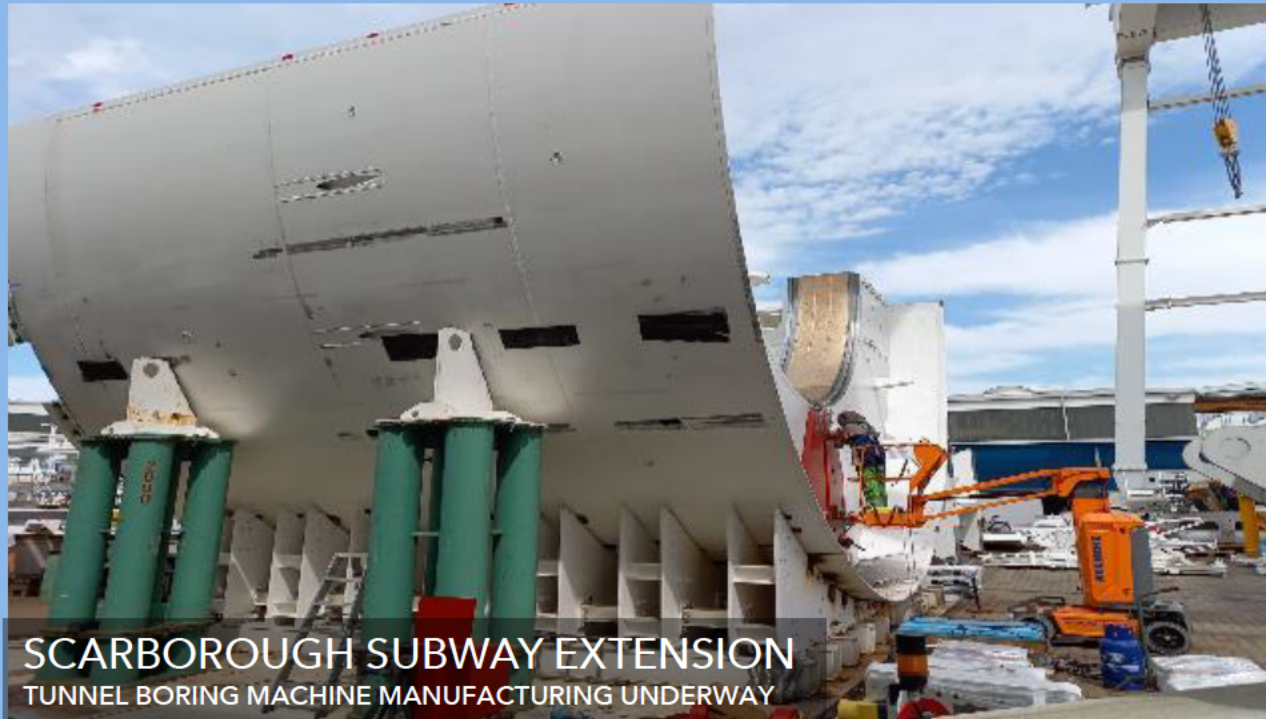
SCARBOROUGH SUBWAY EXTENSION TUNNEL BORING MACHINE MANUFACTURING UNDERWAY