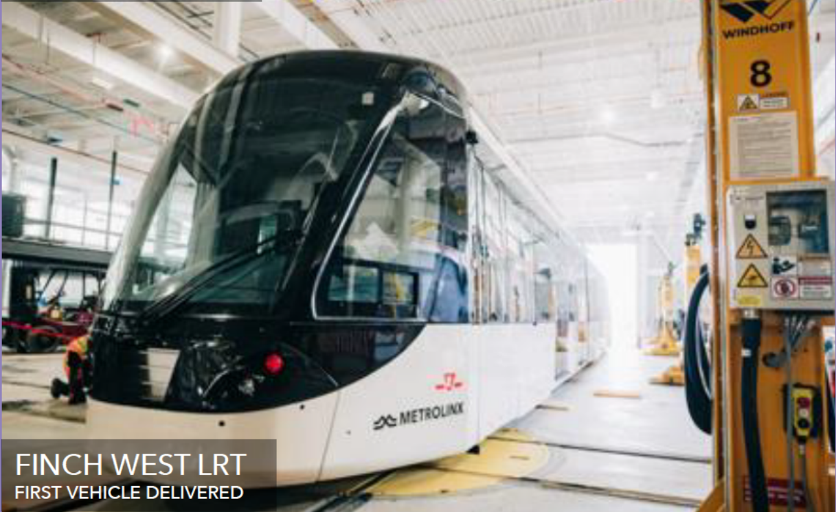
FINCH WEST LRT FIRST VEHICLE DELIVERED