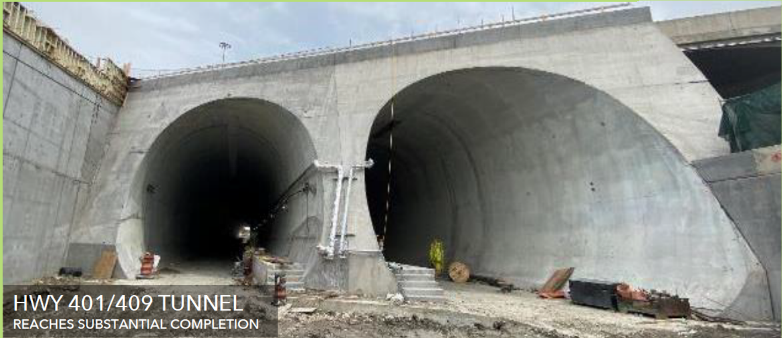
HWY 401/409 TUNNEL REACHES SUBSTANTIAL COMPLETION