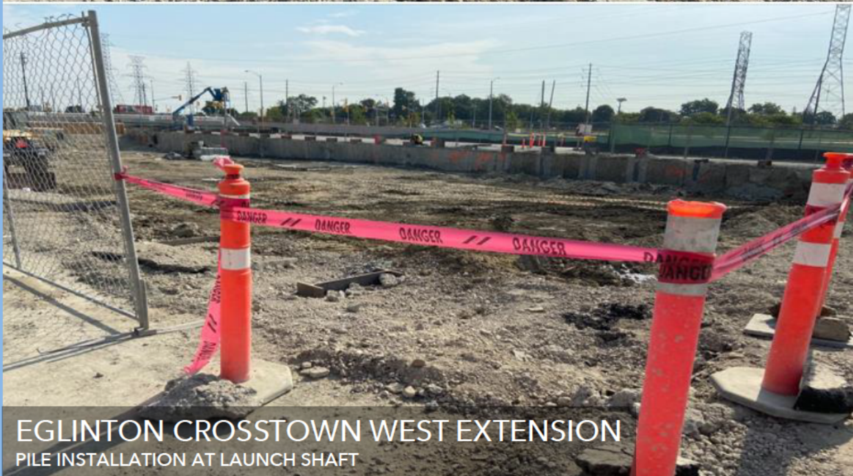
EGLINTON CROSSTOWN WEST EXTENSION PILE INSTALLATION AT LAUNCH SHAFT