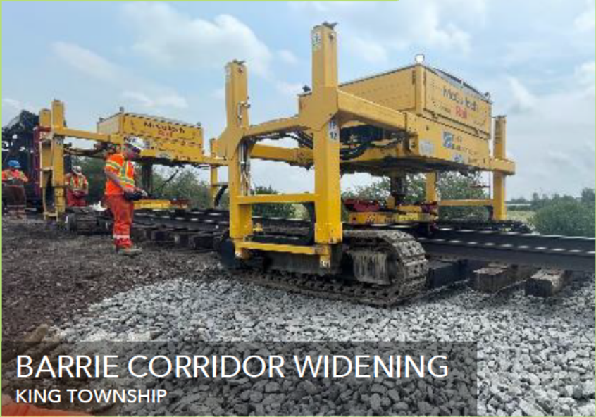
BARRIE CORRIDOR WIDENING KING TOWNSHIP