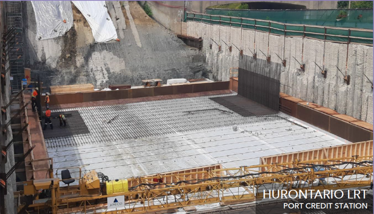
HURONTARIO LRT PORT CREDIT STATION