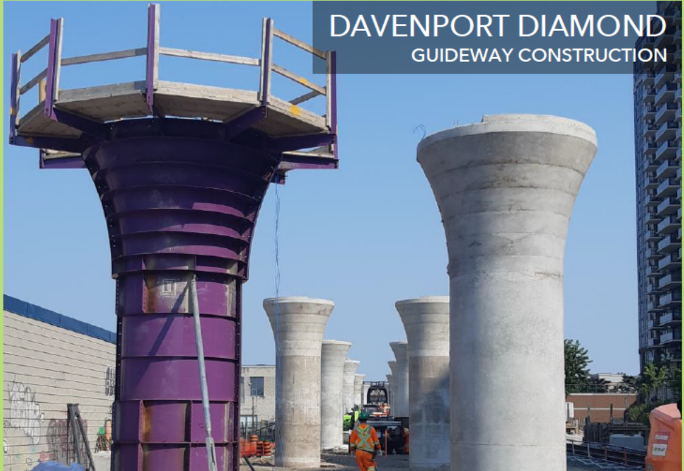
DAVENPORT DIAMOND GUIDEWAY CONSTRUCTION