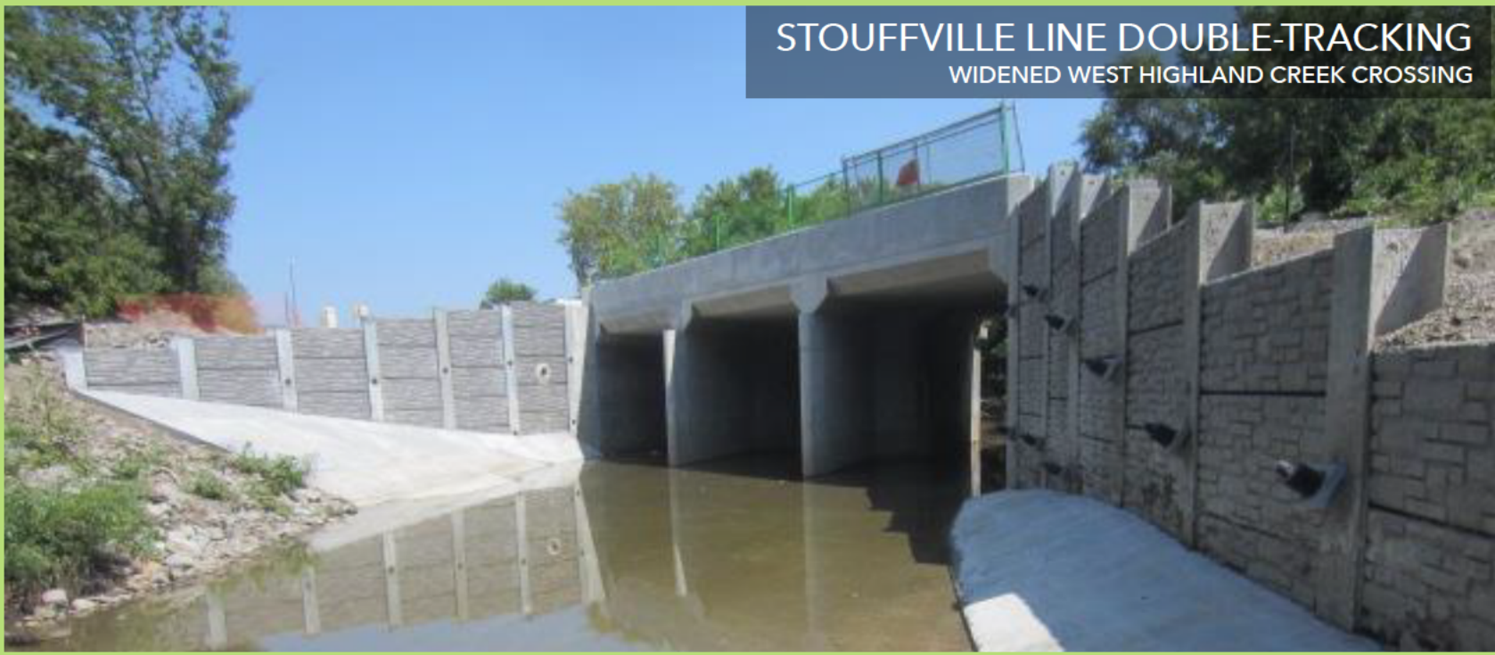
STOUFFVILLE LINE DOUBLE-TRACKING WIDENED WEST HIGHLAND CREEK CROSSING