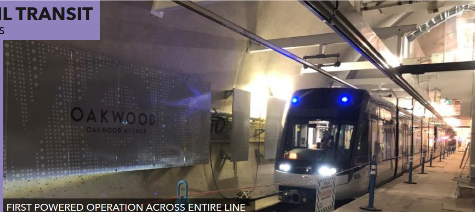
FIRST POWERED OPERATION ACROSS ENTIRE LINE