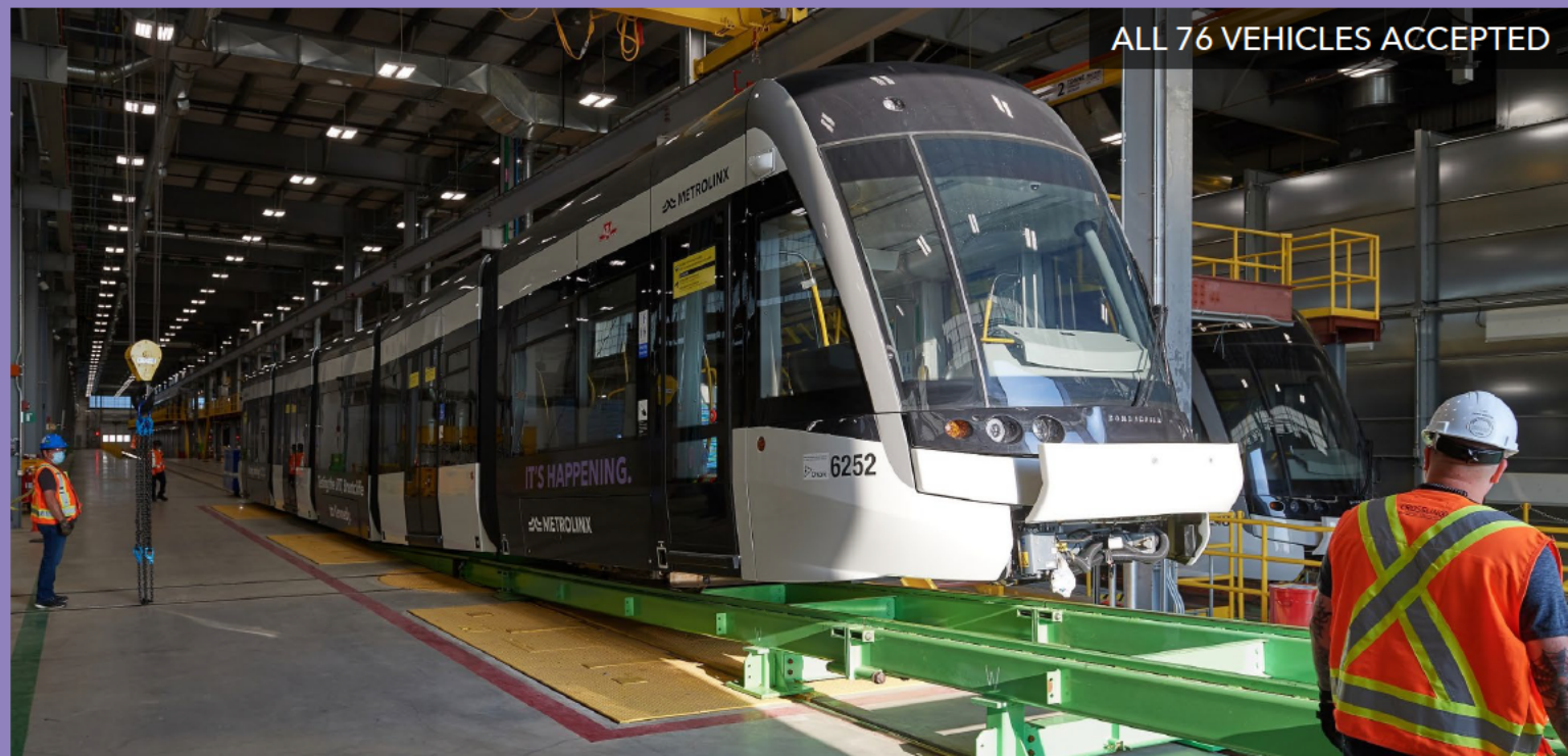
ALL 76 VEHICLES ACCEPTED