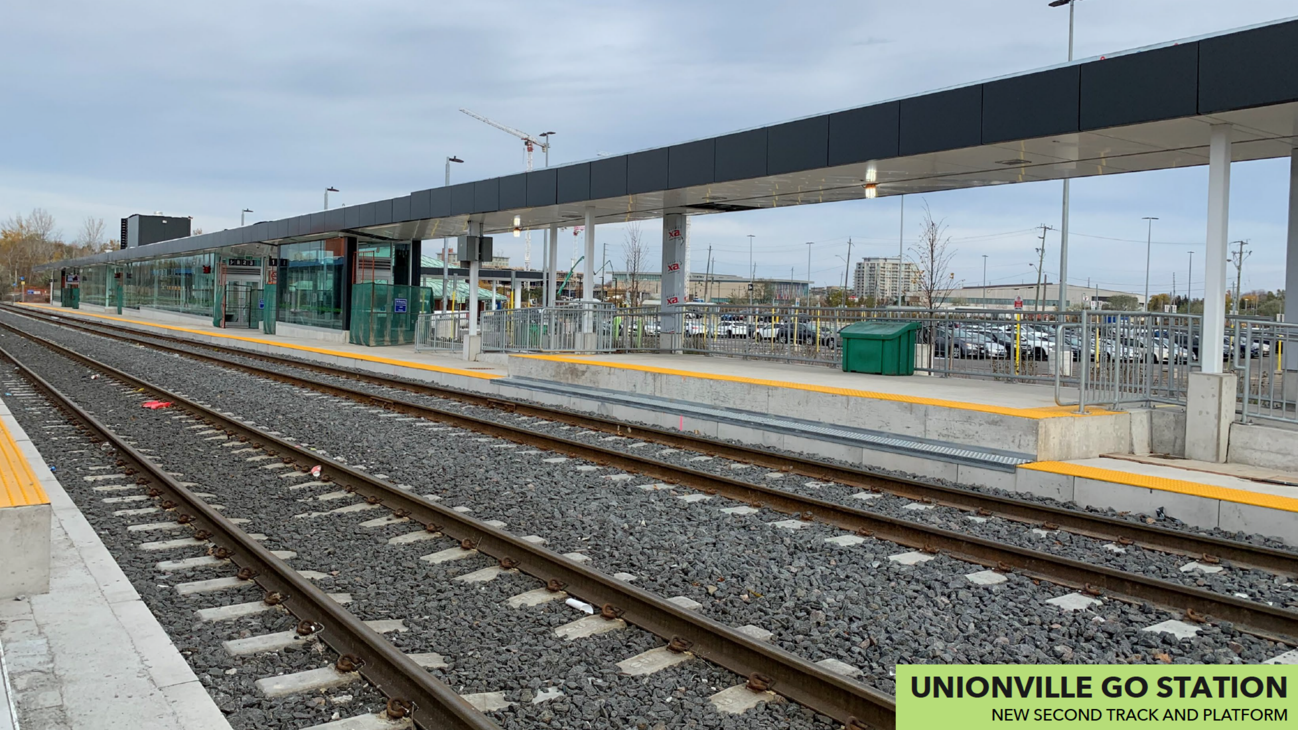
UNIONVILLE GO STATION NEW SECOND TRACK AND PLATFORM