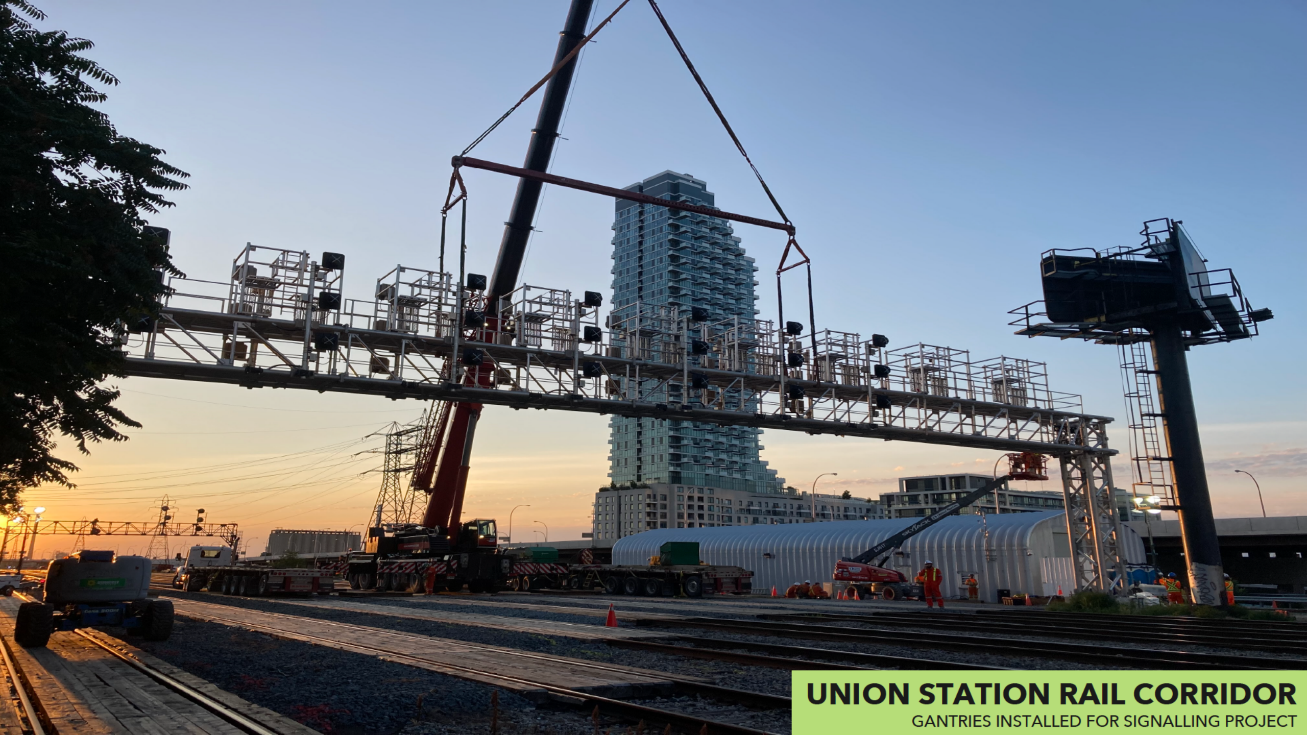
UNION STATION RAIL CORRIDOR GANTRIES INSTALLED FOR SIGNALLING PROJECT