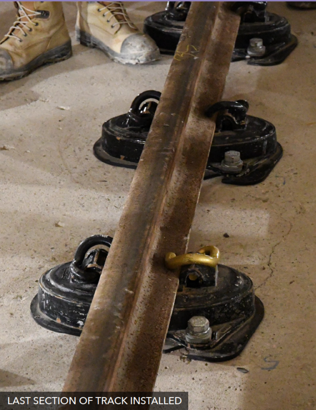
LAST SECTION OF TRACK INSTALLED