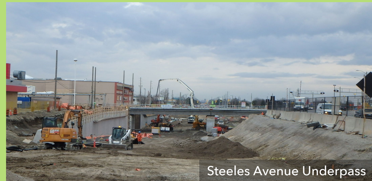
Steeles Avenue Underpass