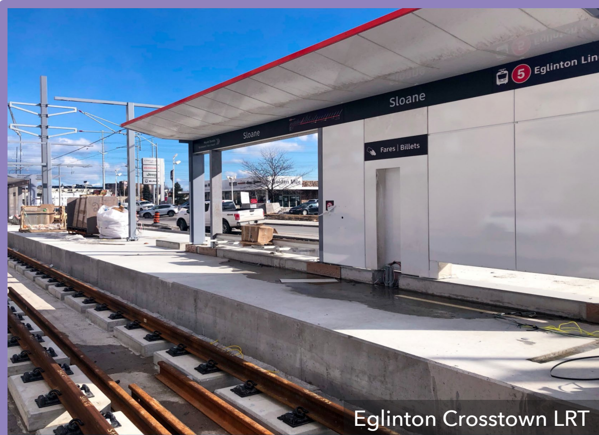
Eglinton Crosstown LRT