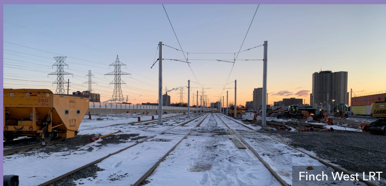
Finch West LRT