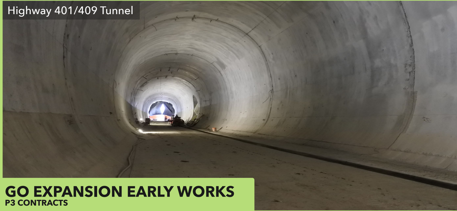
Highway 401/409 Tunnel