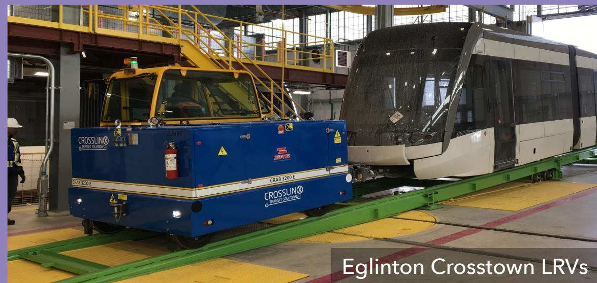
Eglinton Crosstown LRVs