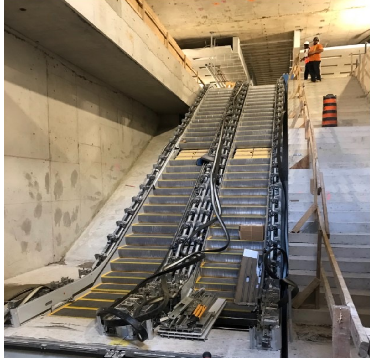
Photo: Escalator installation in Finch West Station. 2022.09.21