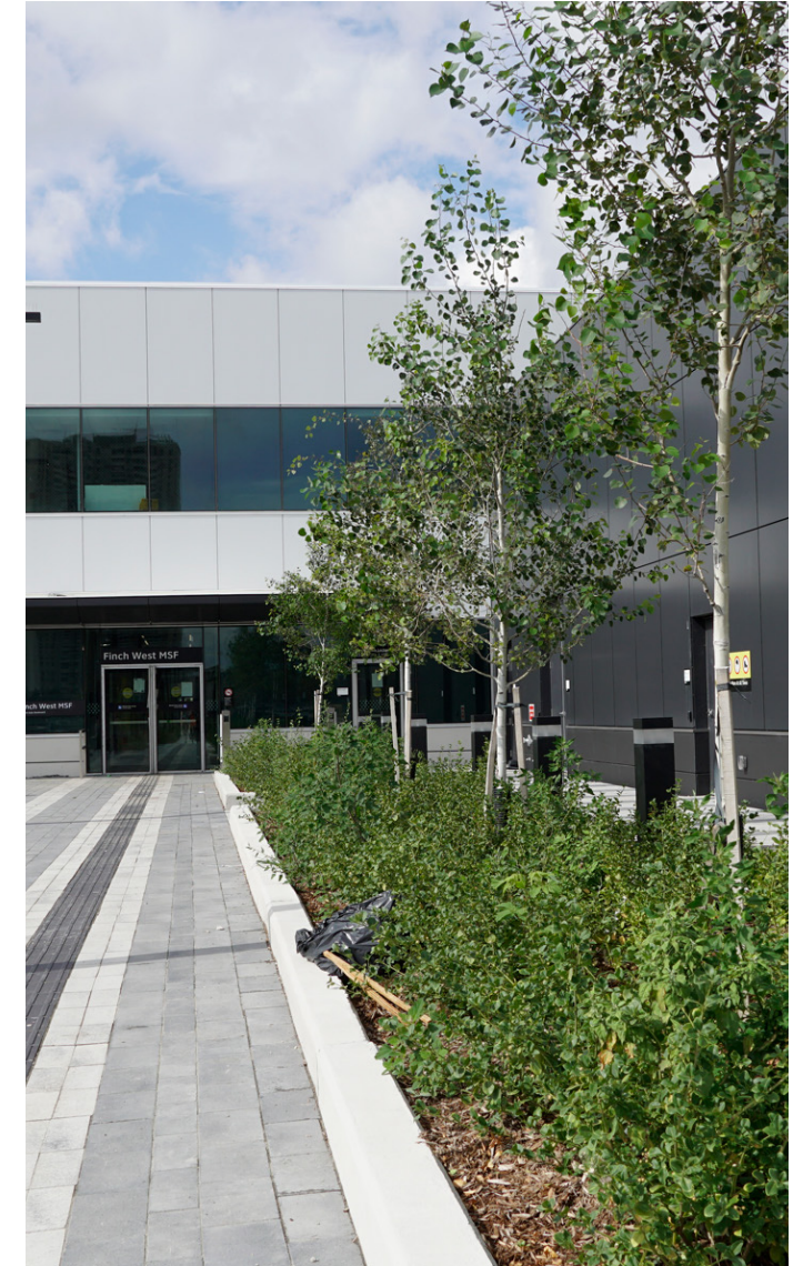
Photo: Tree planting article.