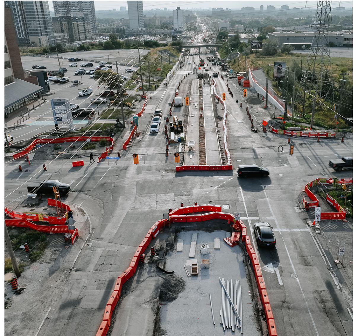
Photo: Aerial view west, Signet Drive, Arrow Road and Finch Avenue West. 2022.09.21