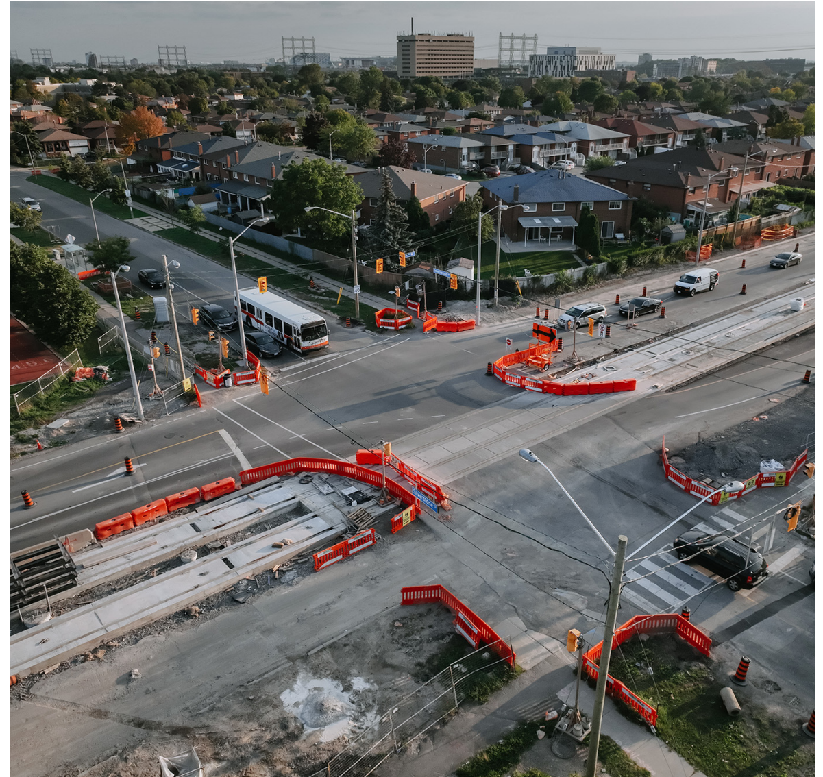
Photo: Aerial view southwest, Silverstone Drive, John Garland Boulevard. 2022.09.21