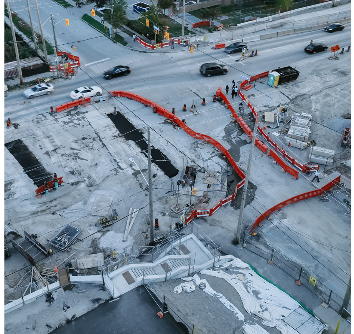
Photo: Aerial view southwest, Finch Avenue West and Pearldale Avenue. 2022.09.21