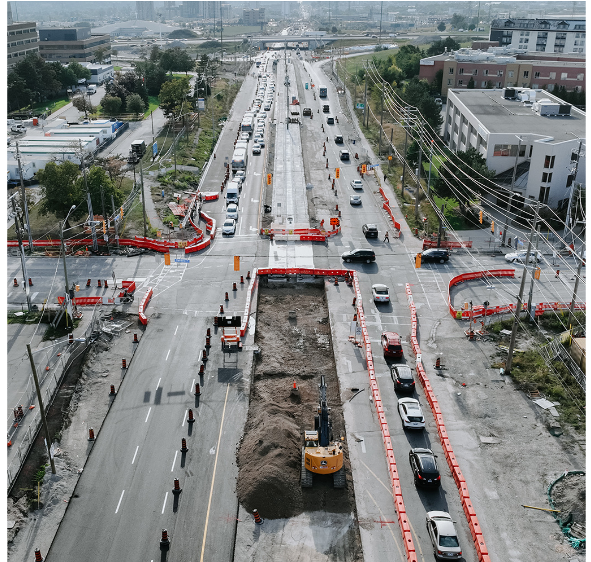
Photo: Aerial view west, Norfinch Drive and Finch Avenue West. 2022.09.21