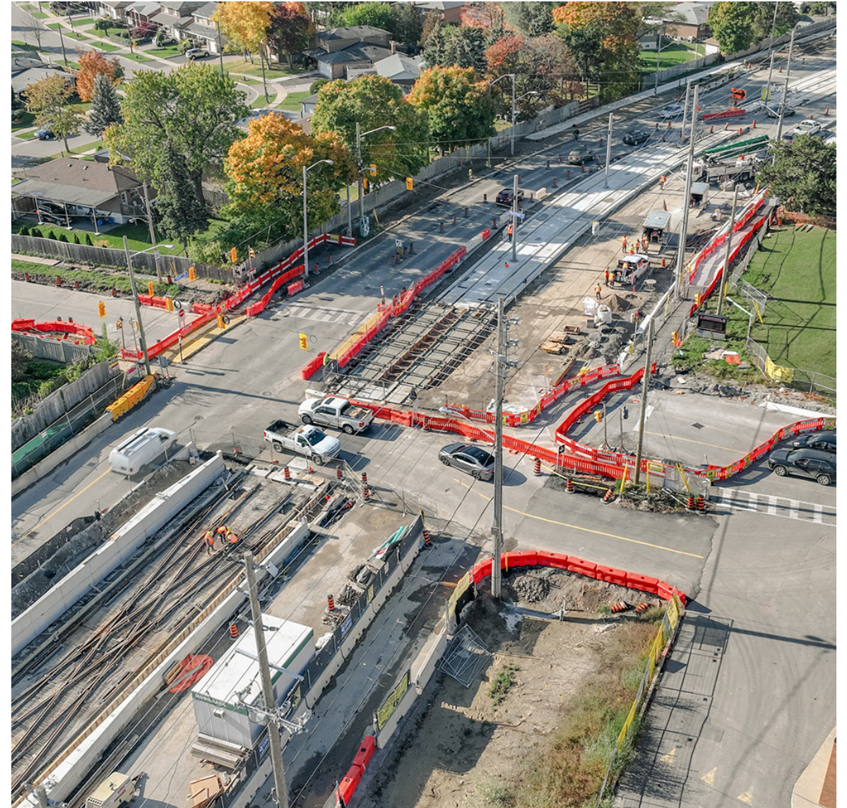
Photo: Aerial view west at Romfield Lane and Finch Avenue West. 2022.10.28