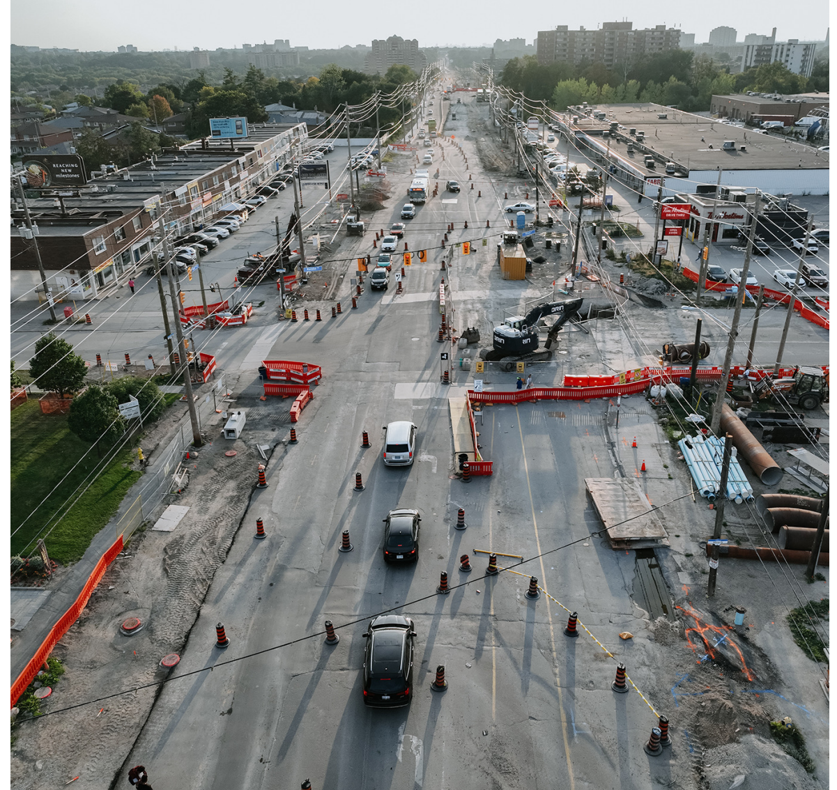
Photo: Aerial view west, Finch Avenue West and Rumike Road. 2022.09.21