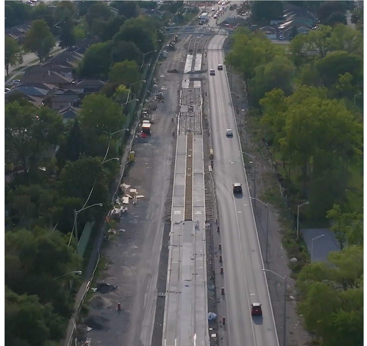
Photo: Aerial view west, between Islington Avenue to Kipling Avenue. 2022.09.21