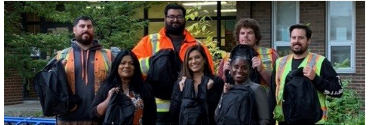
Photo: Backpack donation for school children on the Finch Avenue West alignment