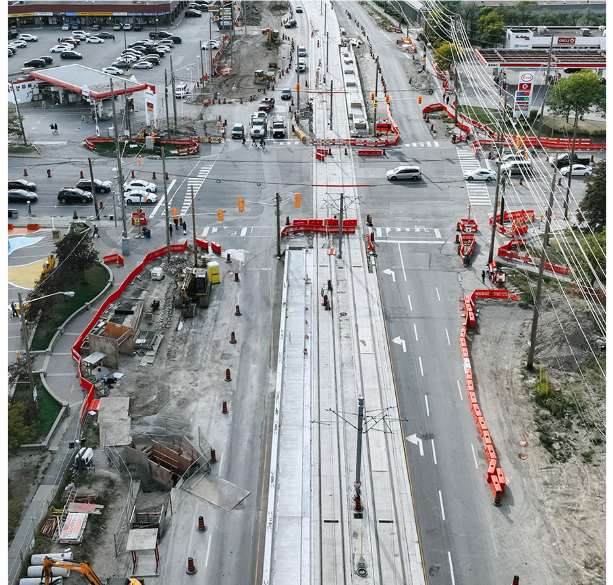
Photo: Aerial view west at Jane Street and Finch Avenue West. 2022.09.21