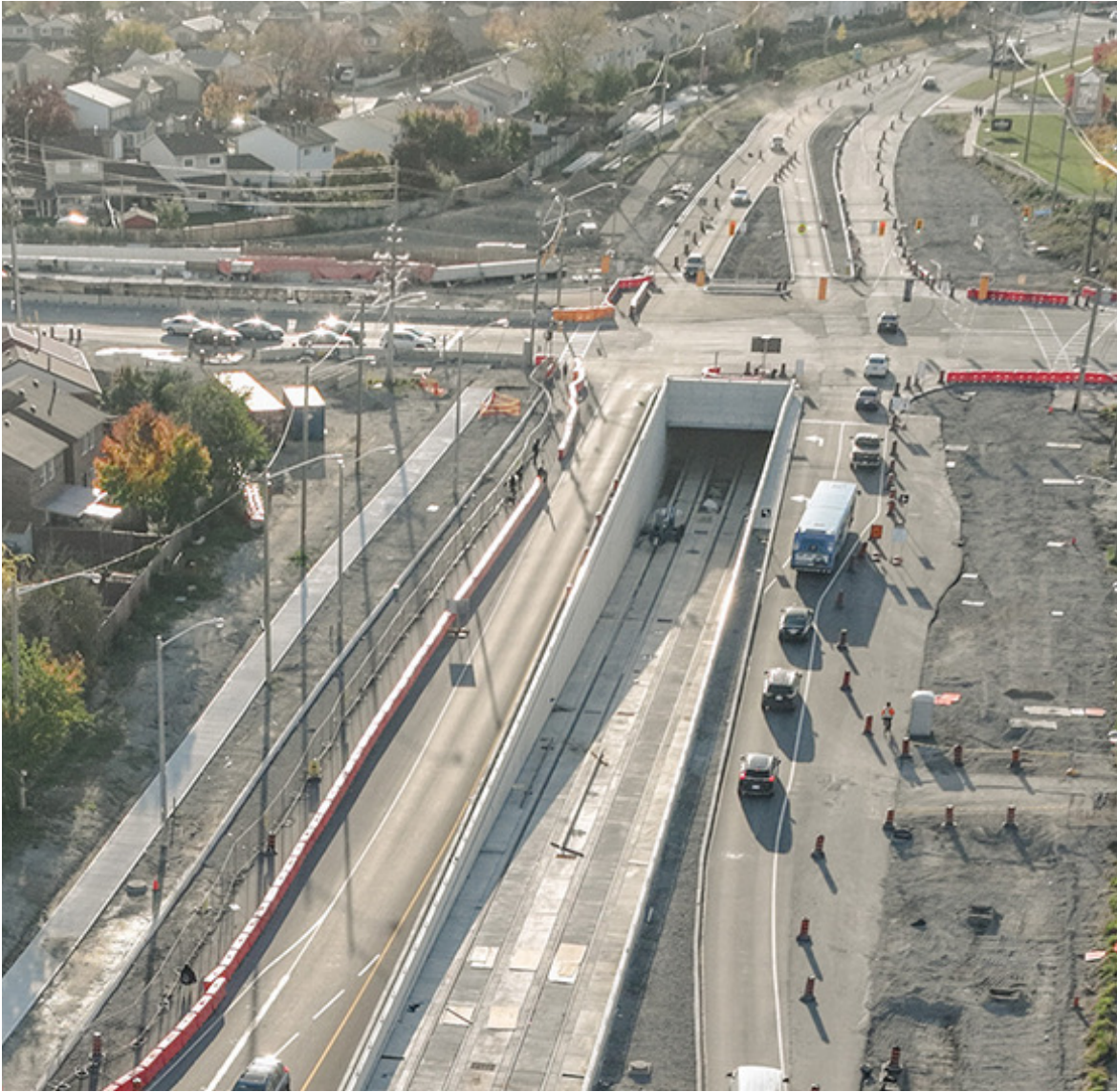
Photo: Aerial view west, Finch Avenue West and Highway 27 intersection. 2022.10.28