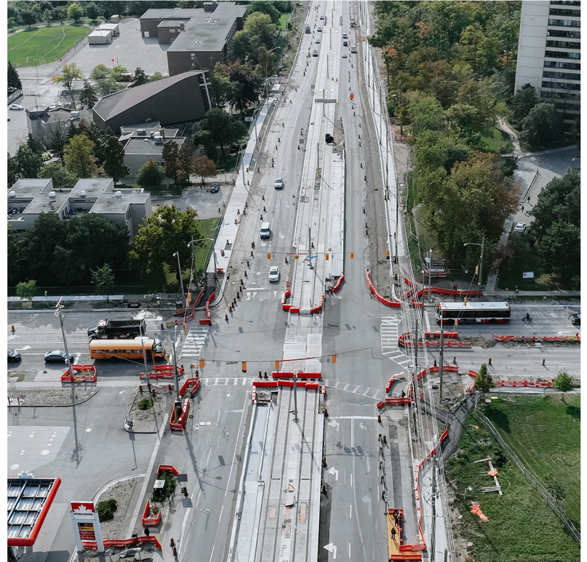
Aerial view west at Sentinel Road and Finch Avenue West. 2022.09.21