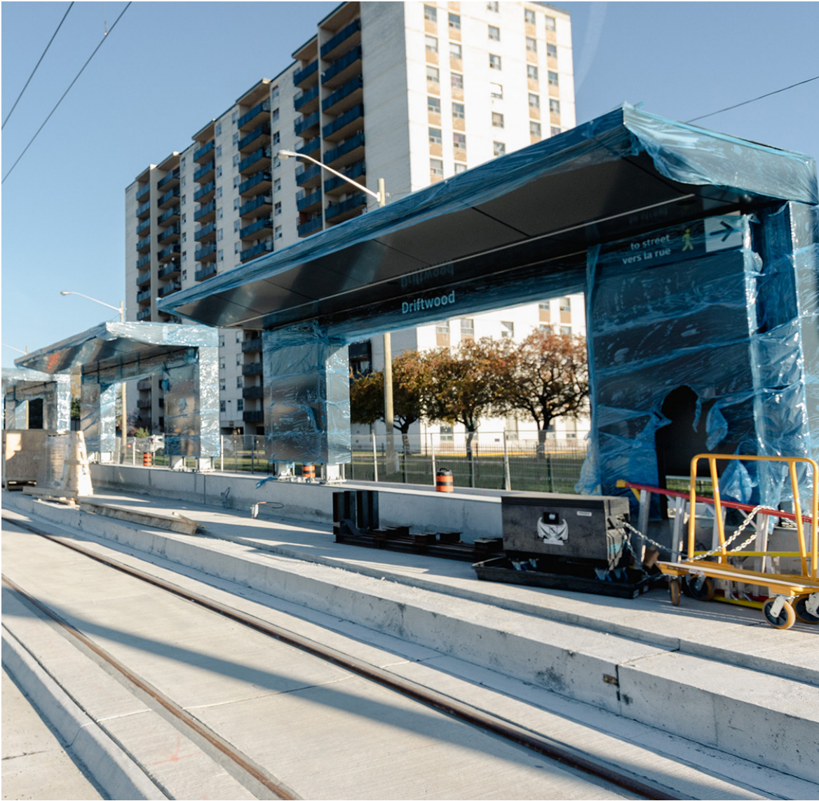
Photo: Newly installed Driftwood platform stop canopies. 2022.10.28