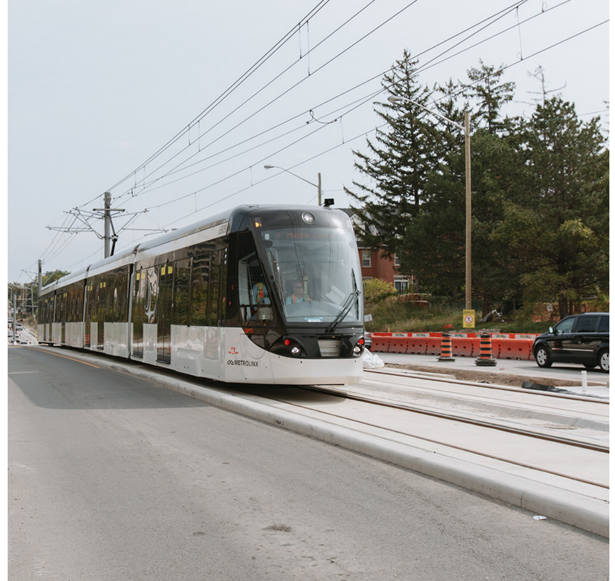
Photo: Light Rail Vehicle testing on the guideway. 2022.09.21