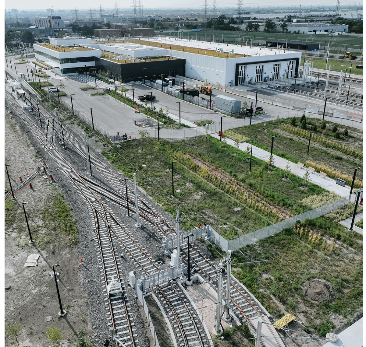
Photo: Aerial view Maintenance and Storage Facility and landscaped yard. 2022.09.21