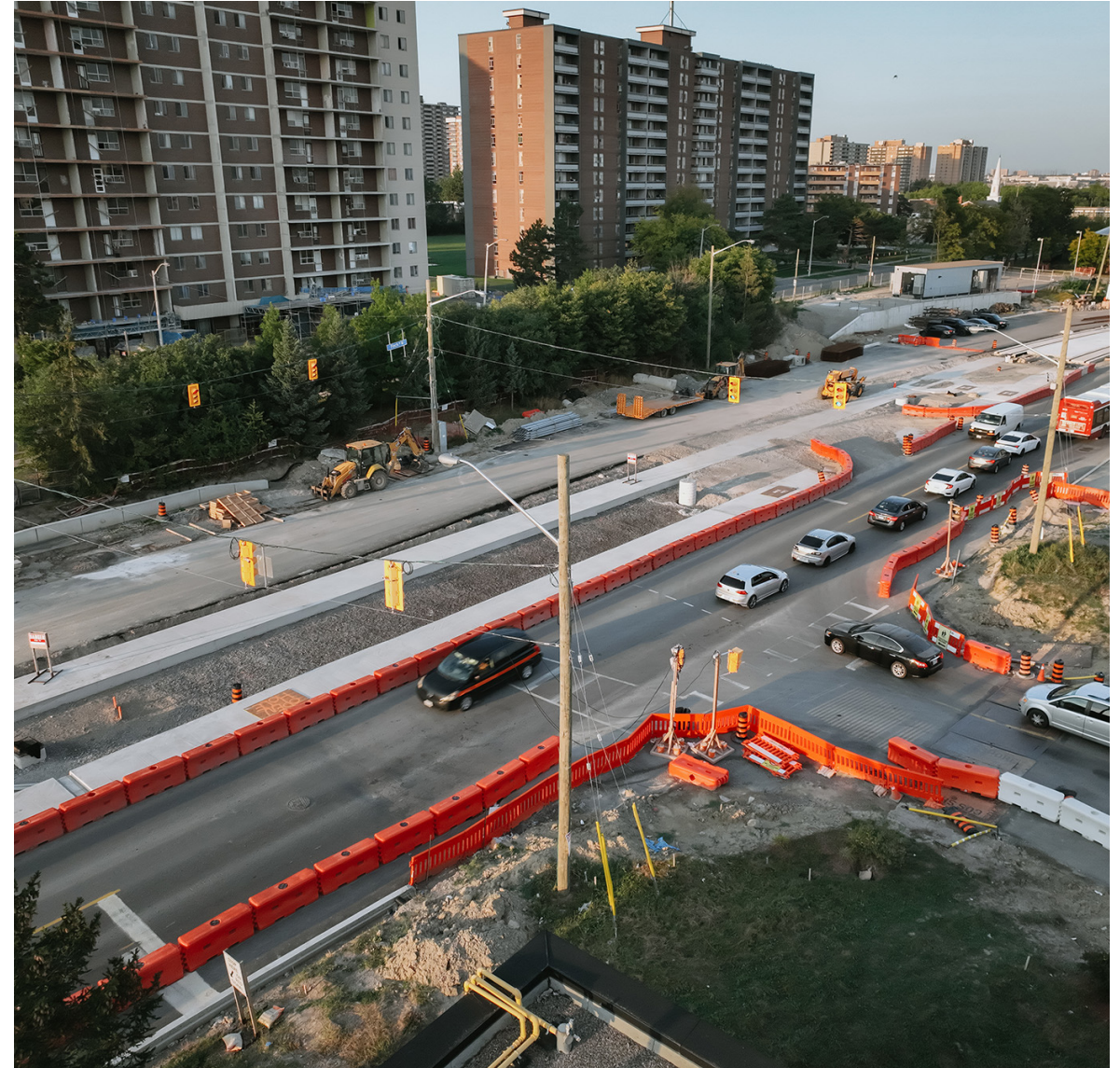
Photo: Aerial view northeast, Albion Centre Driveway and Finch Avenue West. 2022.09.21