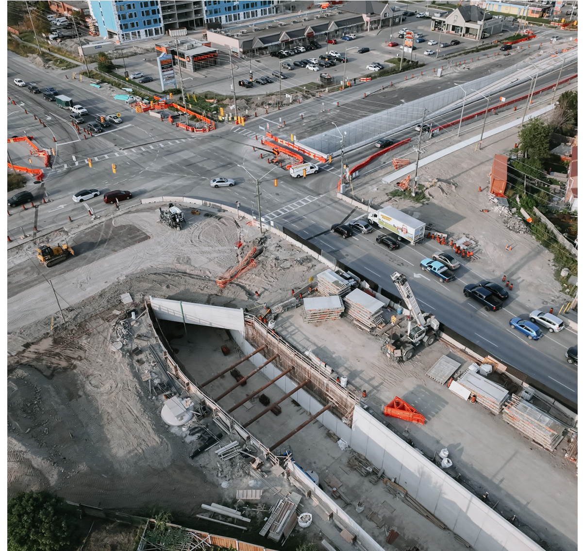
Photo: Aerial view northeast, Highway 27 and Finch Avenue West. 2022.09.21