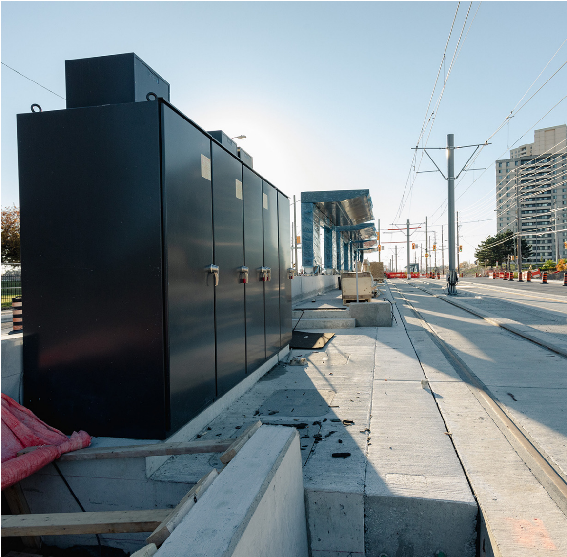
Photo: Electrical cabinets installed at Driftwood platform stop. 2022.10.28