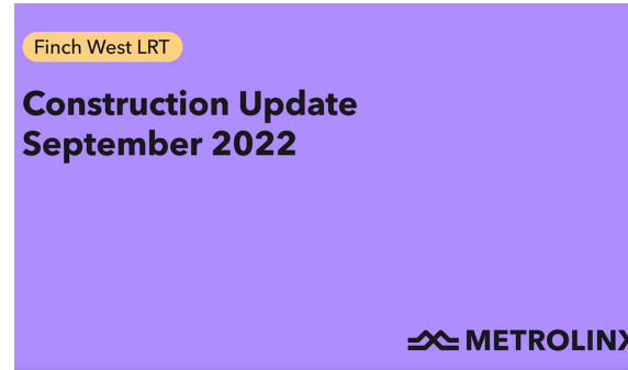
Photo: Video of fly-through for late Fall.