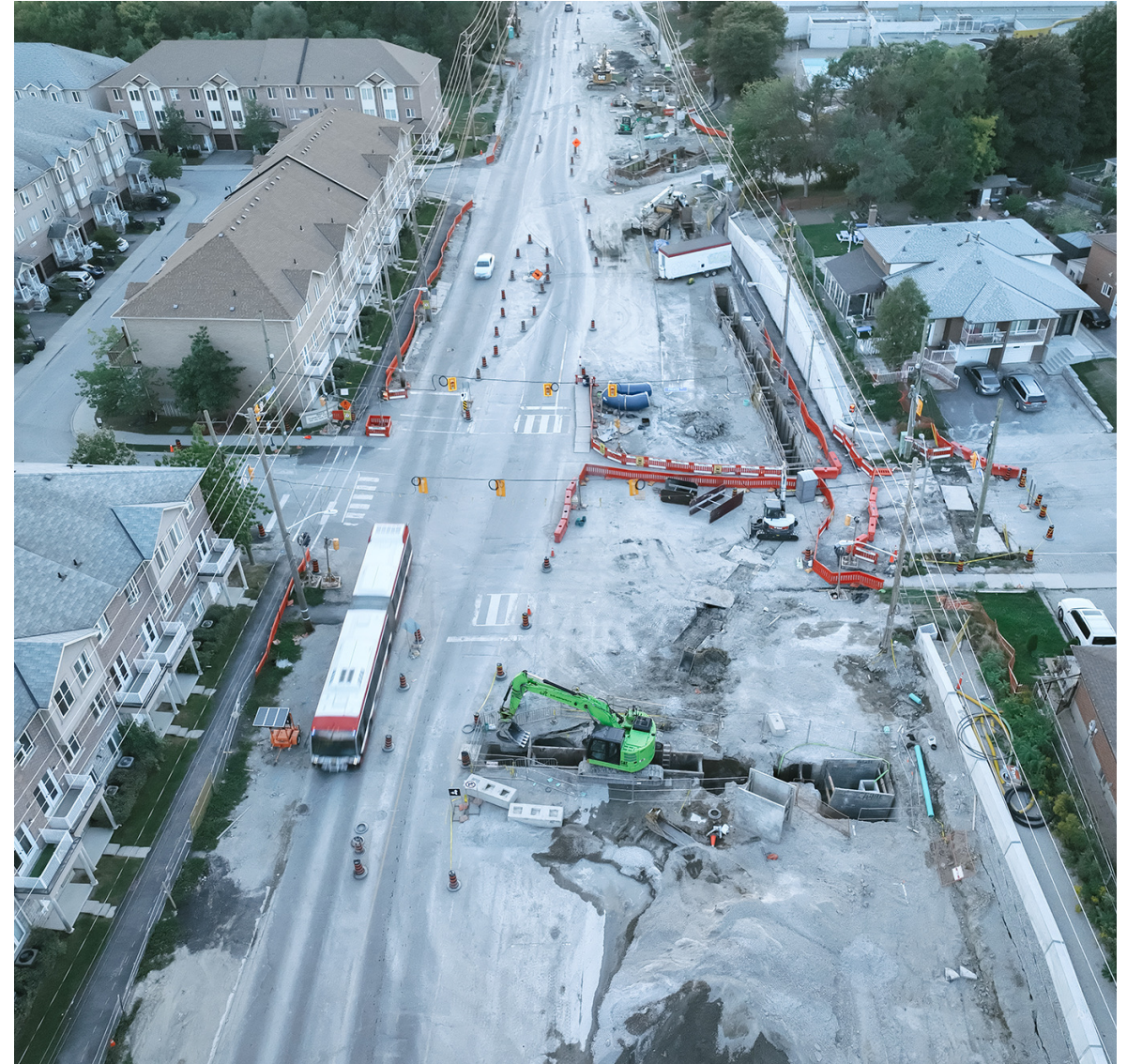
Photo: Aerial view west, Milady Road and Finch Avenue West. 2022.09.21