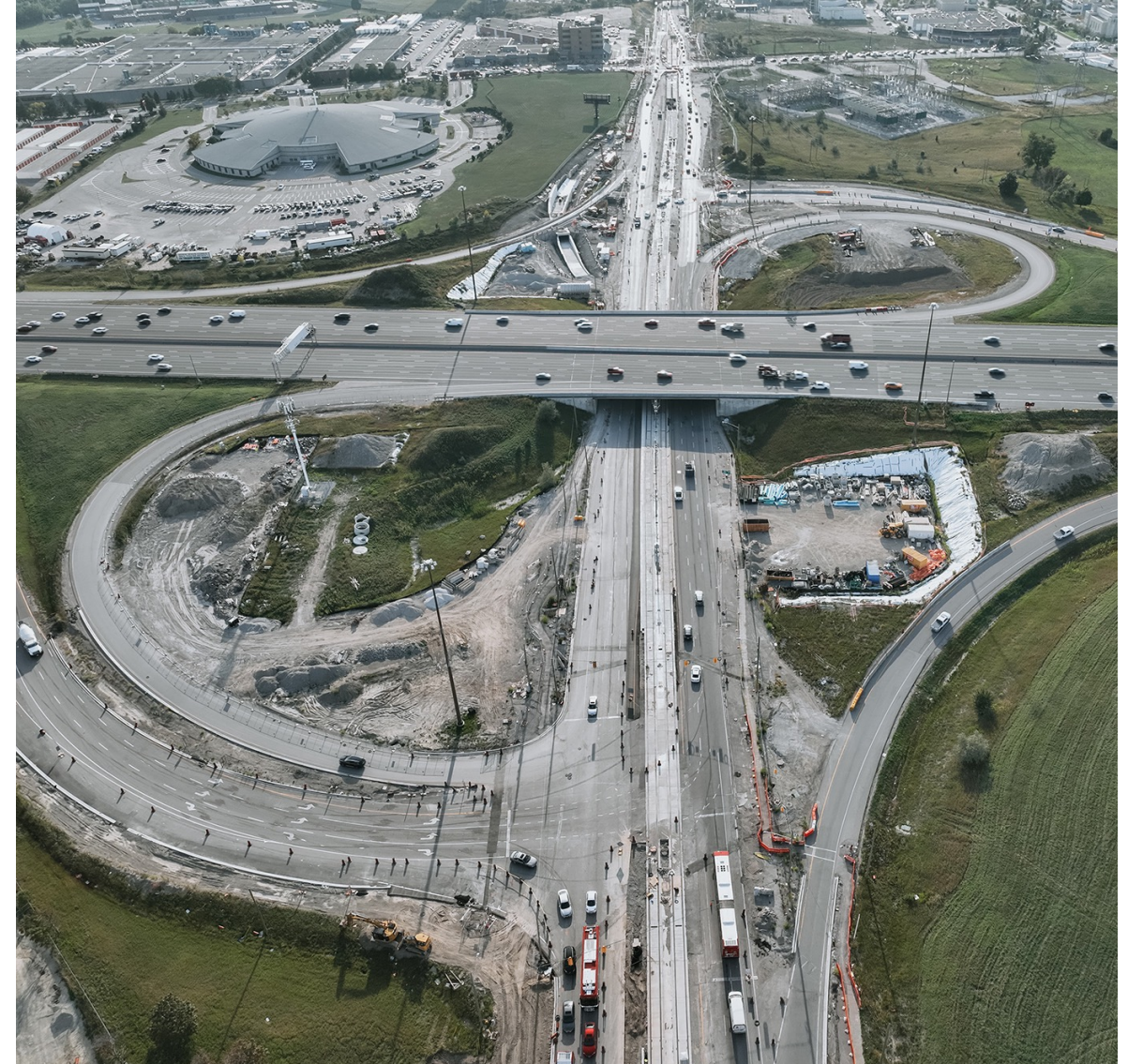
Photo: Aerial view west, Highway 400 and Finch Avenue West. 2022.09.21