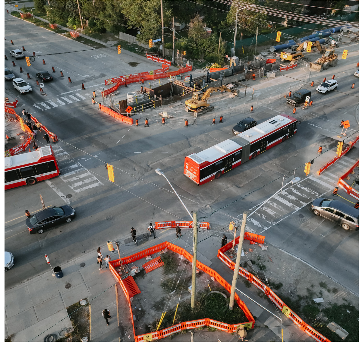
Photo: Aerial view northeast, Kipling Avenue and Finch Avenue West. 2022.09.21