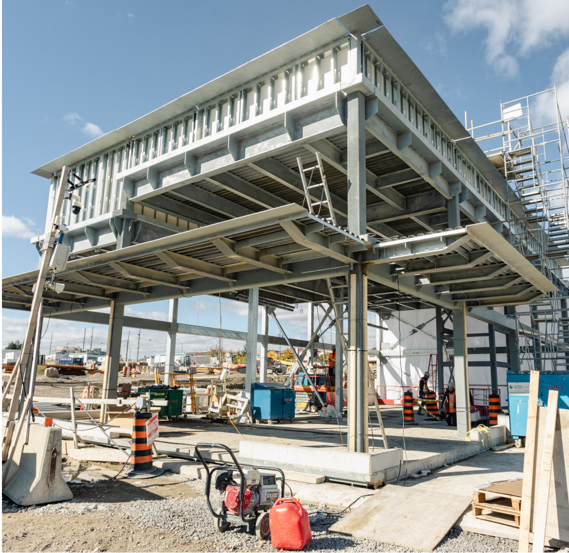
Photo: Humber College station structural steel, south building. 2022.10.28