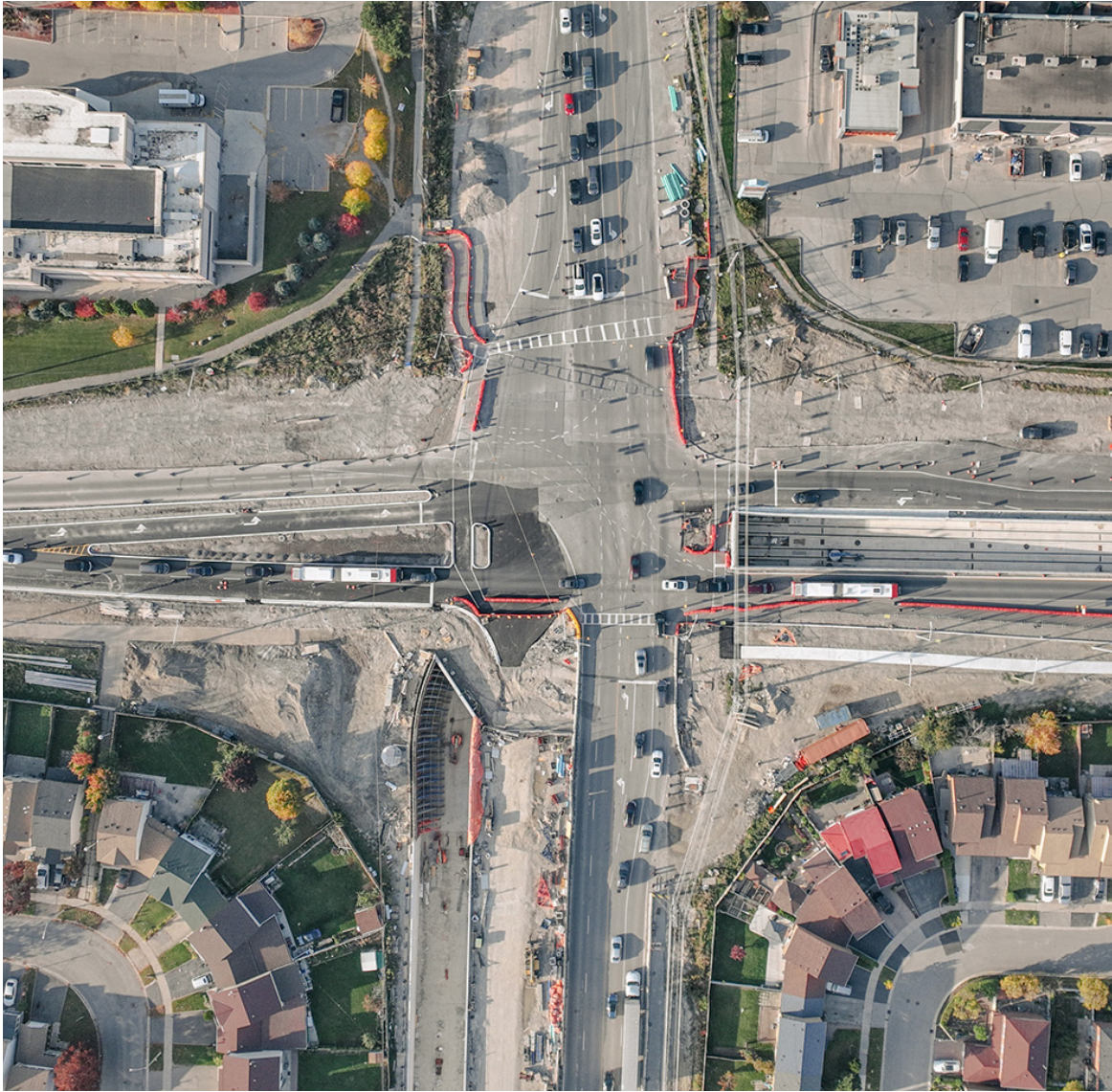
Photo: Aerial view Finch Avenue West and Highway 27 intersection. 2022.10.28