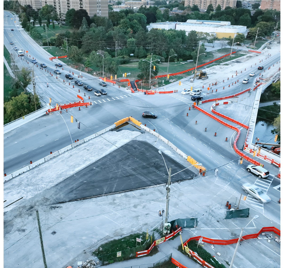
Photo: Aerial view northeast, Islington Avenue and Finch Avenue West. 2022.09.21