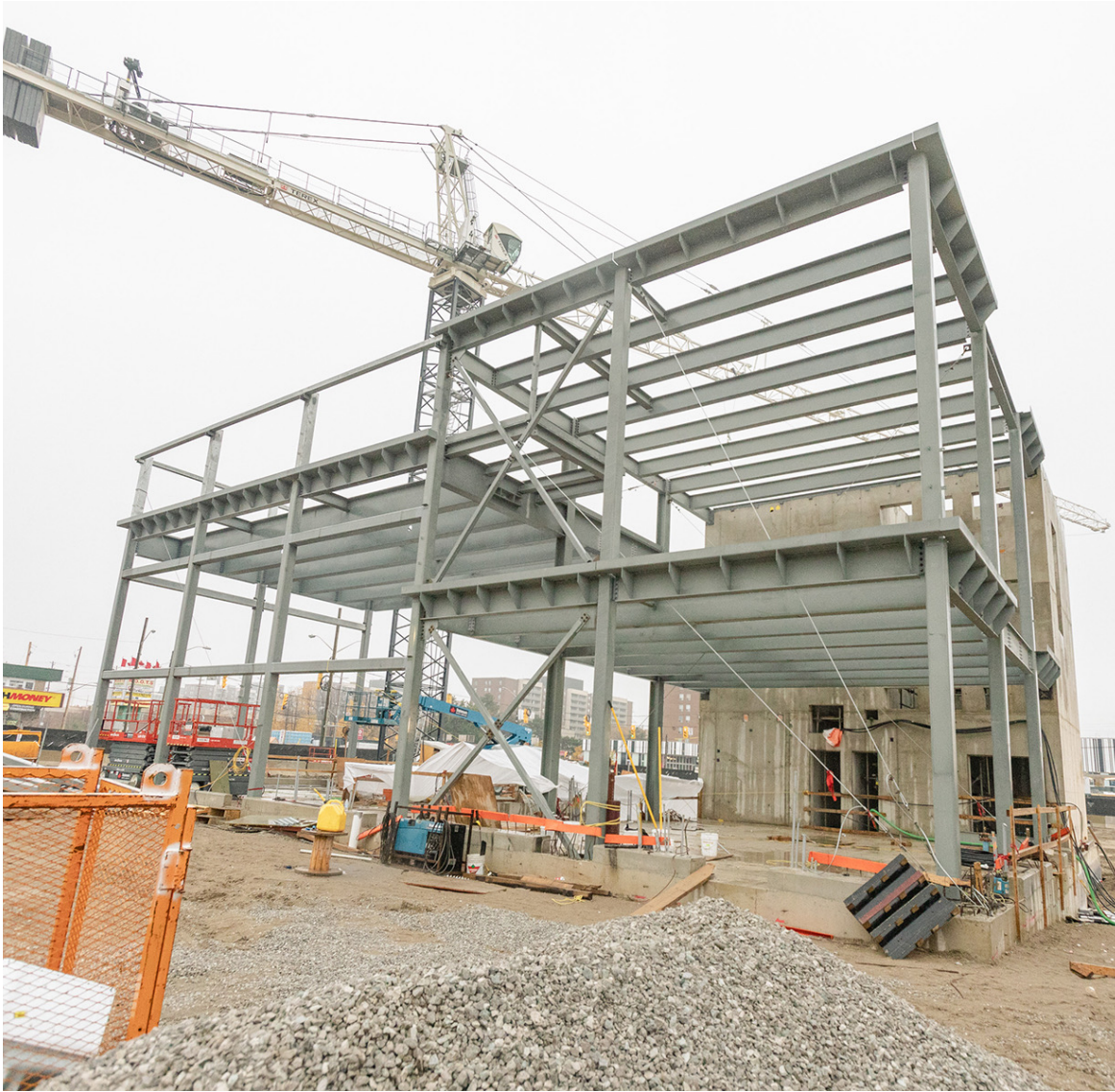
Photo: Finch Station structural steel in progress. 2022.10.28