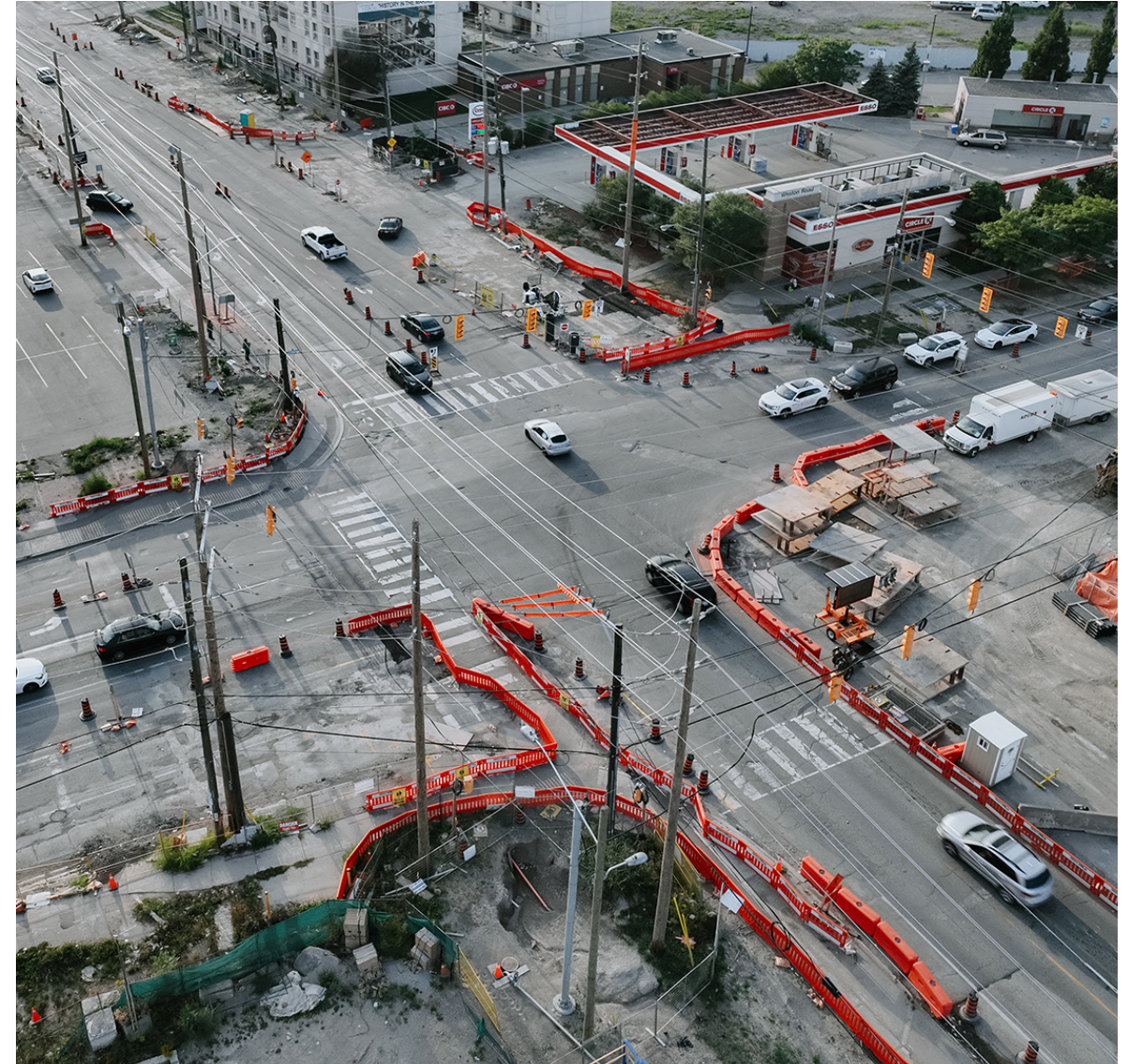
Photo: Aerial view west, Weston Road and Finch Avenue West. 2022.09.21