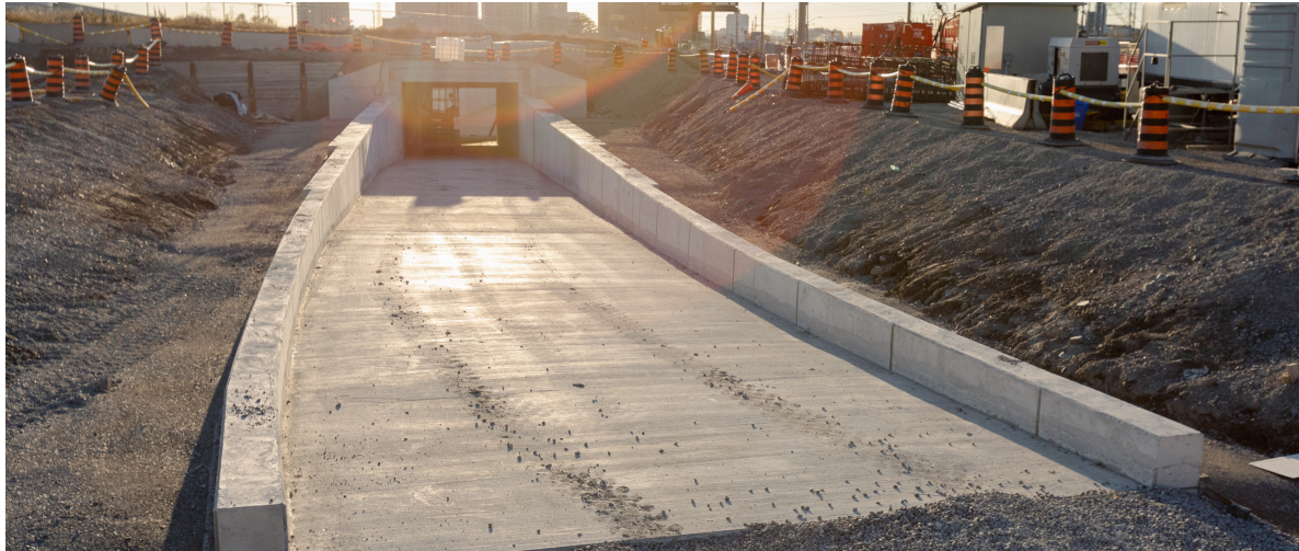
Photo: Multiuse Pathway tunnel, view west, south on-ramp of Highway 400 and Finch Avenue West. 22.10.28