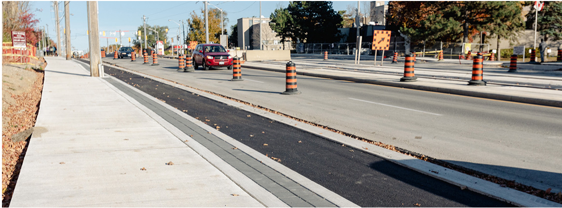
Photo: Bike lanes and finished sidewalk south of Sentinel Road, along Finch Avenue West. 2022.10.28