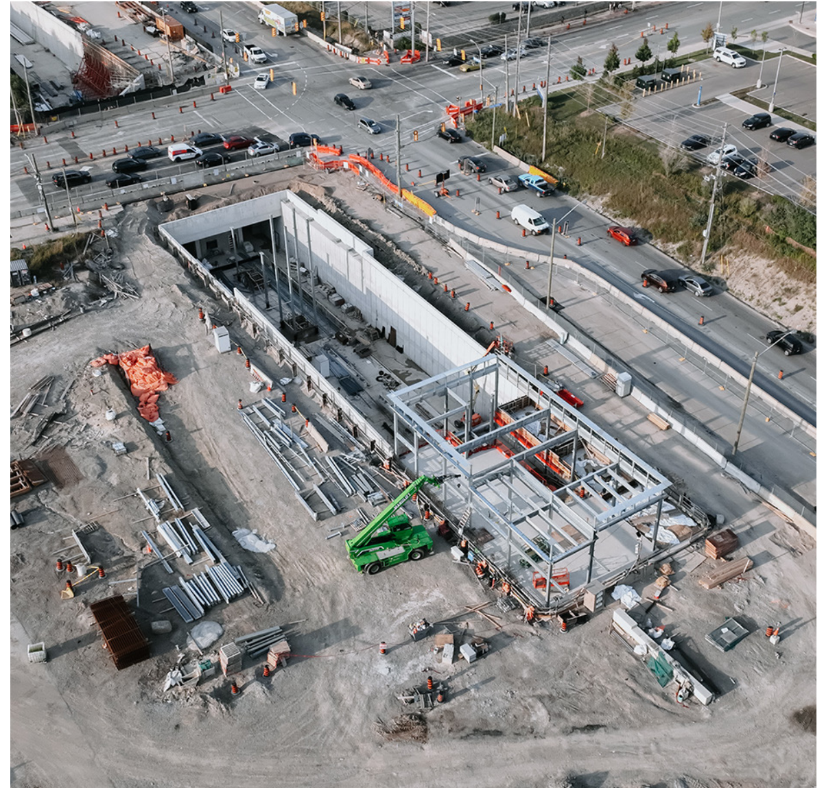
Photo: Aerial view Humber College Station. 2022.09.21