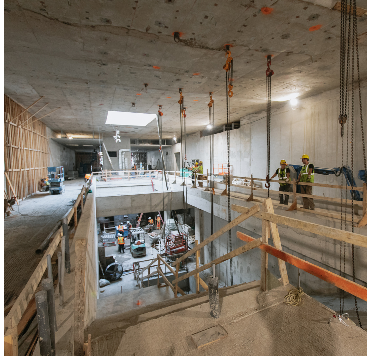
Photo: Platform level of the Finch West Station, looking below to concourse level. 2022.09.21