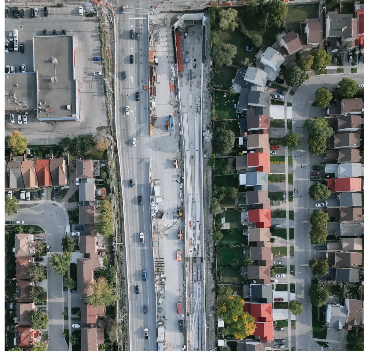
Photo: Aerial view Humber College station portal. 2022.09.21