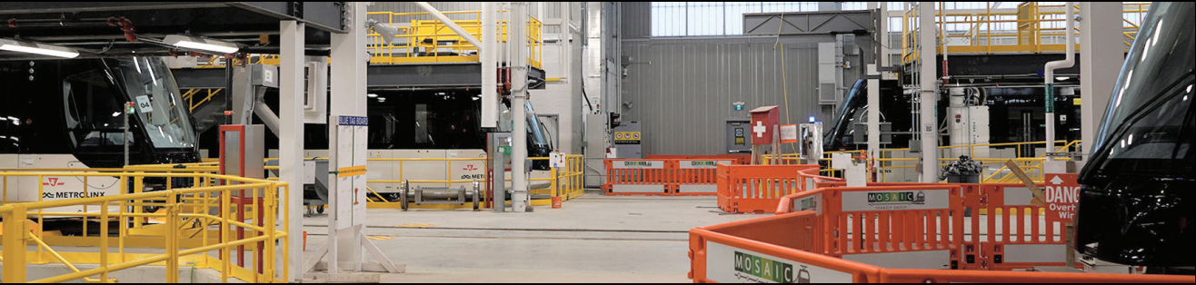
Photo: Four of five LRVs pictured in the Maintenance and Storage Facility bay.

The remaining 13 LRVs are expected to be delivered in the coming months, with testing activities increasing as more LRVs arrive.