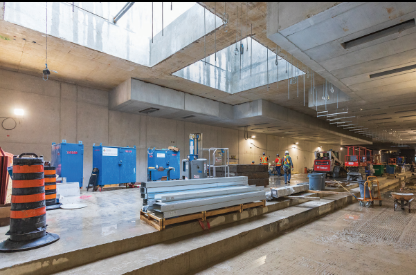
Photo: Interior view of the Finch West Station track platform.