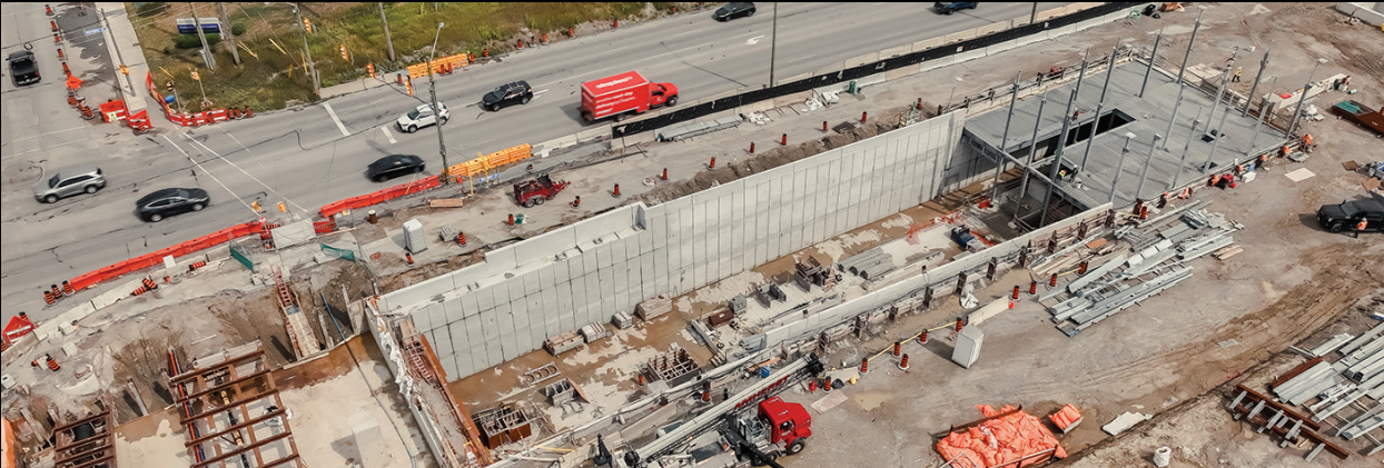
Photo: Aerial view of the Humber College Station building structure and below grade platform.

This marks the culmination of structural work that began at Humber College Station in November 2020. With the concrete structural works complete, the team is focused on the station's steel structures, which will require approximately 650,000 kg of steel.