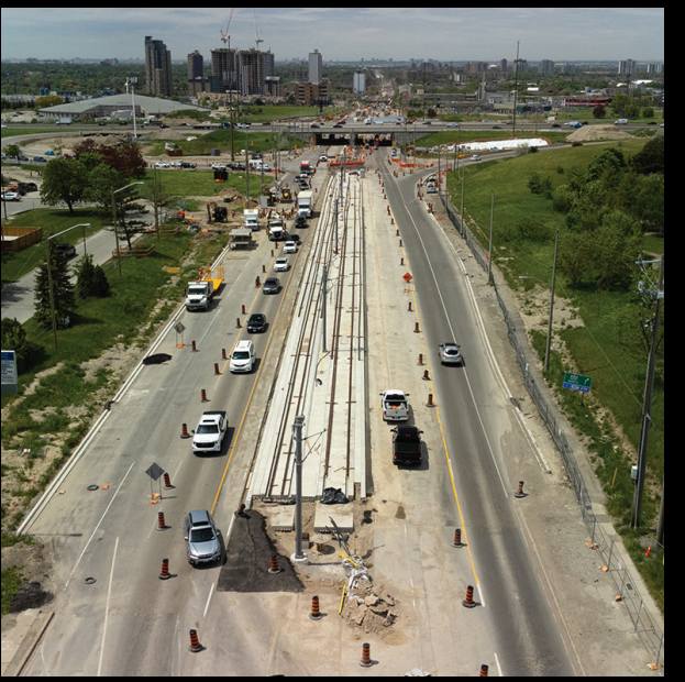
Photo: Westward view of the track slab, from Norfinch Avenue to Highway 400.

The track slab is being built in sections across the alignment. The largest continuous swath is located between Signet Drive and Romfield Lane, with a small section requiring final completion around Norfinch Drive.