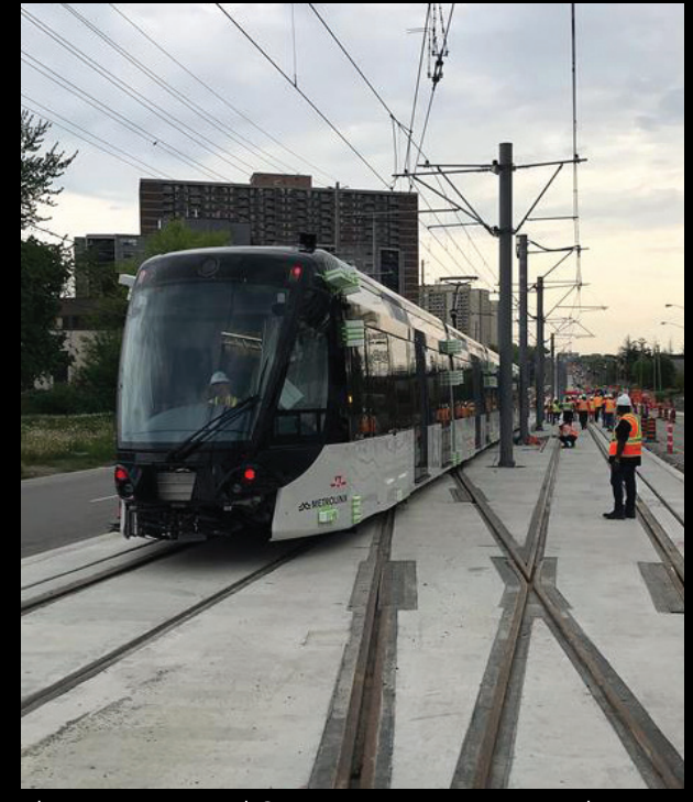
Photo: Testing and Commissioning team members carefully observe the LRV making its journey along the burn-in track.

Regular testing of light rail vehicles (LRV) on the Finch West LRT Project is now underway.