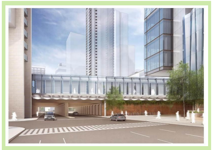
Figure 2. Rendering of the bridge connection between Union Station and the new office tower located at 141 Bay Street.

Thank you for your patience while the developer, Hines, works with the City of Toronto to complete construction for the new pedestrian bridge over Bay Street. Once complete, the bridge will offer a connection between Union Station and the new office tower located at 141 Bay Street.