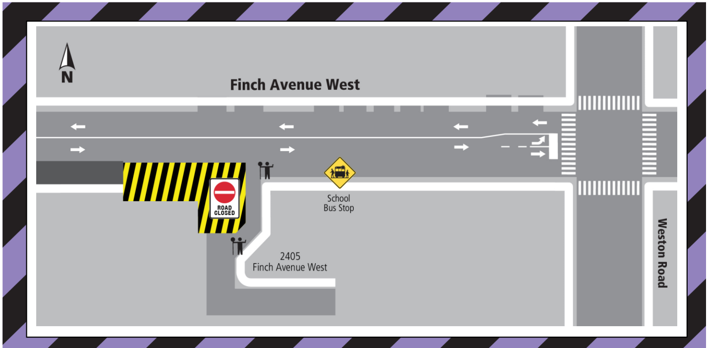
Figure 1 West side sidewalk closure - January 18-23