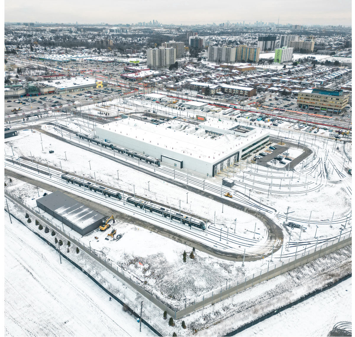
Photo: Aerial view of Maintenance and Storage Facility, looking southeast. 2022.12.22