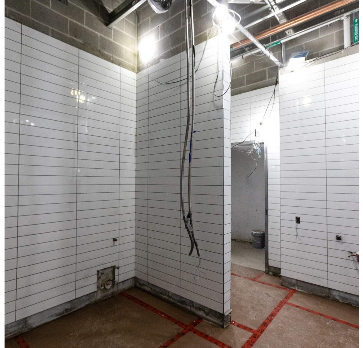
Photo: Internal view of Finch West Station, Architectural finishes. 2022.12.14