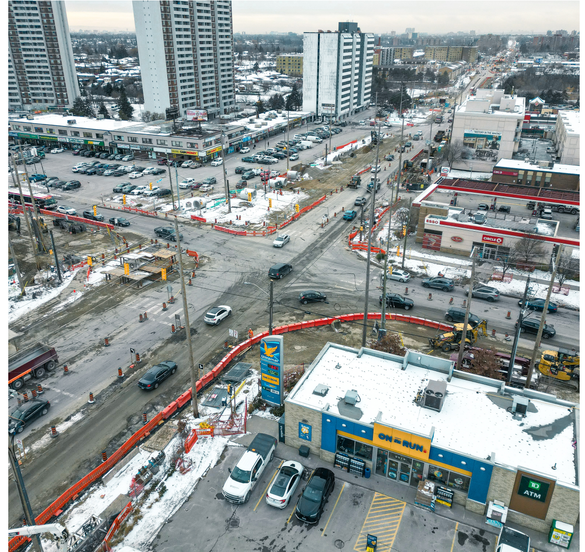
Photo: Aerial view of Weston Road and Finch Avenue West, looking west. 2022.12.22