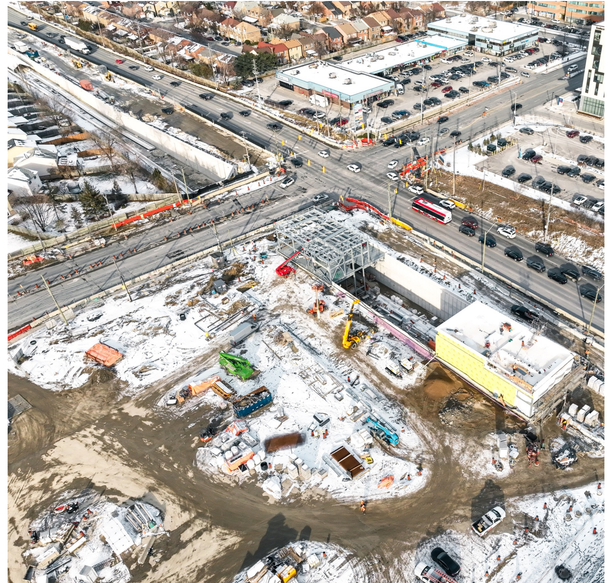
Photo: Aerial view of Humber College station, looking northeast. 2022.12.22