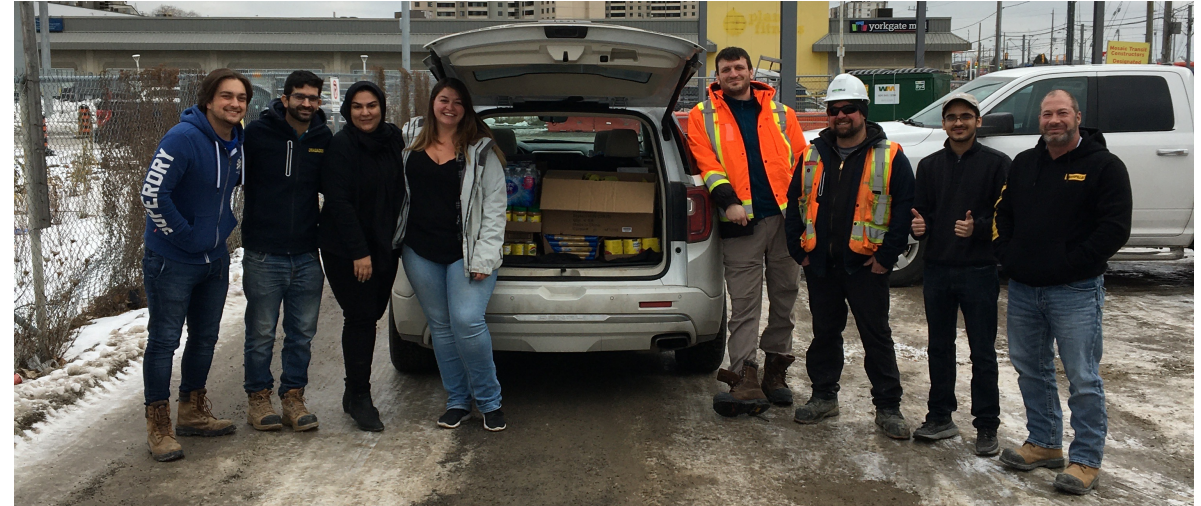
Photos: Mosaic Team collects food for local food bank donation December 2022.