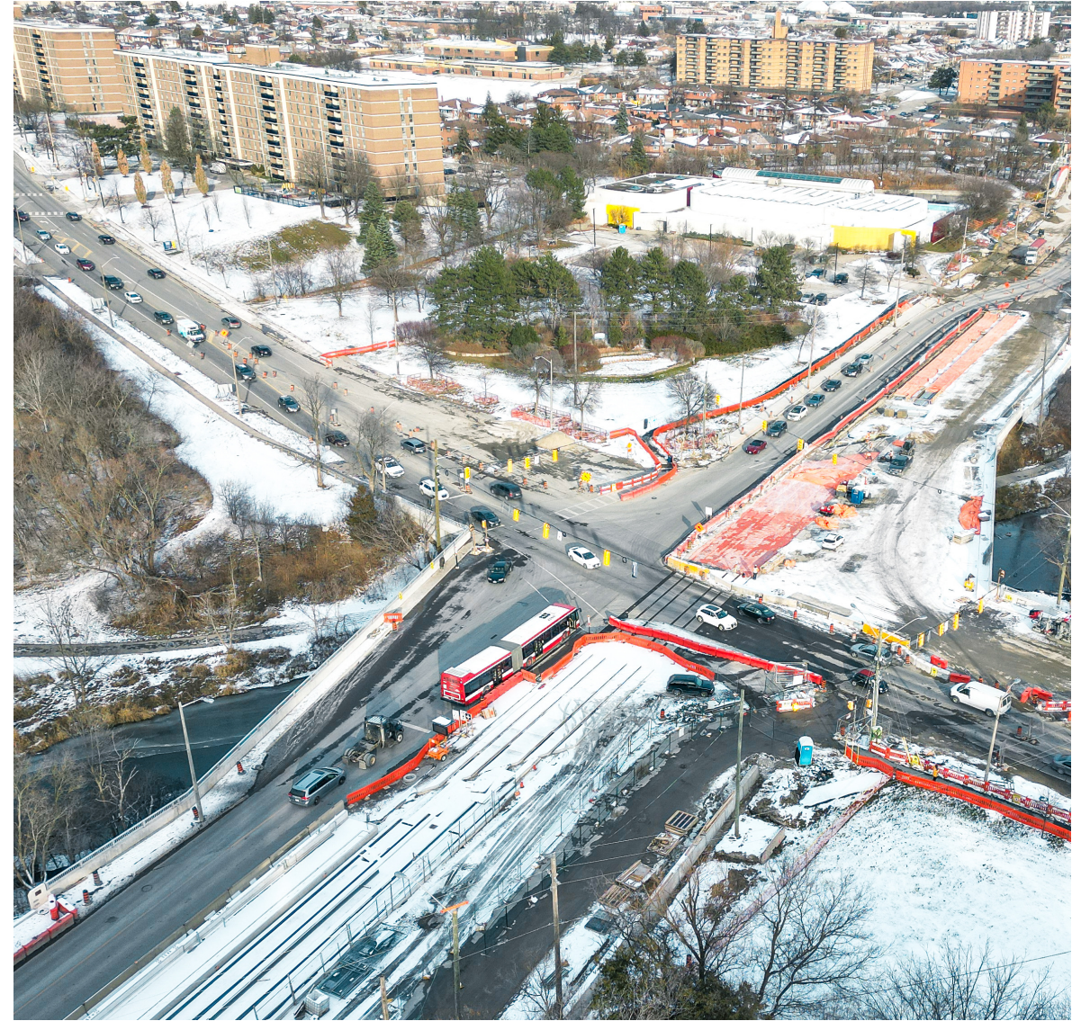
Photo: Aerial view of Finch Avenue West and Islington Avenue, looking east. 2022.12.22