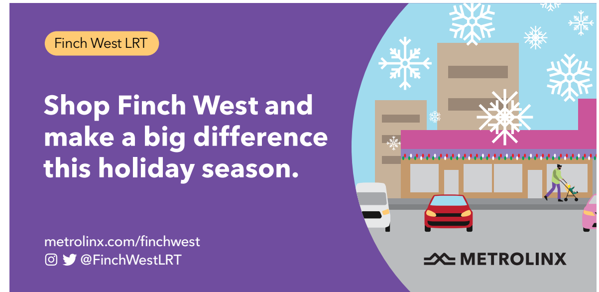
Photos: Downsview Advocate and North York Mirror Holiday Ads to support community shopping.