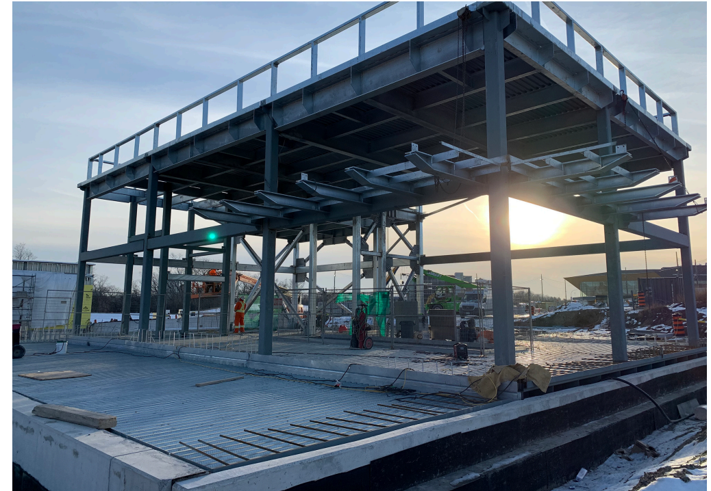
Photo: Humber College North building structural steel completed.