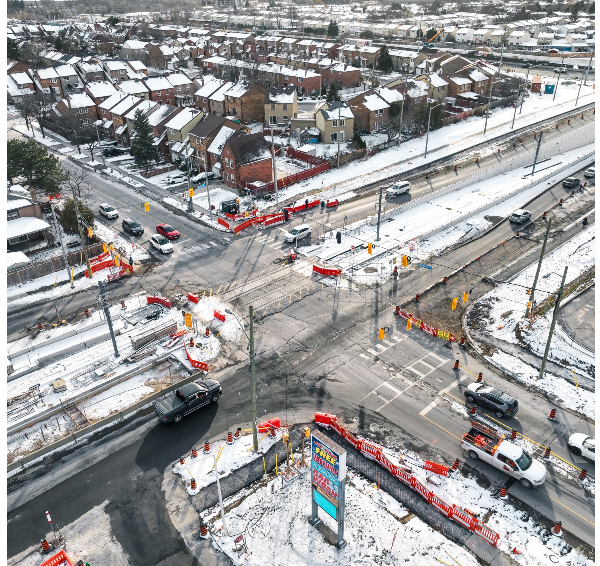
Photo: Aerial view of Finch Avenue West and Westmore Drive, looking east. 2022.12.22