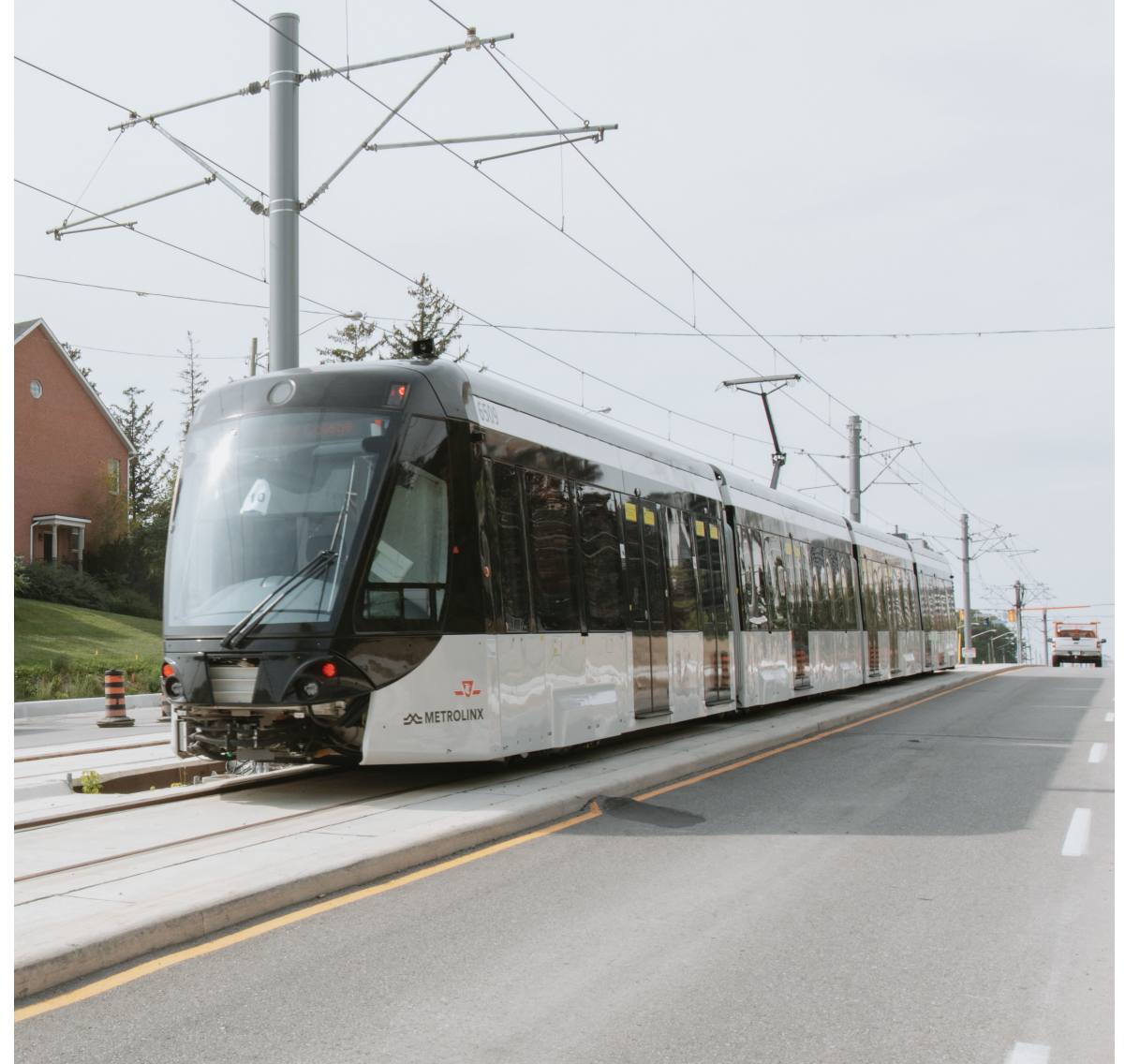
Photo: Light Rail Vehicle testing on the guideway. 2022.09.21