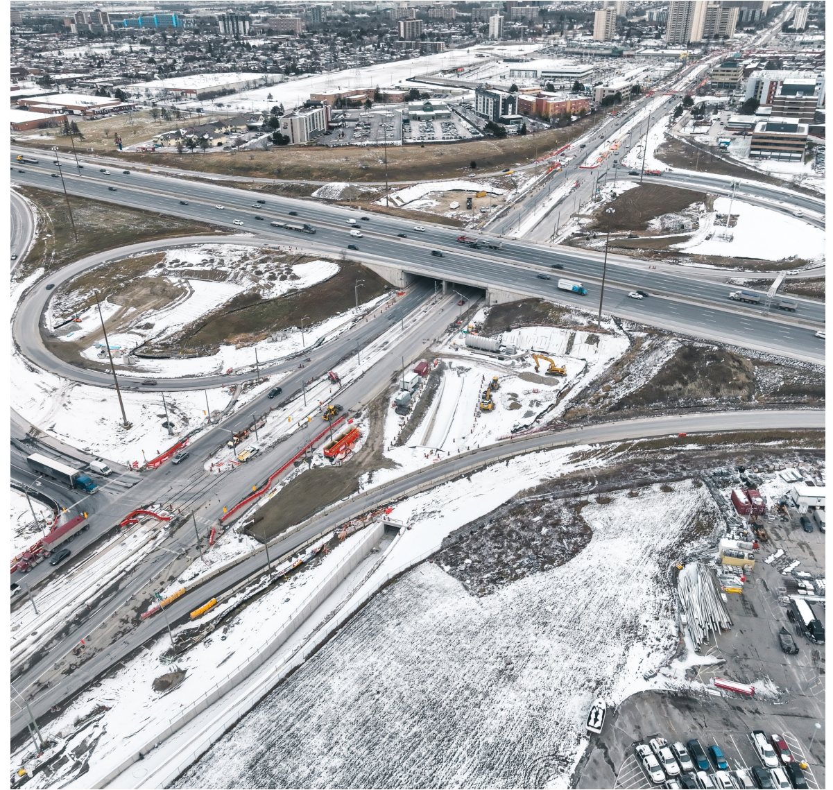
Photo: Highway 400 and Finch Avenue West, looking northeast. 2022.12.22