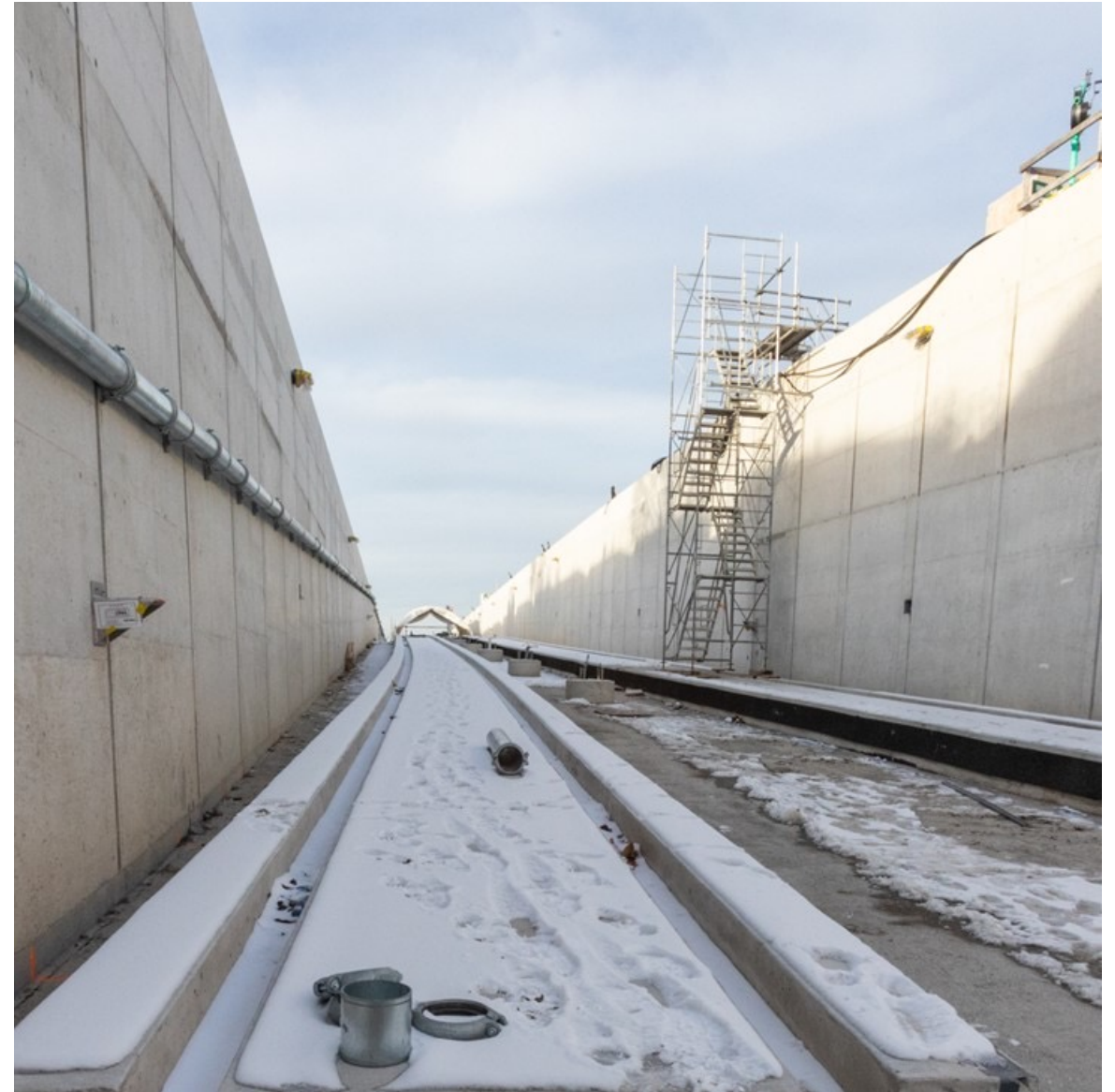
Photo: Humber College Station Portal Track slab . 2022.12.14