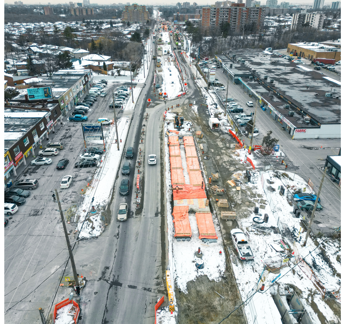
Photo: Aerial view of Finch Avenue West and Milvan Drive, looking west. 2022.12.22