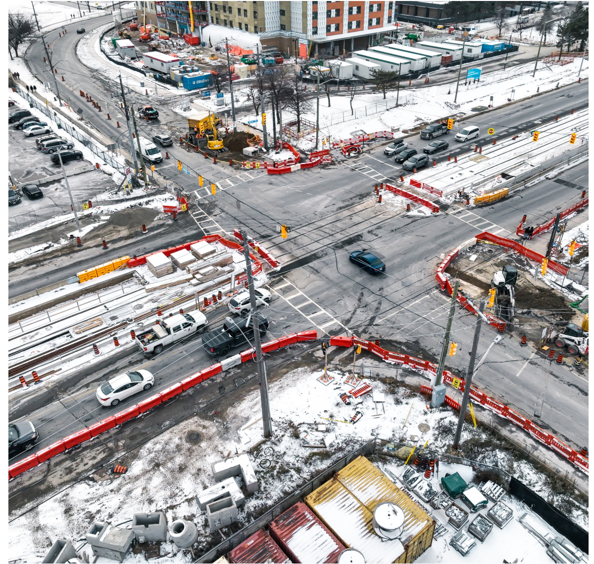
Photo: Aerial view of Norfinch Drive and Finch Avenue West, looking west. 2022.12.22