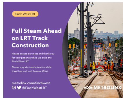
Photo: Newspaper ads.