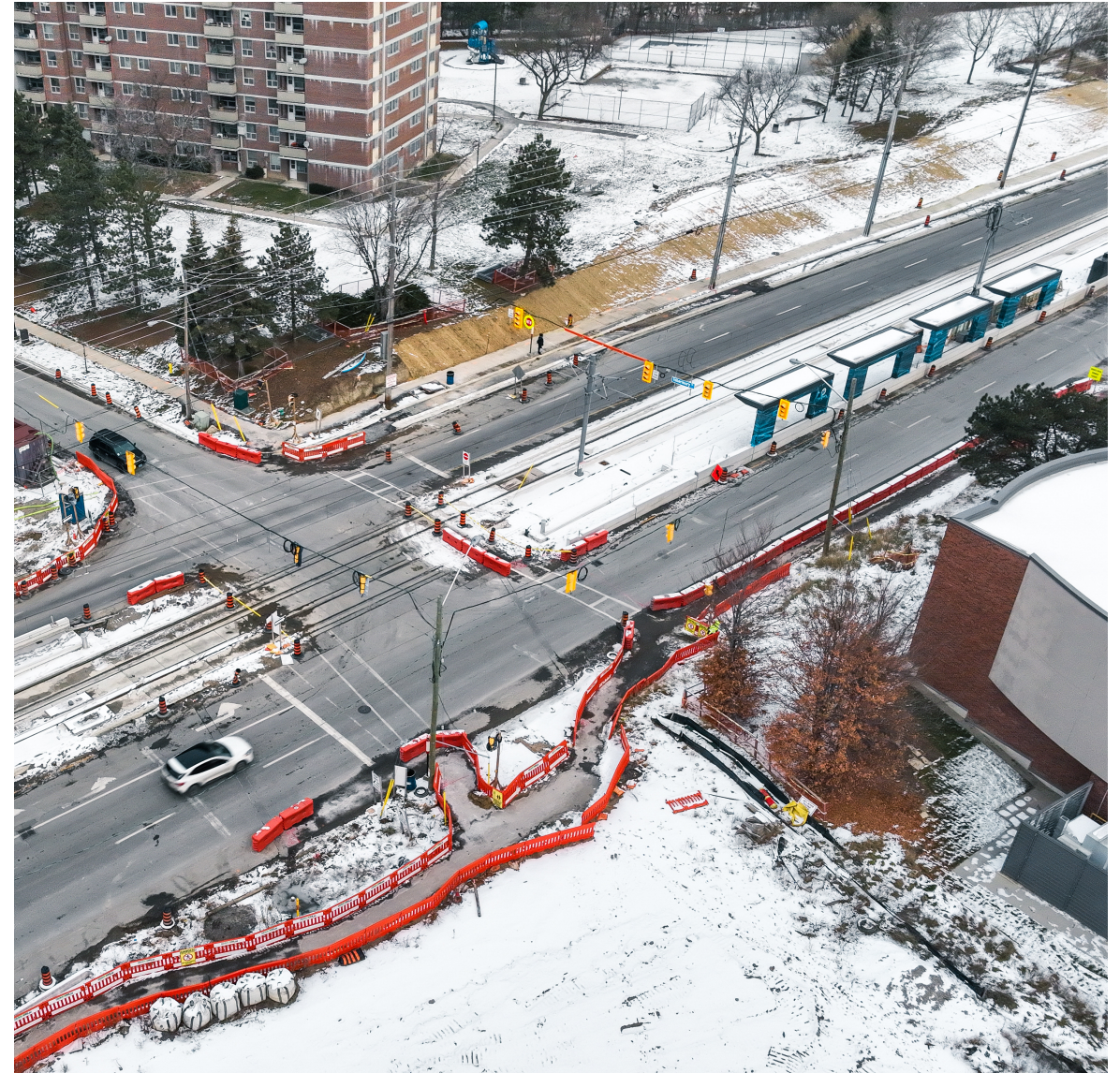
Photo: Aerial view of Finch West Avenue and Tobermory Drive, looking east. 2022.12.22