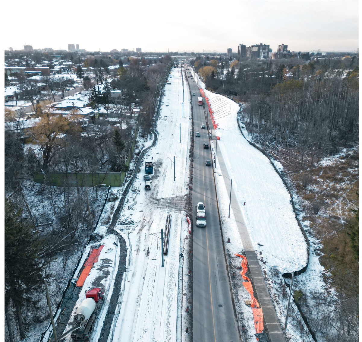
Photo: Finch Avenue West, between Islington and Kipling Avenues, looking west. 2022.12.22