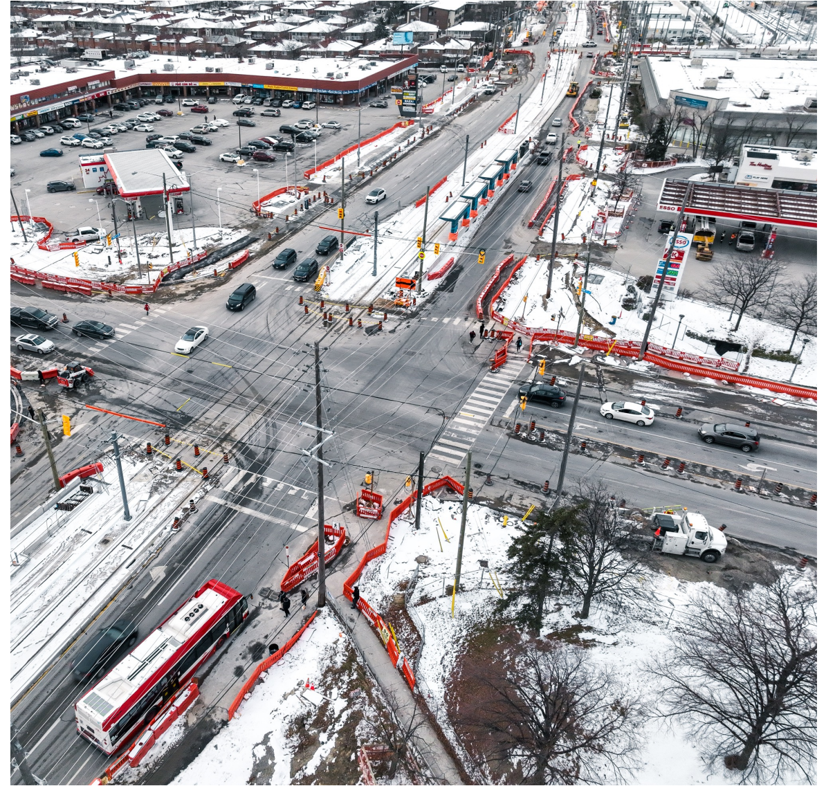
Photo: Aerial view of Finch West Avenue and Jane Street, looking west. 2022.12.22