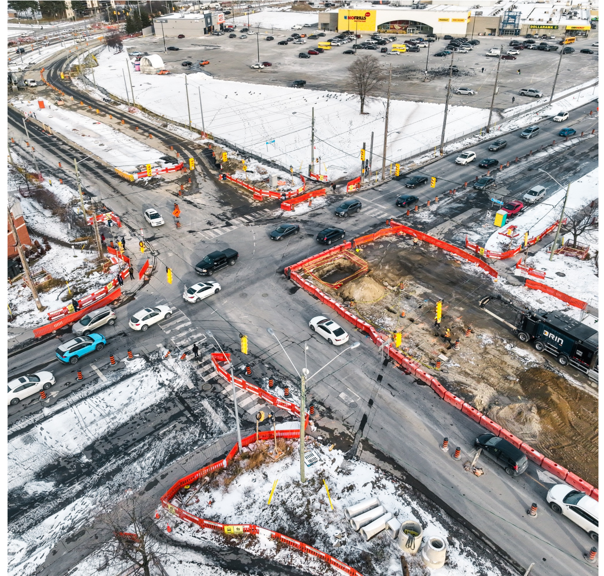
Photo: Aerial view of Finch Avenue West and Albion Road, looking southeast. 2022.12.22