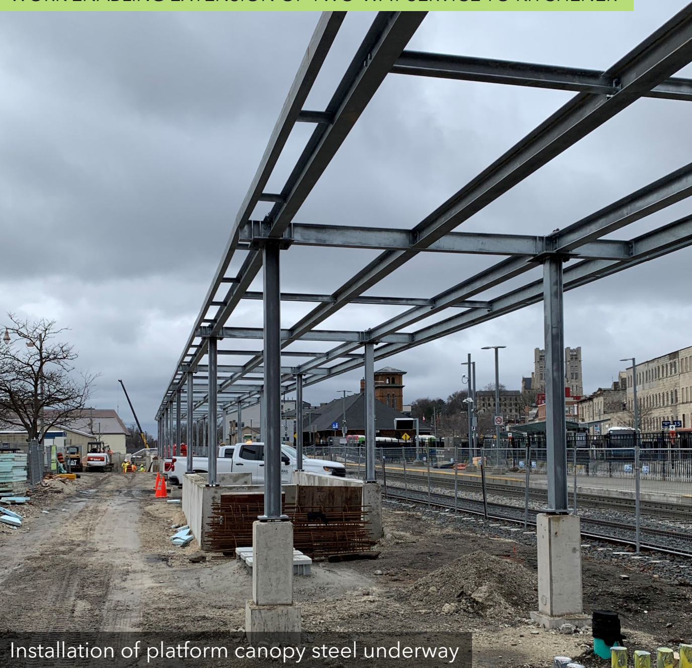
Installation of platform canopy steel underway