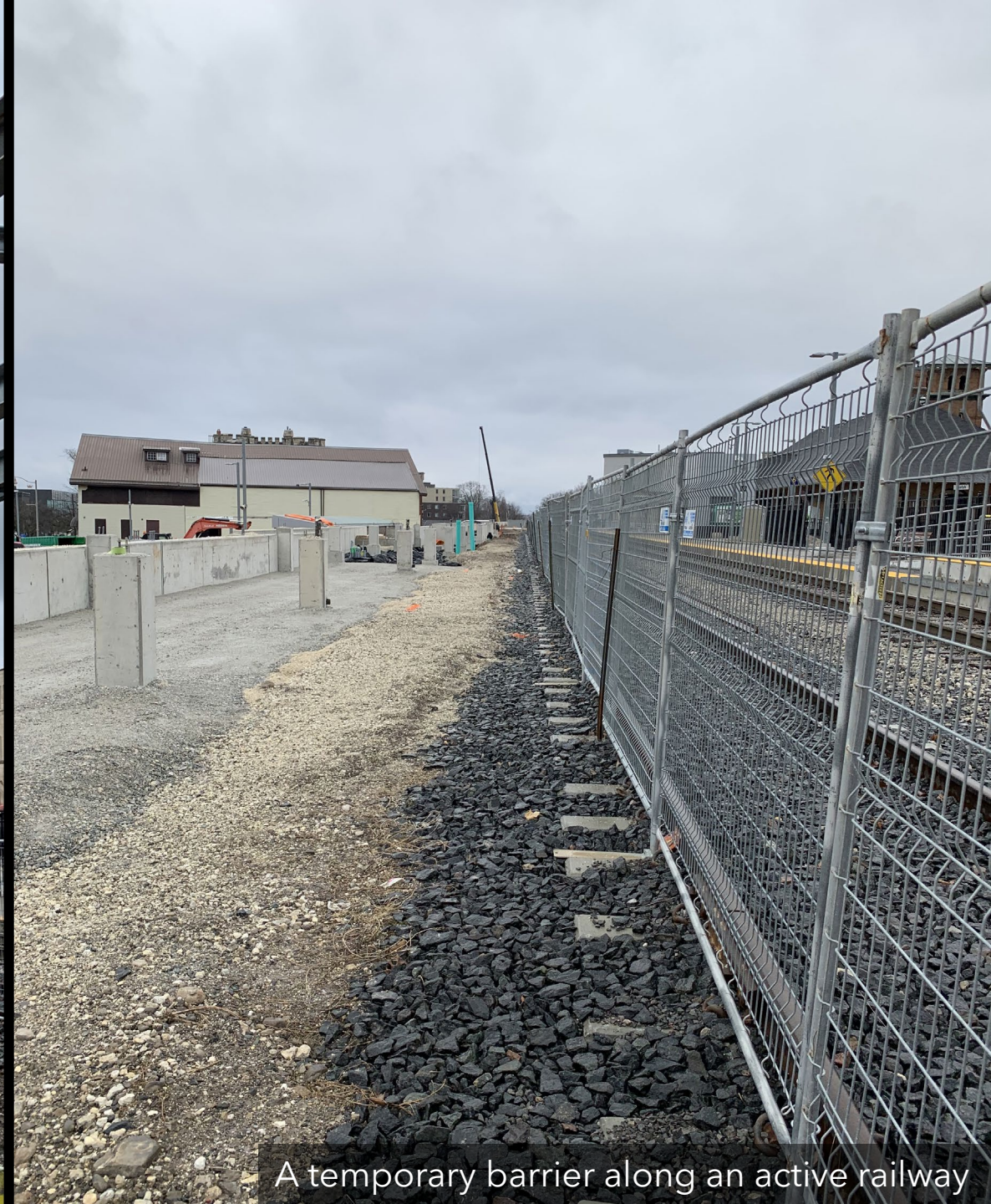
A temporary barrier along an active railway