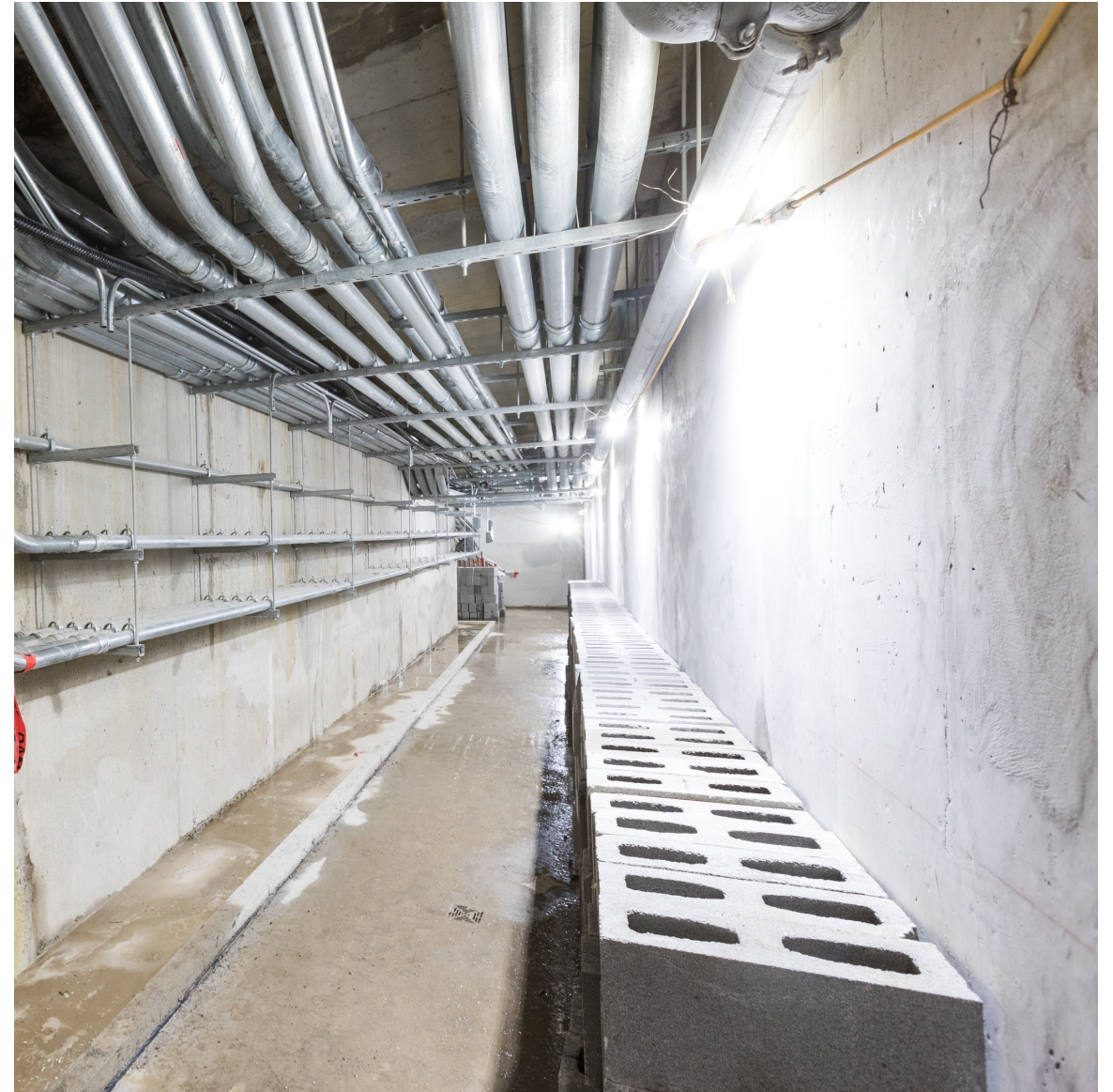
Photo: Internal view of Finch West Station. 2023.01.25