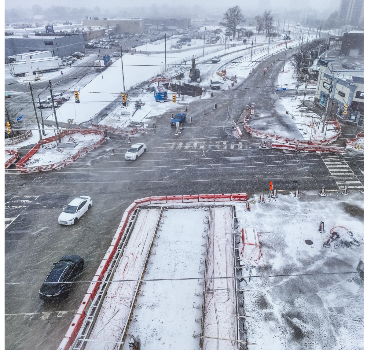
Photo: Finch Avenue west and Kipling Avenue, Aerial view, Looking West, 2023.01.25