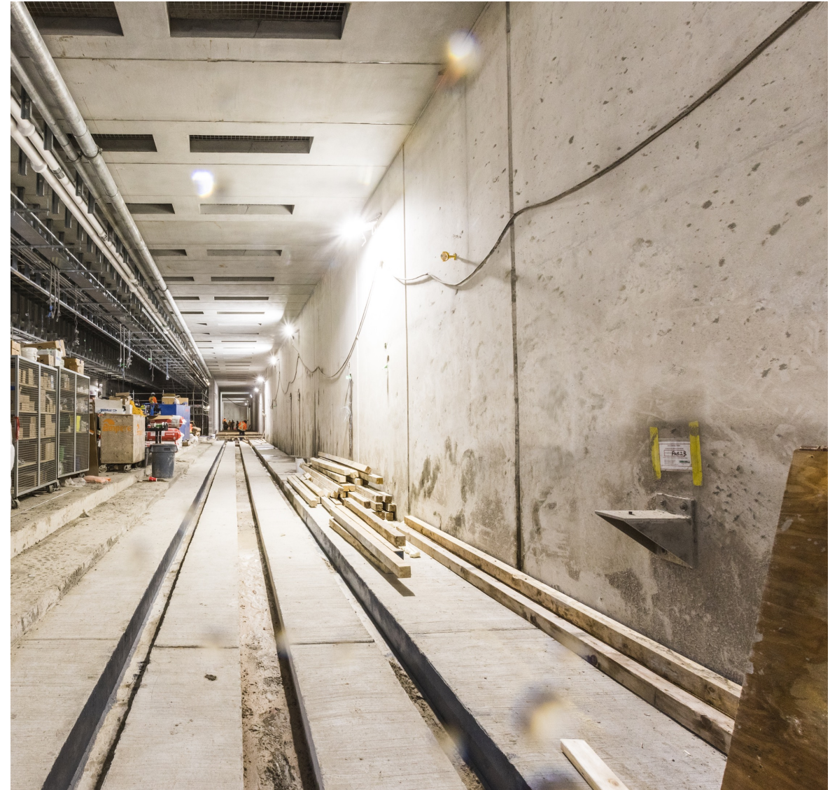
Photo: Internal view of Finch West Station, Track work, 2023.01.25