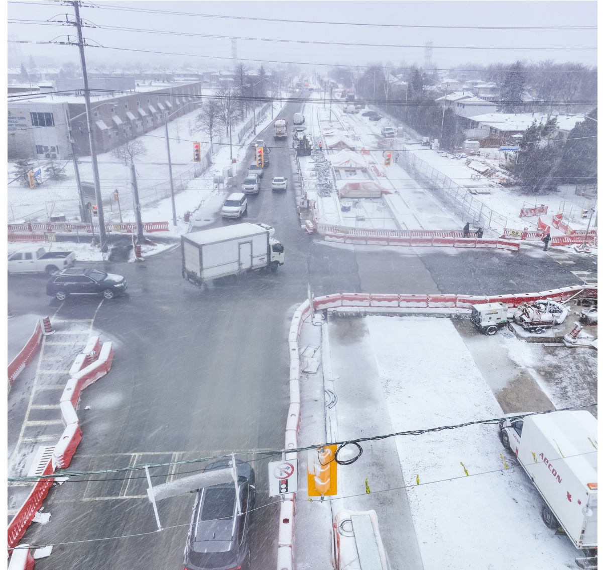
Photo: Finch Avenue West and Martin Grove Drive, Aerial view, Looking West, 2023.01.25