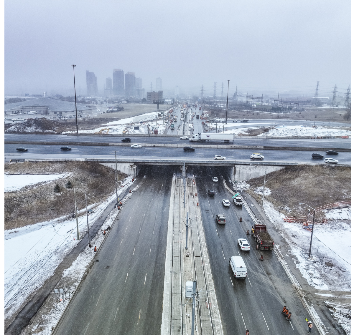
Photo: Highway 400 and Finch Avenue West, Aerial view, Looking West, 2023.01.25