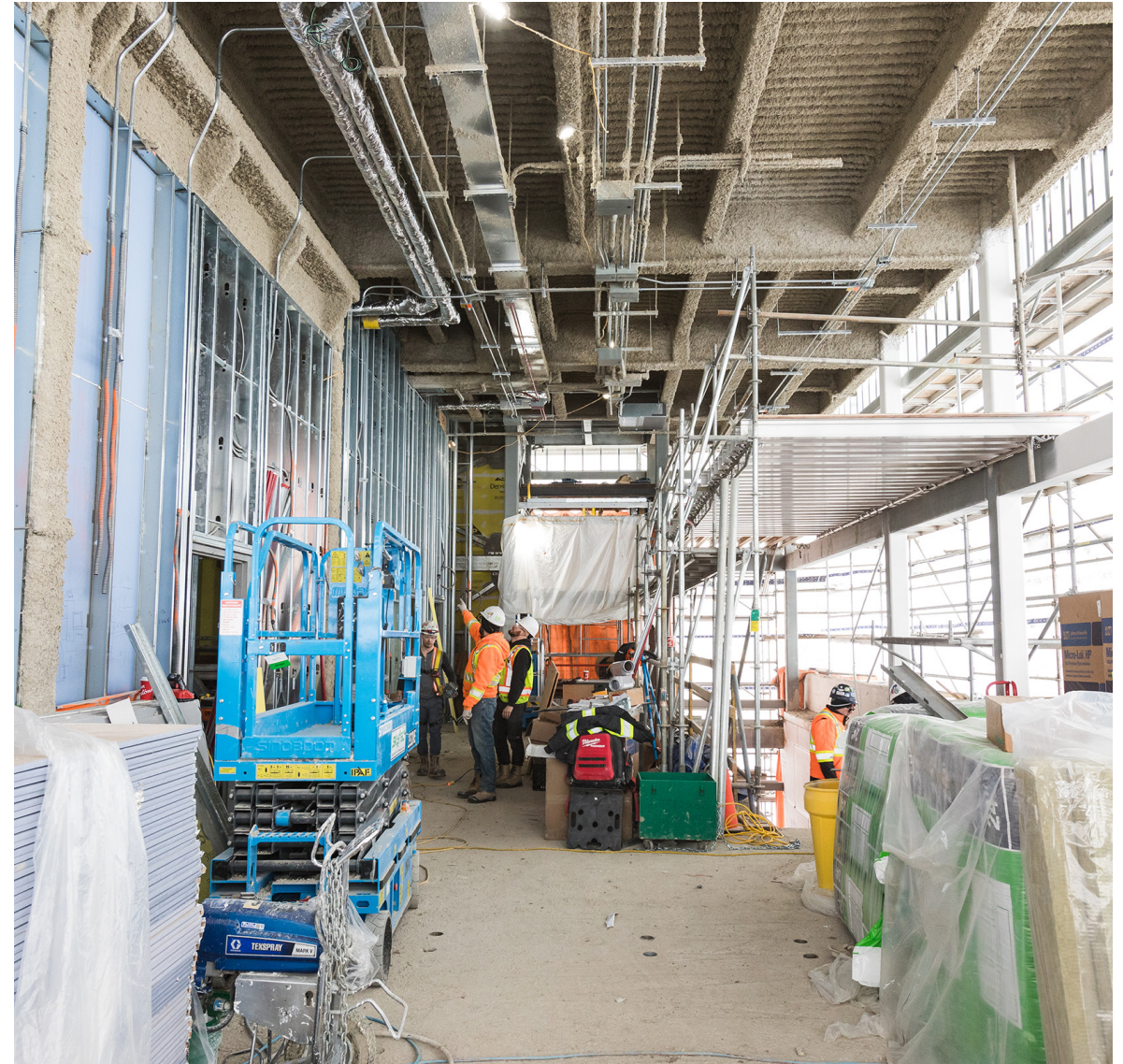
Photo: Team working on interior at Humber College station