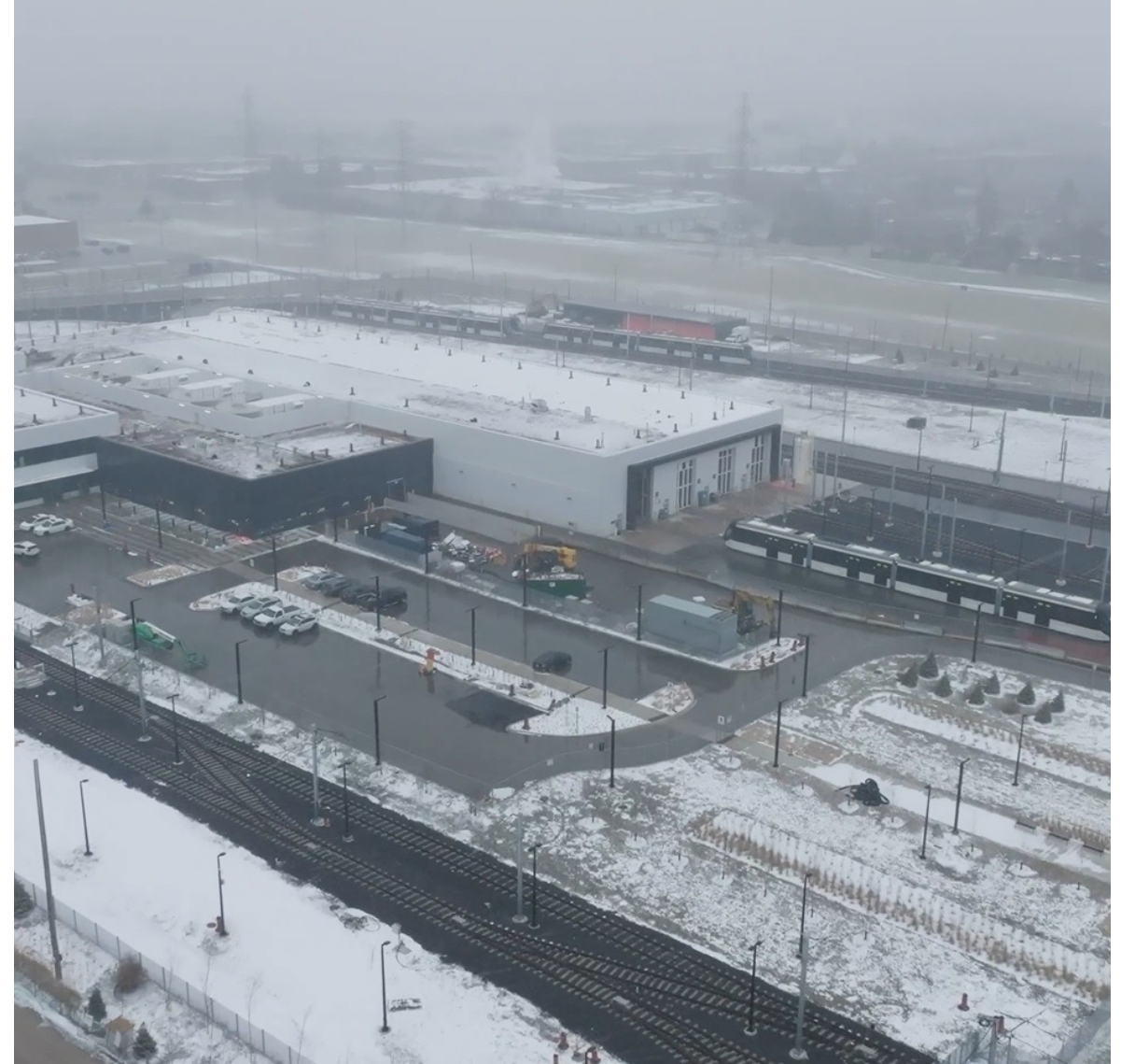
Photo: Maintenance and Storage Facility, Aerial view, Looking Northwest, 2023.01.25