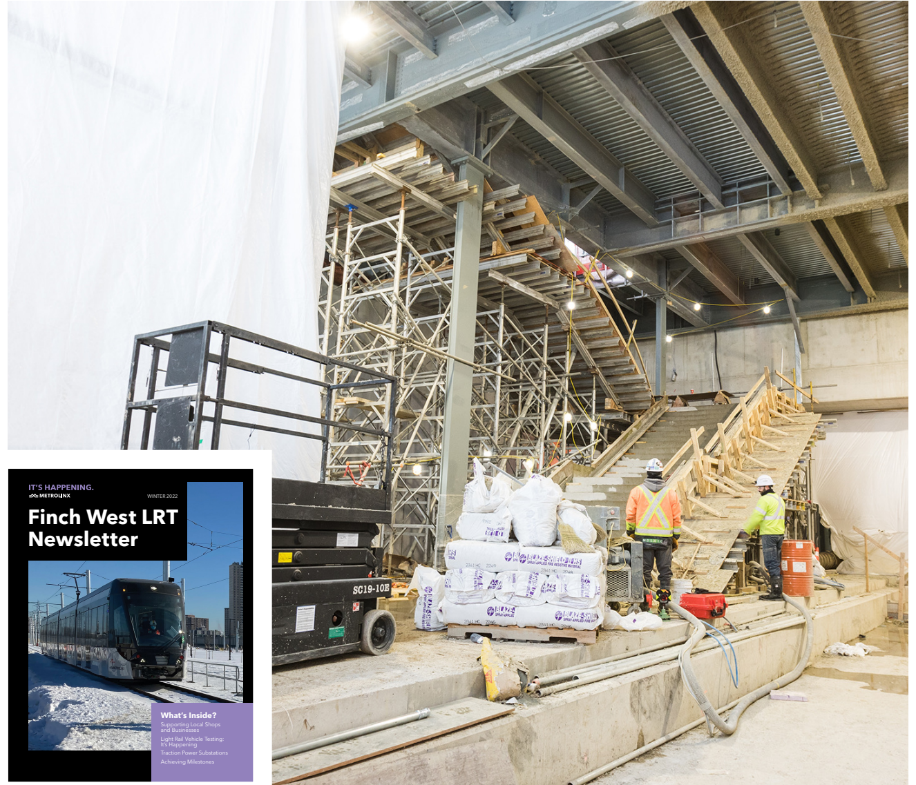
Photo: (L-R) Metrolinx newsletter, photo of Humber College Station video update.