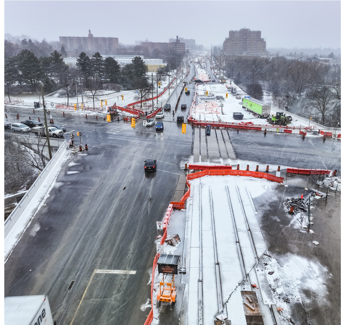
Photo: Finch Avenue West and Islington Avenue, Aerial view, Looking East, 2023.01.25