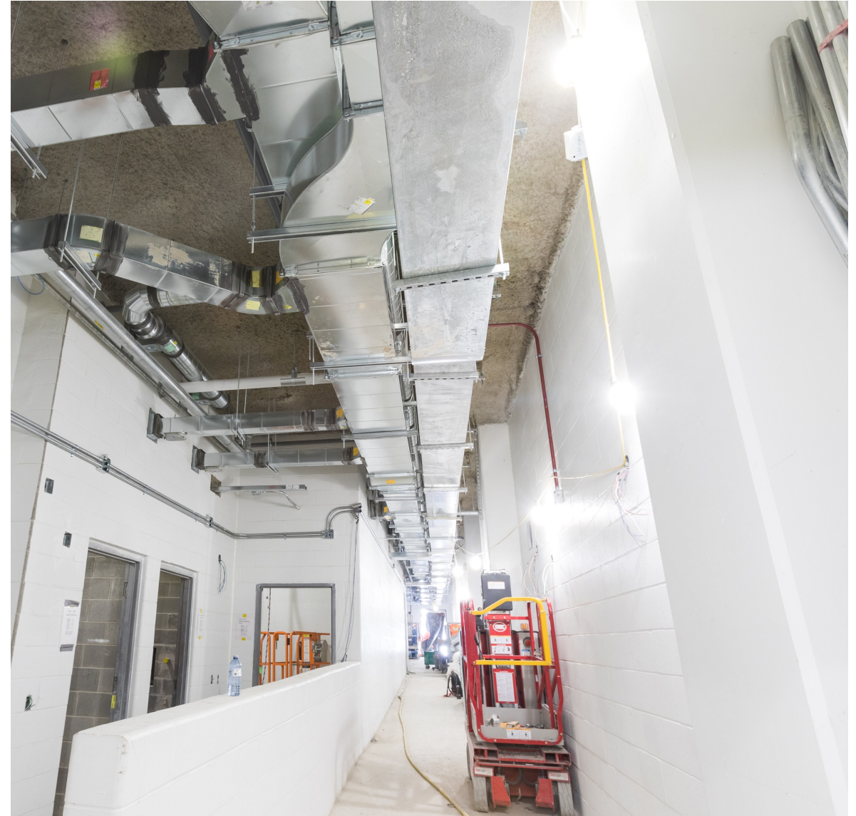
Photo: Humber College station, Internal view, 2023.01.25