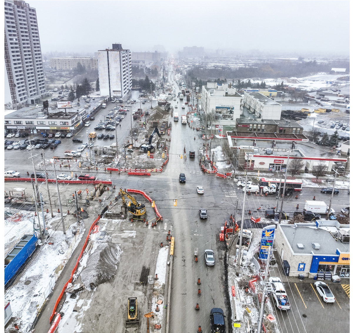
Photo: Finch Avenue West and Weston Road, Aerial view, Looking West, 2023.01.25