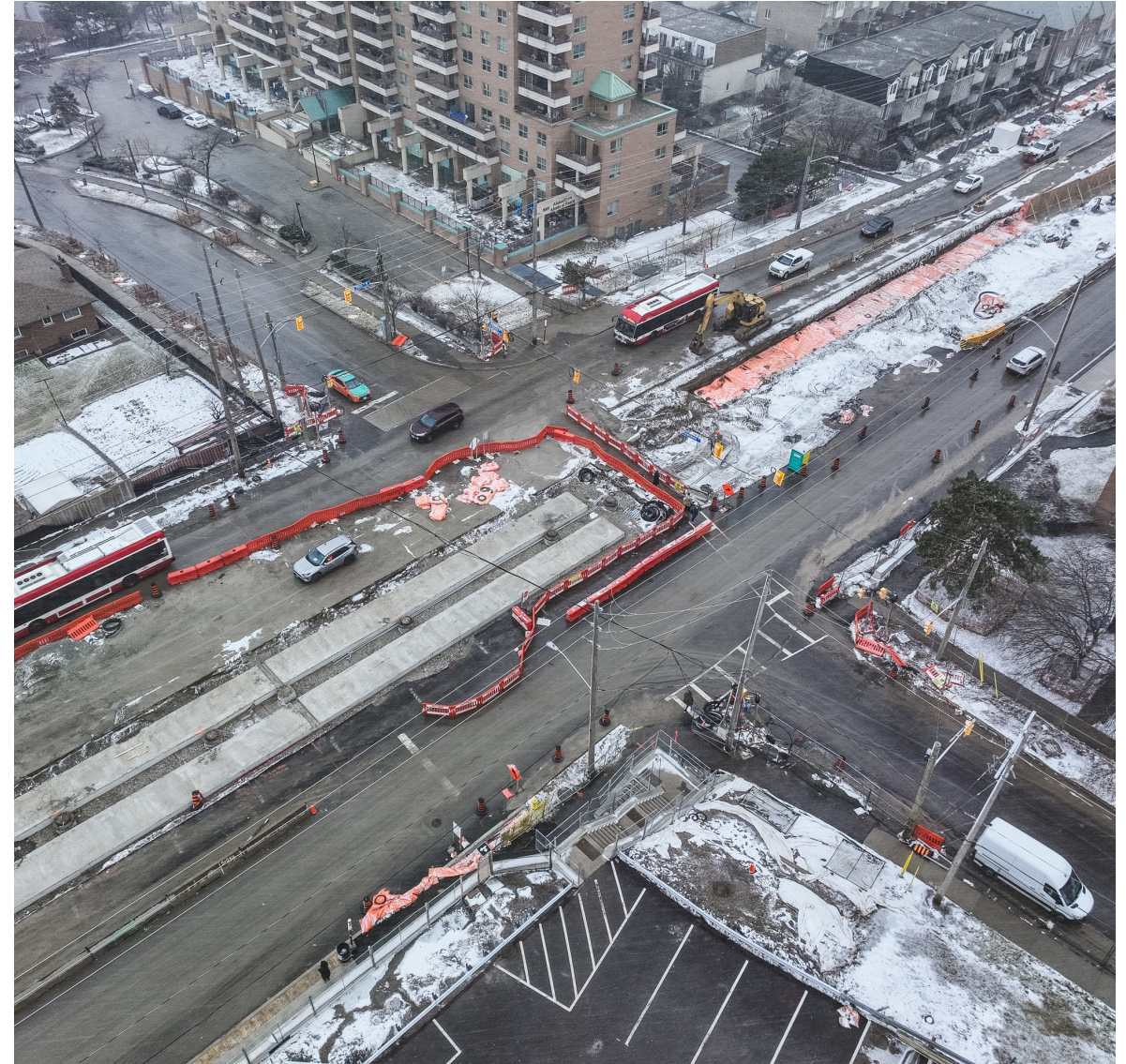
Photo: Finch Avenue West and Pearldale Avenue, Aerial view, Looking Southwest, 2023.01.25