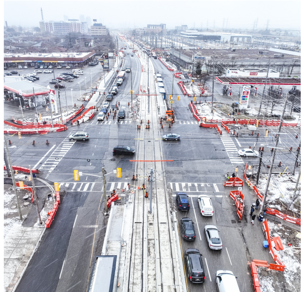
Photo: Finch West Avenue and Jane Street, Aerial view, Looking West, 2023.01.25