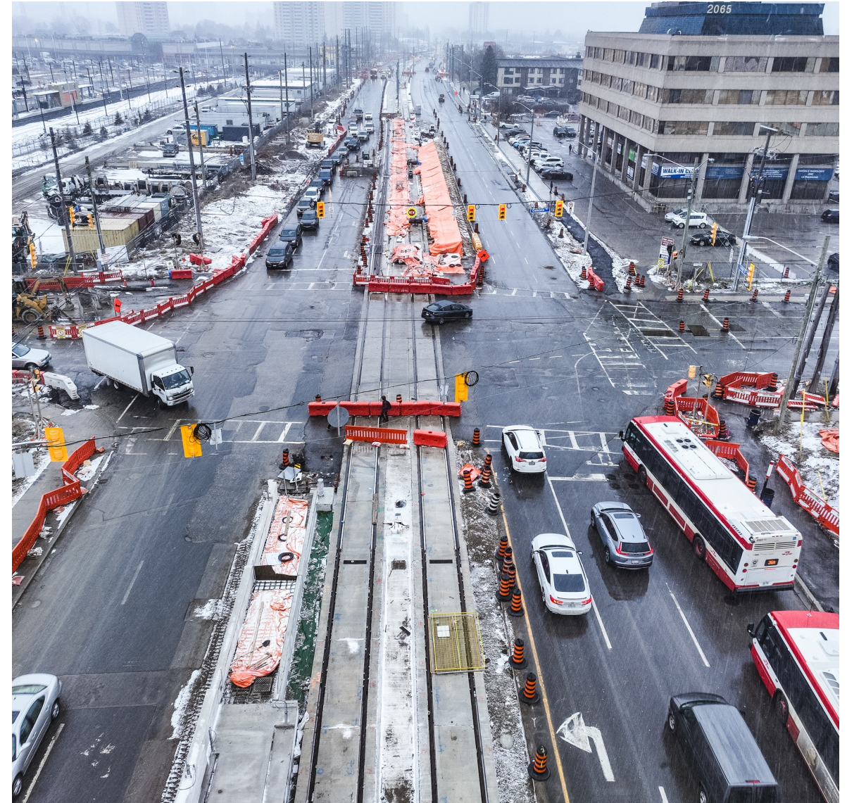
Photo: Finch Avenue West and Norfinch Drive, Aerial view, Looking East, 2023.01.25