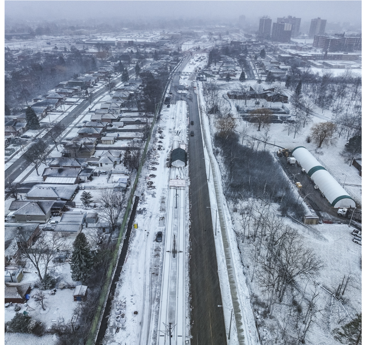
Photo: Between Islington and Kipling Avenue, Aerial view, Looking West, 2023.01.25