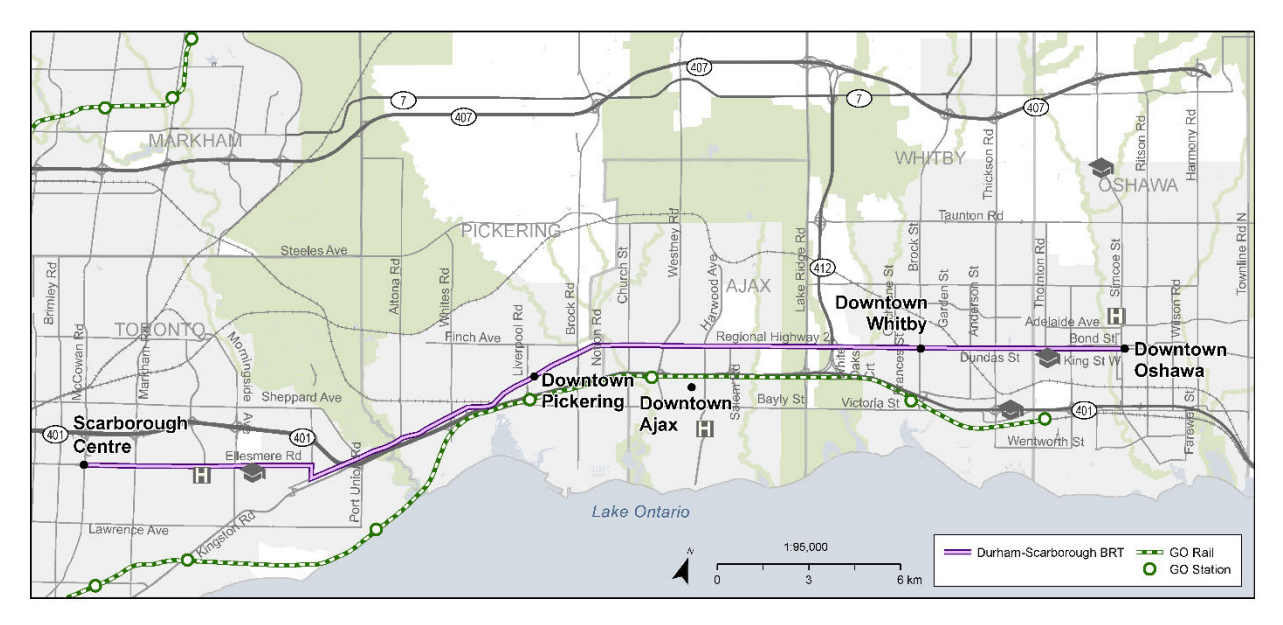
Exhibit 1: Corridor