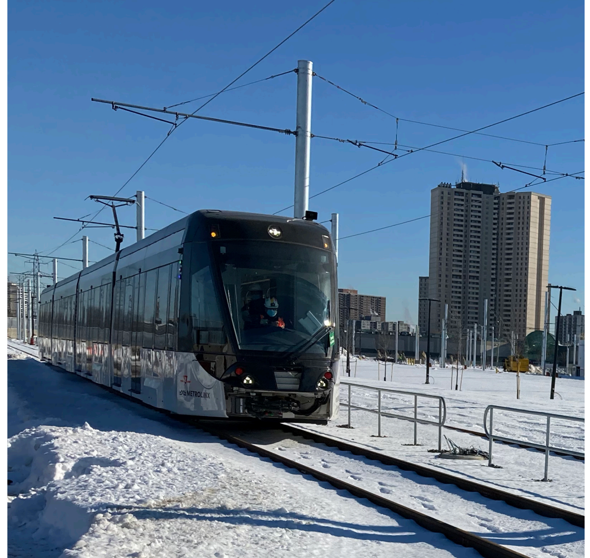
Photo: Light Rail Vehicle testing in Maintenance and Storage Facility yard. 2022.01.21