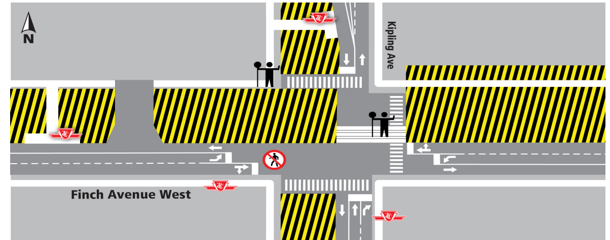
Photo: Finch Avenue west and Kipling Avenue intersection Traffic Configuration