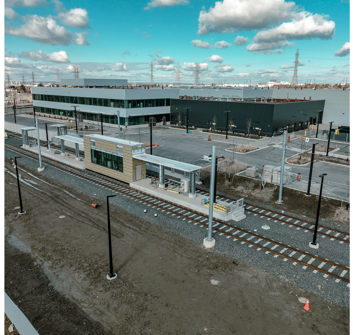
Photo: Maintenance and Storage Facility, Aerial view building entrance and Handover platform, 2023.02.20