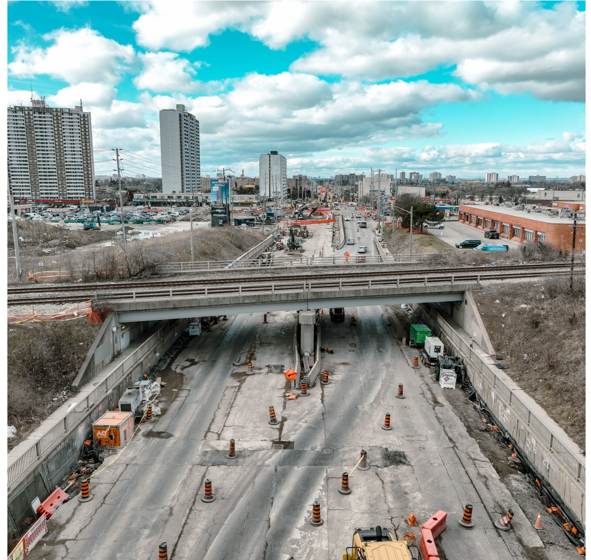
Photo: Finch Avenue West, Between Signet Drive and Weston Road, Looking West, 2023.02.20