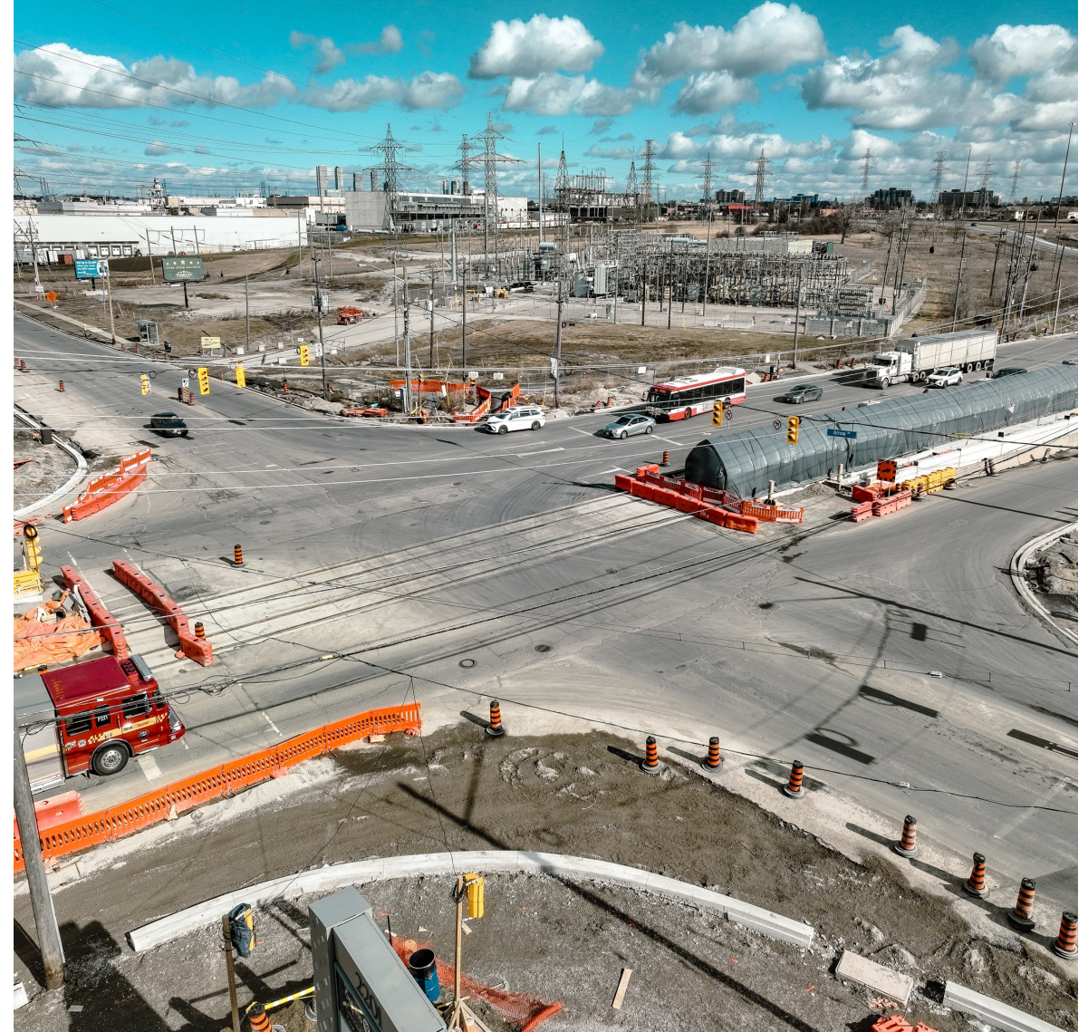
Photo: Finch Avenue West and Norfinch Drive, Aerial view, Looking Northeast, 2023.01.20