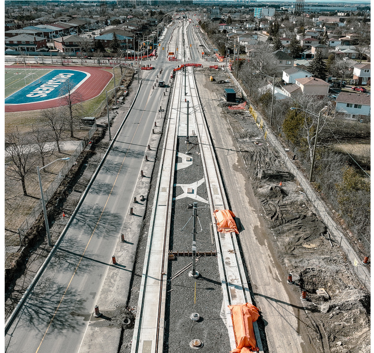
Photo: Finch Avenue West, Between Martin Grove Drive and Silverstone Avenue, Aerial view, Looking West, 2023.02.20