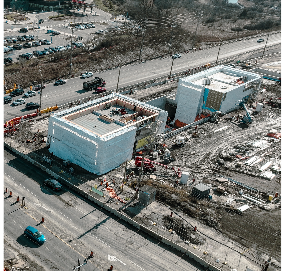
Photo: Humber College station, Aerial view, Looking Southwest, 2023.02.28