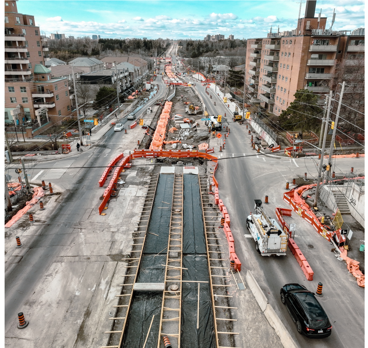
Photo: Finch Avenue West and Pearldale Avenue, Aerial view, Looking West, 2023.02.20