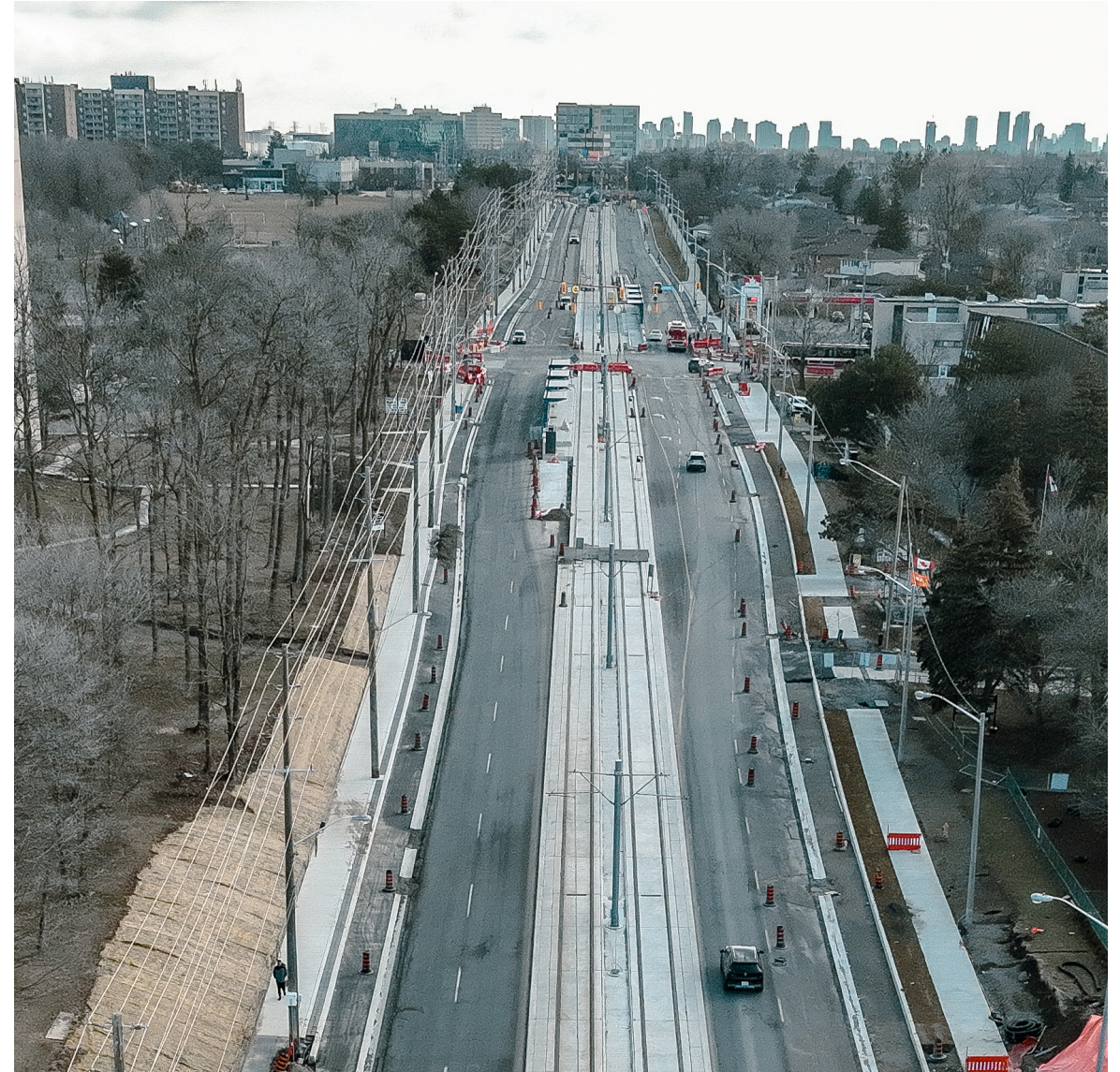
Photo: Finch West Avenue and Sentinel Road, Aerial view, looking east, 2023.02.20