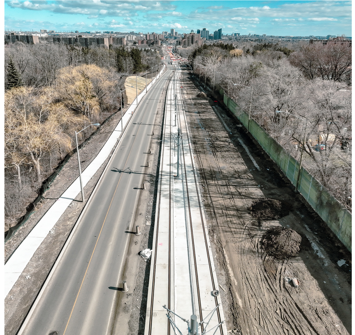
Photo: Between Islington and Kipling Avenue, Aerial view, Looking East, 2023.02.20