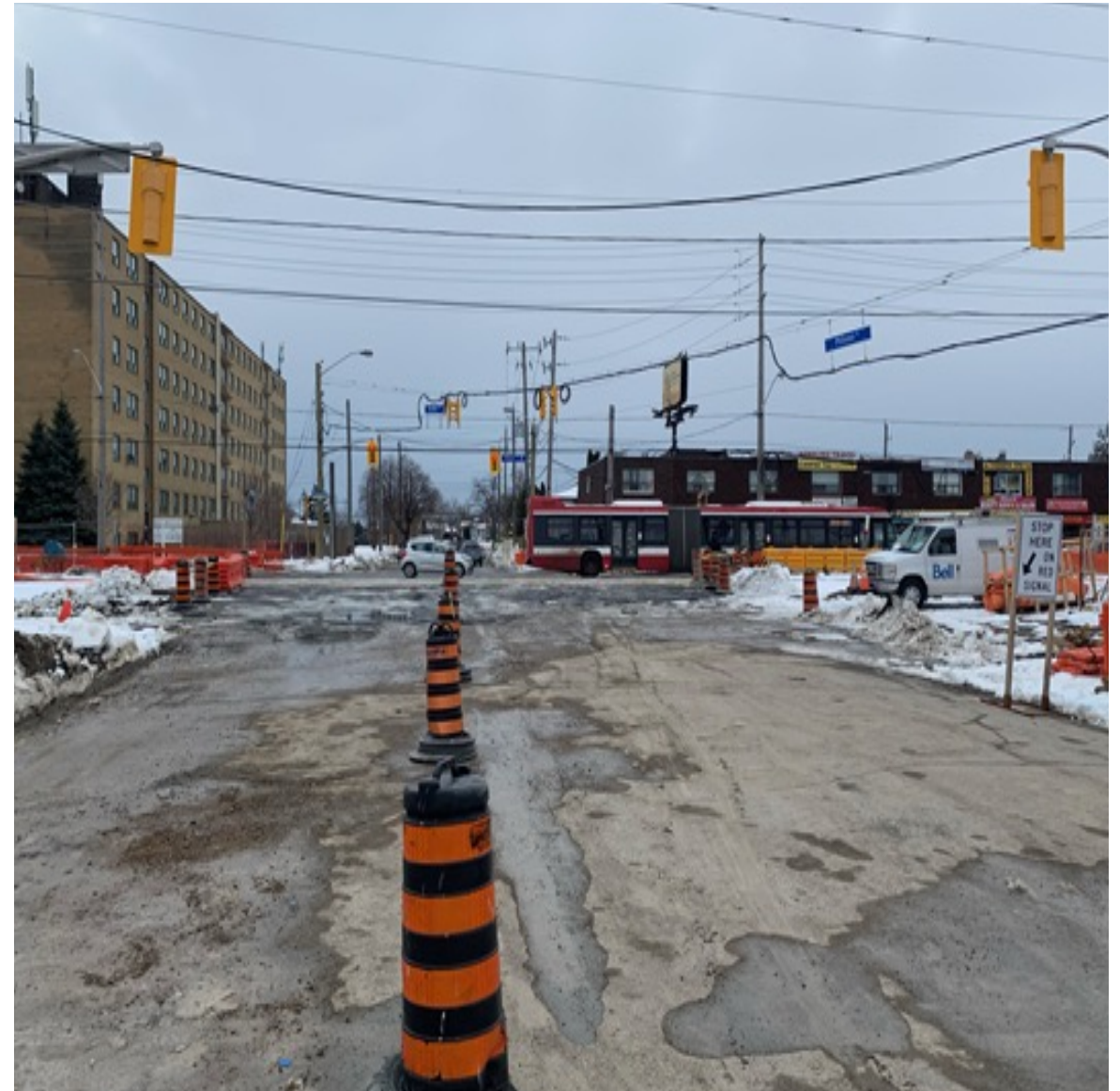
Photo: Milvan Road, Looking South. 2023.03.06