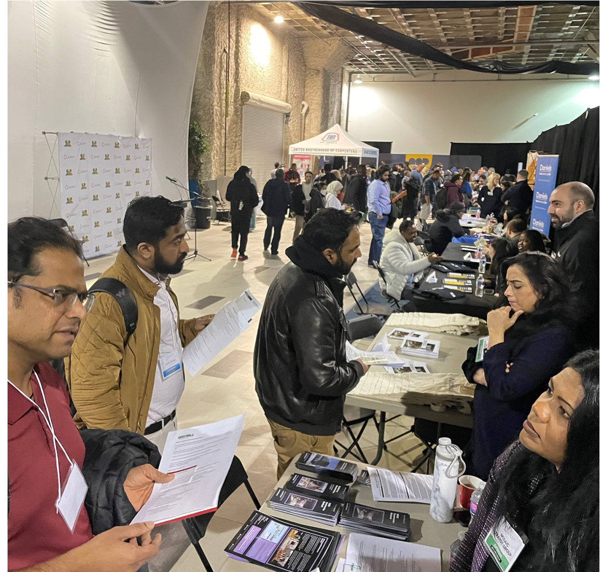
Photo: Employment information sessions with TCBN and ACCES Employment, February 2023.