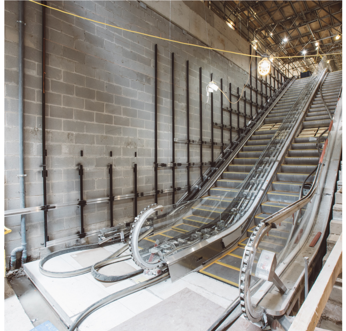
Photo: Internal view of Finch West Station, Escalators, 2023.02.28