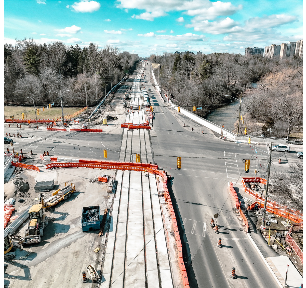
Photo: Finch Avenue West and Islington Avenue, Aerial view, Looking West, 2023.02.20