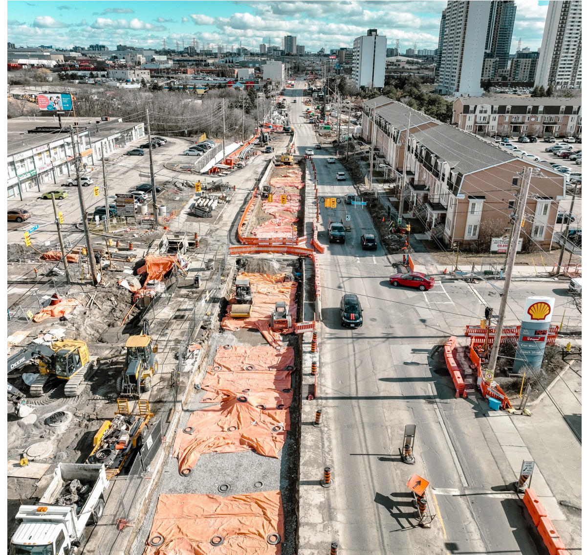
Photo: Finch Avenue West and Jayzel Drive, Aerial view, Looking East, 2023.02.20