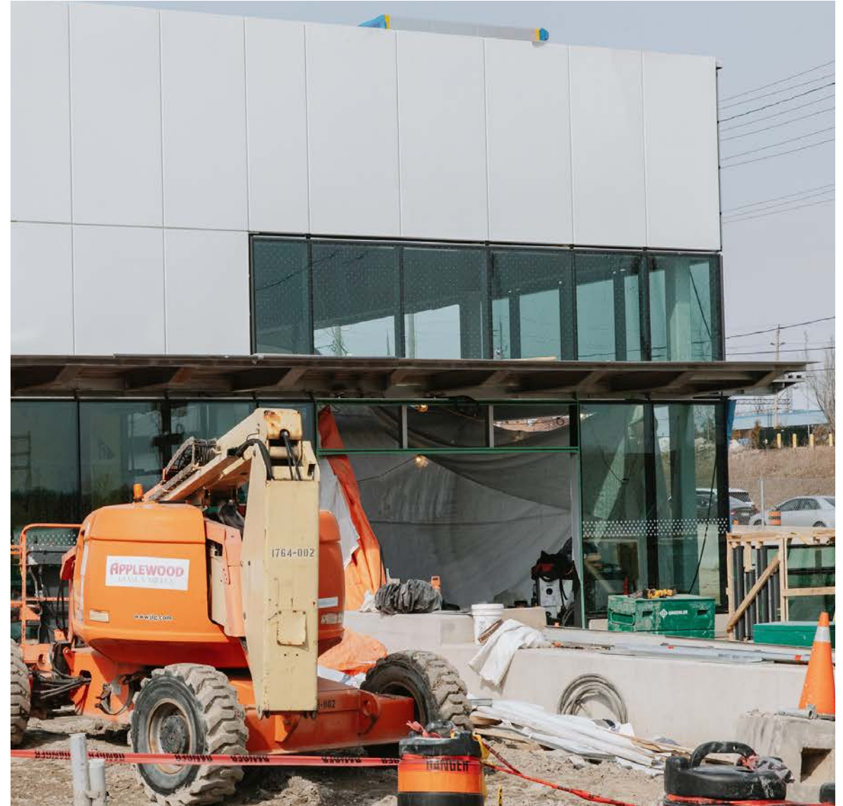
Photo: Humber College Station, South Building. 2023.03.17