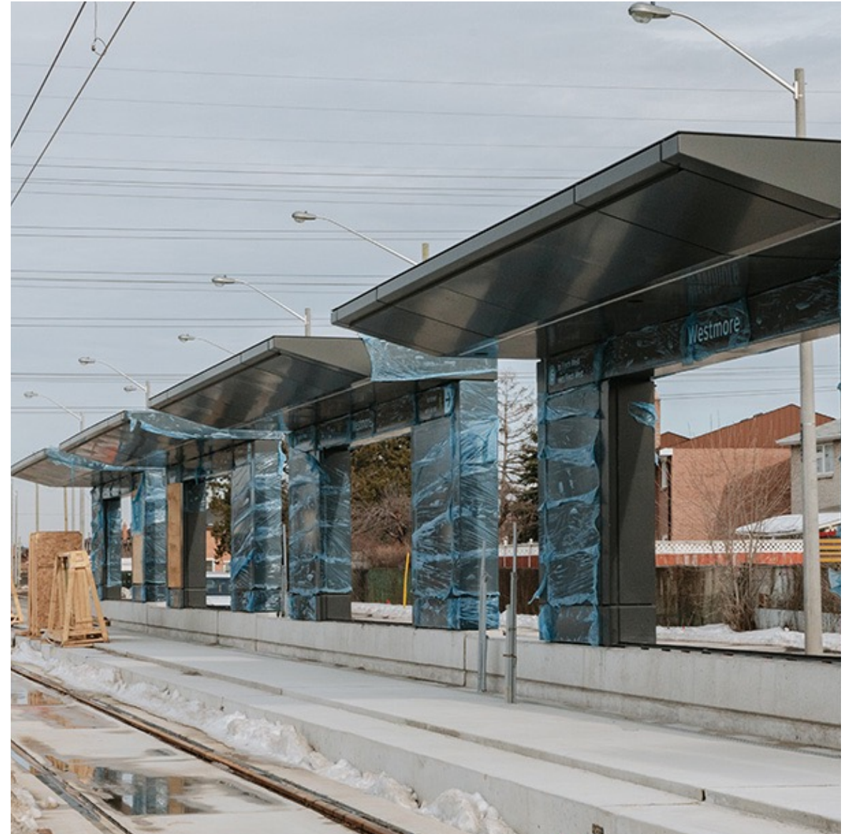
Photo: Westmore Intersection Westbound Stop. 2023.03.17