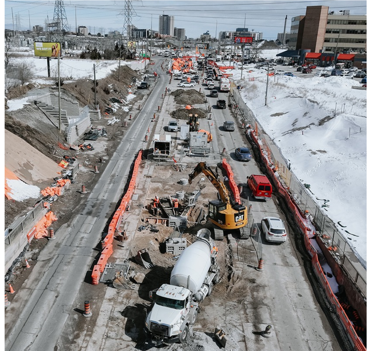
Photo: Finch Avenue West and CP Bridge, Looking West. 2023.03.16