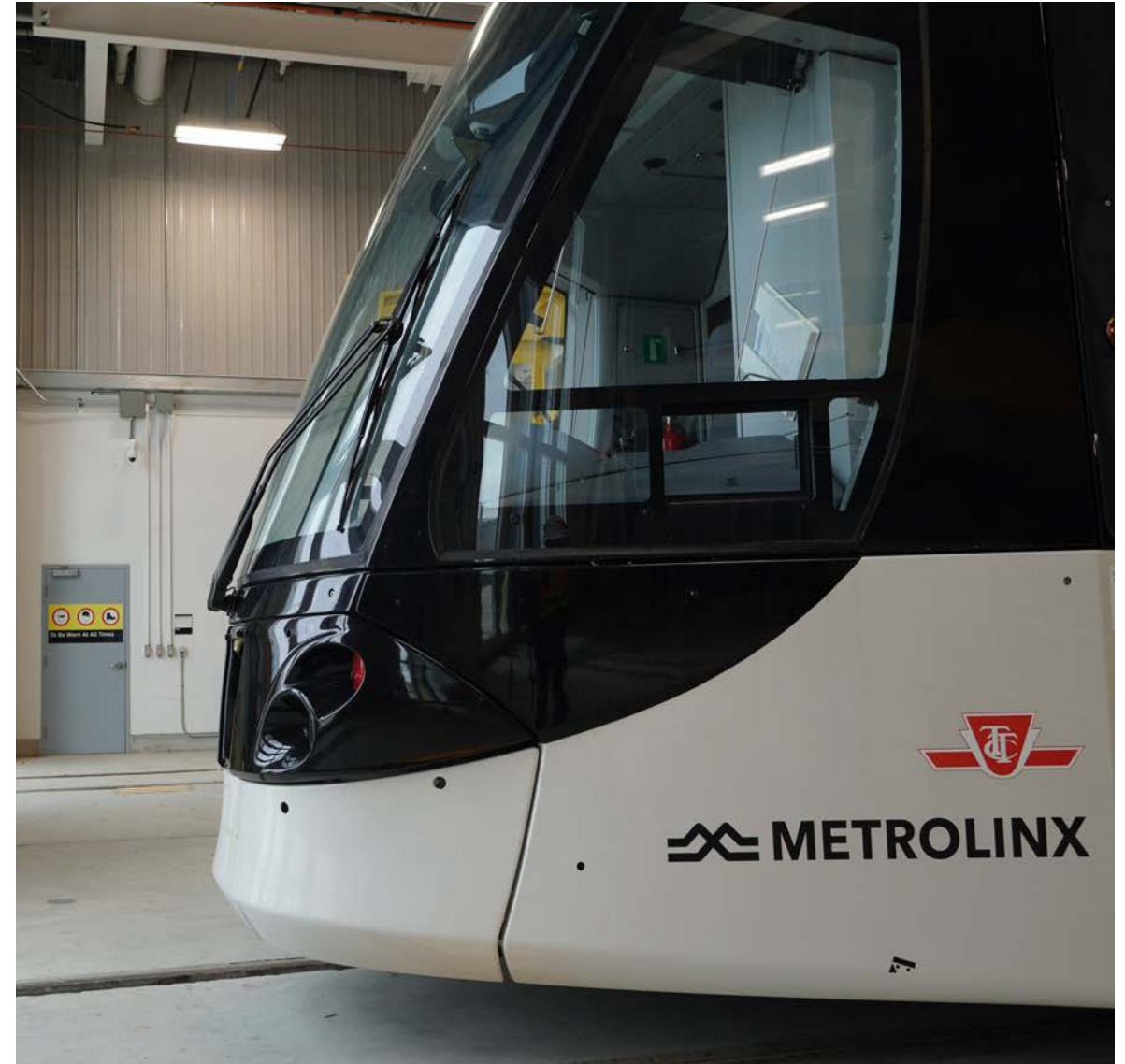
Photo: Light Rail Vehicle in Maintenance & Storage Facility. 2023.03.22