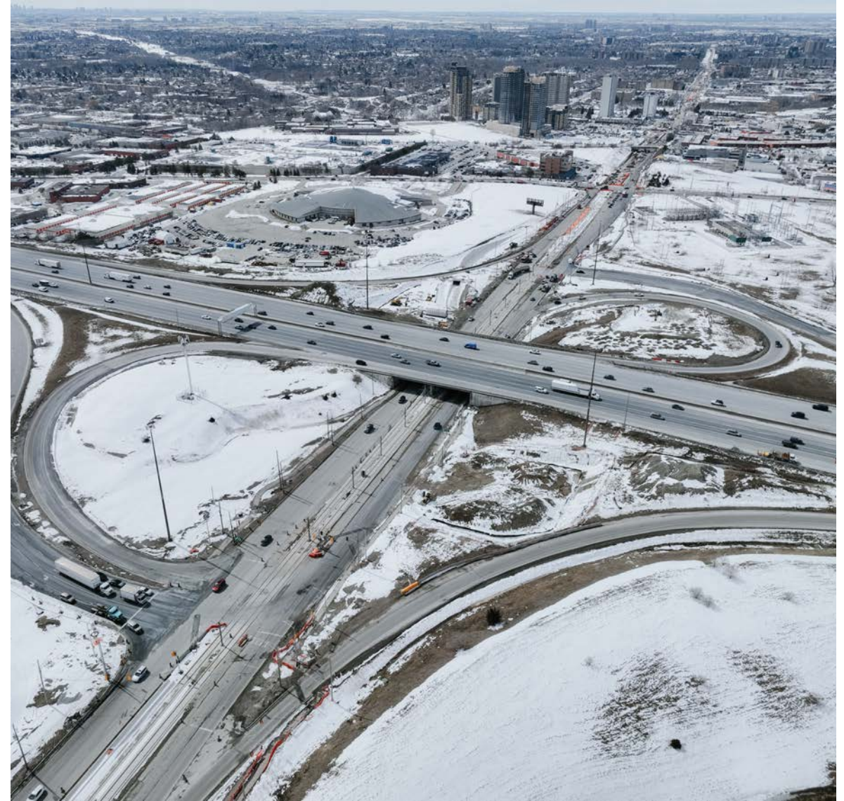
Photo: Aerial view of Finch Avenue West and Highway 400, Looking West. 2023.03.16