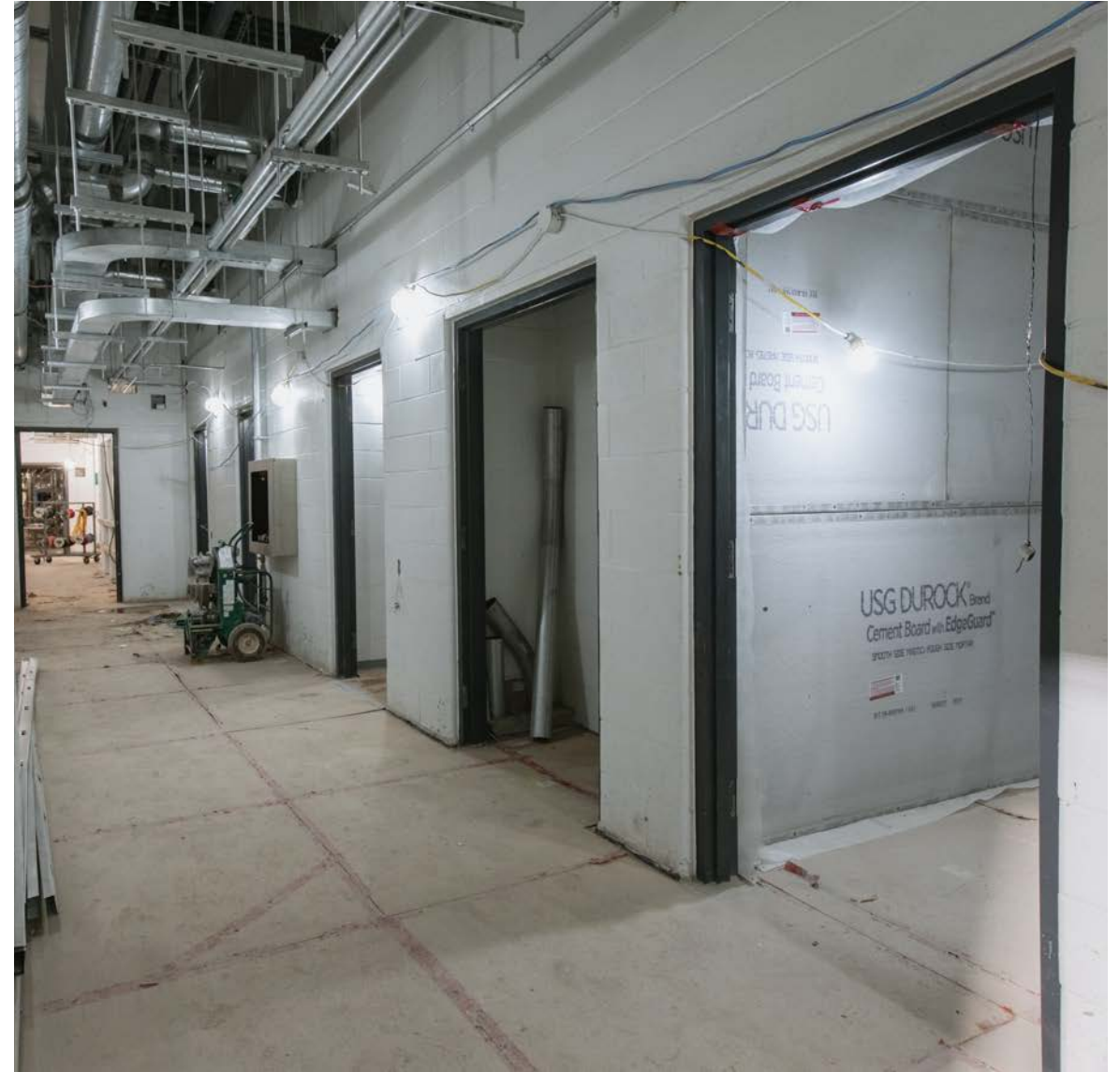
Photo: Internal view of Finch West Station, Architectural & MEP Works. 2023.03.17