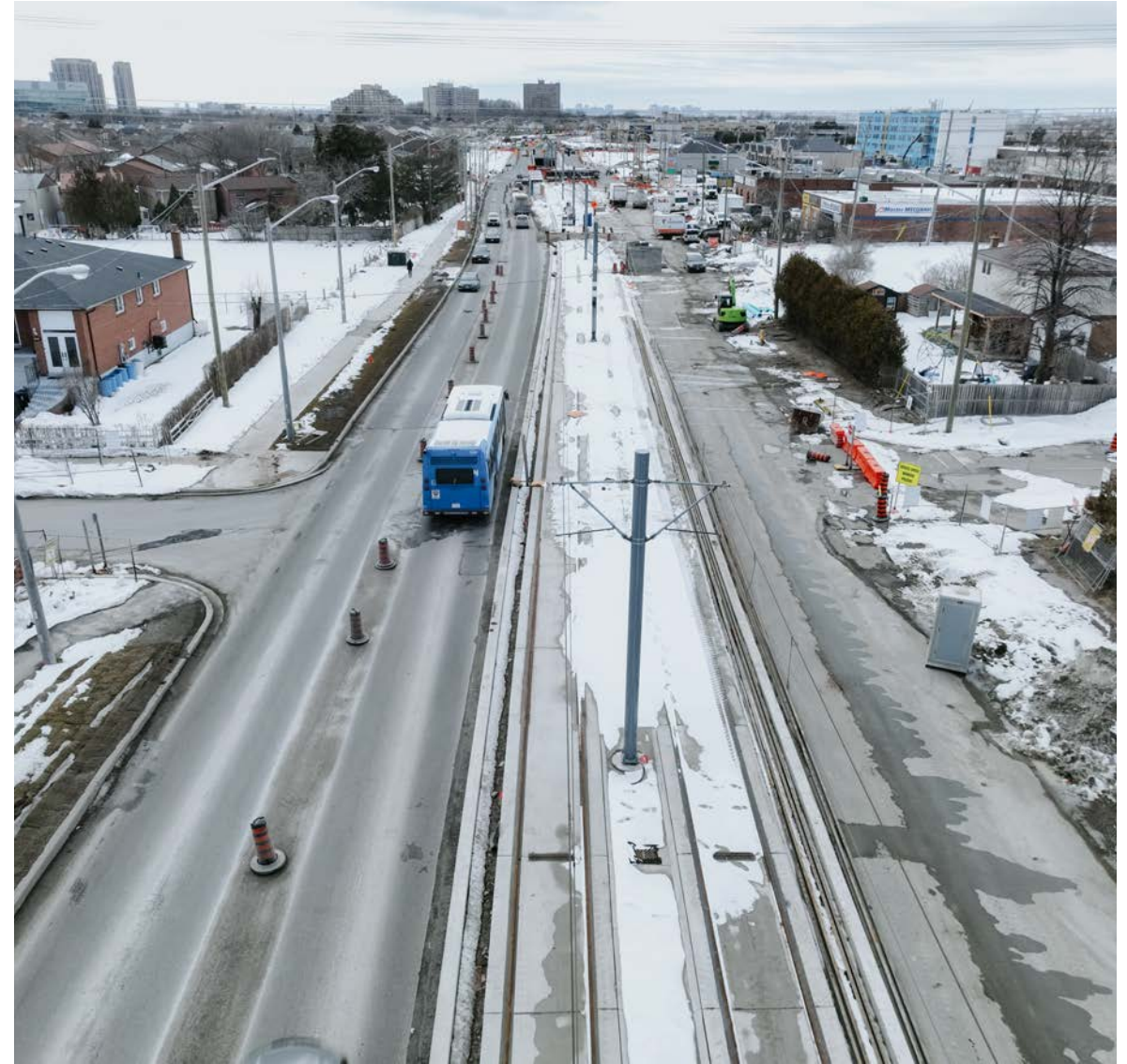
Photo: Aerial view of Finch Avenue West and Damascus Drive, Looking West. 2023.03.16