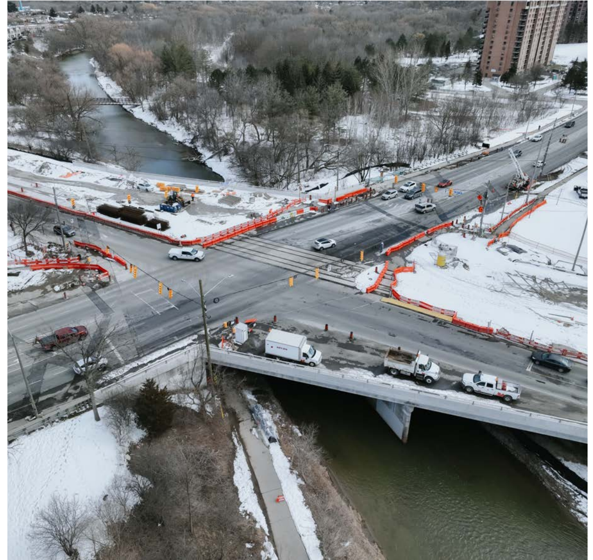
Photo: Aerial view of Finch Avenue West and Islington Avenue, Looking Southeast. 2022.12.22