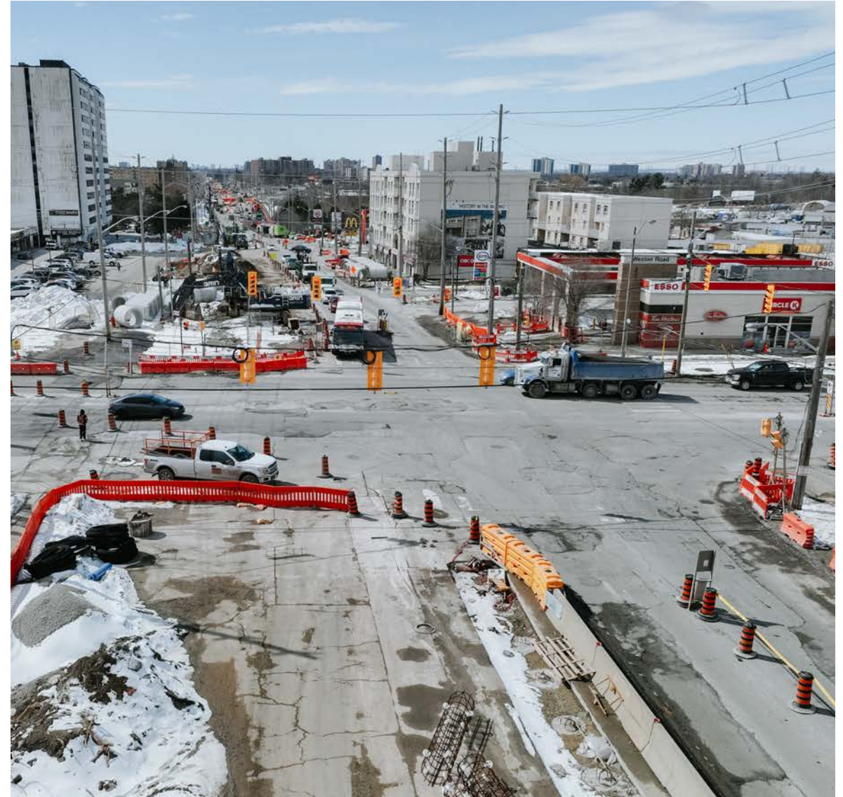
Photo: Aerial view of Finch Avenue West and Weston Road, Looking West. 2023.03.16