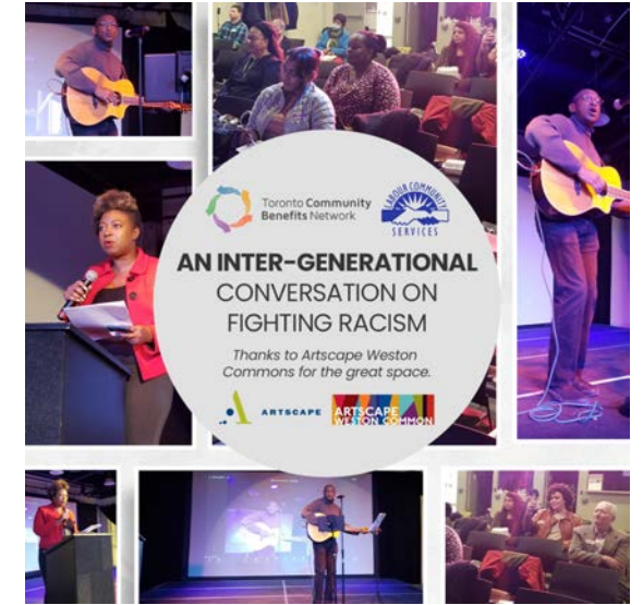
Photo: International Day for the Elimination of Racial Discrimination event