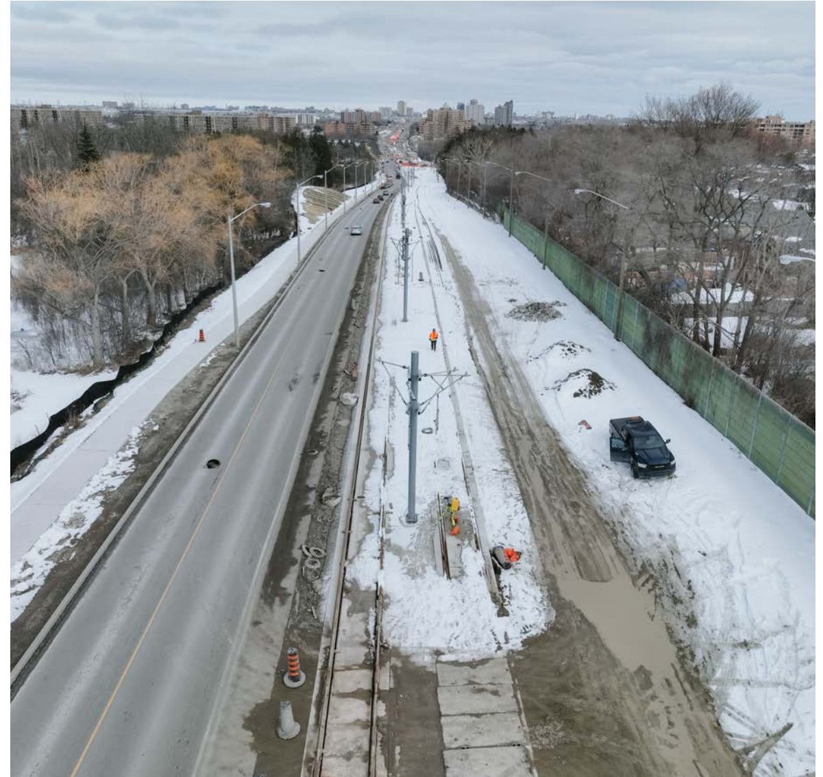
Photo: Finch Avenue West and Kipling Avenue, Looking East. 2023.03.16