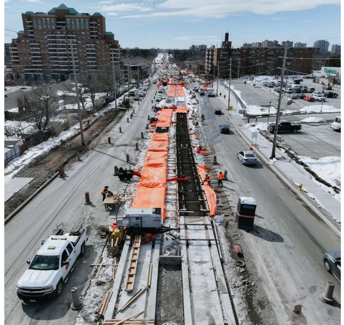
Photo: Aerial view of Finch Avenue West and Gracedale Boulevard, Looking West. 2023.03.16