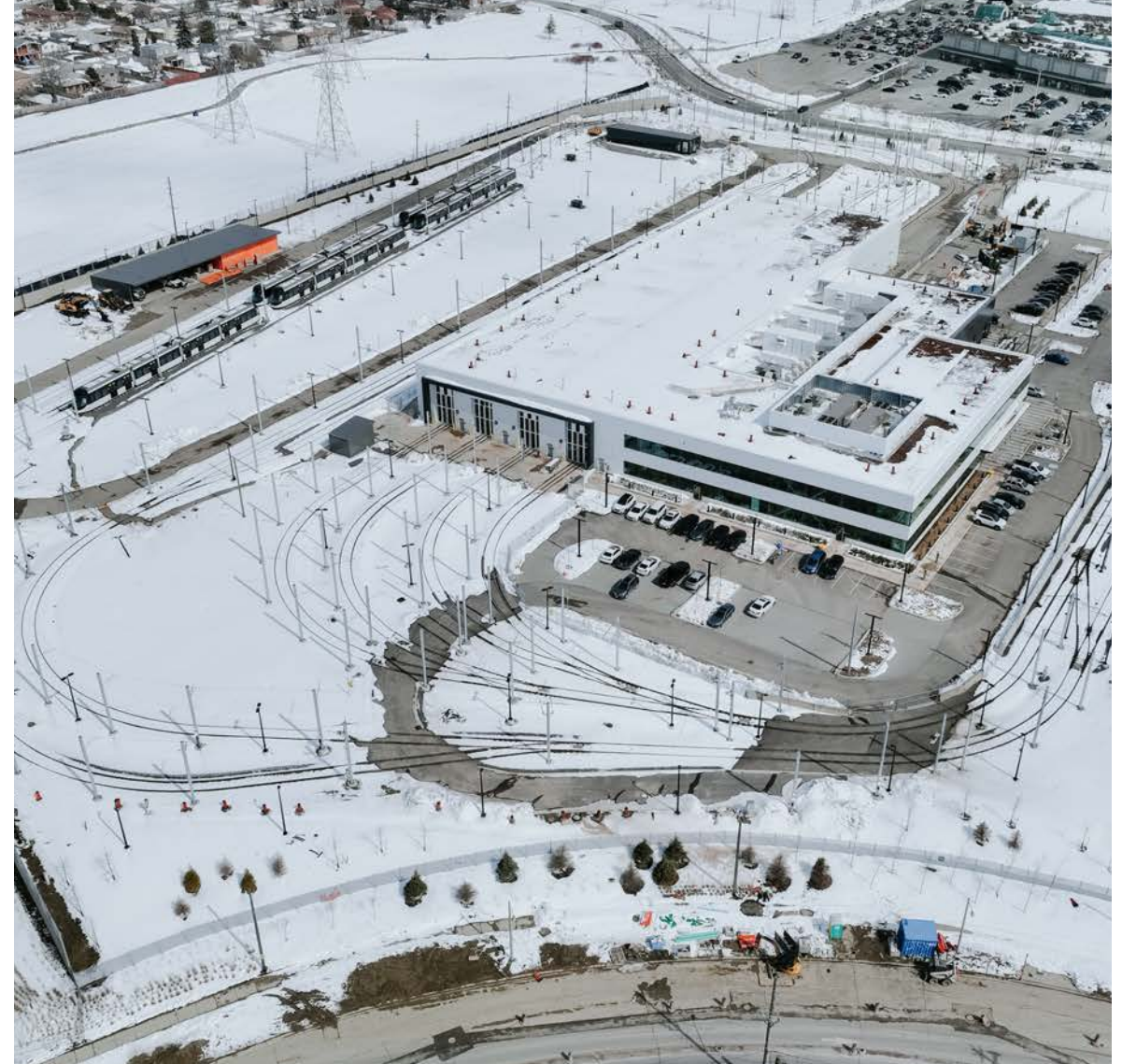
Photo: Aerial view of Maintenance and Storage Facility, Looking Northeast. 2023.03.16