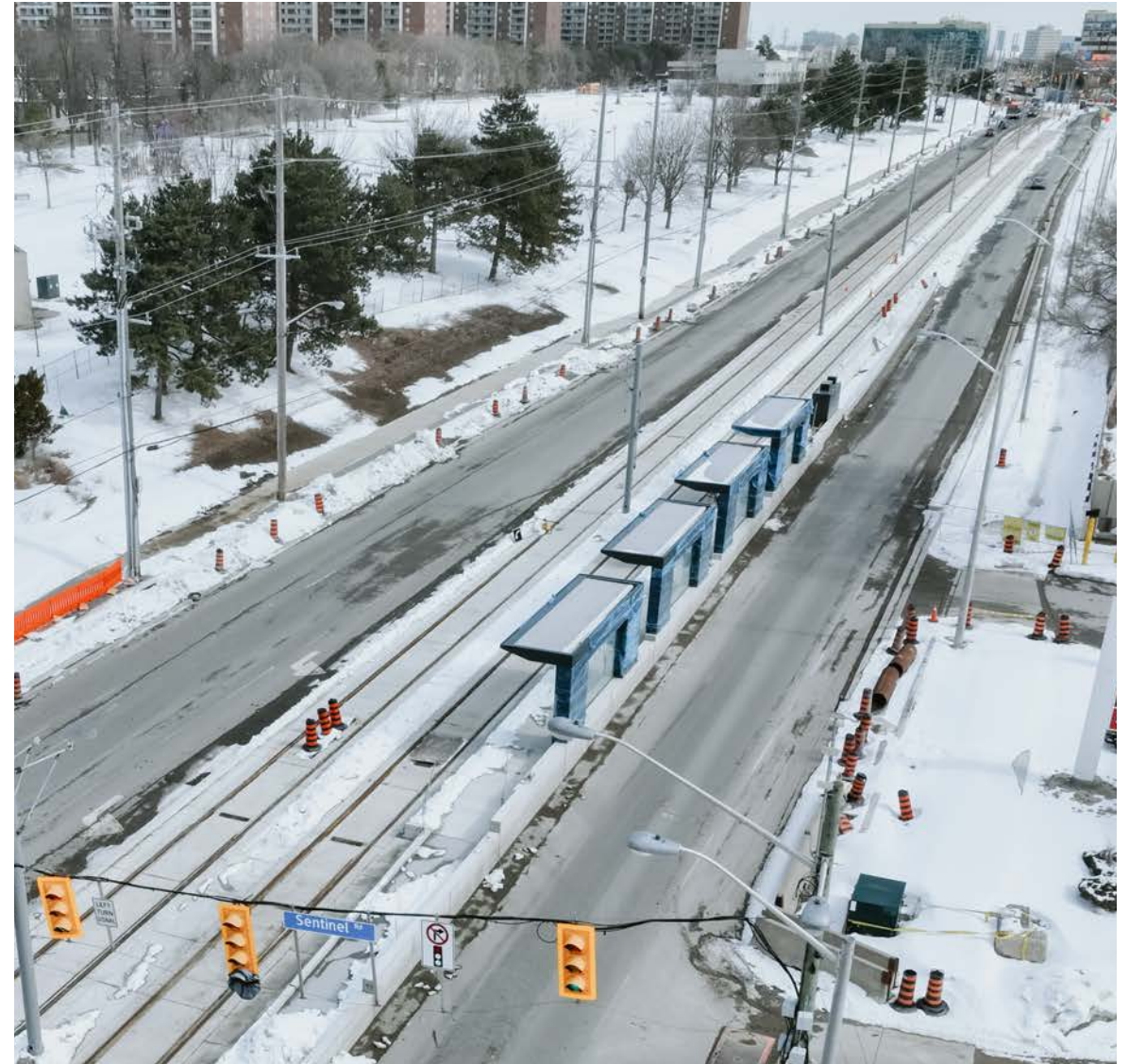
Photo: Aerial view of Finch West Avenue and Sentinel Road, Looking East. 2023.03.16