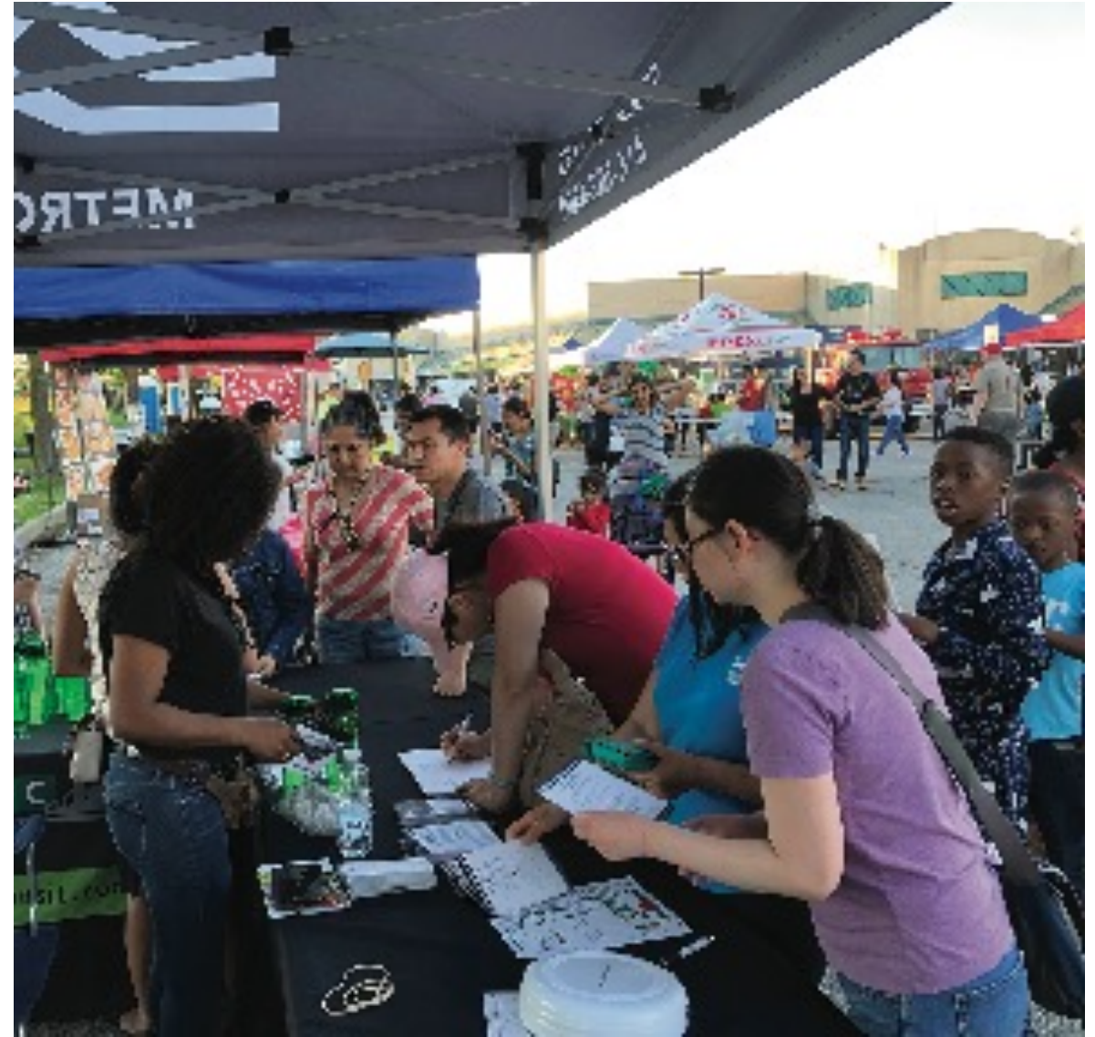
Photo: Duke Eats Event 2019