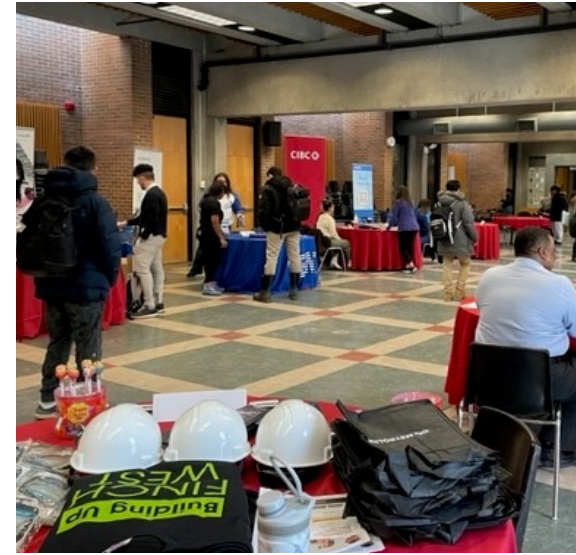
Photo: York University Diversity and Equity Employer Meet and Greet