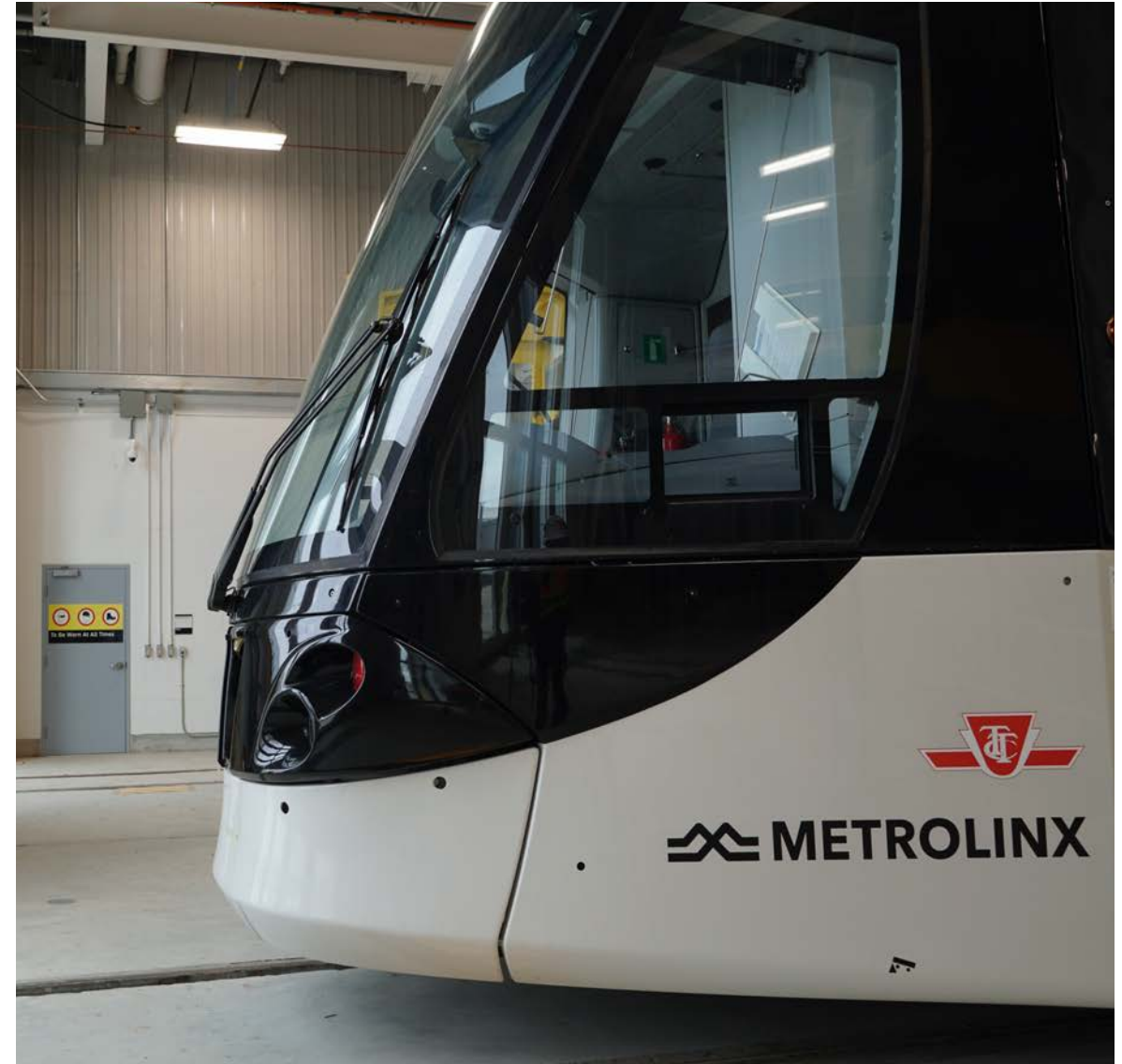
Photo: Light Rail Vehicle in Maintenance and Storage Facility. 2023.03.22