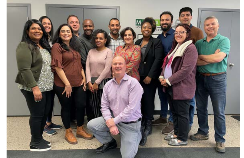
Photo: Internship program kick-off