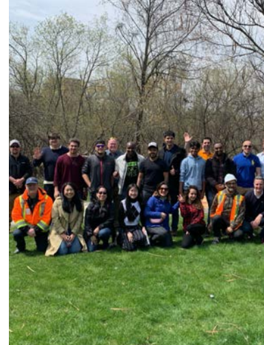
Photo: Earth Day clean-up