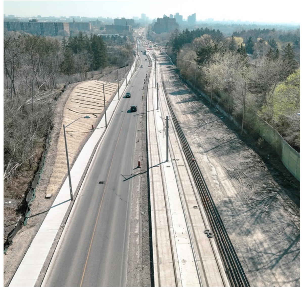
Photo: Aerial east view of Finch Avenue West from Kipling Avenue. 2023.04.19