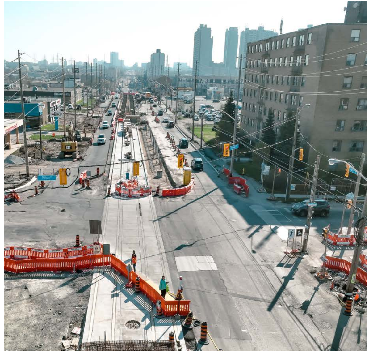
Photo: Aerial east view of Finch Avenue West and Milvan Drive. 2023.04.19