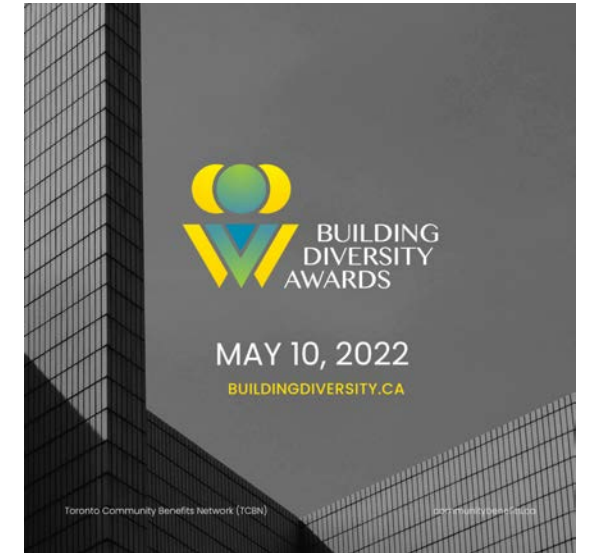
Photo: TCBN Building Diversity Gala