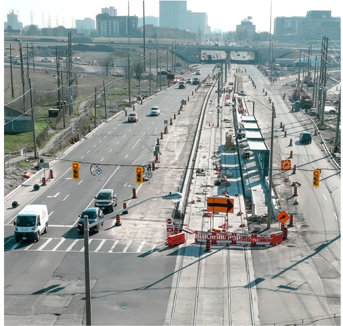
Photo: Aerial east view of Finch Avenue West and Signet Drive. 2023.04.19