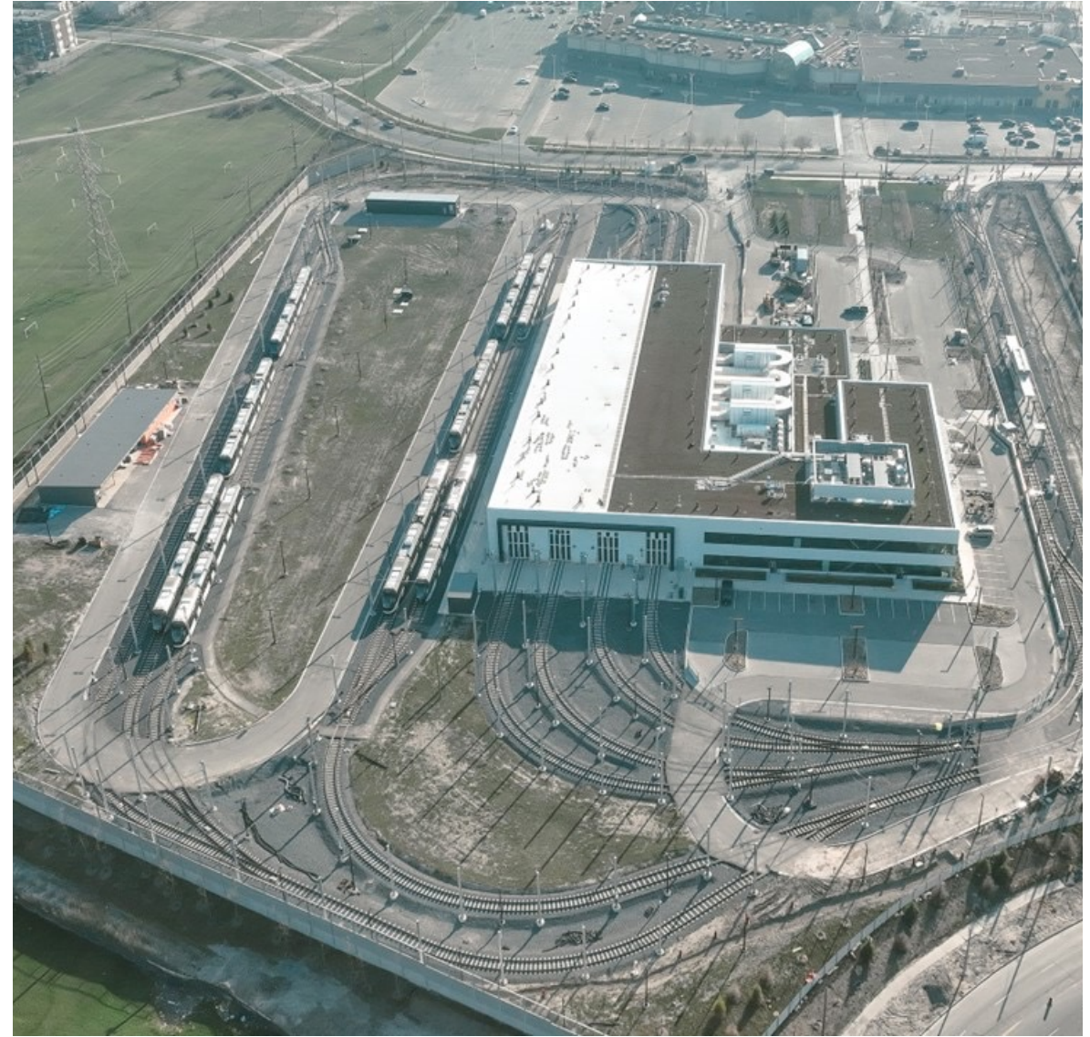
Photo: Aerial east view of Maintenance and Storage Facility. 2023.04.19