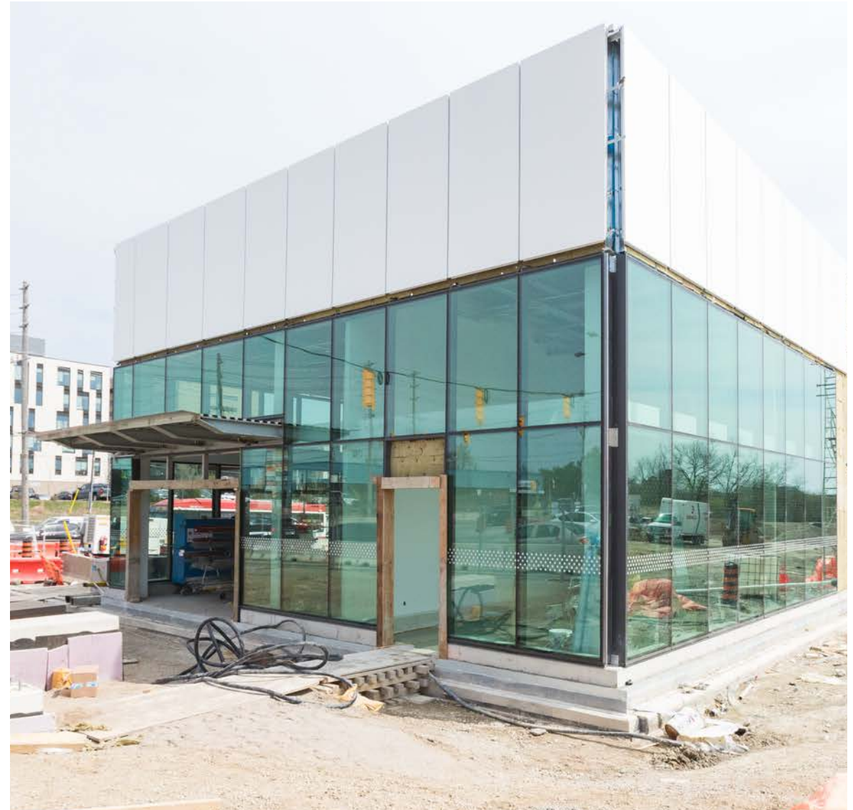
Photo: Humber College Station, north building. 2023.04.19