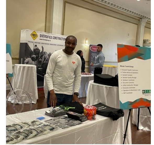
Photo: Emery Village Career Fair