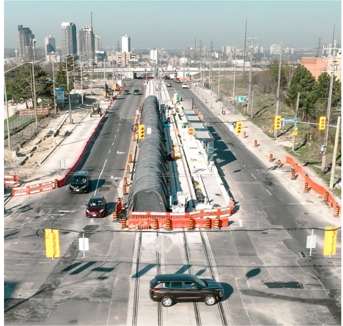
Photo: Aerial west view of Finch Avenue West and Norfinch Drive. 2023.04.19