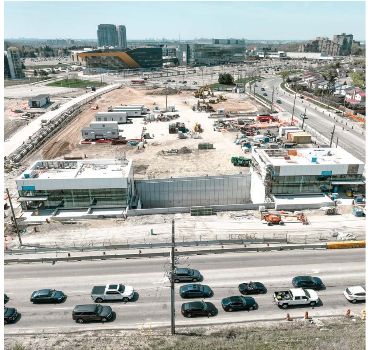
Photo: Humber College Station, aerial west view, 2023.04.19