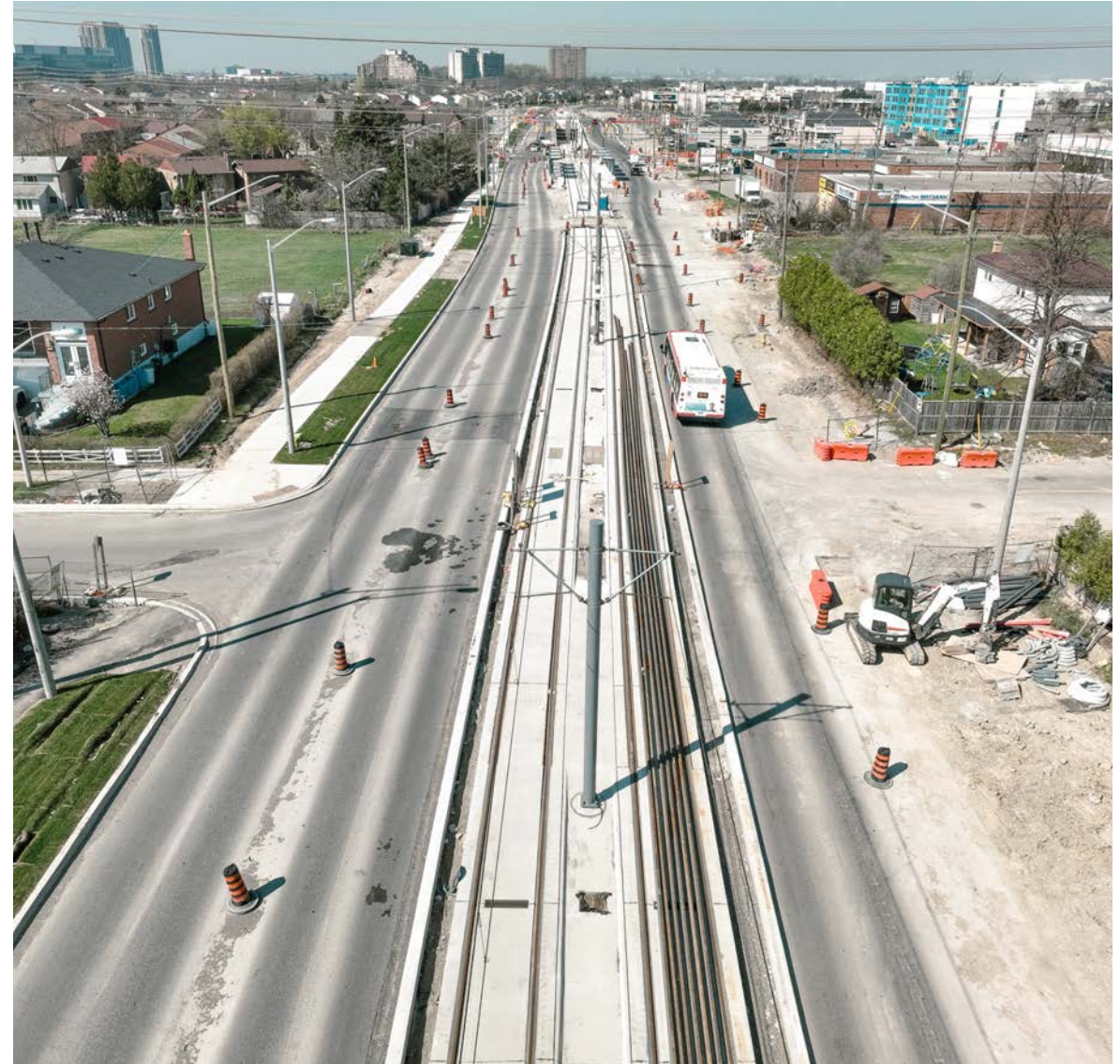
Photo: Aerial west view of Finch Avenue West and Damascus Drive. 2023.04.19