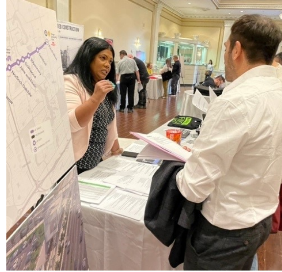
Photo: Emery Village Career Fair