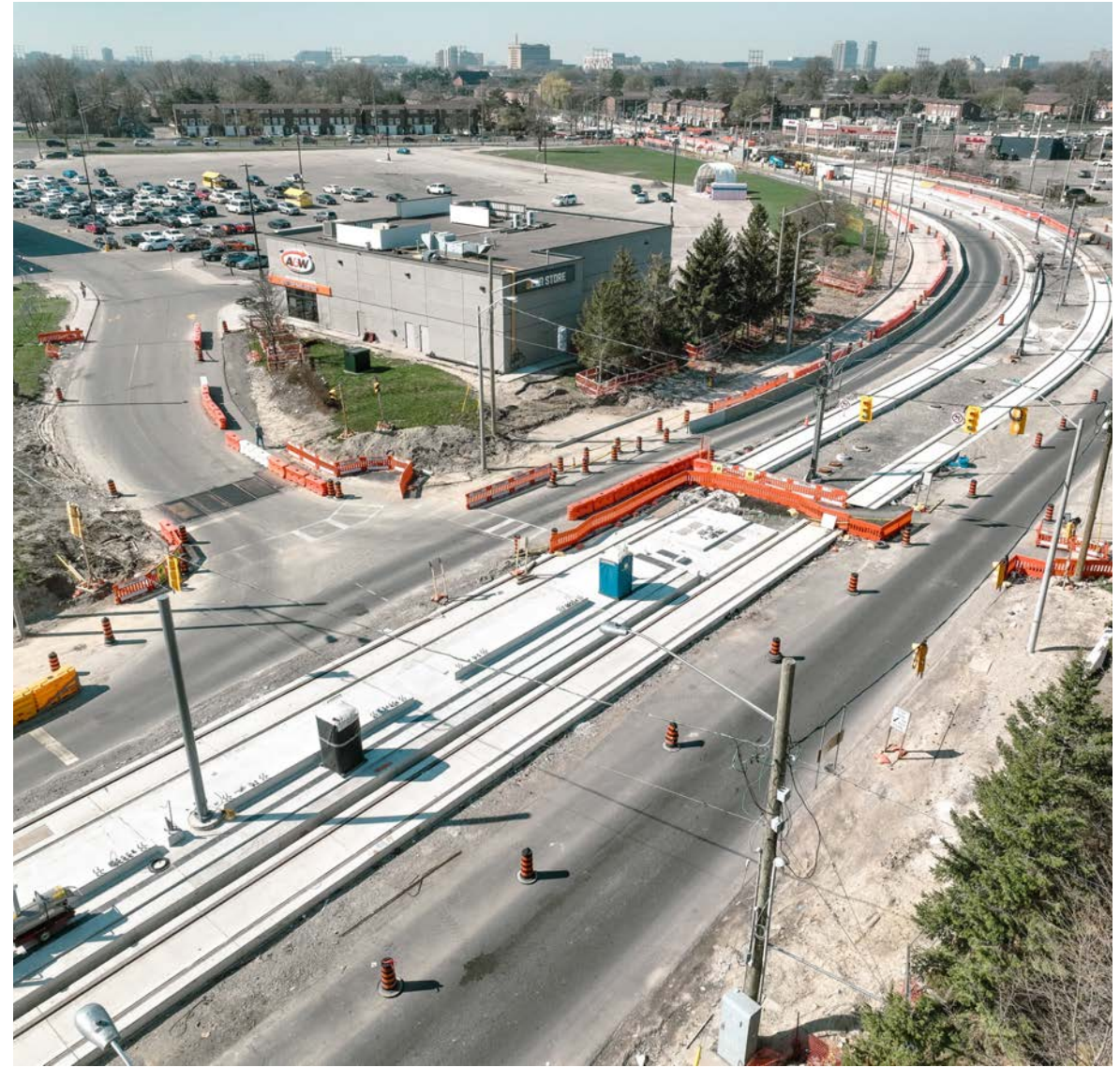
Photo: Aerial west view of Finch Avenue West and Albion Road. 2023.04.19