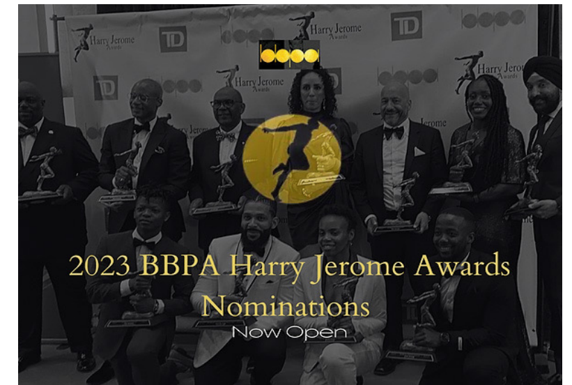
Harry Jerome Awards