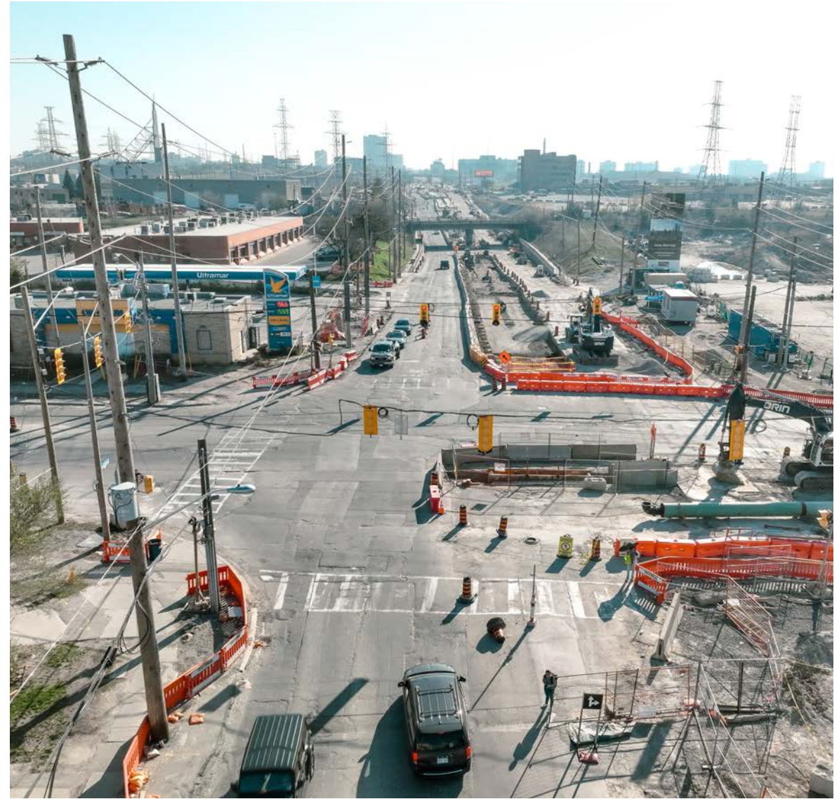
Photo: Aerial west view of Finch Avenue West and Norfinch Drive. 2023.04.19