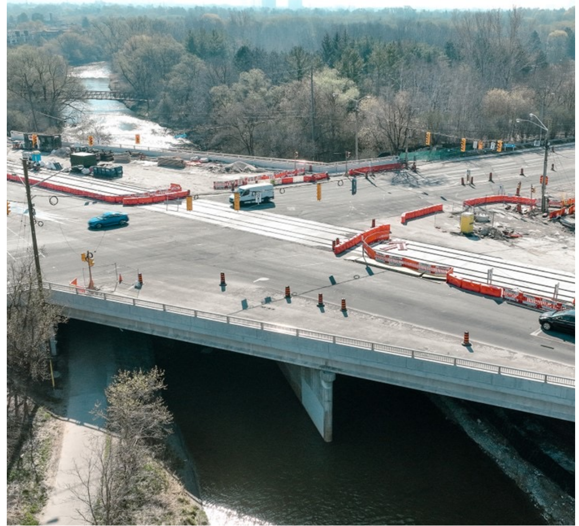
Photo: Aerial southeast view of Finch Avenue West and Islington Avenue. 2023.04.19