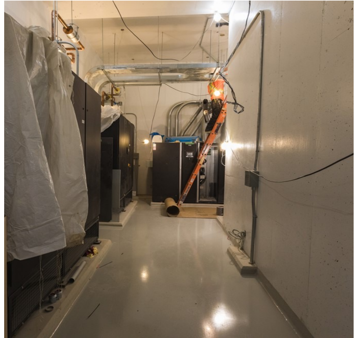
Photo: Internal view of Finch West Station, Architectural & MEP Works. 2023.04.19