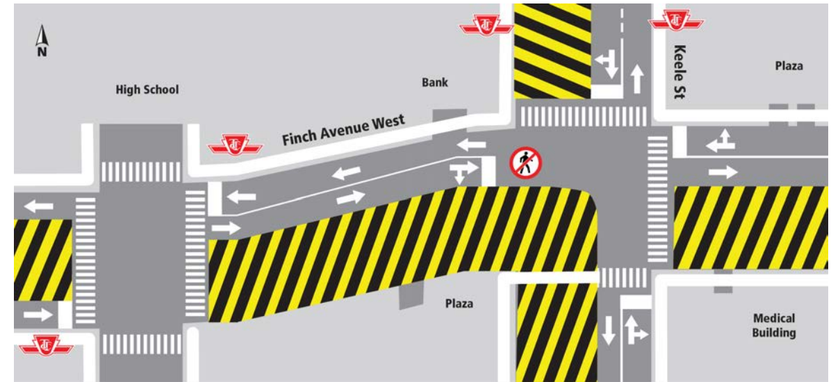
Illustration: Finch Avenue west and Keele Street intersection, Traffic Configuration, Stage 2