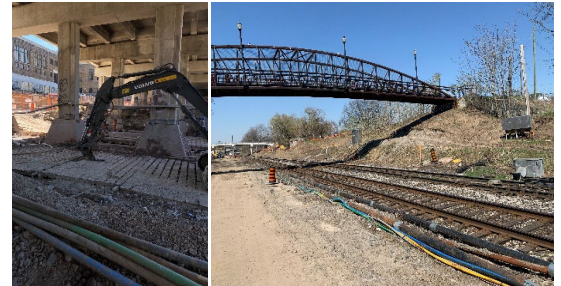
Photo shown left: Existing, exposed bridge footings are visible and will allow for the micropiles installation and future footing enhancements. Photo shown right: Above ground utilities to allow for future grading to connect future track switch.

To make room for the new tracks, an existing storm line is being relocated south of the new tracks. As this new line will be lower than the James Street Bridge footings, the footings must be strengthened/deepened.