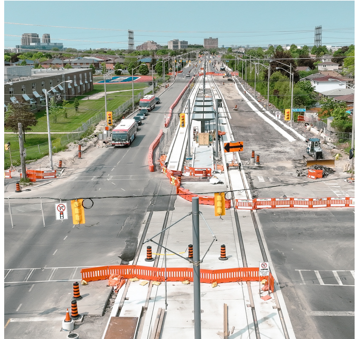
Photo: Aerial west view of Finch Avenue West and Martin Grove Island stop. 2023.06.01