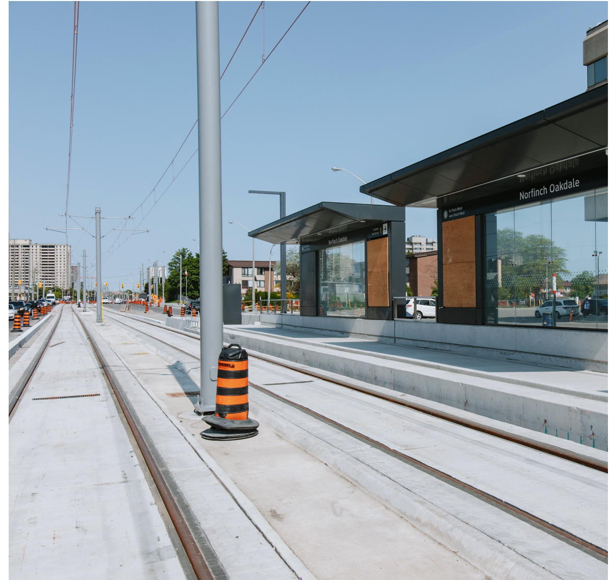
Photo: Norfinch Oakdale stop east side of Norfinch Drive and Oakdale Road intersection. 2023.05.27