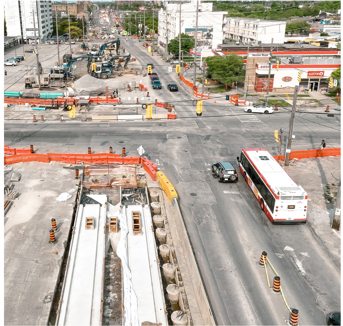
Photo: Aerial west view of Finch Avenue West and Weston Road. 2023.06.01