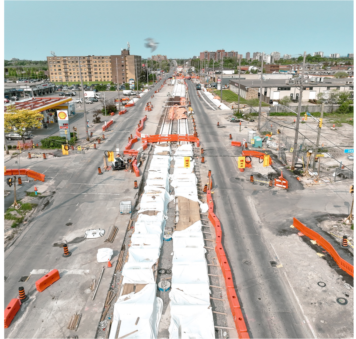
Photo: Aerial west view of Finch Avenue West and Jayzel Drive. 2023.06.01