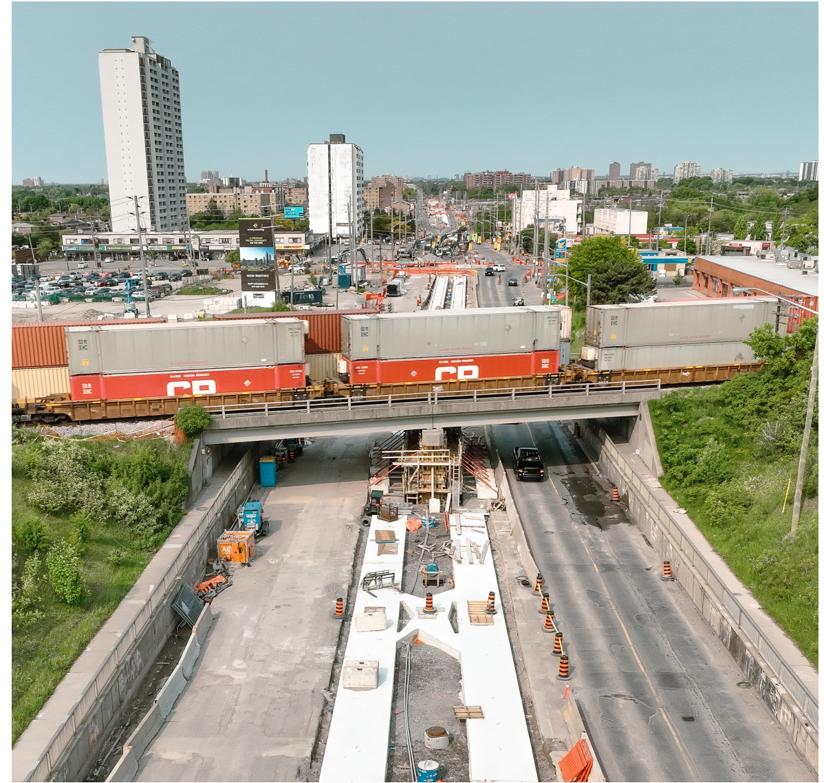
Photo: Aerial west view of Finch Avenue West and CP rail bridge. 2023.05.27