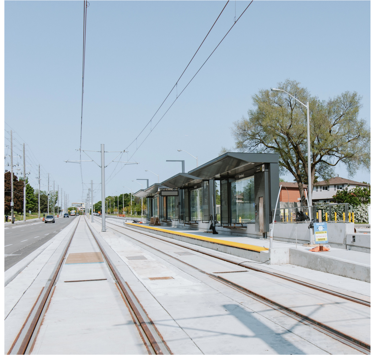
Photo: Sentinel Stop east side of Sentinel Road. 2023.05.27