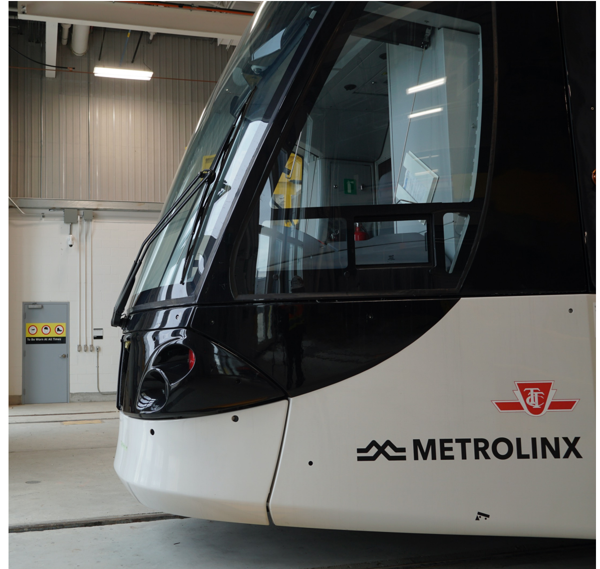
Photo: Light Rail Vehicle in Maintenance and Storage Facility. 2023.03.22