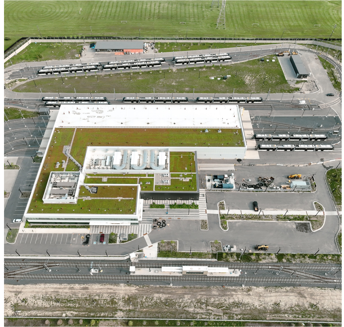
Photo: Aerial view of Maintenance and Storage Facility. 2023.06.01