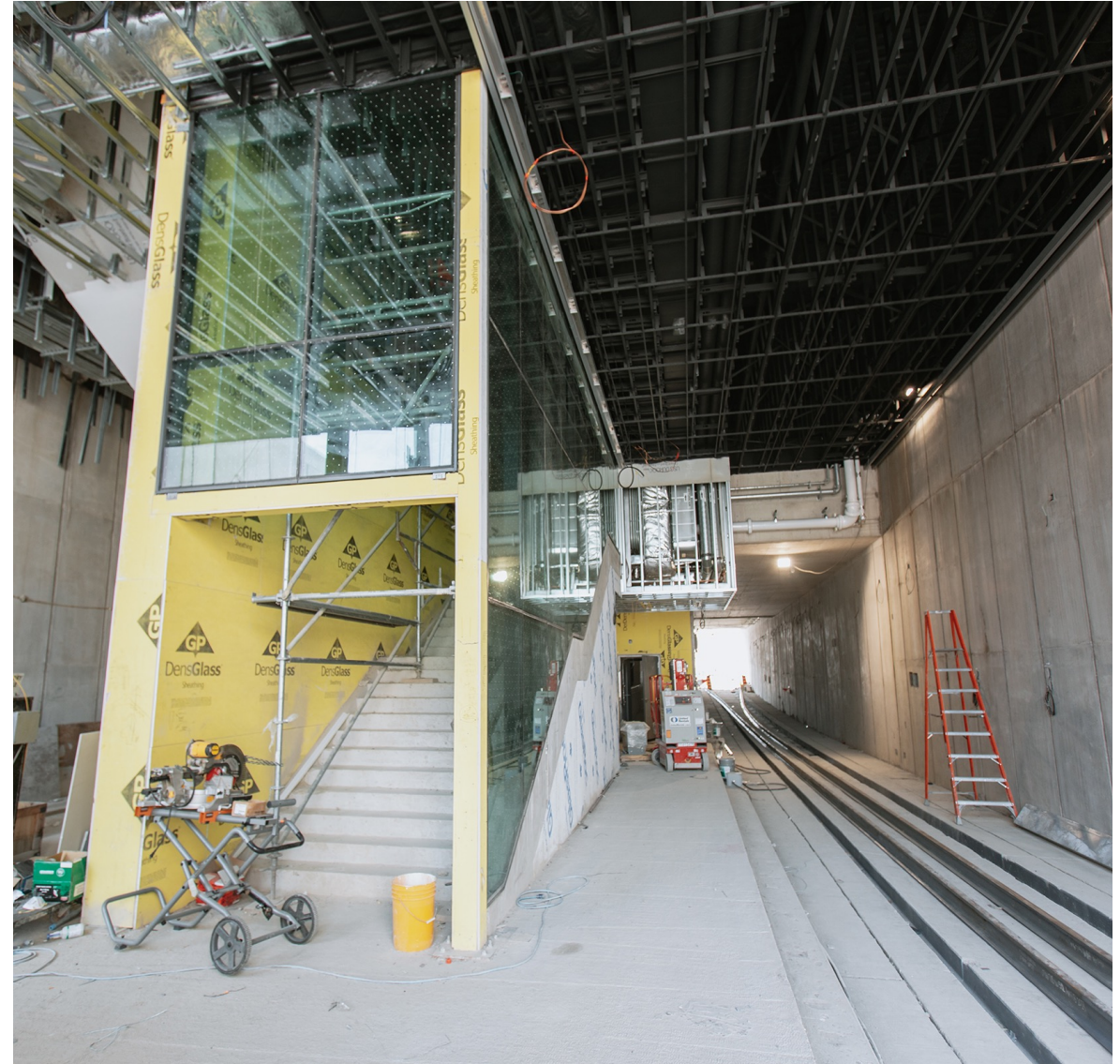
Photo: Humber College Station, north building. 2023.05.27