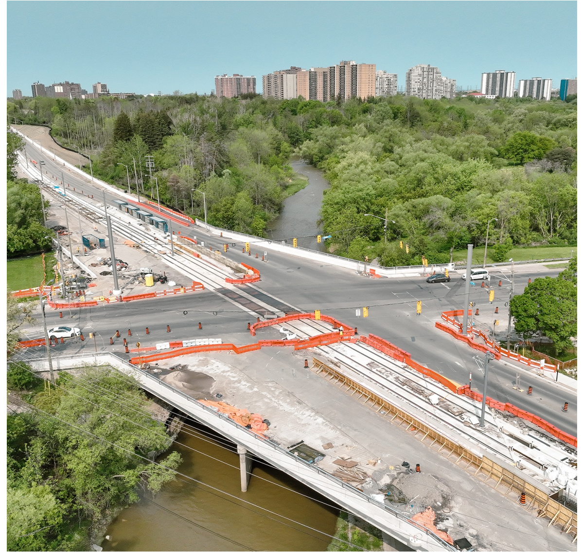
Photo: Aerial northwest view of Finch Avenue West and Islington Avenue. 2023.05.01