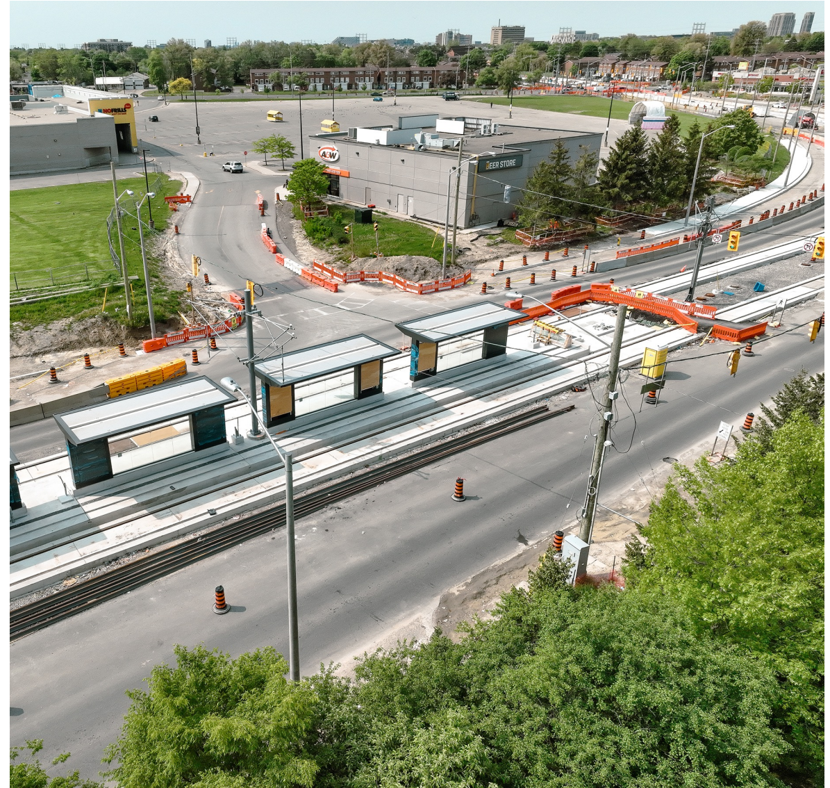
Photo: Aerial view of Finch Avenue West and Stevenson Island stop. 2023.06.01