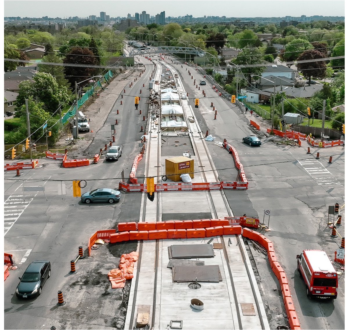
Photo: Aerial east view of Finch Avenue West from Kipling Avenue. 2023.05.27