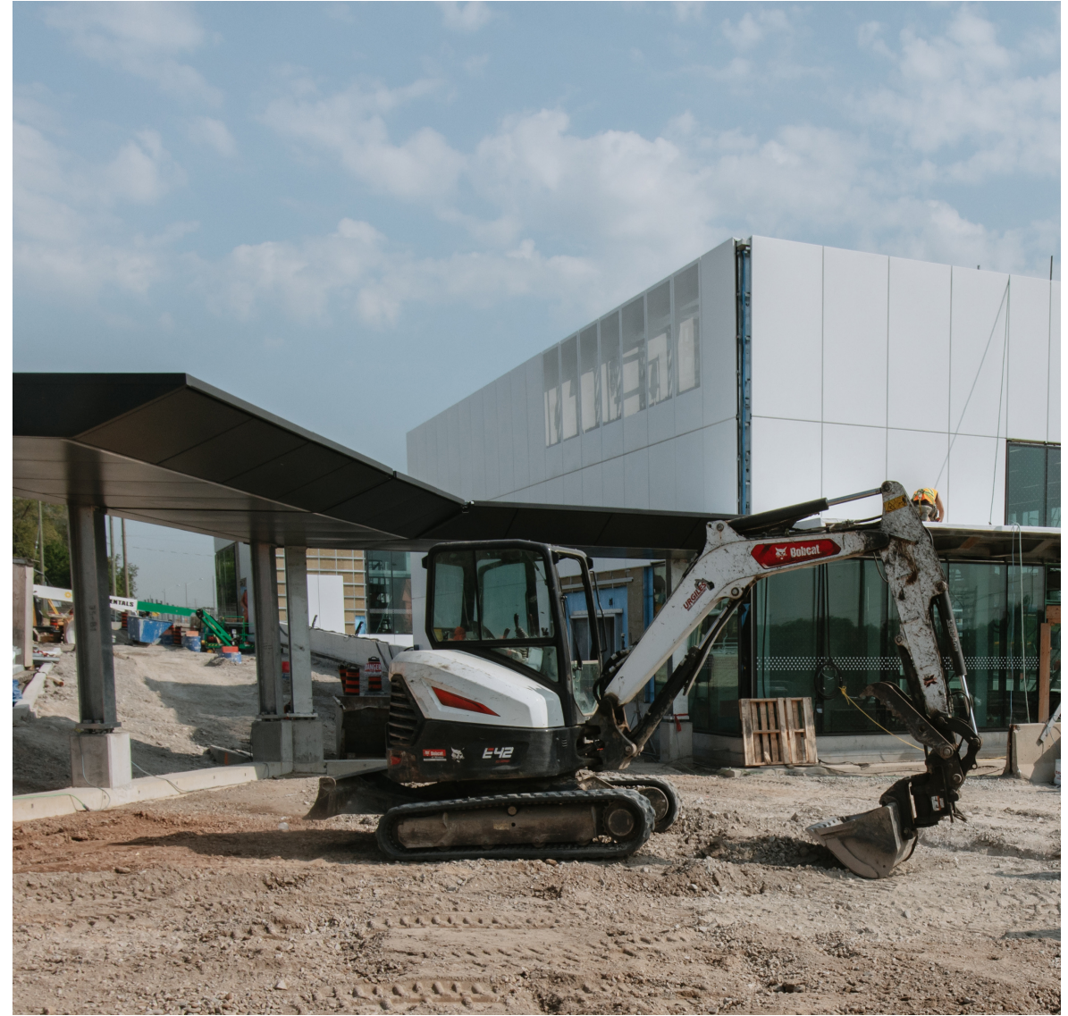
Photo: Humber College Station, south building canopy walkway, 2023.05.27