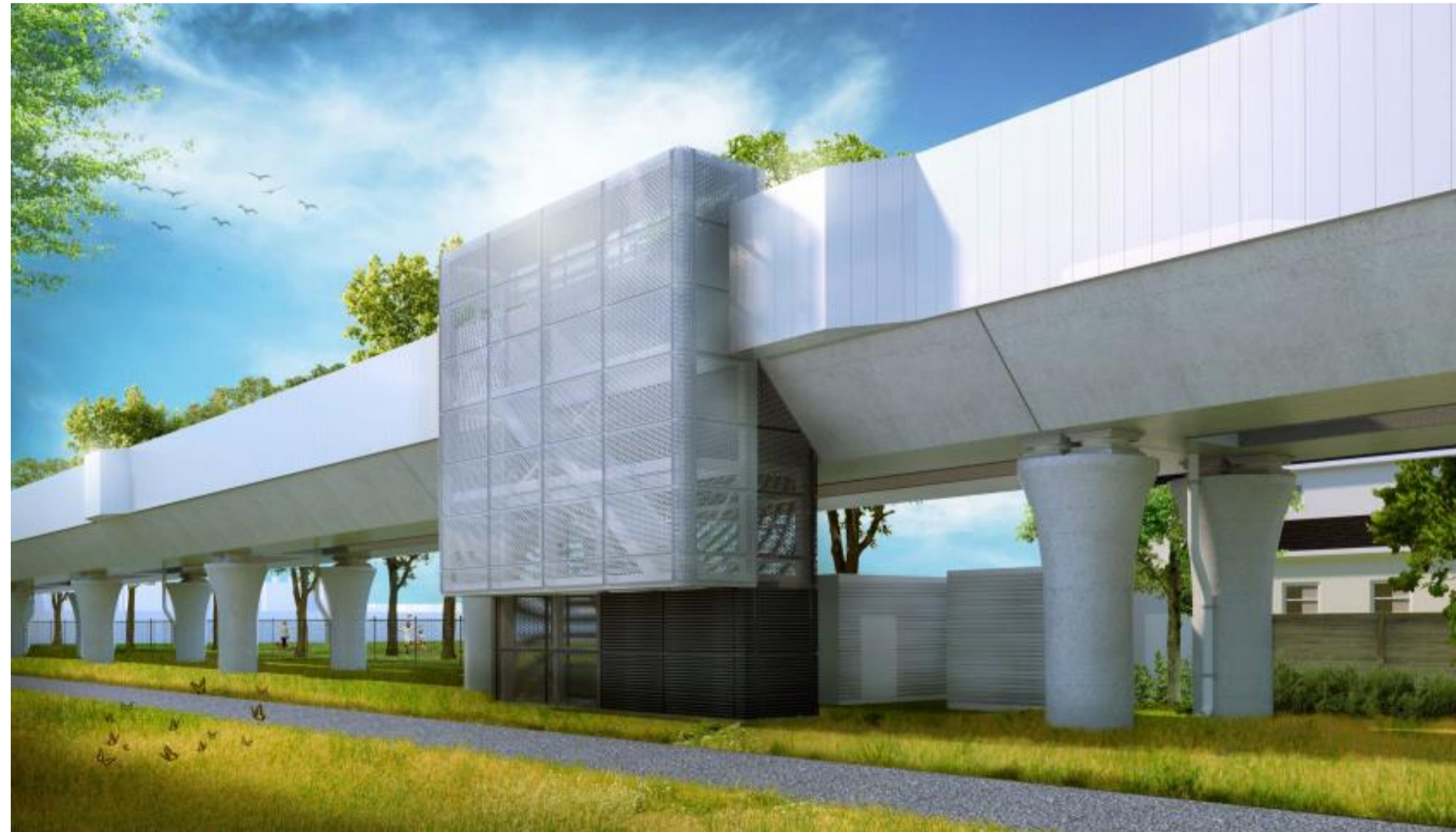
Design rendering of Electrical and Communications Rooms and Egress Stairway.

Work is ongoing in the Electrical and Communications Rooms in the Metrolinx rail corridor, adjacent to Antler Street. The structural work for the buildings is completed. The installation of the electrical and communications equipment inside the buildings is ongoing.