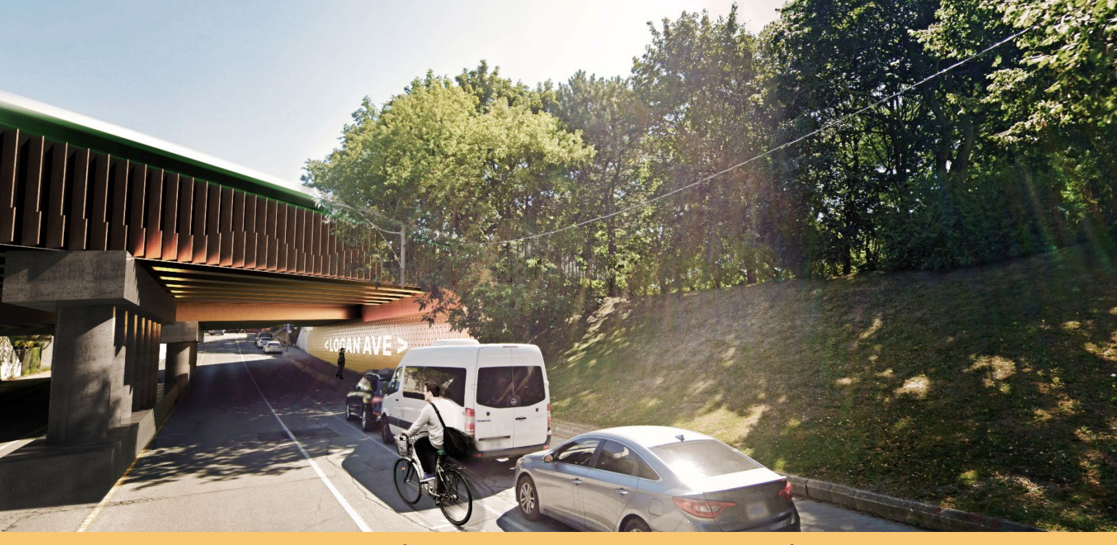
Conceptual artist's rendering of the redeveloped rail bridge at Logan Avenue, north of Dundas Street East.