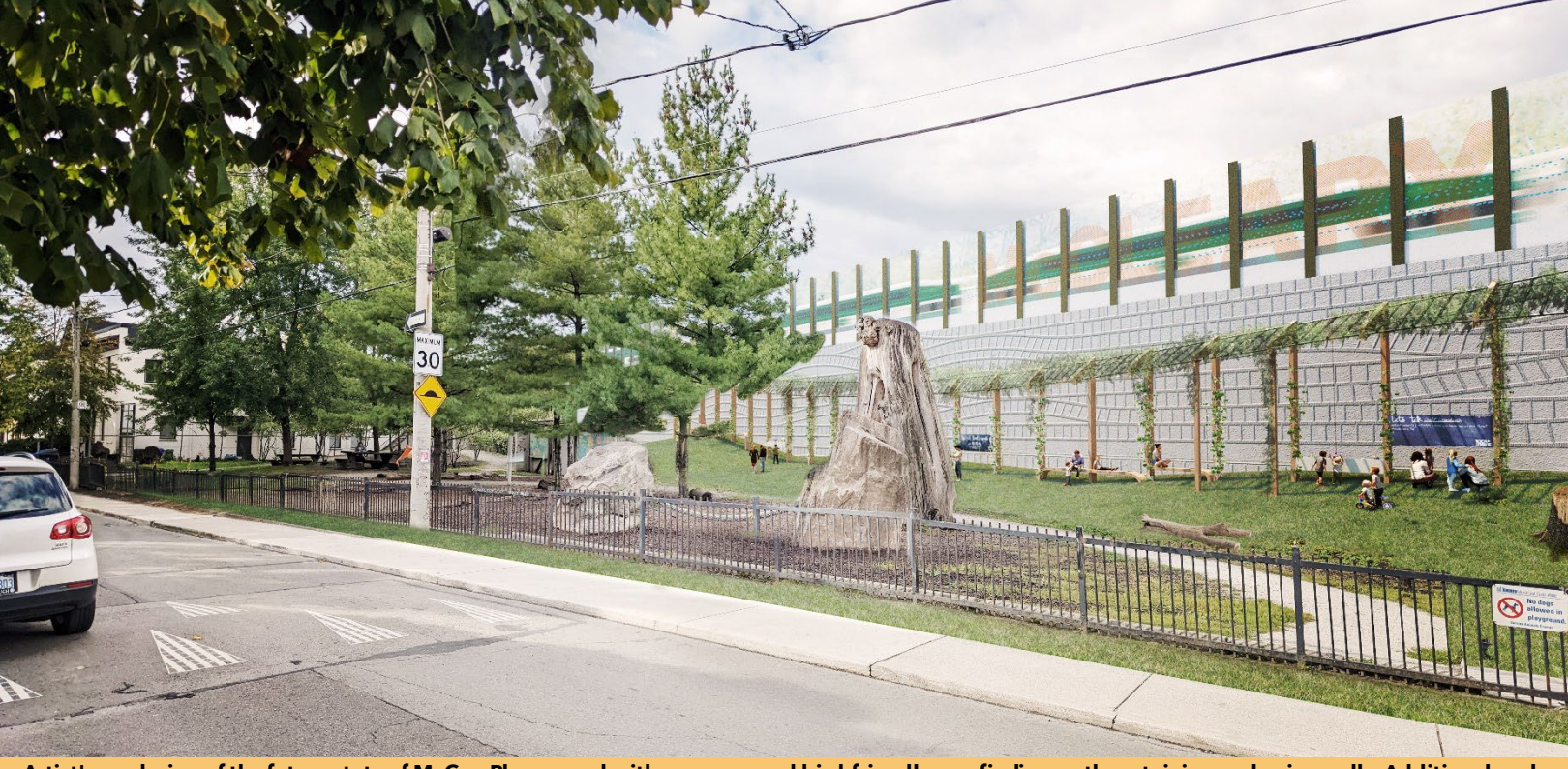
Artist's rendering of the future state of McGee Playground with greenery and bird-friendly wayfinding on the retaining and noise walls. Additional park amenities are conceptual.

Design enhancements to the new retaining walls and noise barriers will be supplemented by a robust planting and landscape design plan to create attractive backdrops for gathering spaces and parks along the rail corridor, where Metrolinx will add nearly 2,600 square metres of green space by bringing the walls even closer to the tracks than the fence that borders them today.