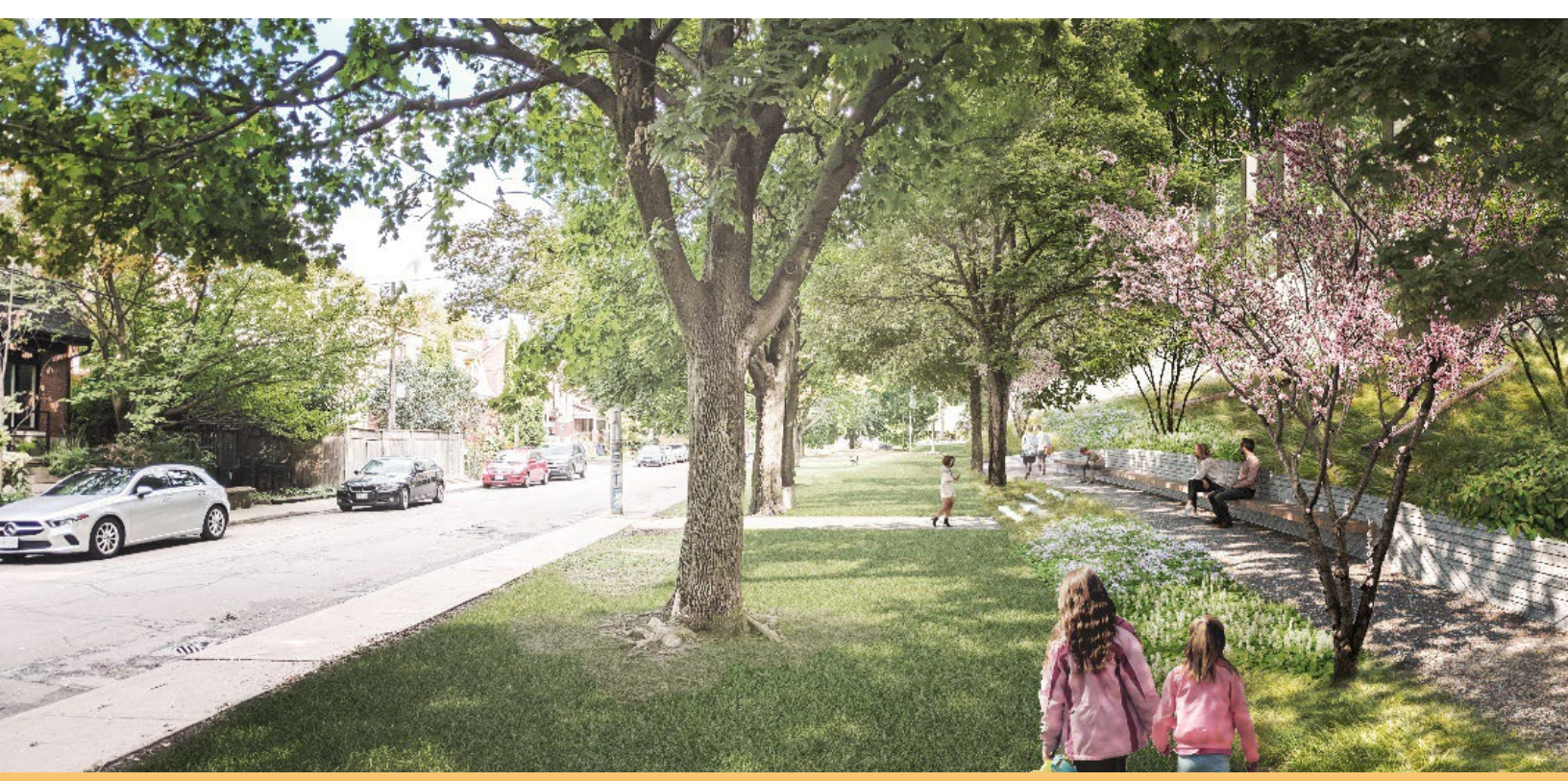
Artist's rendering of proposed future landscaping in Bruce Mackey Park to help conceal the visual impacts of the noise barriers and passing trains.

Following a comprehensive, community-inspired Ontario Line design competition for the public spaces along the rail corridor in Riverside and Leslieville, a winner has been chosen. A community jury agreed that Canadian design firm O2 submitted a proposal that matches the vibrancy of these unique neighbourhoods.