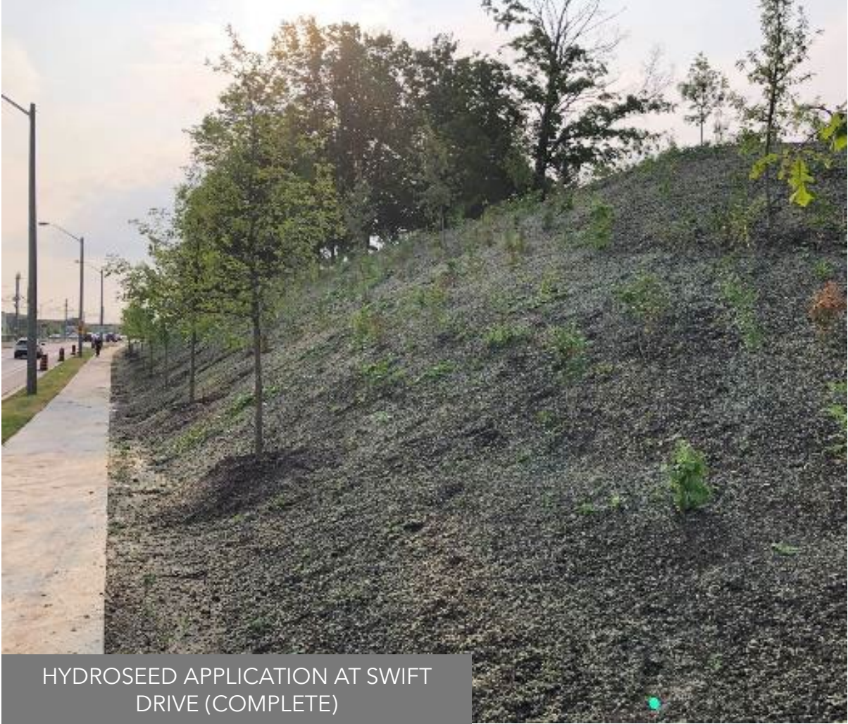
HYDROSEED APPLICATION AT SWIFT DRIVE (COMPLETE)