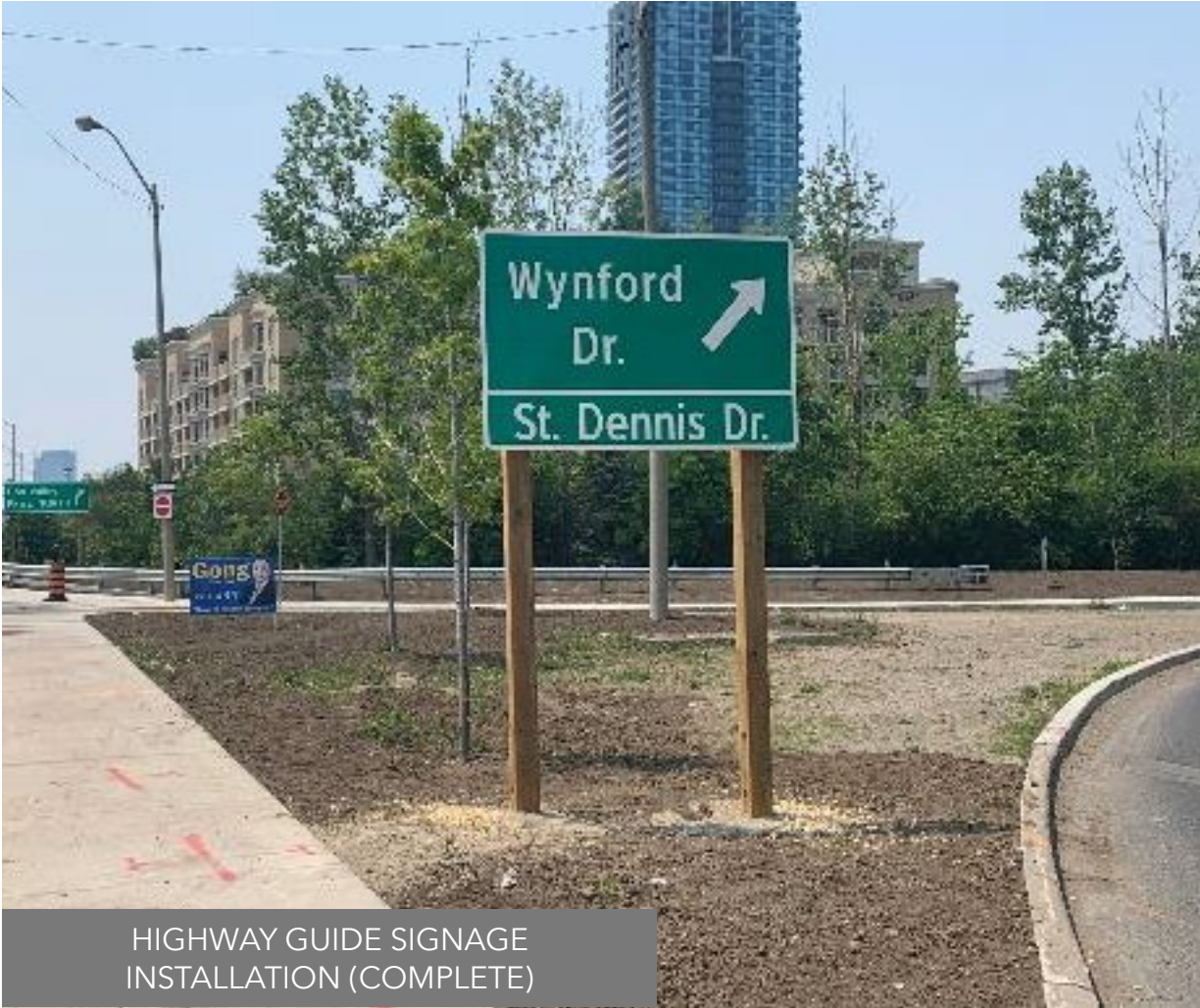
HIGHWAY GUIDE SIGNAGE INSTALLATION (COMPLETE)