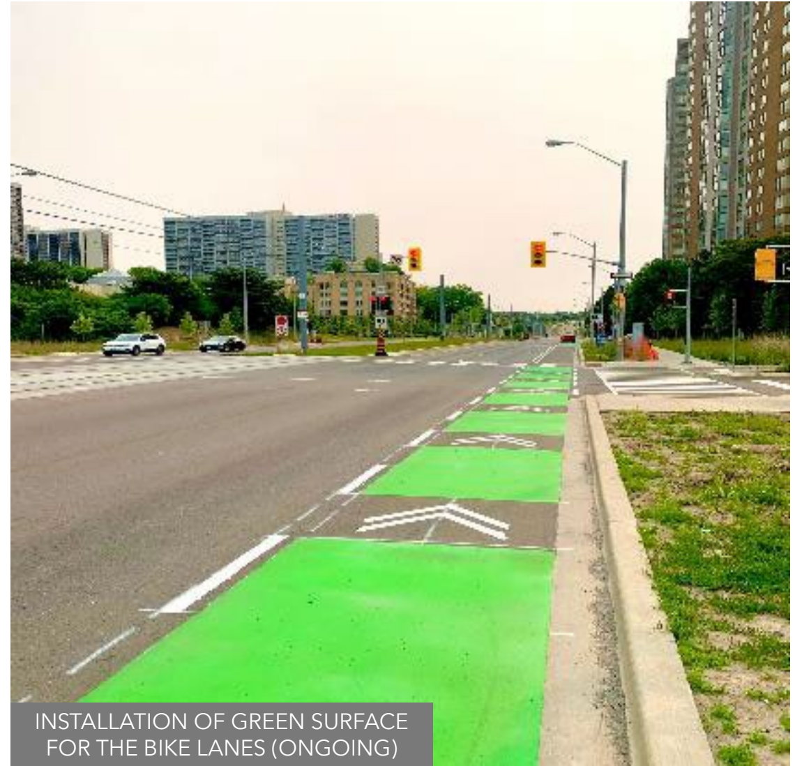
INSTALLATION OF GREEN SURFACE FOR THE BIKE LANES (ONGOING)