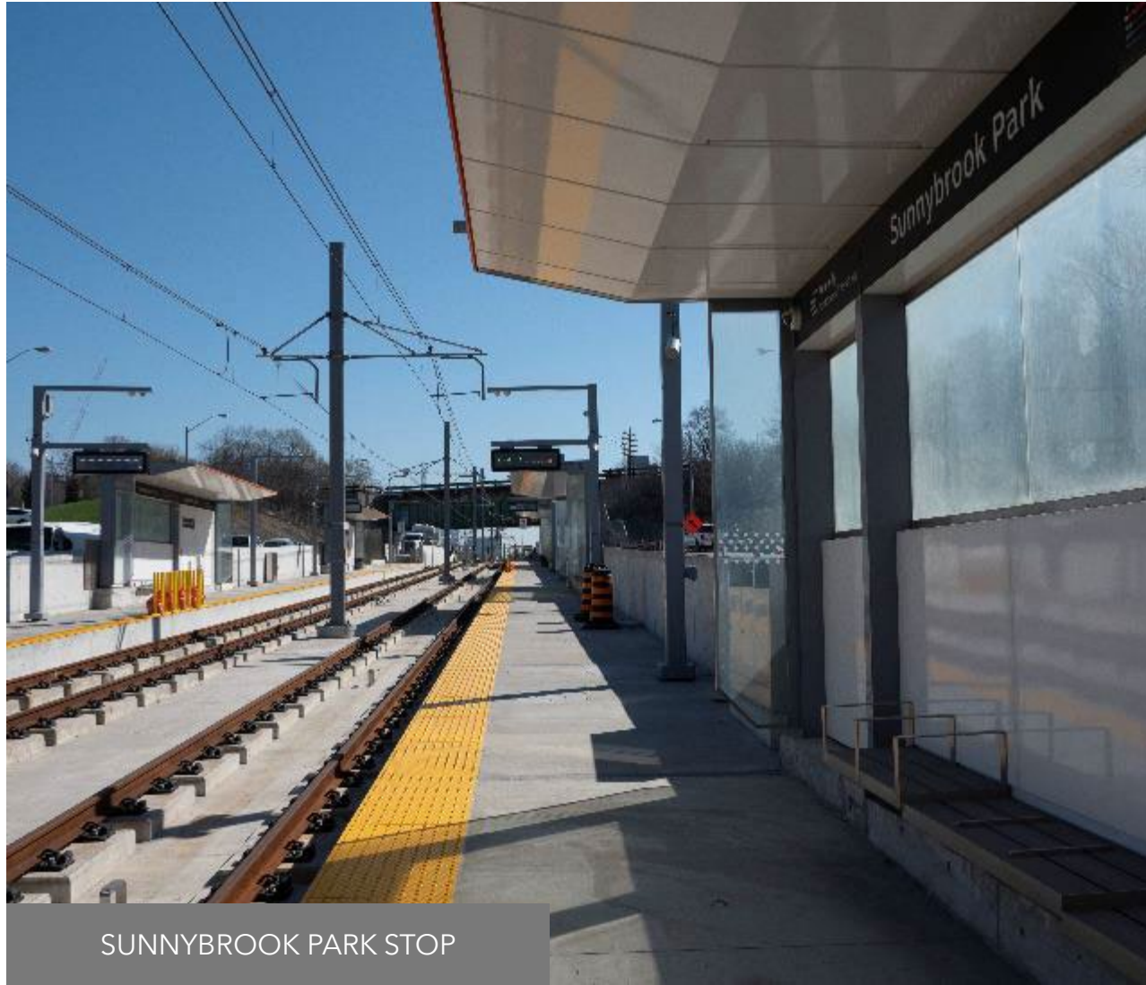
SUNNYBROOK PARK STOP