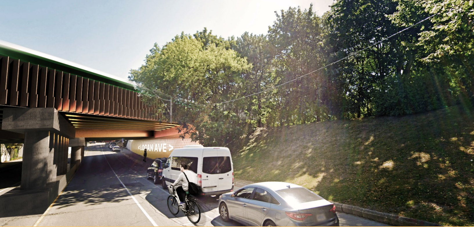
Conceptual artist's rendering of the redeveloped rail bridge at Logan Avenue, north of Dundas Street East.