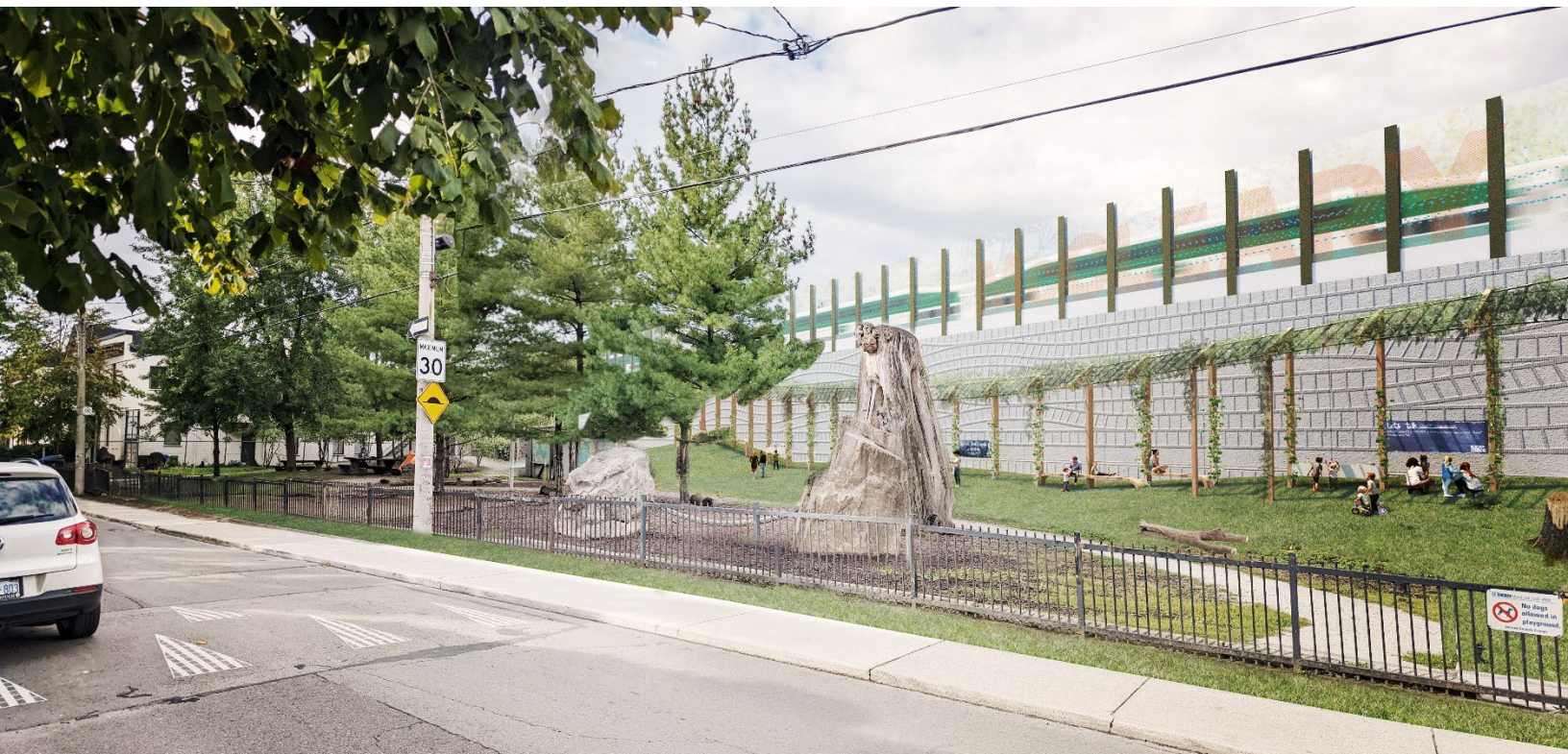
Artist's rendering of the future state of McGee Playground with greenery and bird-friendly wayfinding on the retaining and noise walls. Additional park amenities are conceptual.

Design enhancements to the new retaining walls and noise barriers will be supplemented by a robust planting and landscape design plan to create attractive backdrops for gathering spaces and parks along the rail corridor, where Metrolinx will add nearly 2,600 square metres of green space by bringing the walls even closer to the tracks than the fence that borders them today.