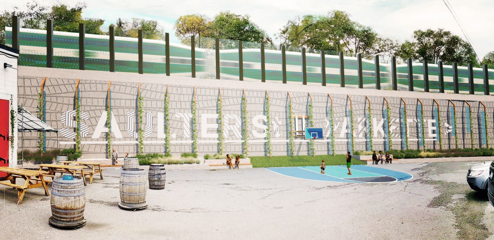
Artist's rendering of the future retaining wall and noise barrier along the rail corridor in the Saulters Street Parkette. Additional park amenities pictured are conceptual.