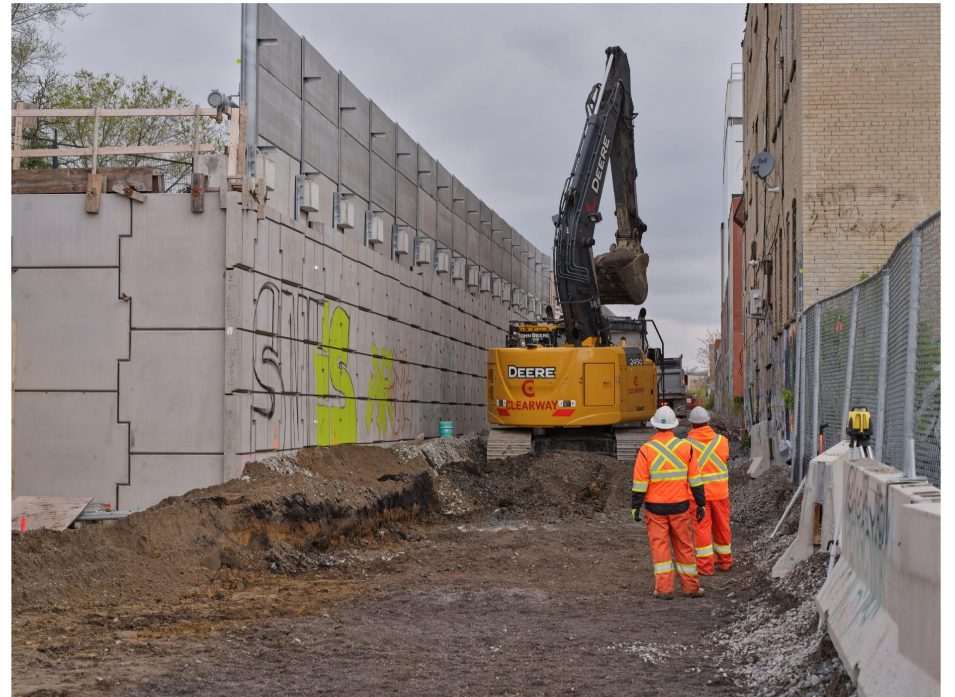
Excavation for drainage installation beside the S-MSE walls