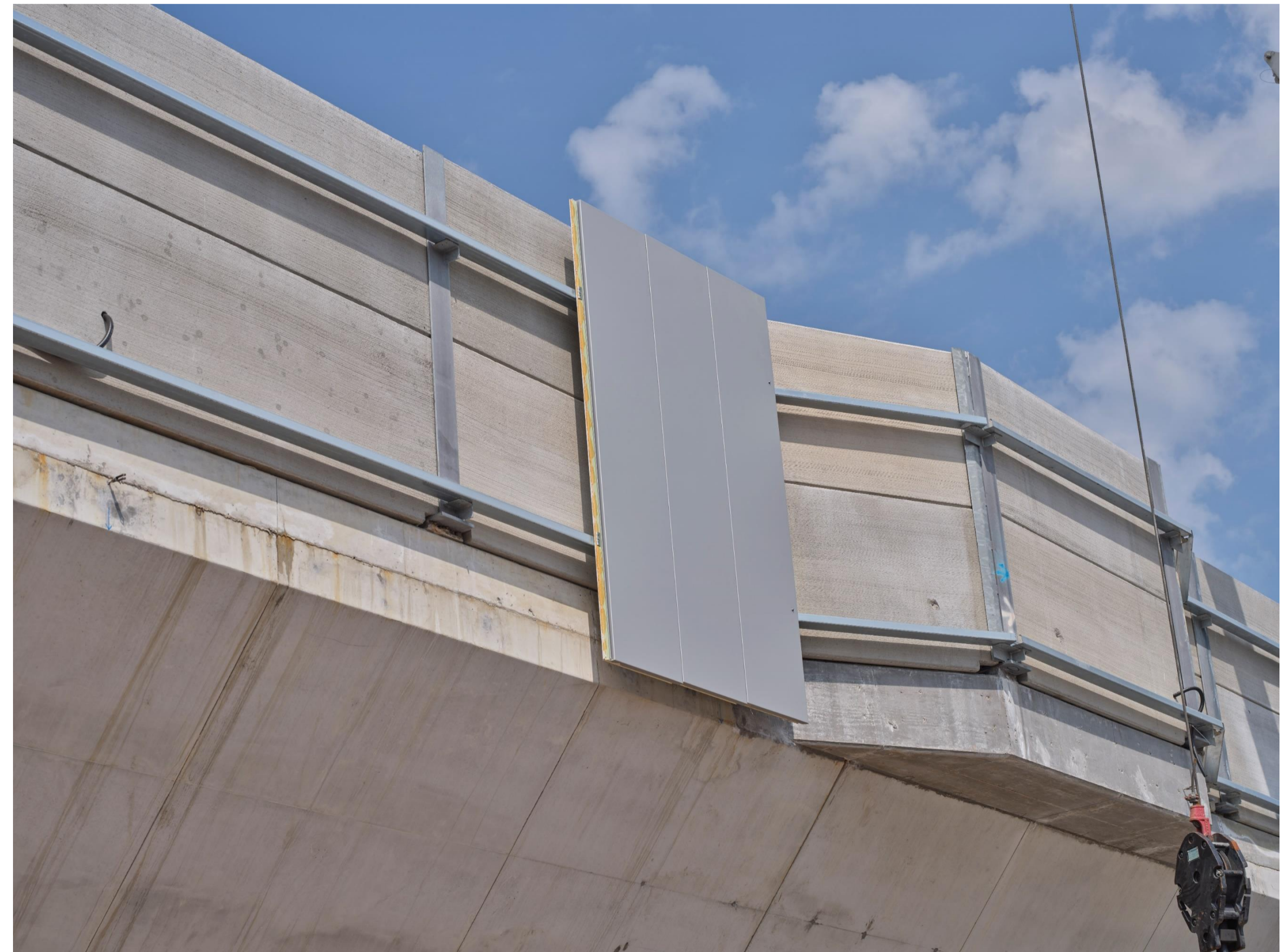
Cladding installation on the Elevated Guideway