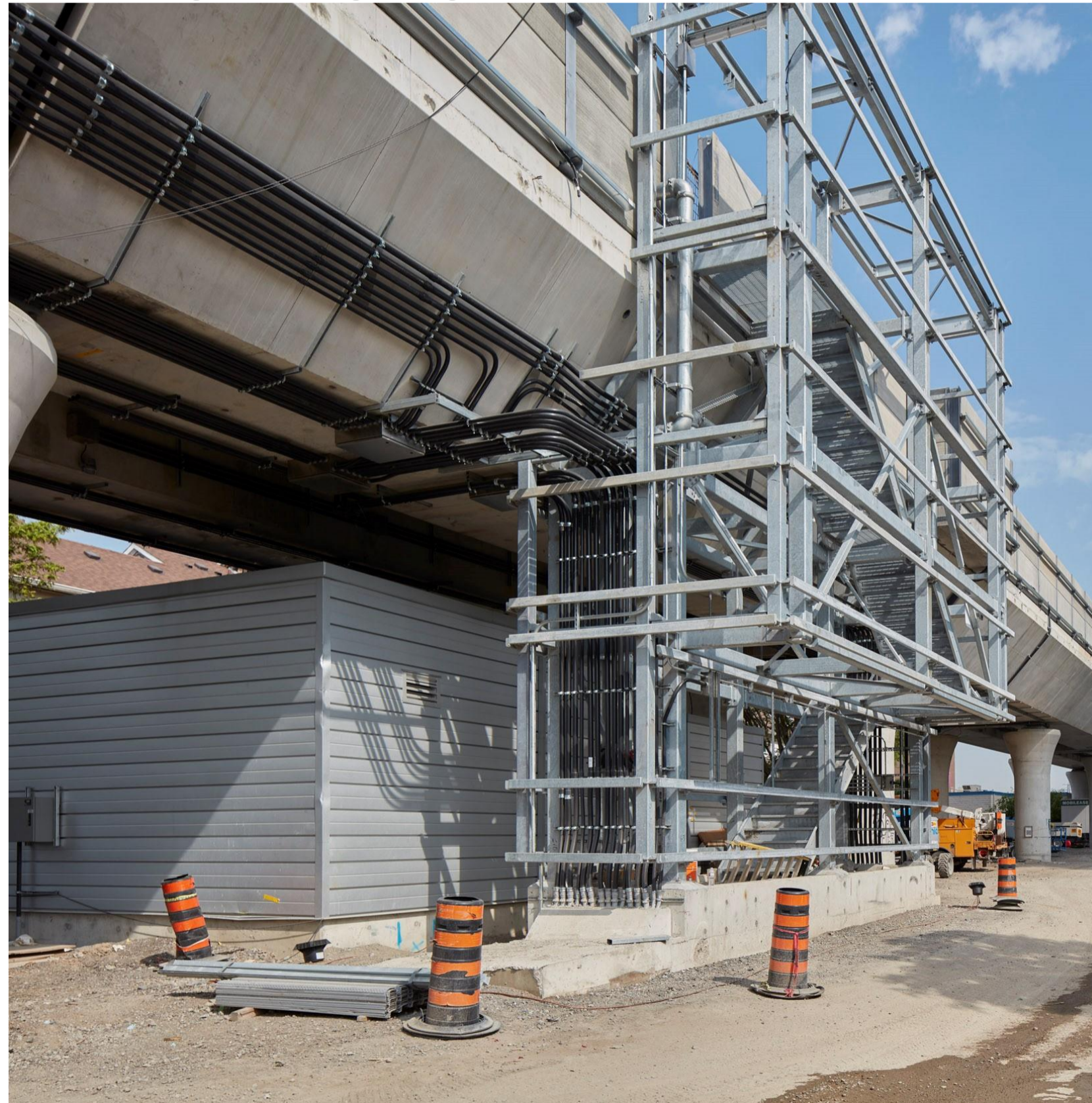
Electrical and Communications Rooms and Emergency Egress Stairway.

Work is ongoing in the Electrical and Communications Rooms in the Metrolinx rail corridor, adjacent to Antler Street. The structural work for the buildings is completed. The installation, testing and commissioning of the electrical and communications equipment inside the buildings is ongoing.