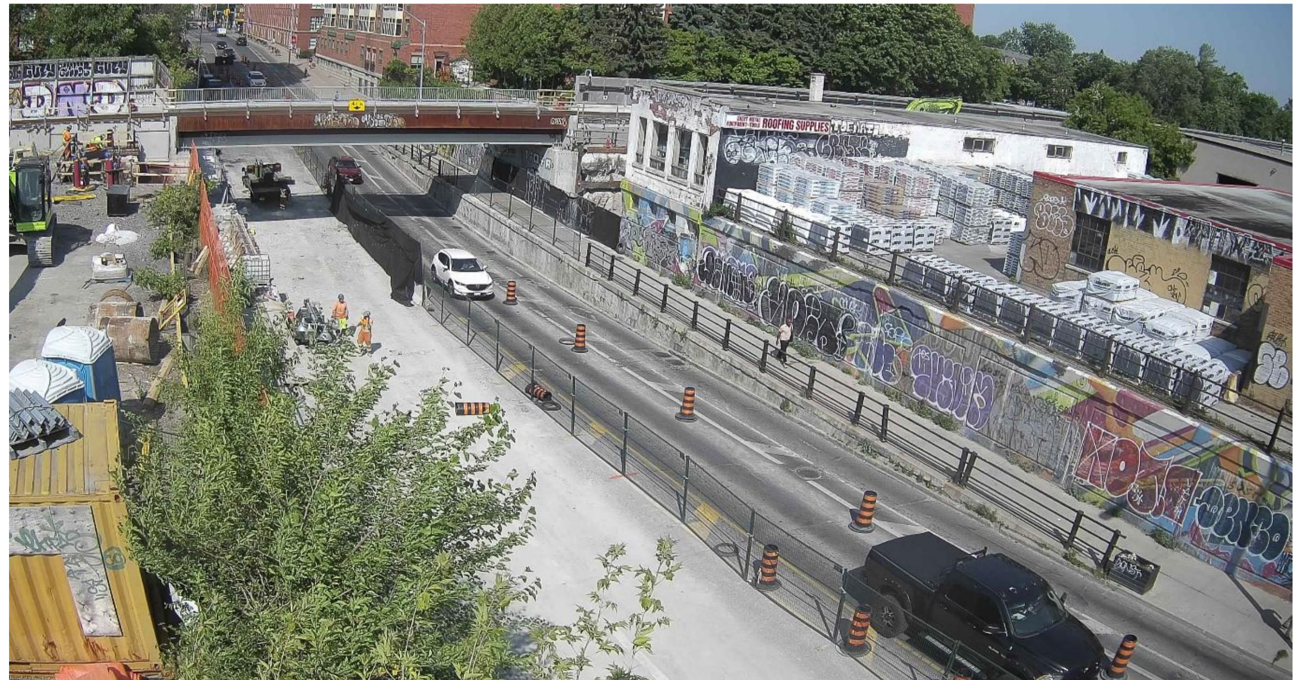
Bloor St Bridge and partial closures