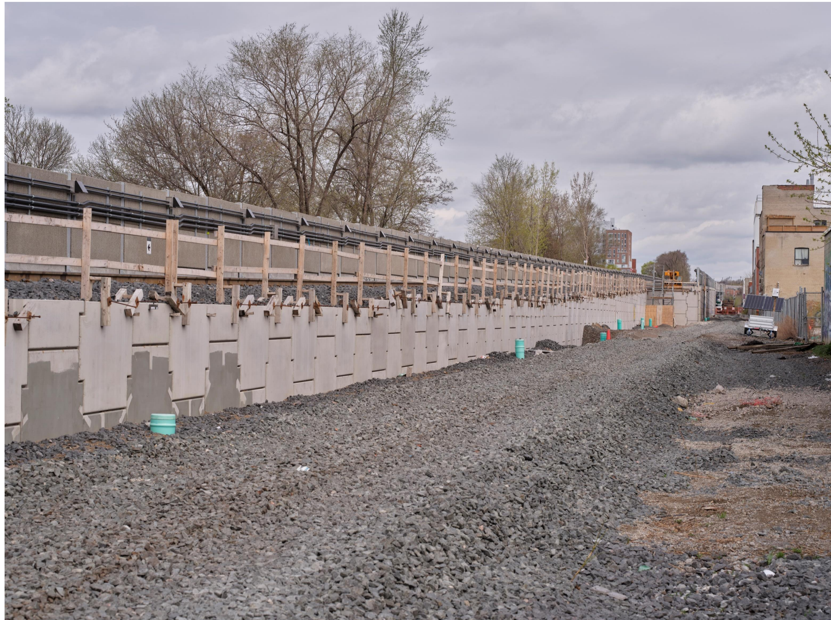
South MSE wall construction