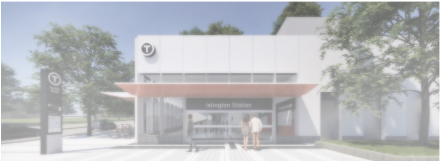
Conceptual rendering of Islington Station at Eglinton Avenue West

*Design is conceptual; all renderings are illustrative and subject to change