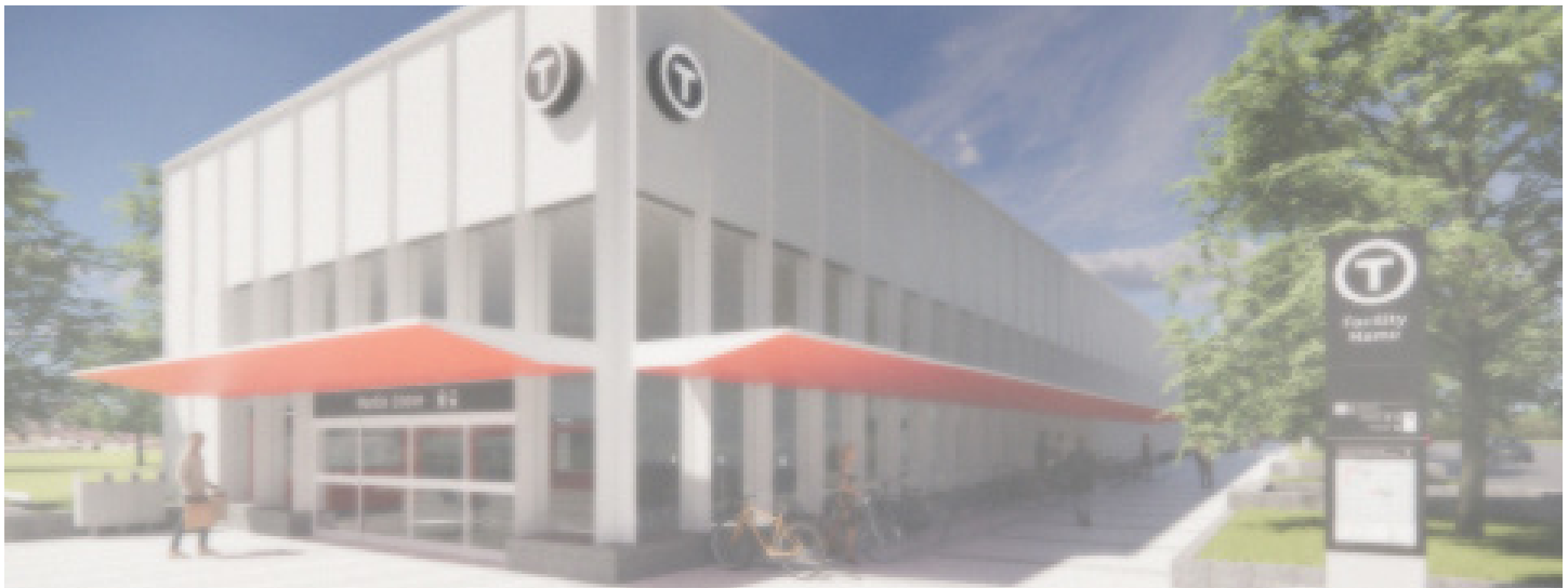
Conceptual rendering of Martin Grove-Eglinton Station main entrance

*Design is conceptual; all renderings are illustrative and subject to change