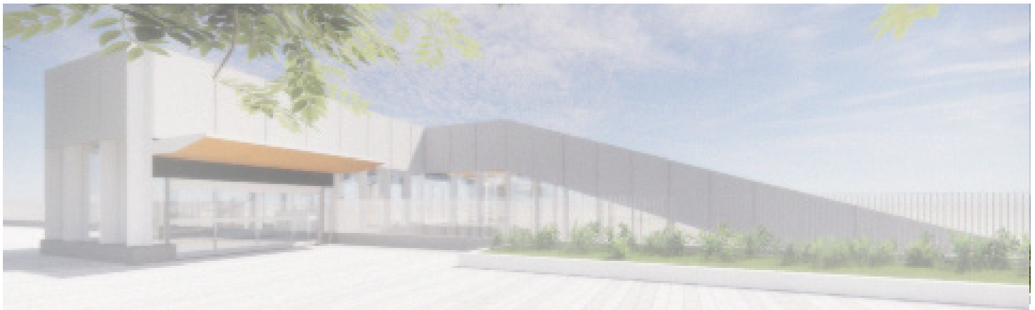
Conceptual rendering of Renforth-Eglinton Station entrance

*Design is conceptual; all renderings are illustrative and subject to change