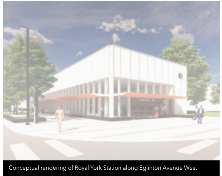
Conceptual rendering of Royal York Station along Eglinton Avenue West

*Design is conceptual; all renderings are illustrative and subject to change