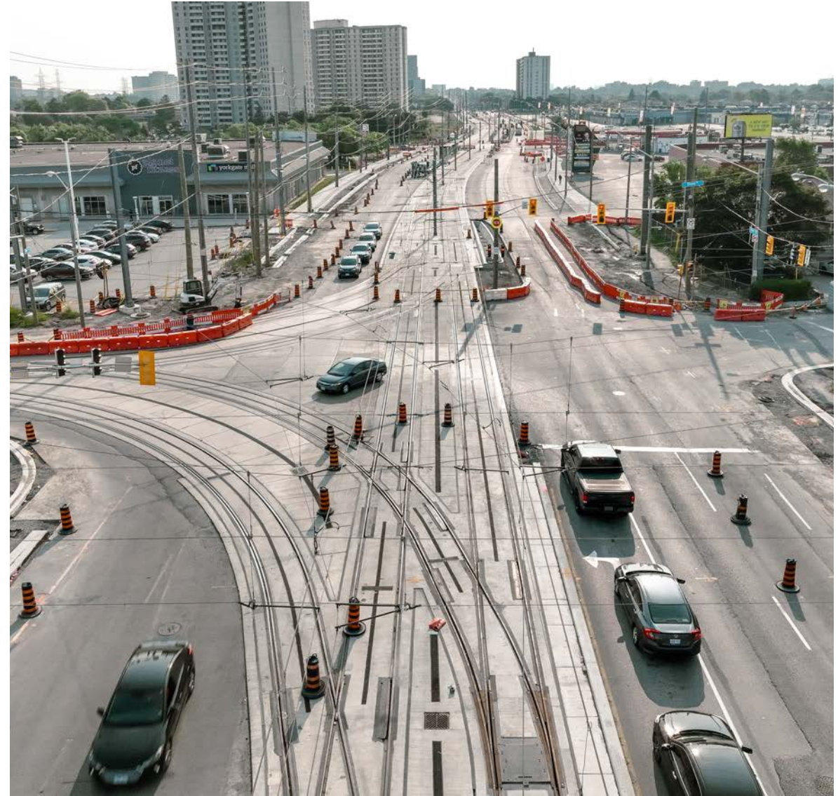
Photo: Aerial east view of Finch Avenue West and York Gate Boulevard. 2023.06.26