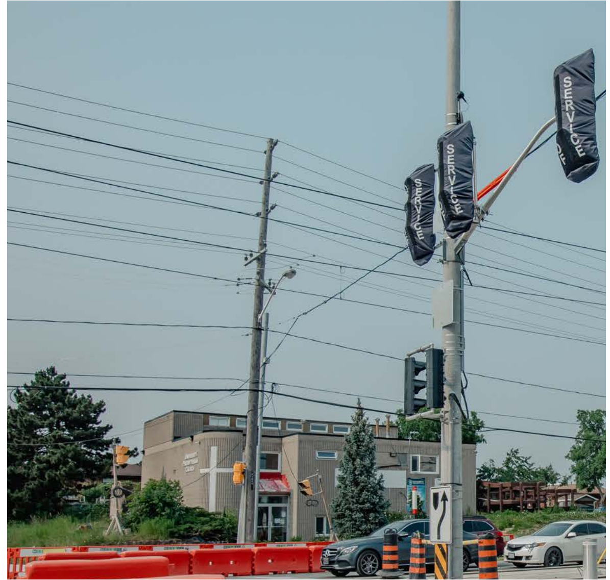
Photo: Permanent traffic signals at Driftwood Drive and Finch Avenue West, 2023.06.26