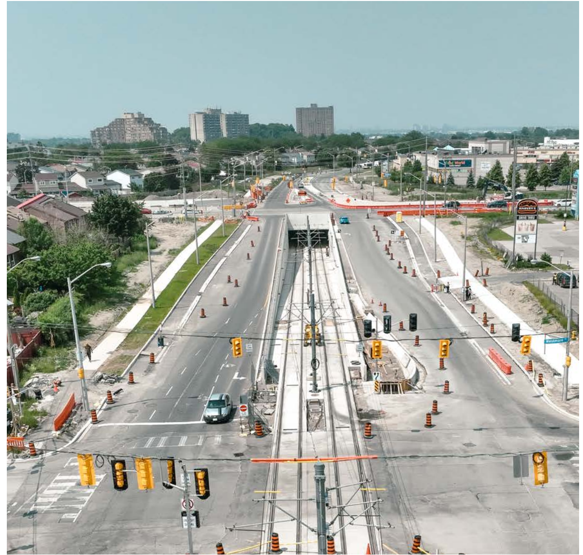
Photo: Aerial west view of Finch Avenue West and Westmore Drive. 2023.06.26