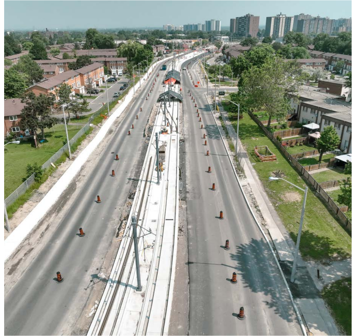
Photo: Aerial east view of Finch Avenue West and Martin Grove Road. 2023.06.26