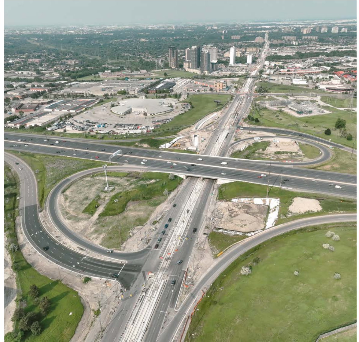
Photo: Aerial west view of Finch Avenue West and Highway 400. 2023.06.26