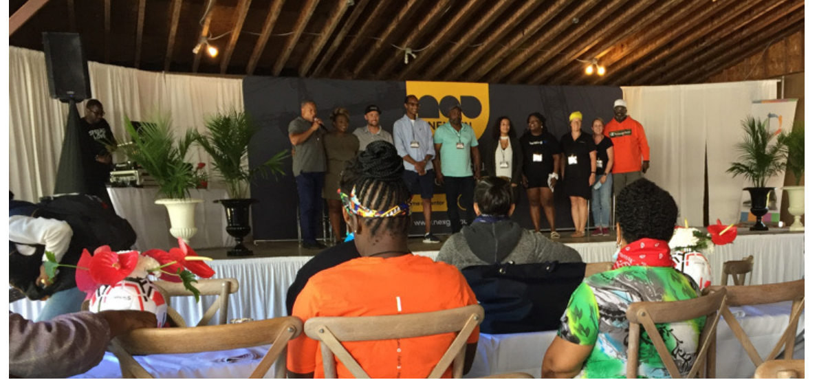
Photo: Speed Mentoring NextGen Builders 2022