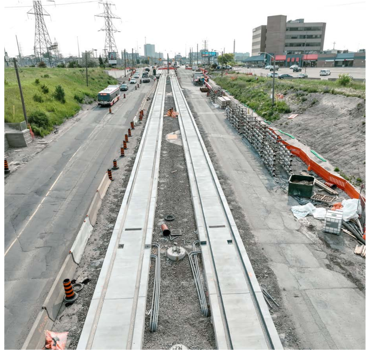
Photo: Aerial east view of Finch Avenue West and CP Bridge. 2023.06.26