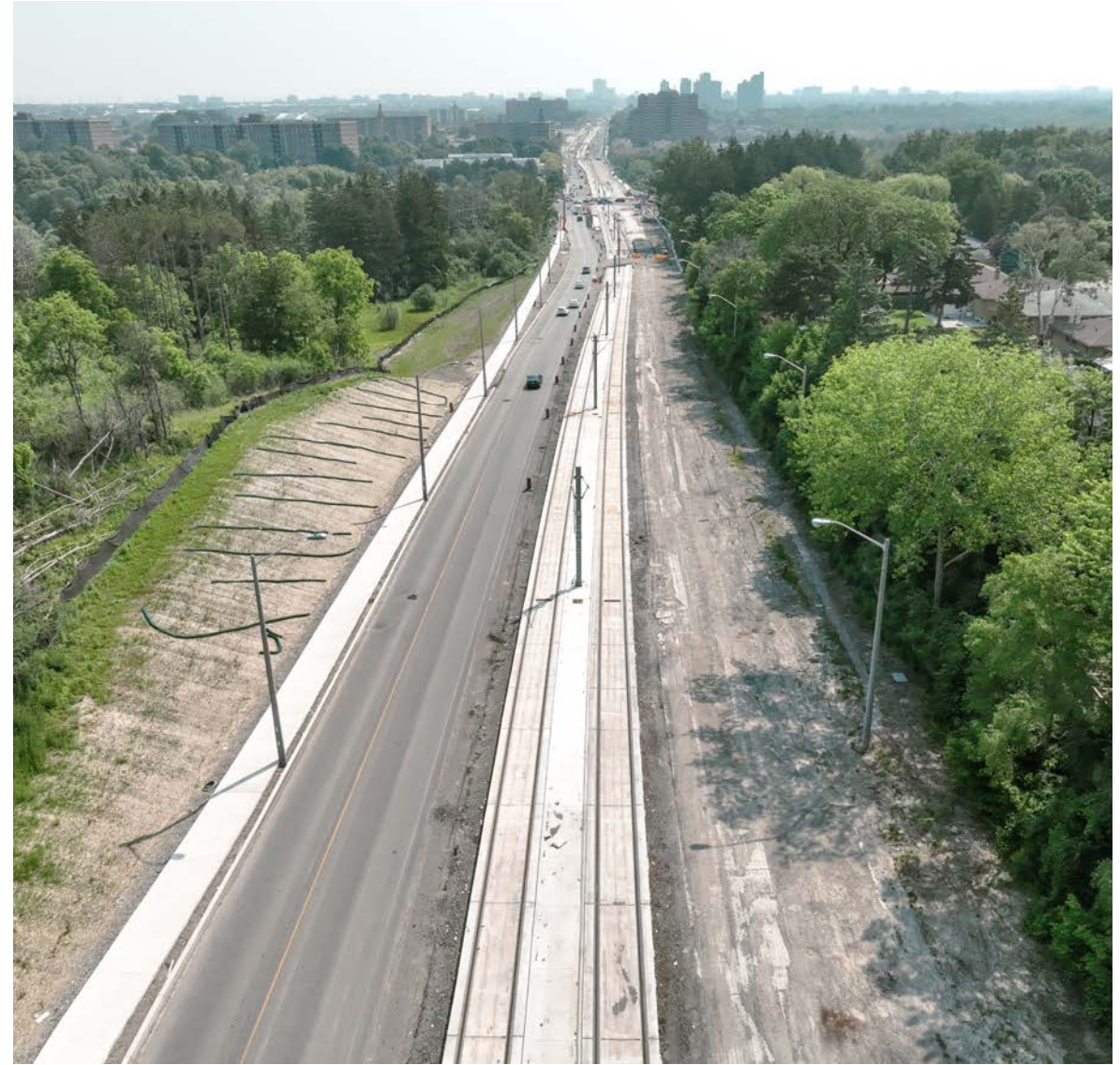
Photo: Aerial east view of Finch Avenue West and Kipling Avenue. 2023.06.26