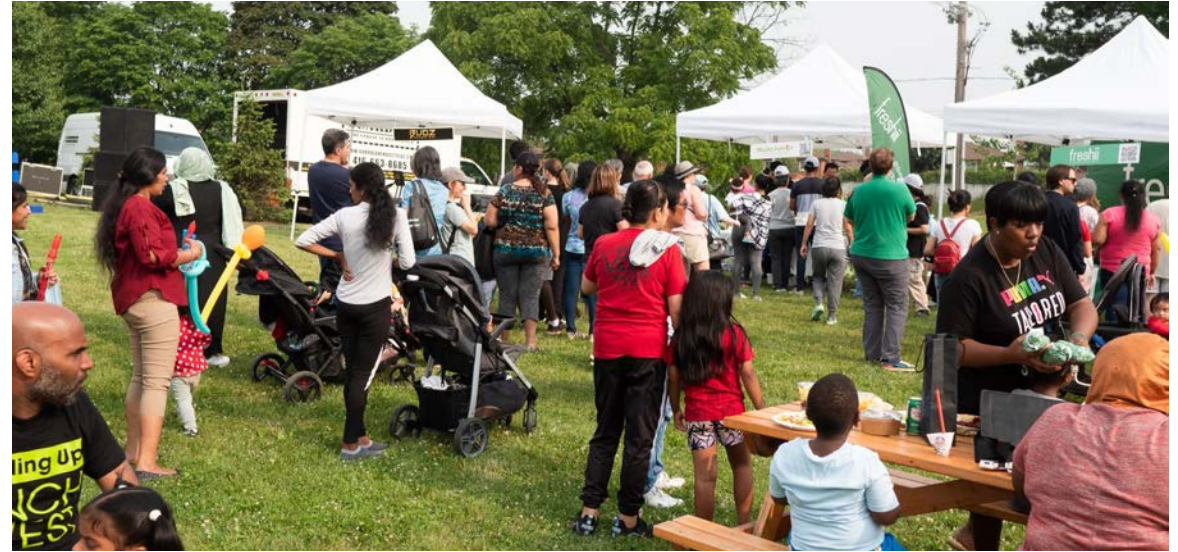
Photo: The community enjoys the day at DUKE Heights BIA 2023 DUKE Eats event at Fountainhead Park.