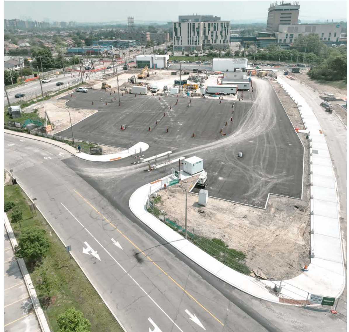
Photo: Humber College Station, Aerial east view. 2023.06.26