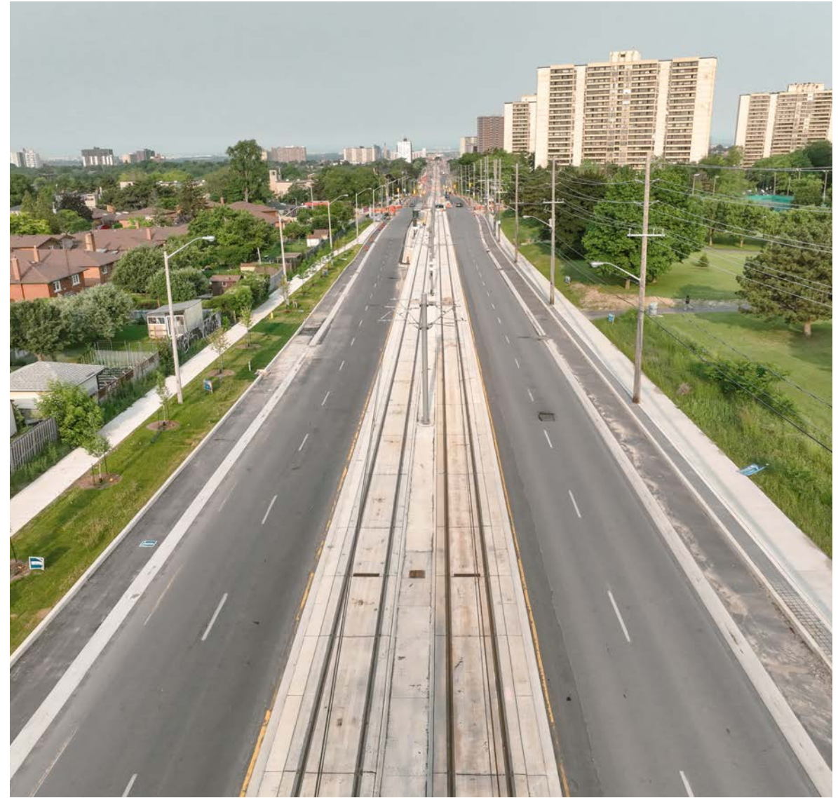
Photo: Romfield Drive and Finch Avenue West, 2023.06.26