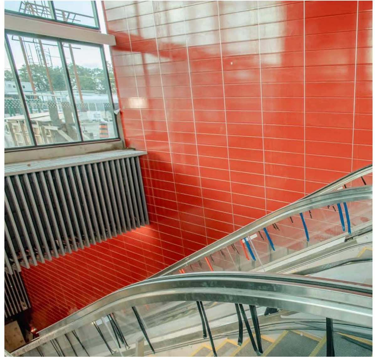
Photo: Finch West Station, 2023.06.26