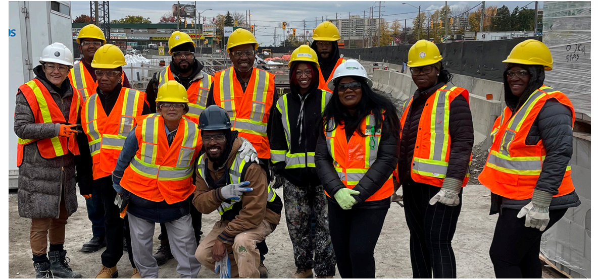
Photo: Pre-apprentice tour 2022