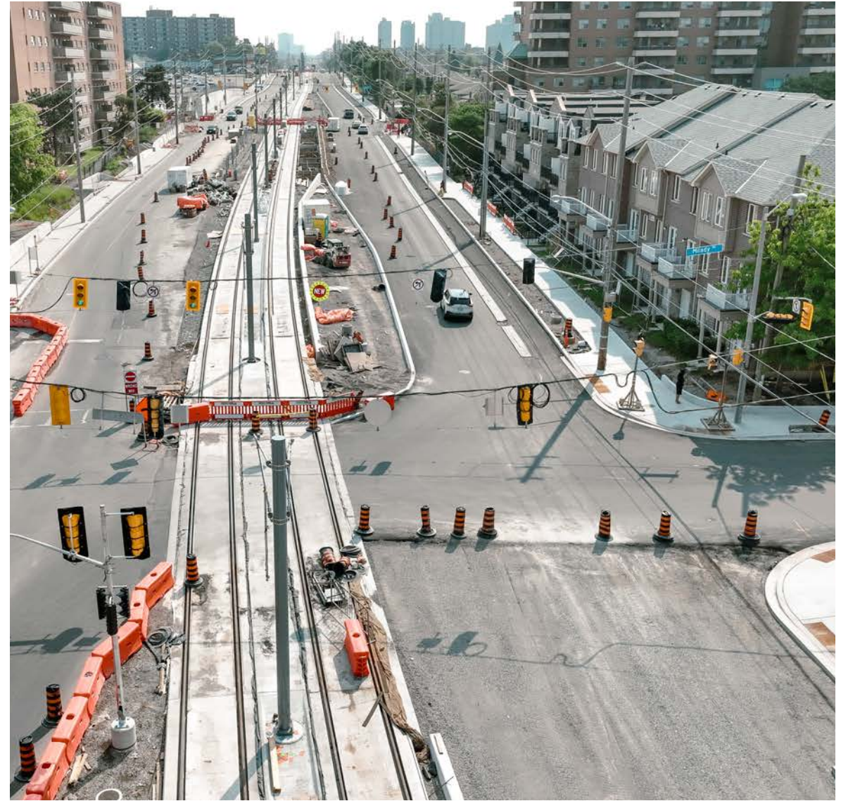
Photo: Aerial east view of Finch Avenue West and Milady Road. 2023.06.26