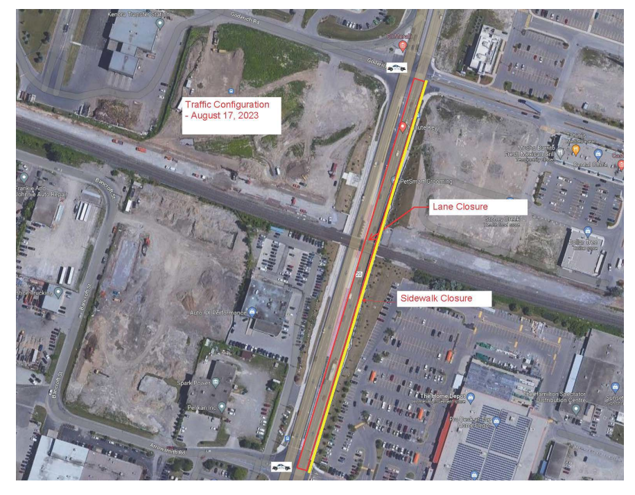
Photo Right: Traffic lane and sidewalk closures for Thursday, August 17, 2023

between Arrowsmith Road and Goderich Road.