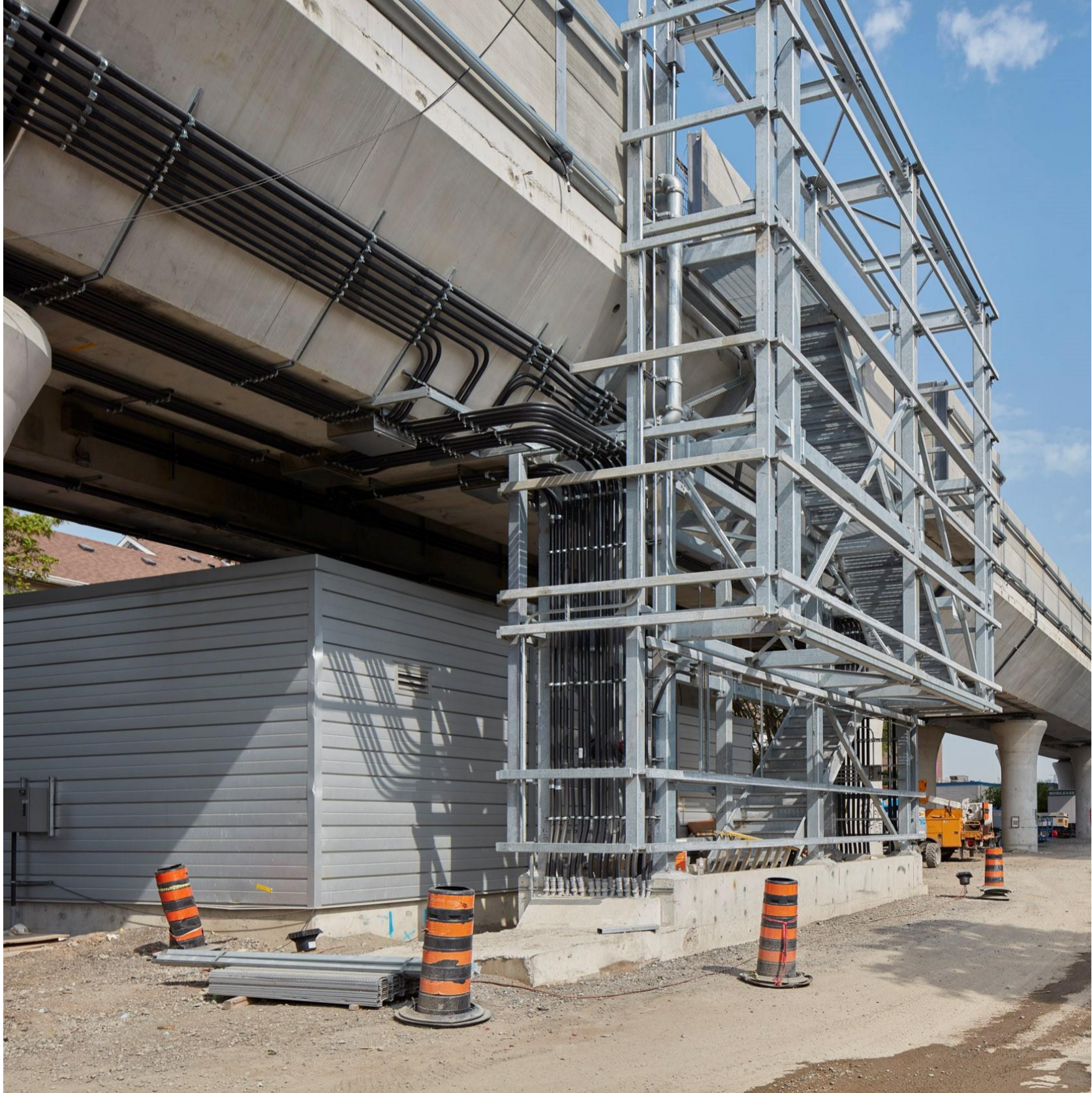
Electrical and Communications Rooms and Emergency Egress Stairway.

Work is ongoing in the Electrical and Communications Rooms in the Metrolinx rail corridor, adjacent to Antler Street. The structural work for the buildings is completed. The installation, testing and commissioning of the electrical and communications equipment inside the buildings is ongoing.