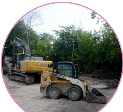
EXCAVATOR AND LOADER