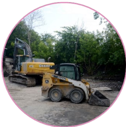
EXCAVATOR AND LOADER