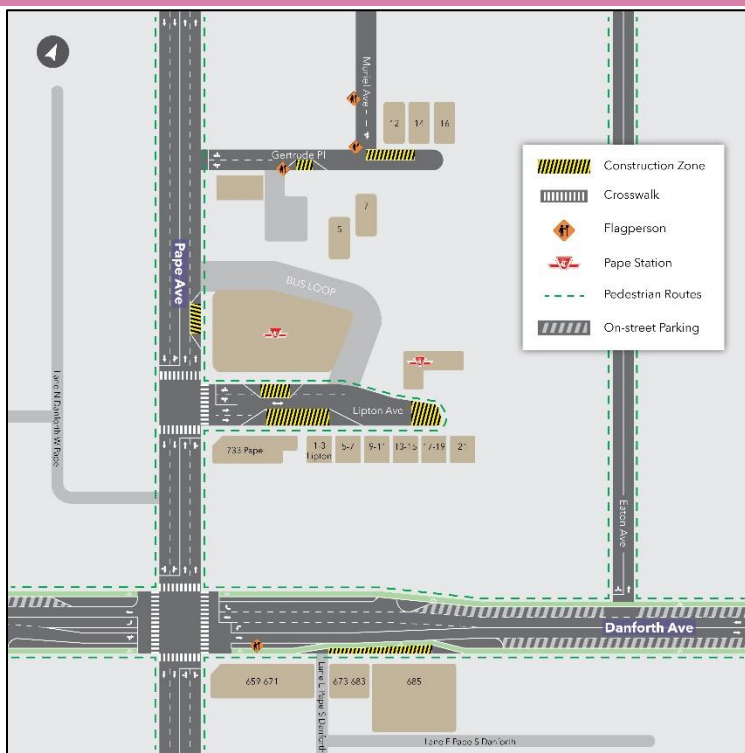
Pape and Danforth Ave.

Hours of work: Weekdays from 9:00 p.m. to 5:00 a.m.