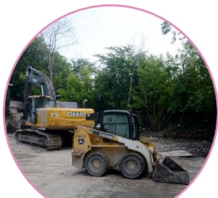
EXCAVATOR AND LOADER