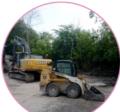
EXCAVATOR AND LOADER