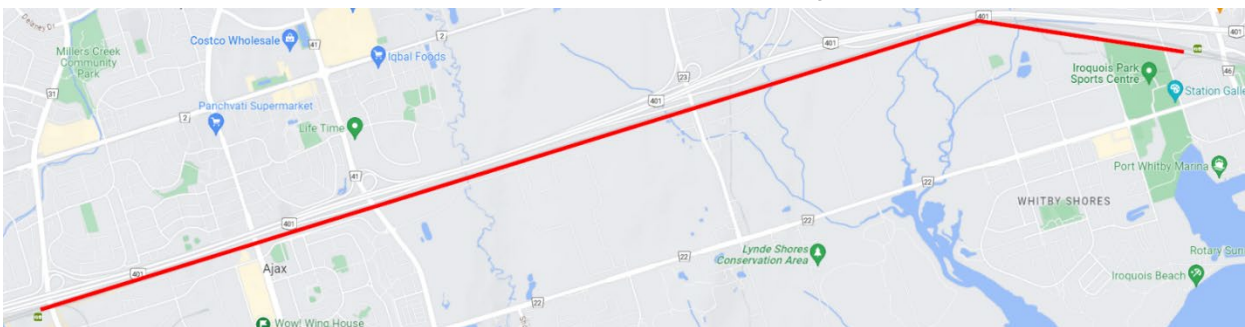
November 18-22, 2023 - Whitby GO Station to Ajax GO Station