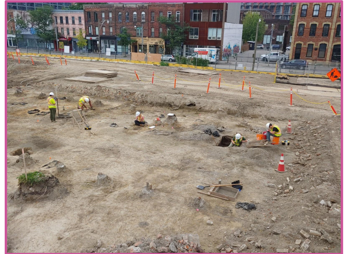
Overview Crew Documenting Features

Photos captured August 2023