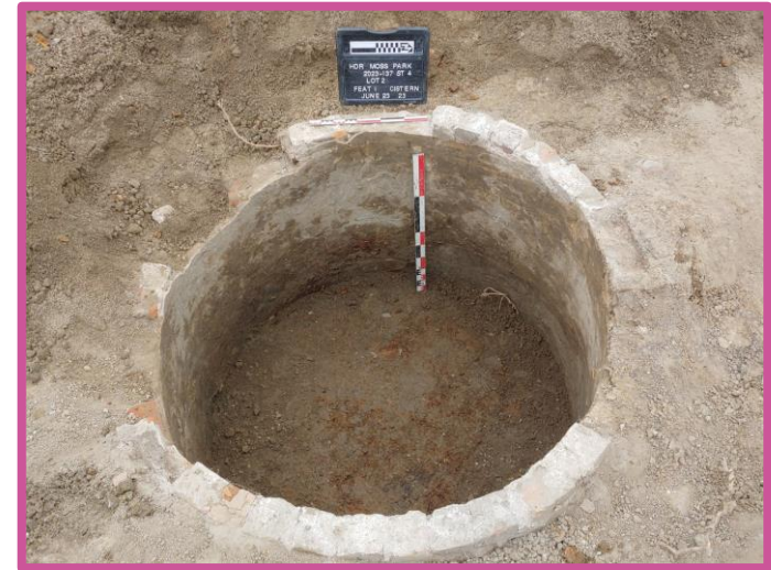
Brick Lined Cistern