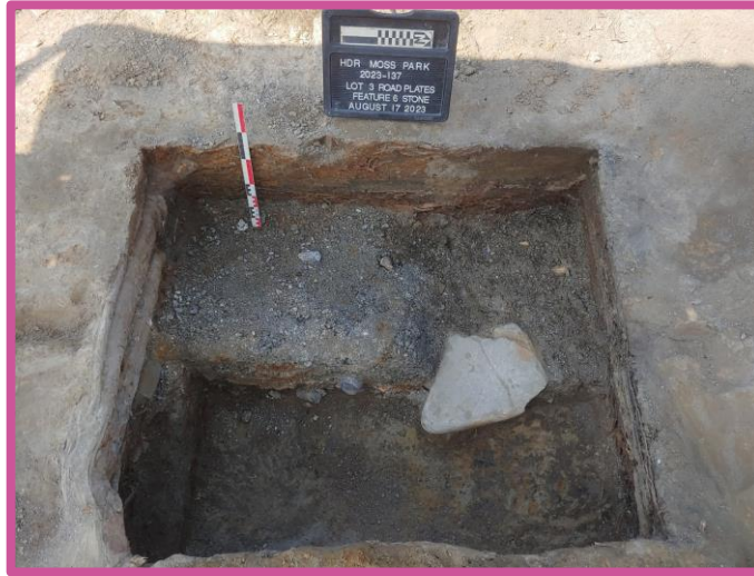
Wood Lined Privy