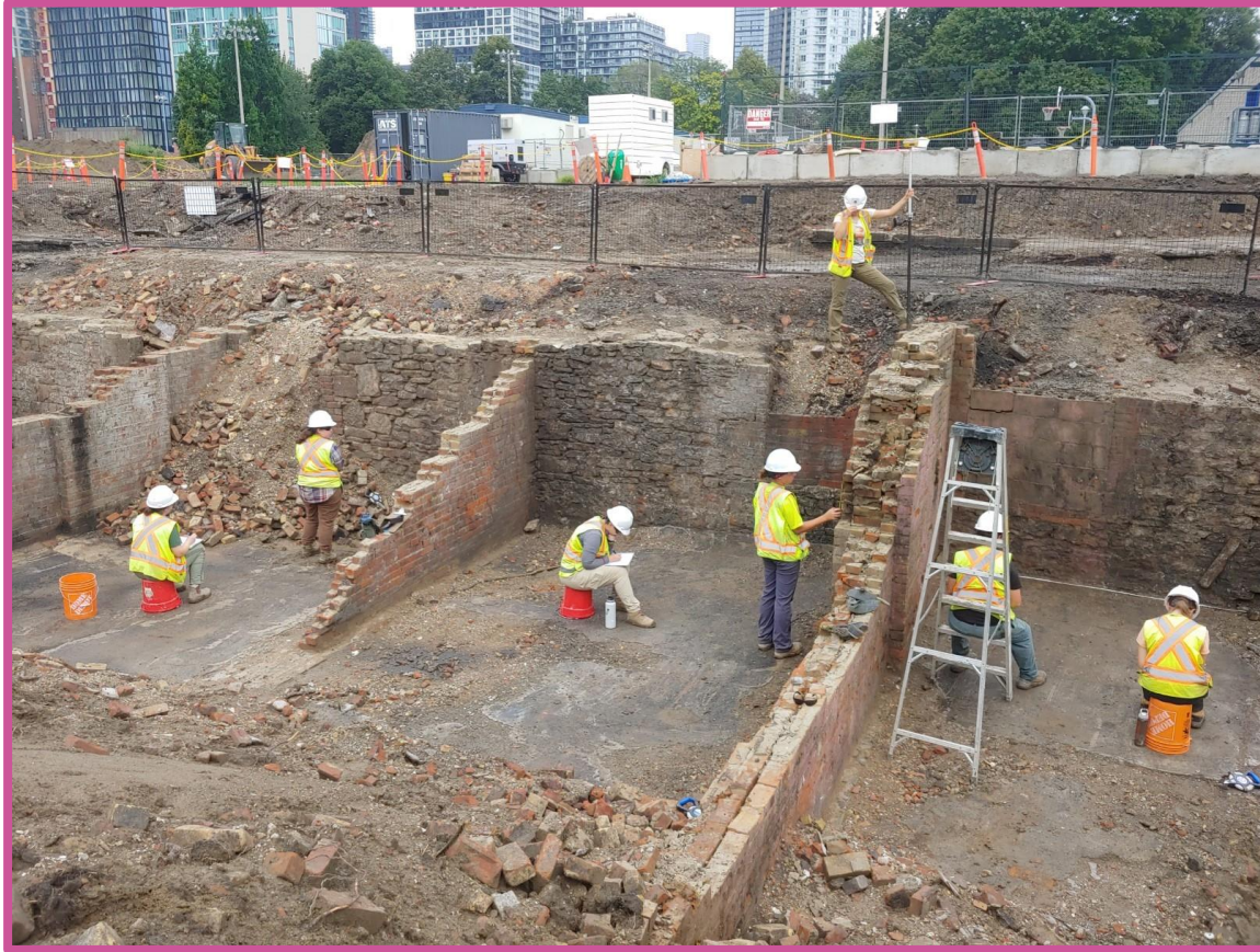
Crew at Work Drawing Basement Walls

Photos captured August 2023, Images courtesy of TMHC