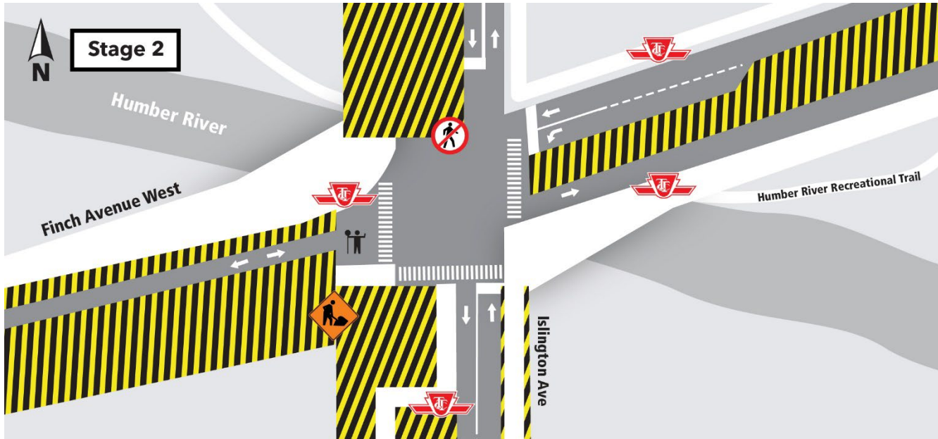
Map: Detailed stage 2

Noise and vibration will be monitored when required during these activities.