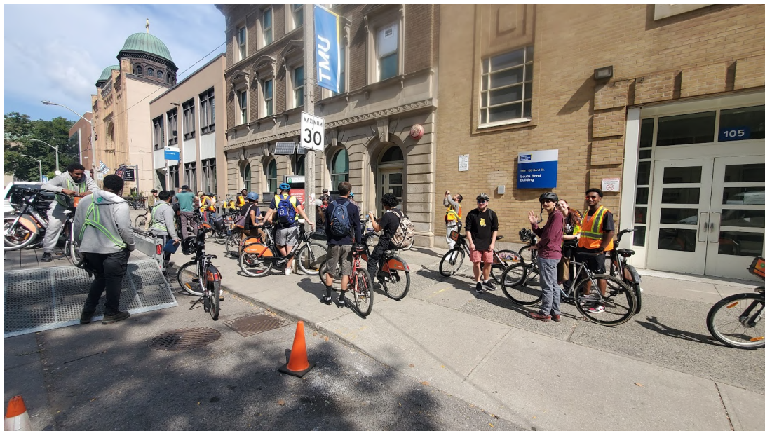
Preparing to depart the School of Urban and Regional Planning at TMU.

The Bike Tour is a free and fun event for Toronto Metropolitan University (TMU) planning students, alumni, and guests where we cycle to various sites and hear from guest speakers. These tours offer a wonderful opportunity for participants to see exciting projects, ask questions, network, and in some cases, cycle for the first time in Toronto (including using Bike Share Toronto bikes) and check out new places.