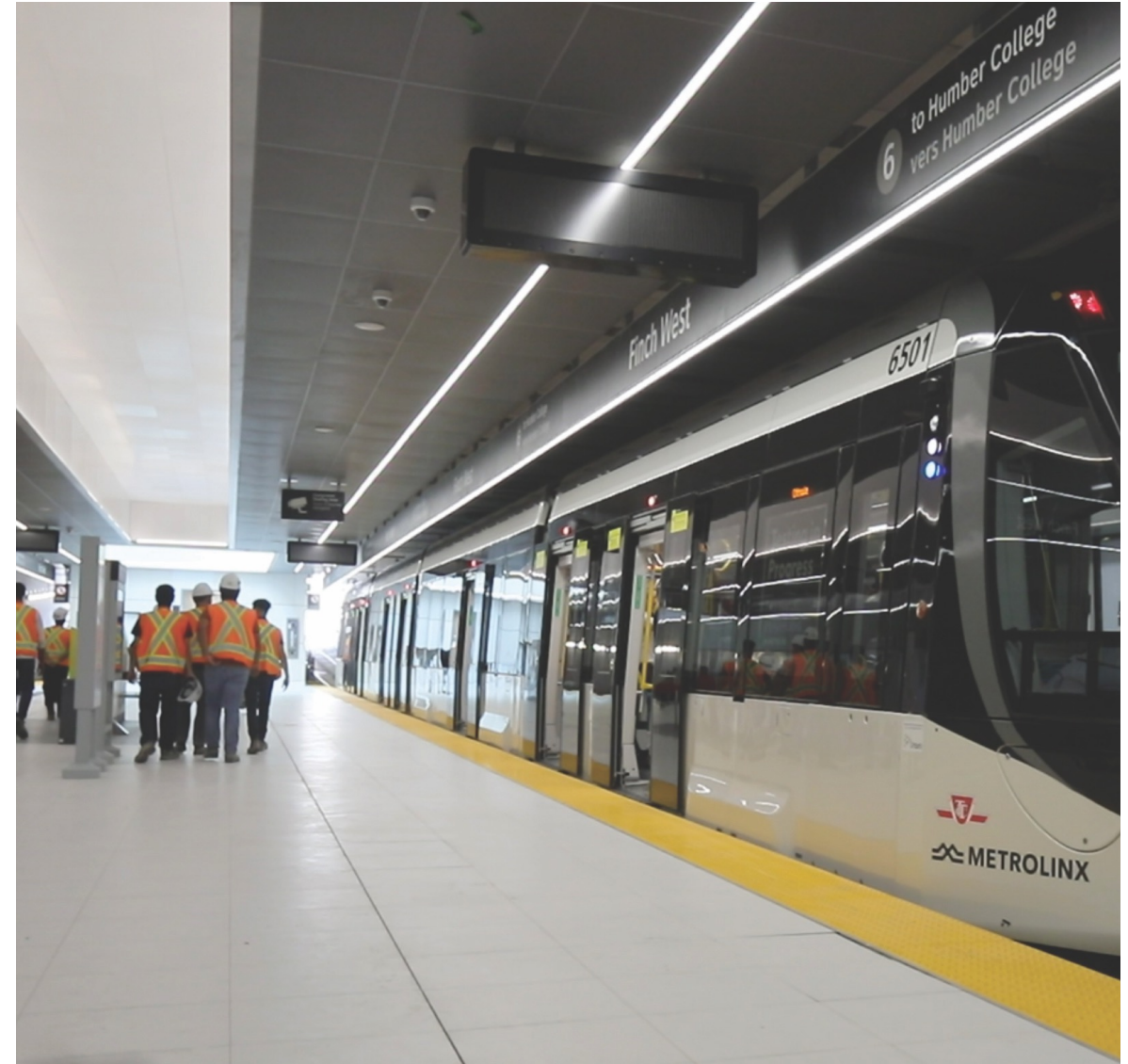
Photo: Finch West station platform. 2023.10.06