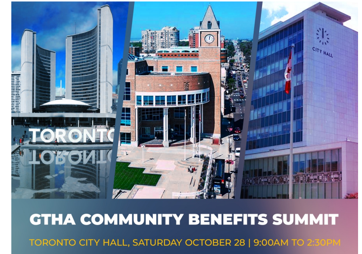
Photo: TCBN Community Benefits Summit Oct 28.