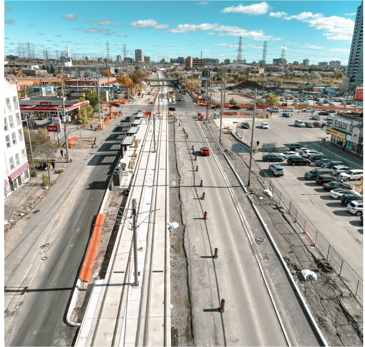
Photo: Finch Avenue West and Weston Road, Aerial east view. 2023.10.31