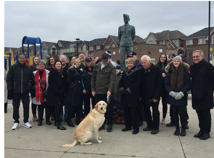
Photo: Emery Village BIA Remembrance Day 2023.