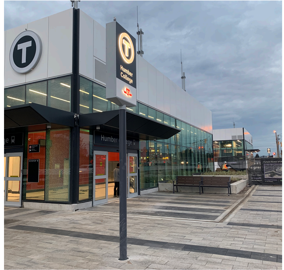
Photo: Humber College station, South building external view. 2023.10.27