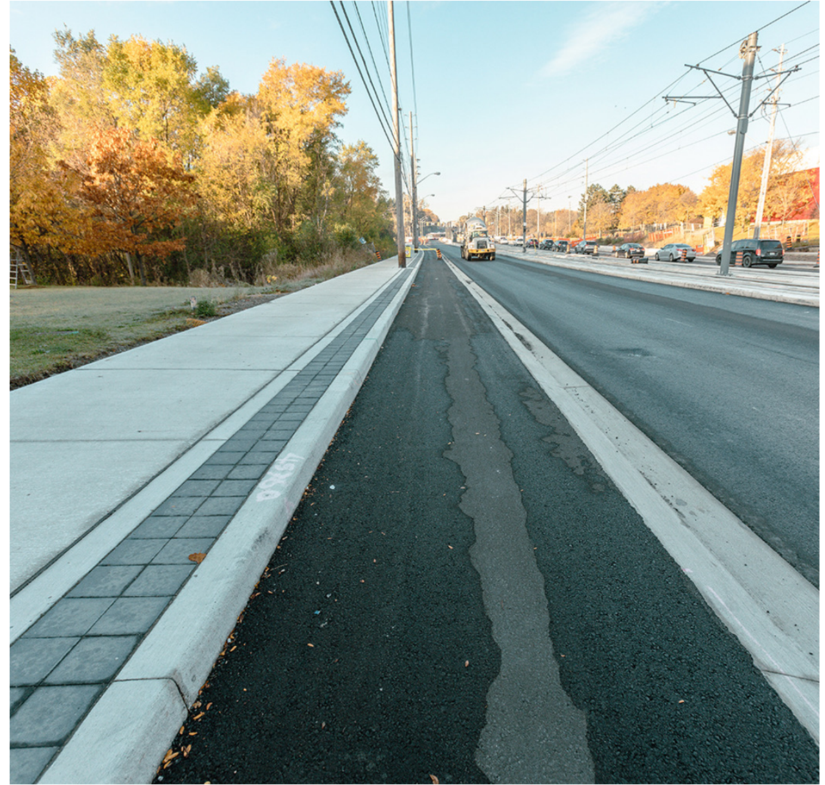
Photo: Finch Avenue West and Islington Avenue, east view. 2023.10.31