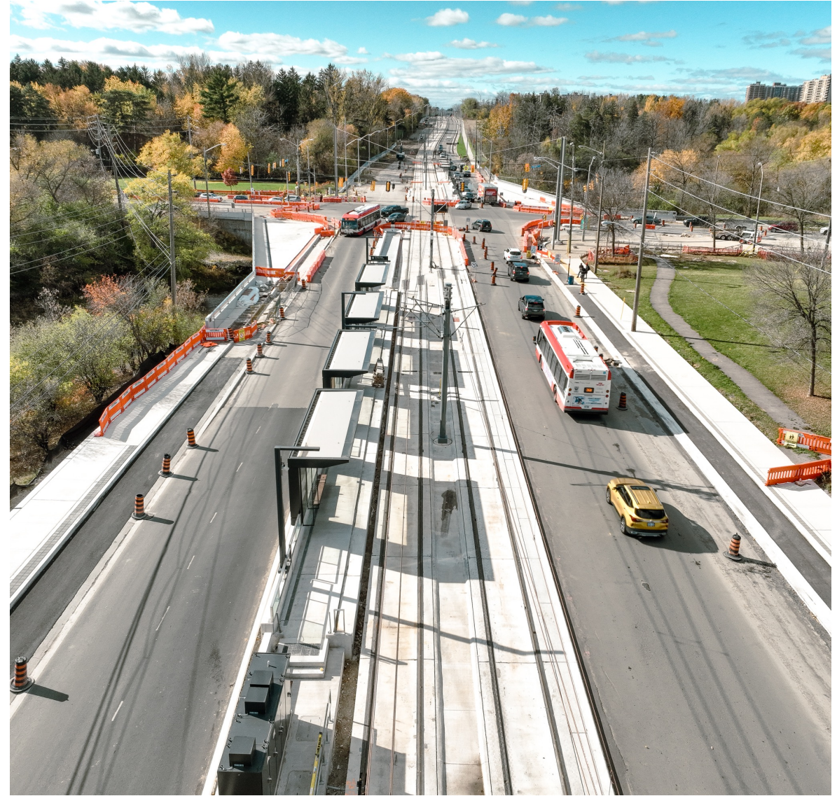
Photo: Finch Avenue West and Islington Avenue, Aerial west view. 2023.10.31