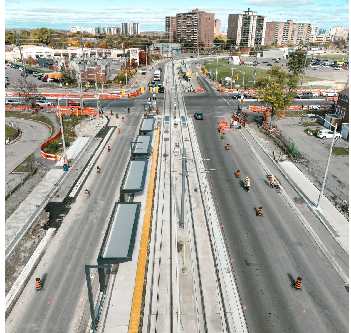
Photo: Finch Avenue West and Albion Road, Aerial east view. 2023.10.31