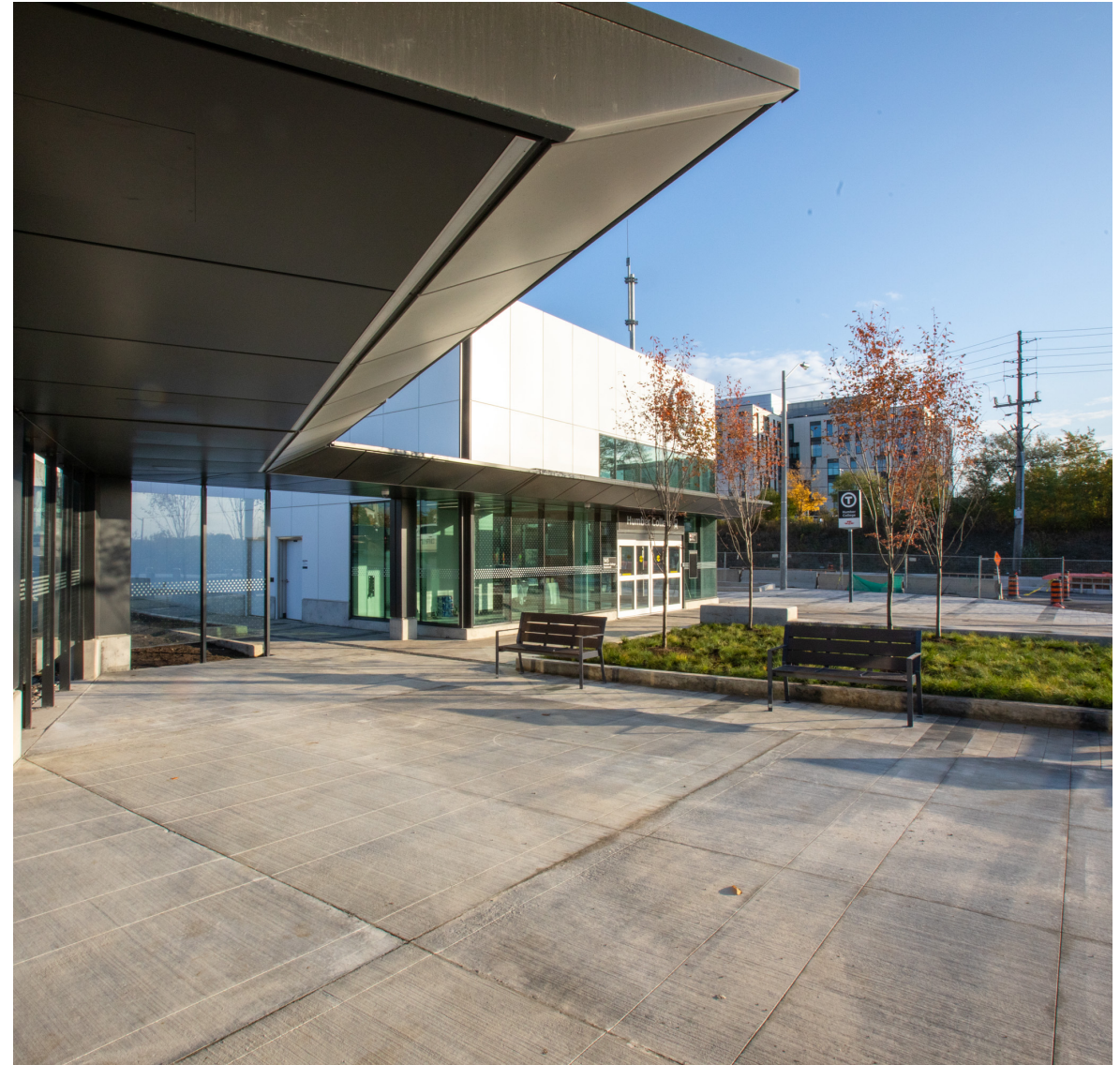
Photo: Humber College station south building and covered walkway. 2023.10.27