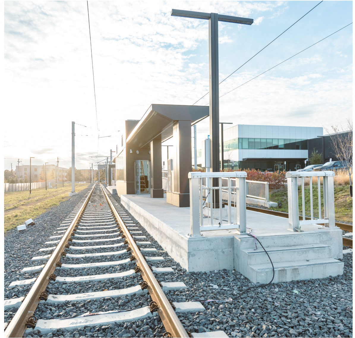
Photo: Maintenance and Storage Facility yard handover platform. 2023.10.31