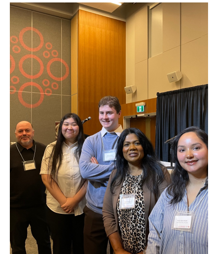
Photo: York University Employer Appreciation event.