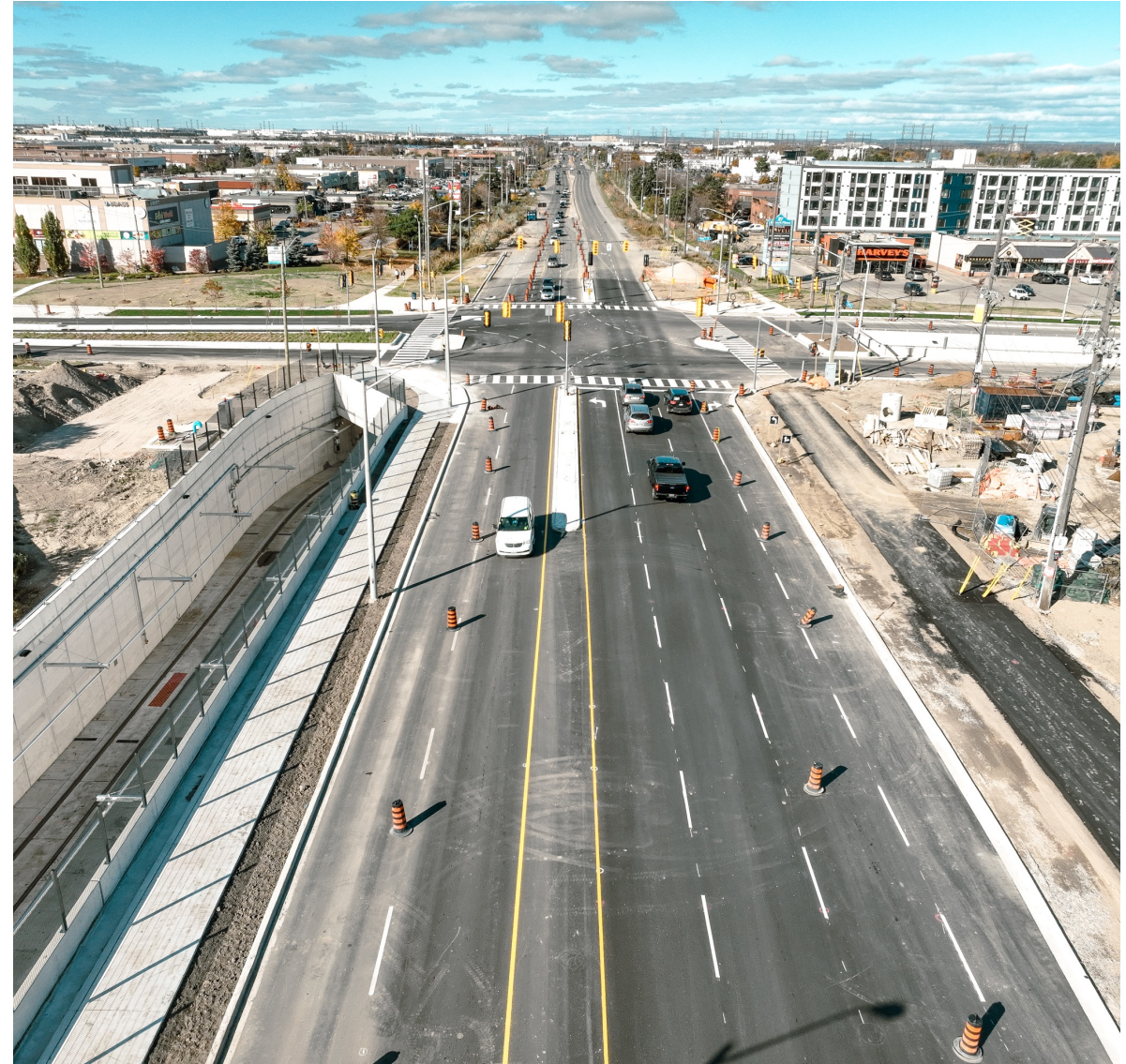
Photo: Finch Avenue West and Highway 27, Aerial southwest view. 2023.09.20