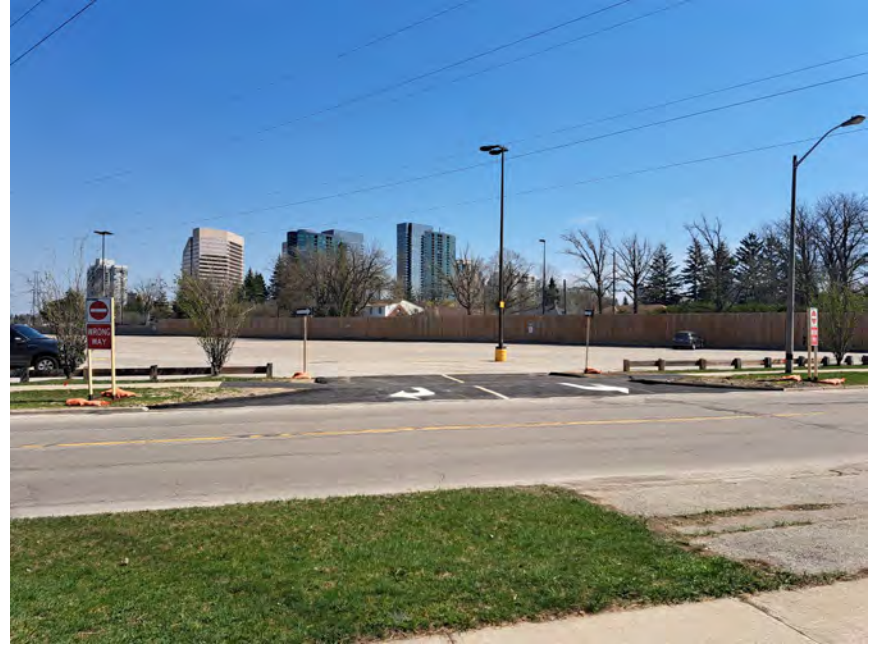
Completed Talbot Road Temporary Exit