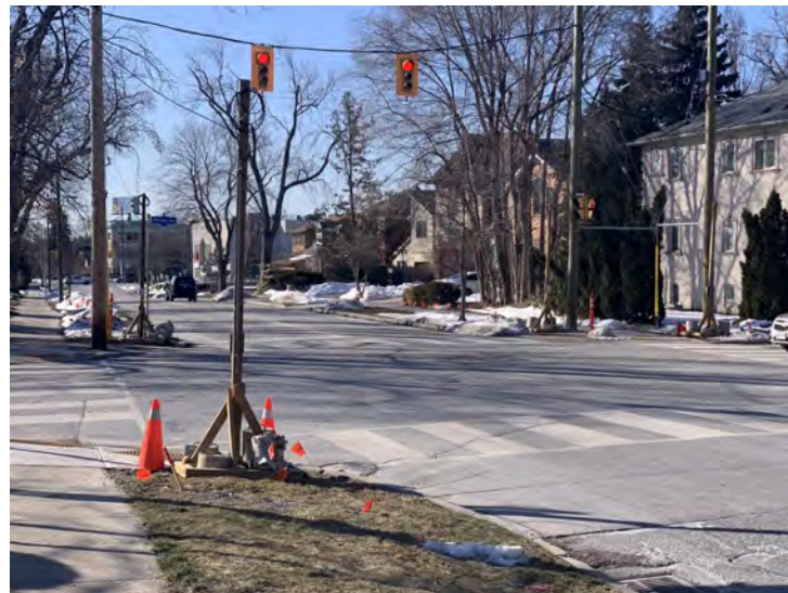
Signalization post-installation at Hendon and Talbot