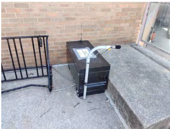
Recently installed noise and vibration monitoring equipment (21 Hendon)