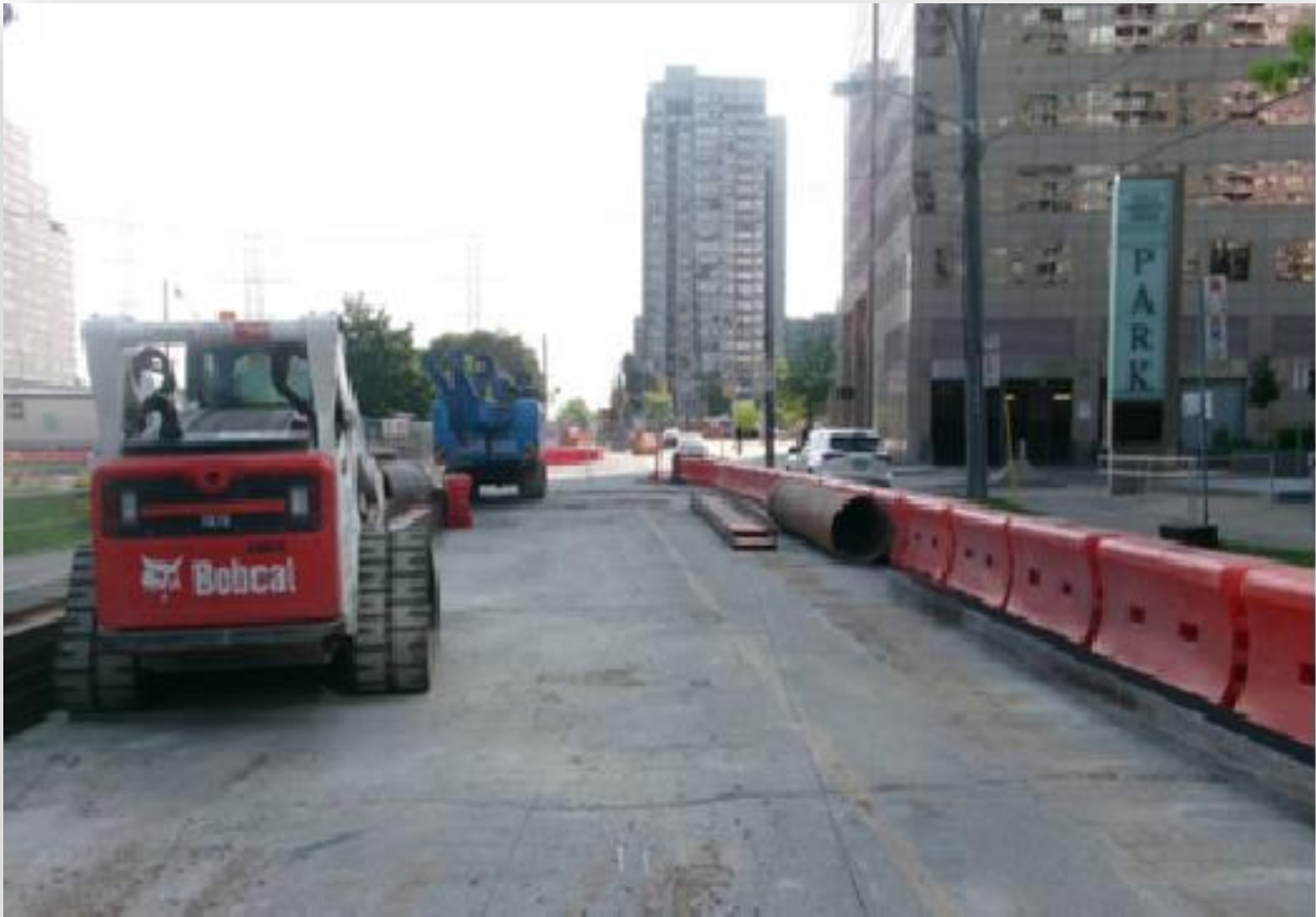
Construction activity in front of TPSS building