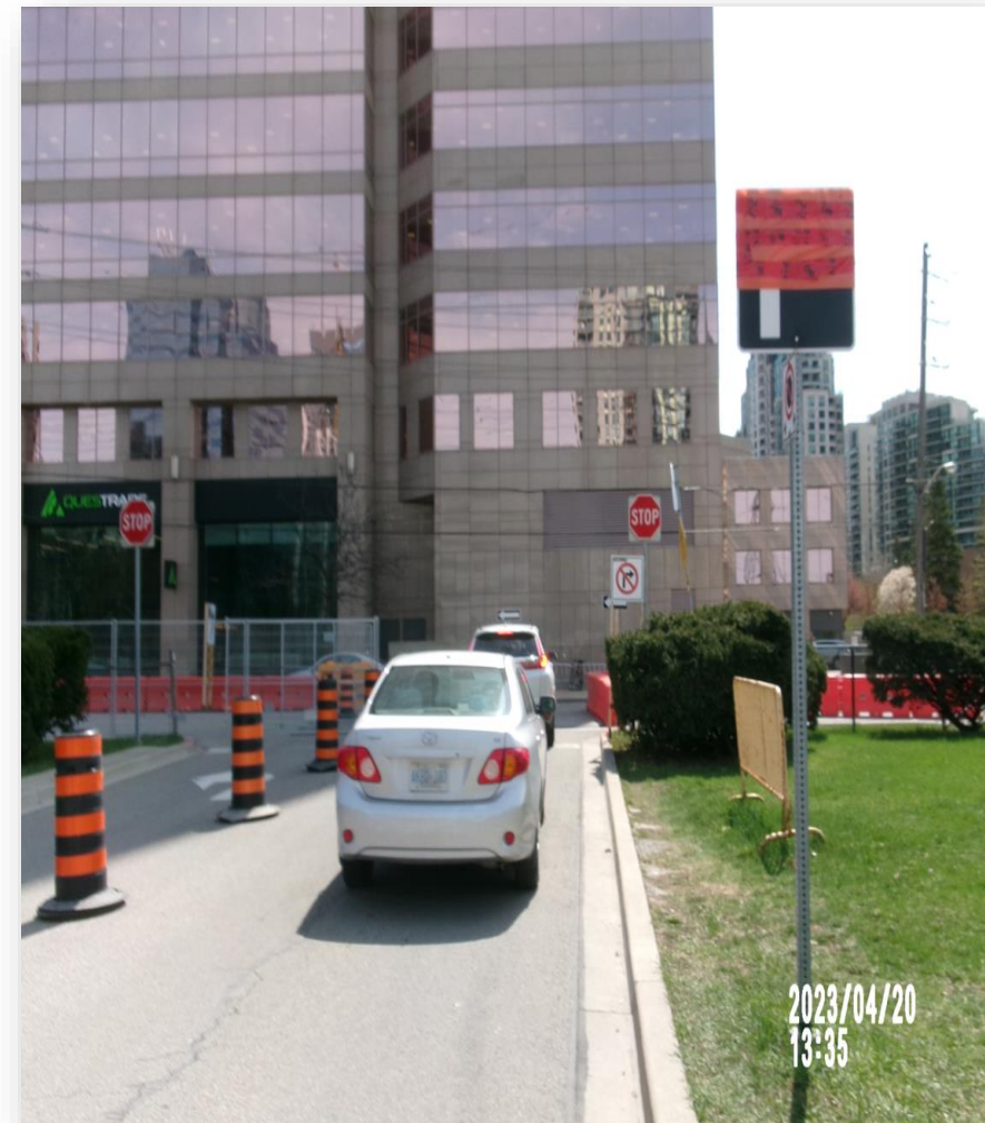
Improved driver behaviour after signage posted