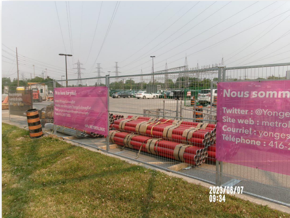
Signage and construction material at the Hendon Avenue laydown area