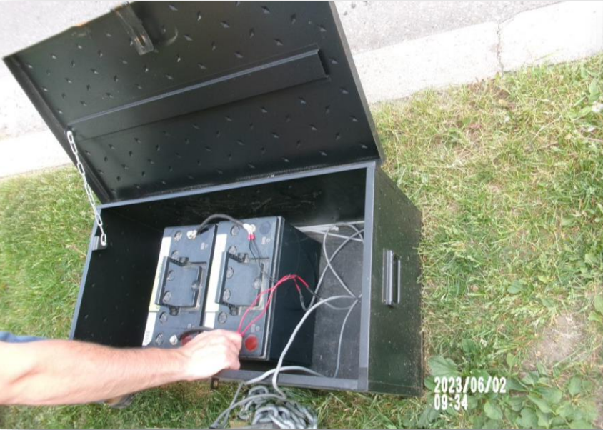
Noise and vibration monitor in front of TPSS