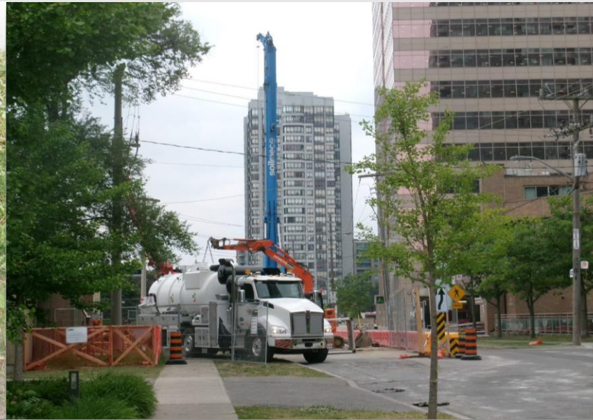
Excavation activities by earth line will allow drilling caisson to occur