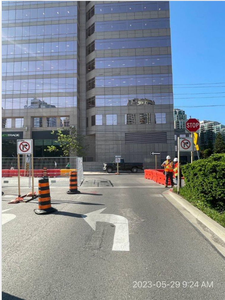
New road paint encouraging left turn only