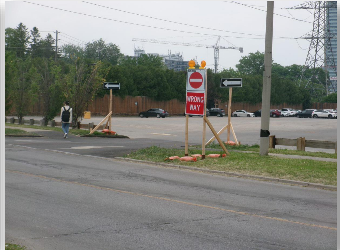
Talbot exit only sign from TTC parking