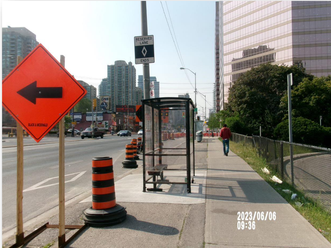
Relocated temporary bus stand at Yonge Street