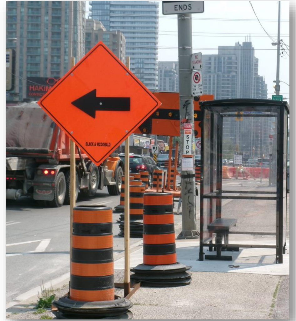
New temporary bus shelter location on Yonge