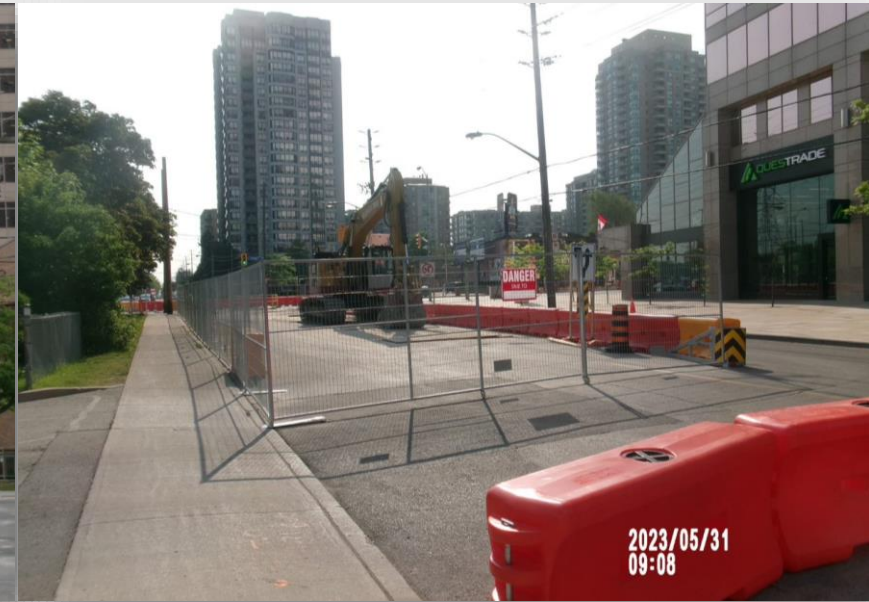
Fencing around the public walkway